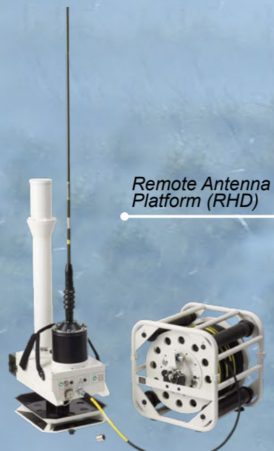
Remote Antenna Platform (RHD)

Keeping you agile and adaptable in the changing face of electronic warfare and global engagement