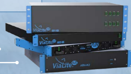
Optical Routing (RCD)

The solution is scalable after installation, offering flexibility in the RF Conditioning and Distribution (RCD) of a MORA communications system.