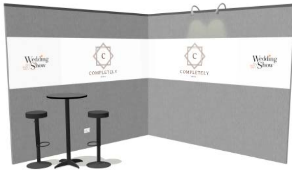
Standard package 3 x 3m scheme illustration