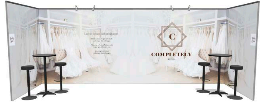
Double package upgrade 6m x 3m scheme illustration