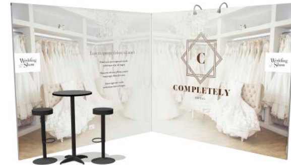
Standard package upgrade 3m x 3m scheme illustration