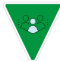
POST COMMUNITY NEWS

Pictured on the left are just a sample of the resources available to you through AEV Membership and the Member Zone. With an ever-changing industry, keep up to date with health and safety laws, sustainability in your venue, AGM reports as well as studies such as the Salary Survey, and SASiE.