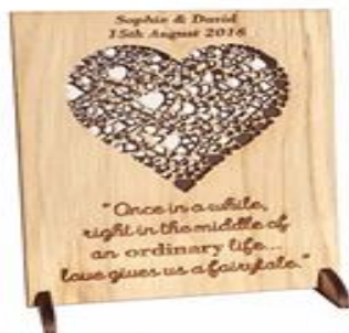
Love plaque - perfect for vale... £9.95