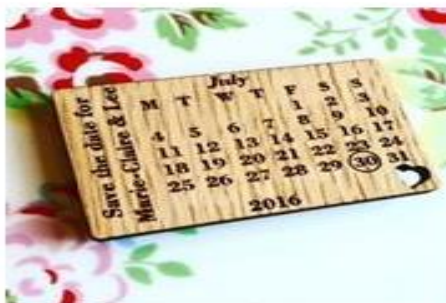
Wooden Save The Date Cale... £2.99