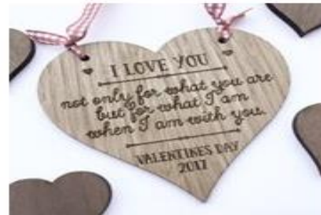
Valentines Heart Keepsake £7.95