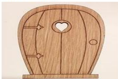
Heart Fairy Door (Available a... £2.99