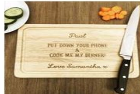
Personalised Chopping Boar... £18.99