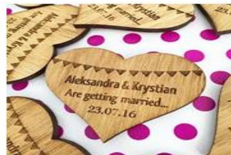
Save The Date Wooden Hearts £2.99