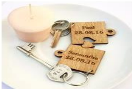
Jigsaw Puzzle Keyrings - Per... £5.95