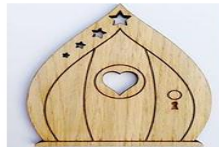
Pointed Heart Fairy Door (Av... £2.99