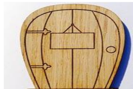
Wooden Blank Sign Fairy Do... £2.99