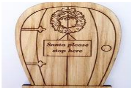
Wooden Santa Fairy Door (A... £2.99