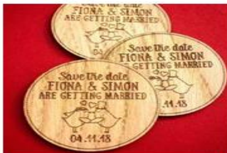
Save The Date Magnets - Ro... £2.99