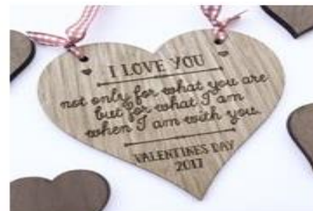
Valentines Heart Keepsake £7.95