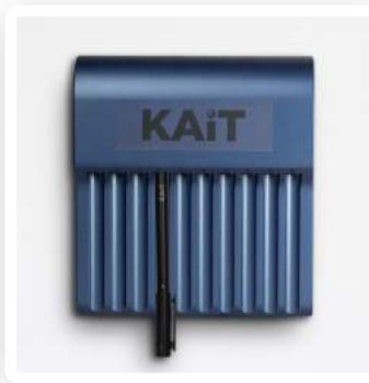
Pen connects to dock to upload work to the KAIT class website