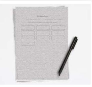
Teacher prints an assessment and dot pattern on plain paper