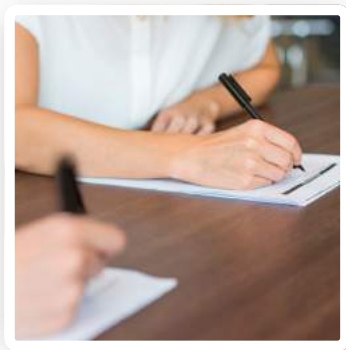
Student takes an assessment in class with the KAIT Pen