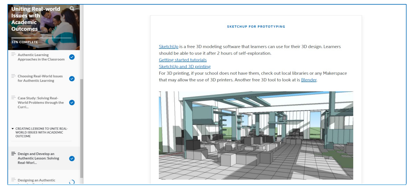
Figure 1. Educators are introduced to software like SketchUp, which can be used in the classroom to produce 3D models that can help students visualize how their prototypes can work in the real world.