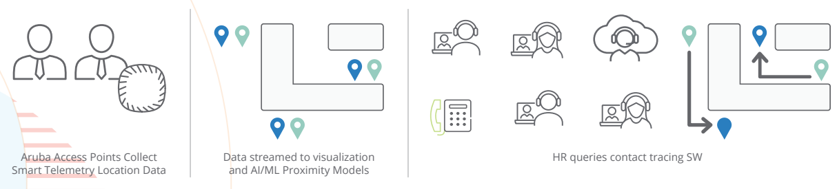
Figure 2: Aruba AlOps Uses Smart Telemetry and Al Modeling to Power Location Solutions

Many wireless vendors will supply a large amount of raw data—which is table stakes, but then it is left up to you to interpret how to use this data for student, staff, and faculty health and safety solutions. How do you distinguish between contacts that are separated by walls from true personal interactions? Given that we all use multiple devices, how do you build a comprehensive contact profile that correlates devices to users? Will the data provide a proximity "risk score" to prioritize action? Aruba offers location solutions that start with precision location data post-processed by Al-based Machine Learning and are visualized by graphically rich applications to solve these challenges. You are provided with accurate contact and location information without the guesswork. This relieves HR from the overhead and delays associated with correlating data and manual analysis, so they can focus on protecting school and university populations.