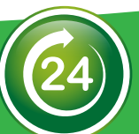
24hr Live Tracking