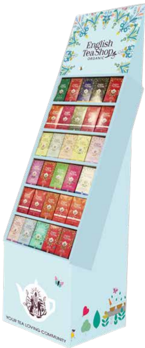
058250 - Floor Display Shippers for 20ct x 60 units