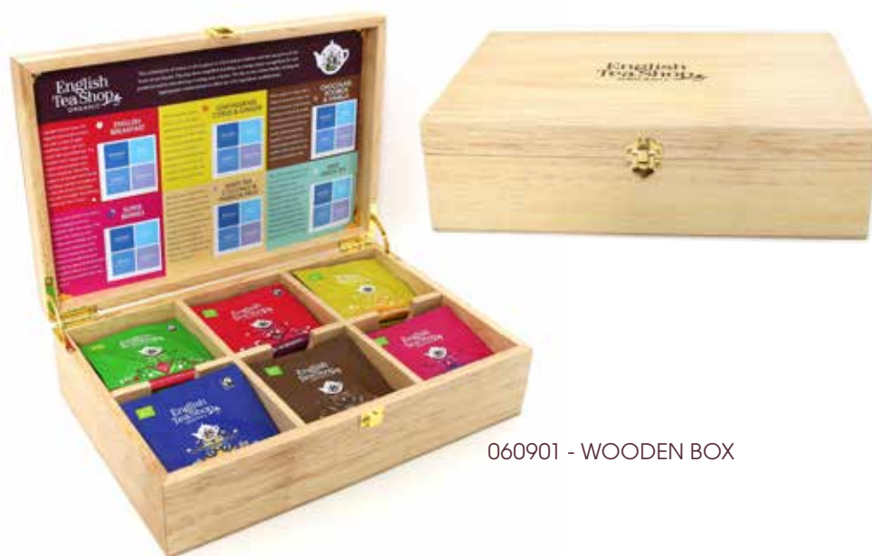
060901 - WOODEN BOX