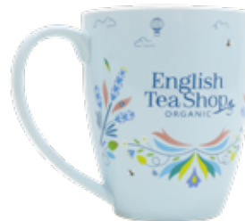
060093 - Printed Tea Mug