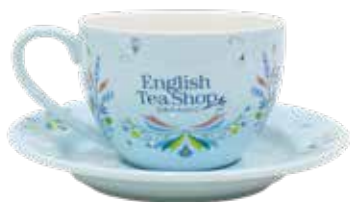
060109 - Printed Tea Cup & Saucers