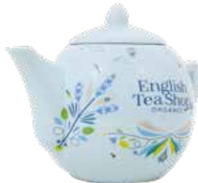
058212 - Printed Tea Pot