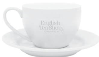
060468 - White Tea Cup & Saucer