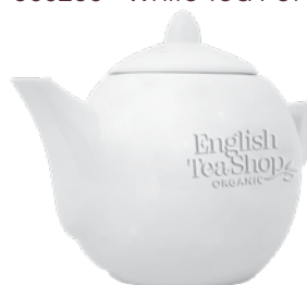
058205 - White Tea Pot