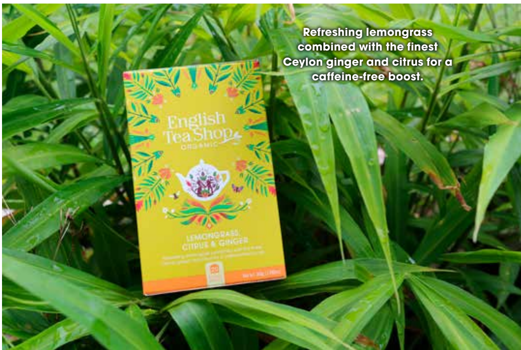
Refreshing lemongrass combined with the finest Ceylon ginger and citrus for a caffeine-free boost.