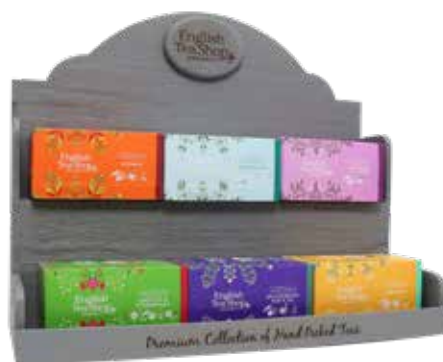
058236 - Table Top Stand For 20 Sachet Tea Bag Packs. Real Wood Finish, Laser Engraved.