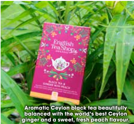
Aromatic Ceylon black tea beautifully balanced with the world's best Ceylon ginger and a sweet, fresh peach flavour.

As fans of mother nature, we have made tea bags, boxes and outer packaging in this range fully compostable. Our tea bags are staple-free and sachets are recyclable.