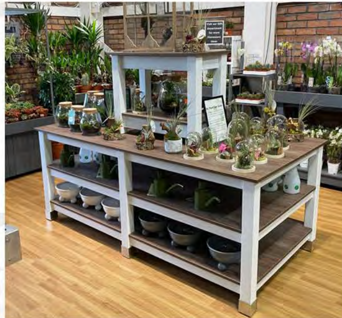
Table top and shelves are available in a wide range of MFC wood effect finishes and solid colours.

Our three-tier display table is made from a combination of timber legs and frame with melamine shelves and top