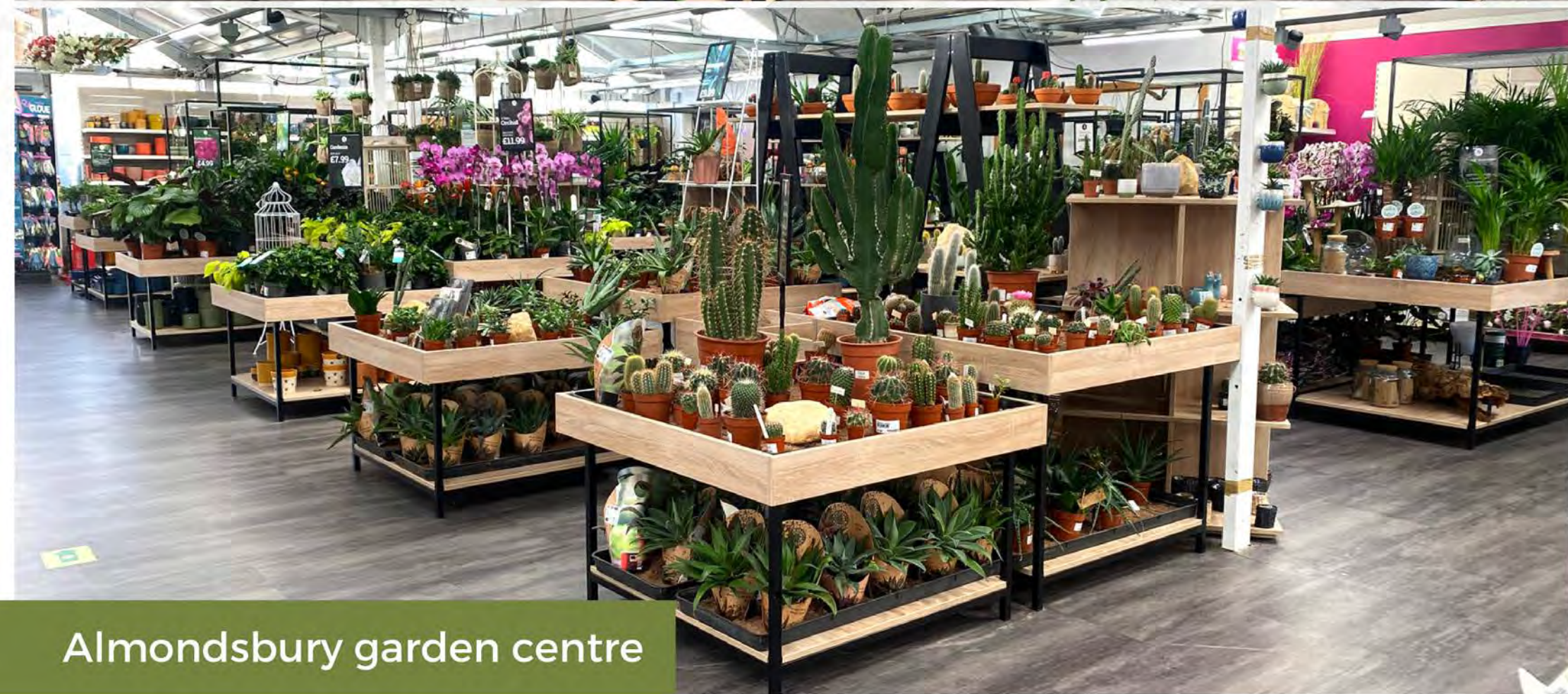
Almondsbury garden centre