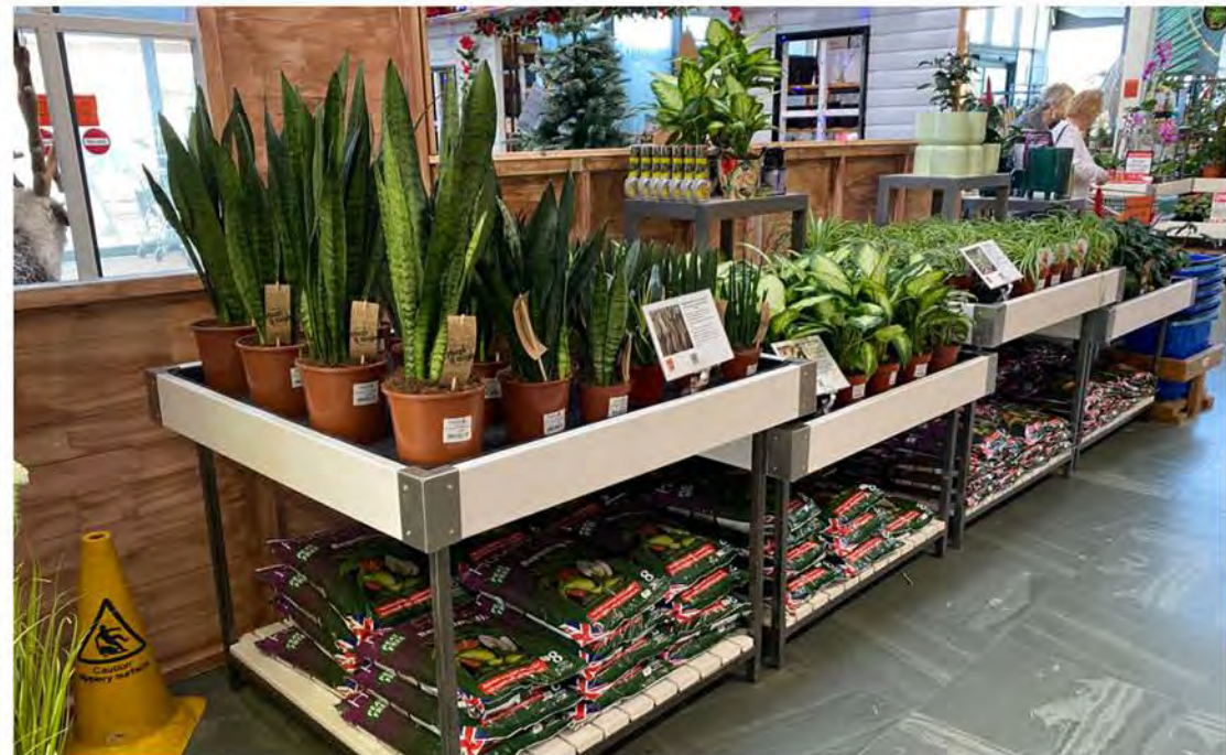
Poplars Garden Centre