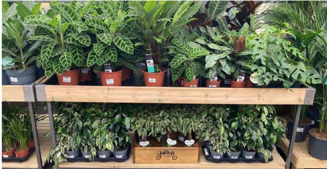
Hillier Garden Centres