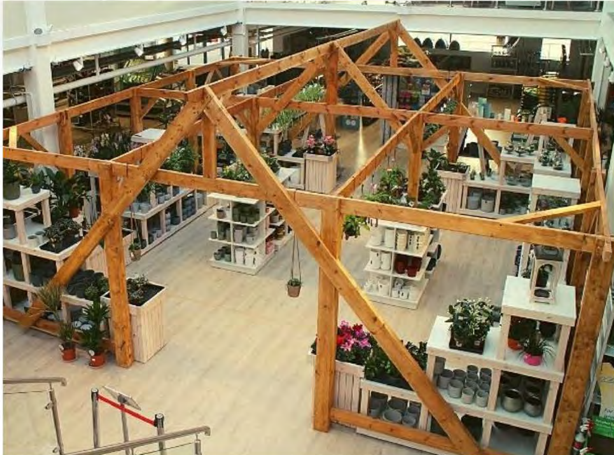
Tong Garden Centre