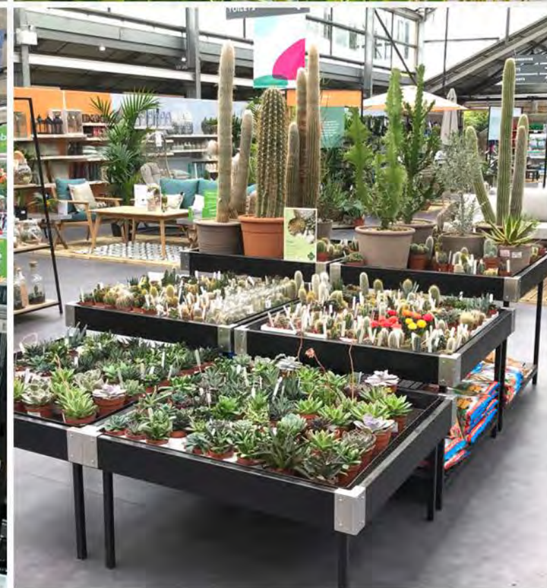
Dobbies Garden Centres