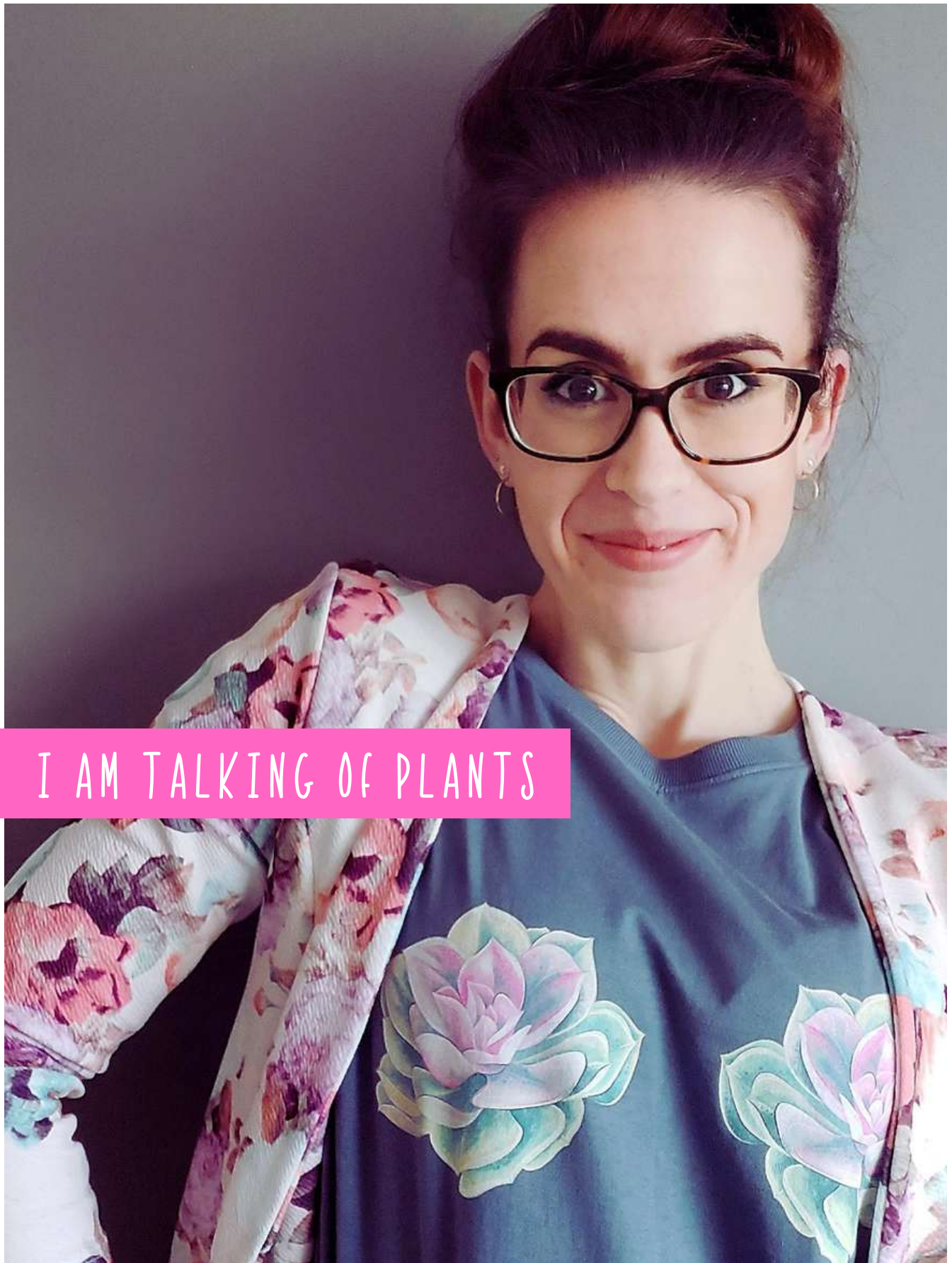
T-shirt: The Glow Up / Sku: WTS-GUP-BL