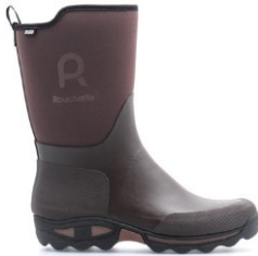
CLEAN GARDEN half-boot Brown Sizes 40 to 47