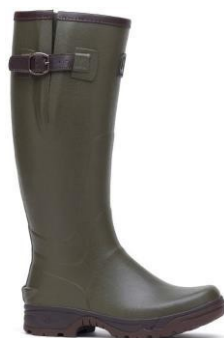
VENEURLADY Boot Khaki Sizes :36 to 41