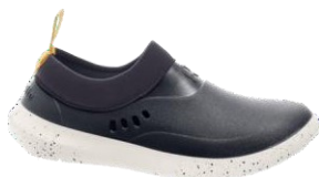
MIX Shoe Dark grey Sizes 41 to 46