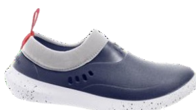
MIX Shoe Navy blue Sizes 36 to 46

Description: Lightweight, durable and easy to wash. Its EVA composition ensures a lightweight and comfortable product without compromising aesthetics.