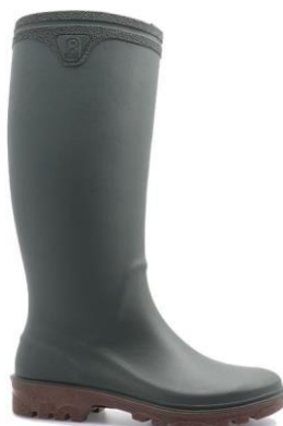
CYCLONE Boot Khaki Sizes 40 to 46

GALBED BOOT NOTCHED SOLE REMOVAL LUG PHTALATES-FREE