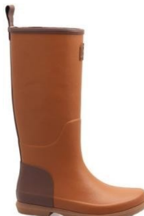
ORIGIN Boot Camel Sizes 36 to 41