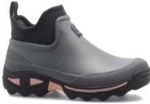
CLEAN LADY Ankle boot Grey Sizes:36 to 41