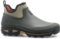
CLEAN LAND Ankle boot Khaki Sizes :40 to 47