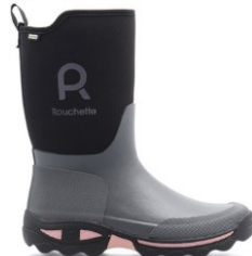
CLEAN GARDEN half-boot Grey Sizes :36 to 41