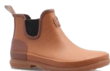
ORIGIN Ankle boot Camel Sizes 36 to 41