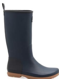
ORIGIN Boot Night blue Sizes 40 to 46