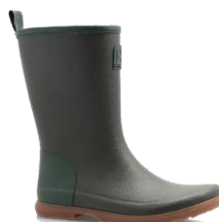
ORIGIN Half boot Khaki Sizes 36 to 46