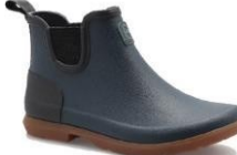
ORIGIN Ankle boot Duck blue Sizes 40 to 46