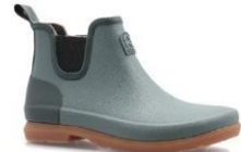
ORIGIN Ankle boot Water green Sizes 36 to 41