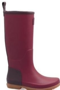
ORIGIN Boot Eggplant Sizes 36 to 41