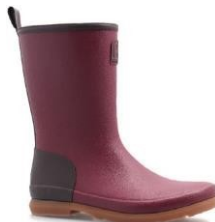
ORIGIN Half boot Eggplant Sizes 36 to 41