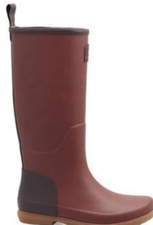
ORIGIN Boot Amber Sizes 40 to 46