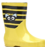
AXEL Boot Yellow