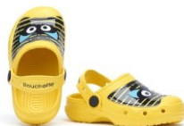
AXEL Clog Yellow