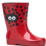
ANABEL Boot Red