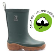
CLEAN KIDS Boot Green