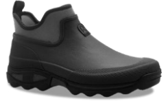
CLEAN LAND Ankle boot Black Sizes :40 to 47