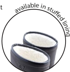
OPTIMUM Boot Brown Sizes 40 to 46