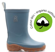
CLEAN KIDS Boot Blue