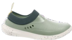
MIX Shoe Water green Sizes 36 to 41