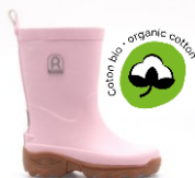
CLEAN KIDS Boot Pink