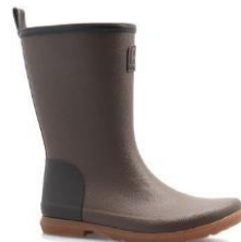
ORIGIN Half boot Brown Sizes 40 to 46