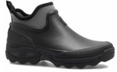
CLEAN LADY Ankle boot Black Sizes :36 to 41