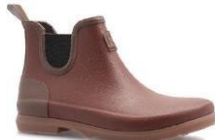
ORIGIN Ankle boot Amber Sizes 40 to 46