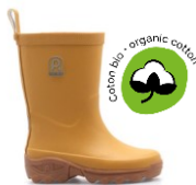
CLEAN KIDS Boot Mustard