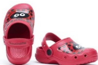
ANABEL Clog Red