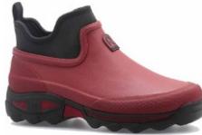
CLEAN LADY Ankle boot Plum Sizes :36 to 41