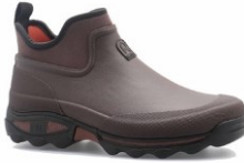
CLEAN LAND Ankle boot Brown Sizes 40 to 47