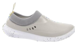
MIX Shoe Light grey Sizes 36 to 46