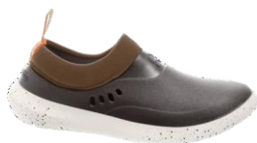
MIX Shoe Brown Sizes 41 to 46