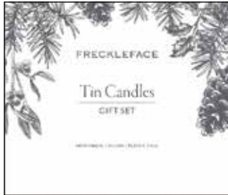
Tin Candle Gift Set WSTCGS Christmas Star, Winter Nights, Mistletoe