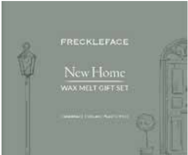
New Home, Wax Melt Gift Set NHWMGS

1x Classic White Wax Melter, 1x Clean & Fresh Wax Melt Box, 2x Tea Lights