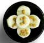
Orange Blossom WM039