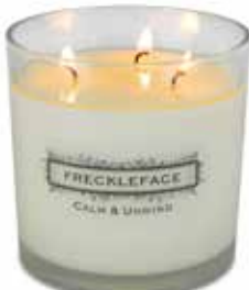
Large Luxury Candle LLC038