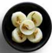
Jasmine & Lime WM008