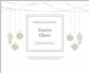
Festive Cheer Gift Set FCWMSGSGS

Christmas Star, Evergreen, Spiced Orange, Winter Nights