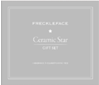
Ceramic Star Gift Set WFOGS 1x Ceramic Star, 4x 10ml Essential Oils, Winter Nights, Christmas Star, Spiced Orange, Evergreen