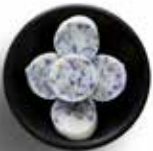
Clean Laundry WM003