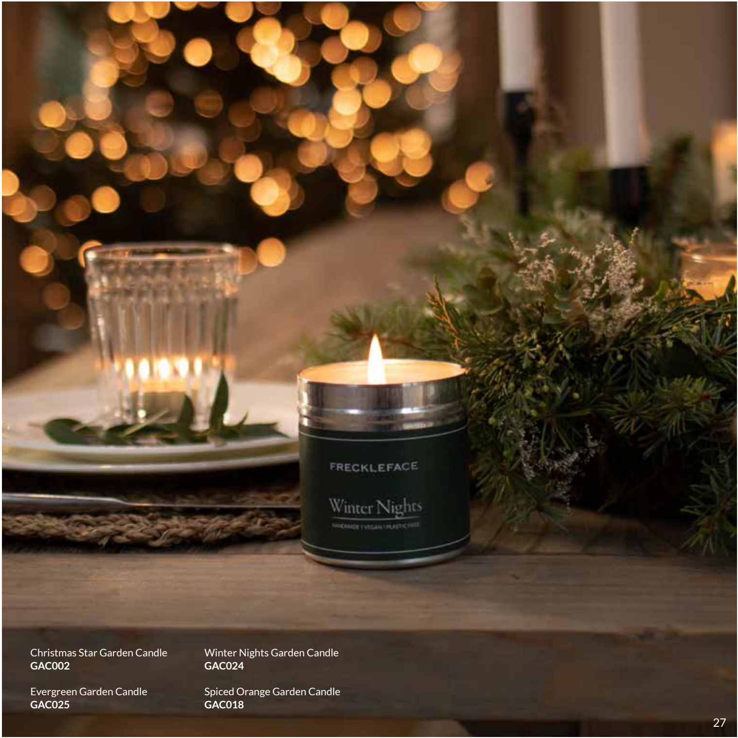
Christmas Star Garden Candle GAC002