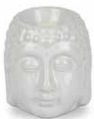
White Buddha melter OB007