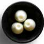
Coconut & Seasalt WM004