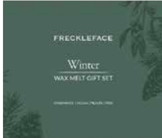
Winter Wax Melt Gift Set GBW001 1x Star Wax Melter, 1x Winter Collection Wax Melt Box 2x Tealights