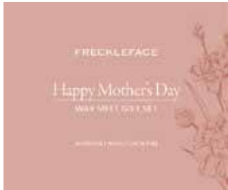
Mother's Day Wax Melt Gift Set GBM001