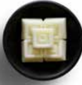
White Tea & Sage WM022