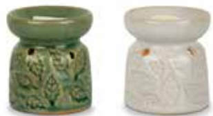
Leaf Style Melter OB006