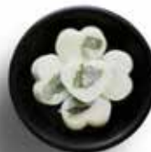
Eucalyptus & Peppermint WM006