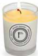
Spiced Orange Mini Candle MCA018