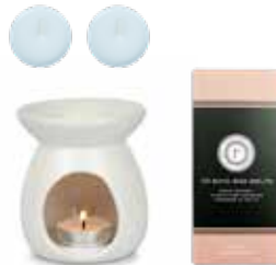
Mother's Day Wax Melt Gift Set GBM001 1x White Wax Melter 1x Floral Collection Wax Melt Box 2x Tea Lights