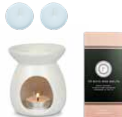
Valentines Day Wax Melt Gift Set GBV001 1x White Wax Melter 1x Floral Collection Wax Melt Box 2x Tea Lights