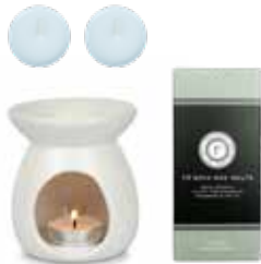
Wax Melt Gift Set GBG001 1x Classic White Wax Melter 1x Classic Collection Wax Melt Box 2x Tea Lights