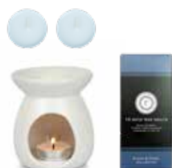
New Home Wax Melt Gift Set NHWMGS 1x Classic White Wax Melter 1x Clean & Fresh Wax Melt Box 2x Tea Lights