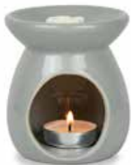
Classic Grey Melter OB010