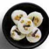
Spiced Orange Wax Melts WM018