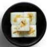
Honeysuckle & Jasmine WM033