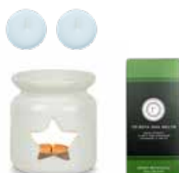
You're A Star Wax Melt Gift Set YASGS 1x Star Wax Melter 1x Green Botanicals Collection Wax Melt Box 2x Tea Lights