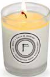
Mini Candle MCA038