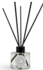
Spiced Orange Reed Diffuser RD018

1x Classic White Wax Melter, 1x Clean & Fresh Wax Melt Box, 2x Tea Lights