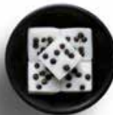
Sandalwood & Blackpepper WM035