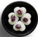
English Rose WM014