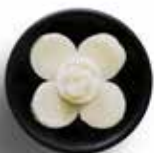
Peony & Vanilla WM021