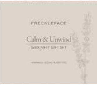
Wax Melt Gift Set CU001