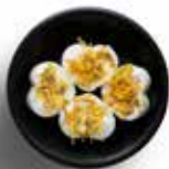
Grapefruit & Mangosteen WM032