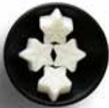
Pomegranate Black WM013