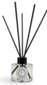
Reed Diffuser RDC&U