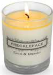
Medium Candle MEDCCU