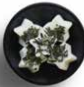
Green Tea & Lemongrass WM007