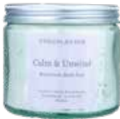
Botanical Bath Fizz BBF01

For 2022, we've teamed up with 2 charities; Combat Stress and Don't Lose Hope who support children and adults with mental health issues.