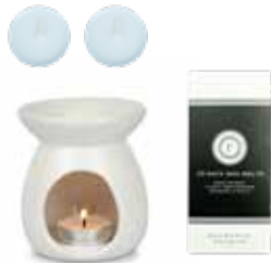
Calm & Unwind Wax Melt Gift Set CU001 1x Classic White Wax Melter 1x Calm & Unwind Wax Melt Box 2x Tea Lights