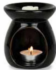
Classic Black Melter OB011