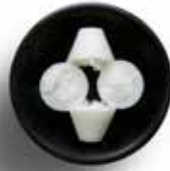
Lemongrass & Coconut WM036