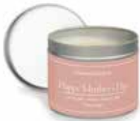
Mother's Day Tin Candle HMDLTC