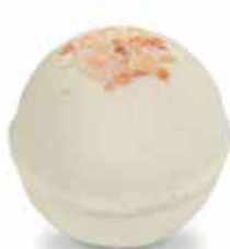
Calm & Unwind BBB01