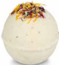
Floral Bomb BBB02