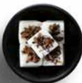
Winter Nights WM024