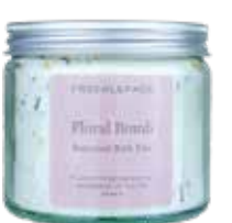
Floral Bomb BBF02