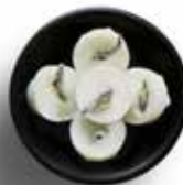
Sage & Pomegranate WM015