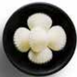
Sea Breeze WM017

Thank You TYTGS 1x Classic Grey Wax Melter, 1x Citrus Burst Wax Melt Box, 2x Tealights