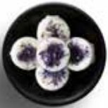
Floral Oud WM028