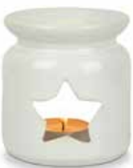
Star Style melter OB023