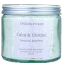
Calm & Unwind BBF01