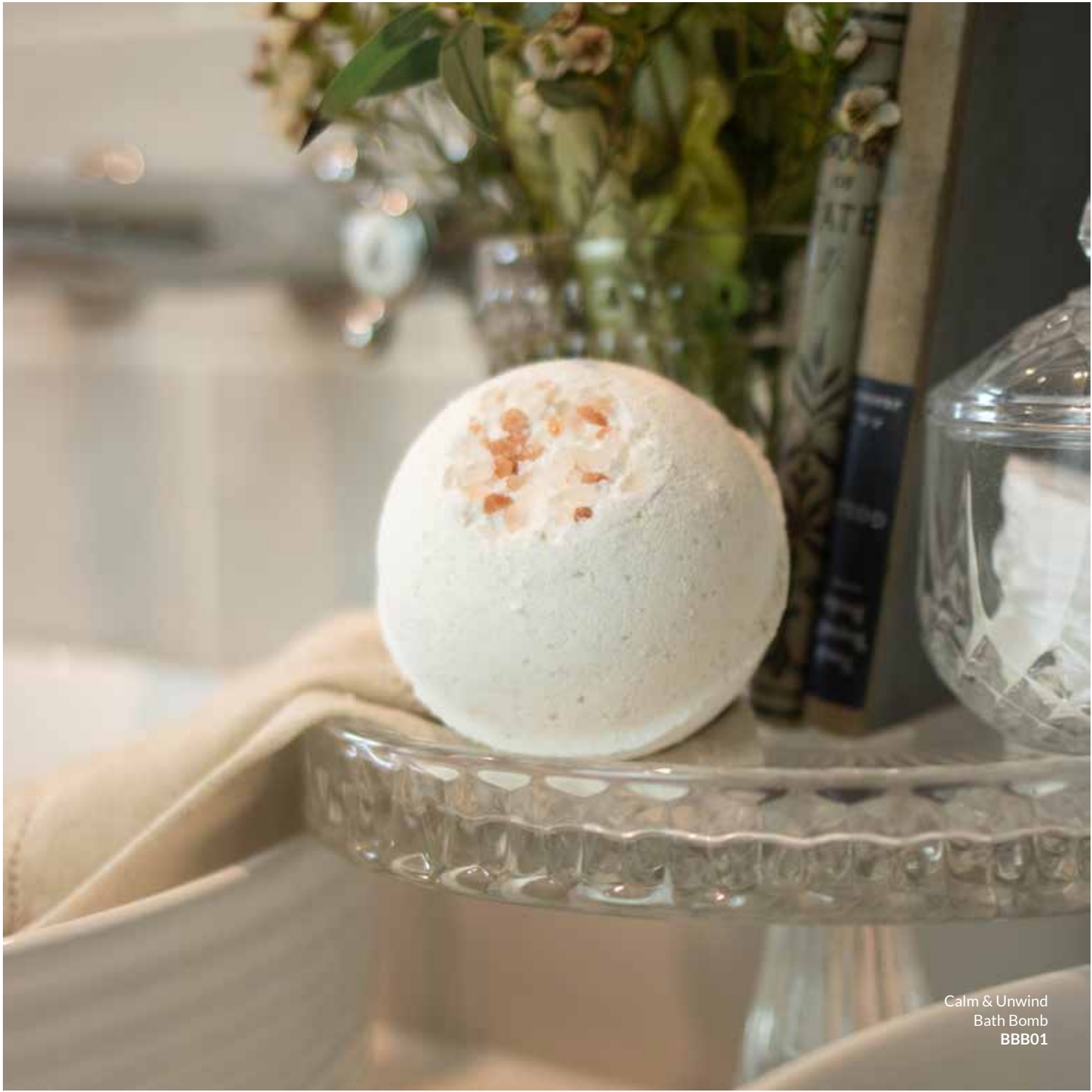
Calm & Unwind Bath Bomb BBB01