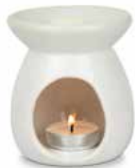
Classic White Melter OB009

Our wax melters are all our own unique designs.