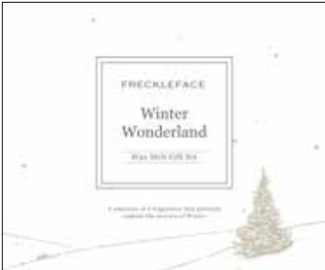
Winter Wonderland Gift Set WWWMSGSGS

1x Star Wax Melter, 1x Festive Cheer Limited Edition Wax Melt Box, 2x Tea Lights