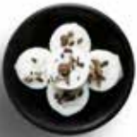
Rocksalt & Driftwood WM034