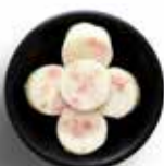
Sweet Pea WM020