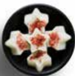
Strawberries & Cream WM019