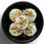
Lemon & Pine WM010