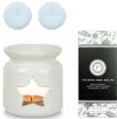
Winter Wax Melt Gift Set GBW001 1x Star Wax Melter 1x Winter Collection Wax Melt Box 2x Tea Lights