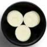
Bergamot Verbena WM001