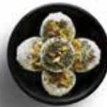
Orange, Lime & Basil WM012