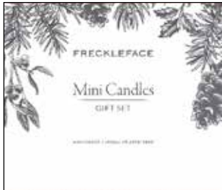
Mini Candles Gift Set WMCAGS Christmas Star, Winter Nights, Hygge