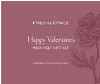
Valentine's Day Wax Melt Gift Set GBV001