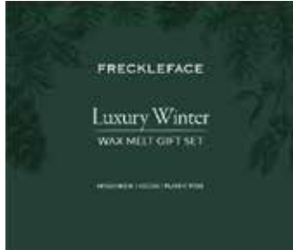
Luxury Winter Wax Melt Gift Set UWGS 1x Star Wax Melter, 1x Winter Collection Wax Melt Box, 1x Festive Cheer Wax Melt Box, 2x Tealights