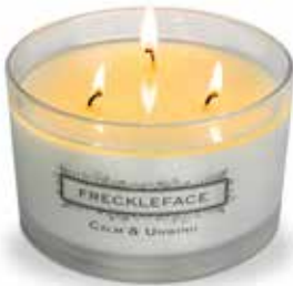
3 Wick Table Candle 3WCC&U