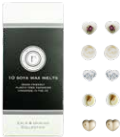
Wax Melt Collection WMT006