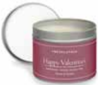
Valentine's Day Tin Candle HVLTC