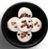
Mediterranean Fig OB009