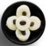
Coffee Cooler WM005