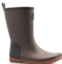
ORIGIN Half boot Brown Sizes : 40 to 46