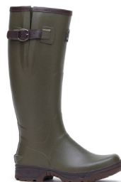
VERNEUR LADY Boot Khaki Sizes: 36 to 41