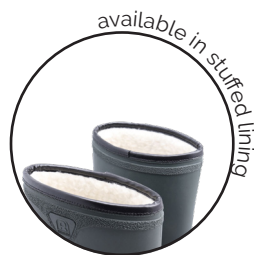
CYCLONE Boot Khaki Sizes : 40 to 46

Description: Designed for intensive activities.