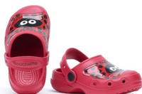
ANABEL clog Red PT: 25 to 29