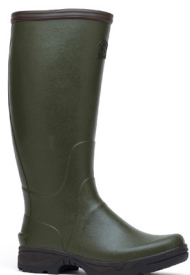
VERNEUR Boot Khaki Sizes: 40 to 46

+ RESISTANCE MAXIMUM GRIP ARCH SUPPORT REMOVAL LUG