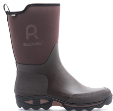
CLEAN GARDEN half-boot Brown Sizes 40 to 47