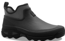
CLEAN LAND Ankle boot Black Sizes :40 to 47