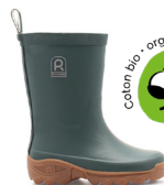
CLEAN KIDS Boot Green Sizes: 24/25 to 34/35