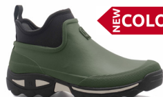
CLEAN LADY Ankle boot Khaki Sizes : 36 to 41