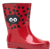
ANABEL Boot Red PT: 22 to 26