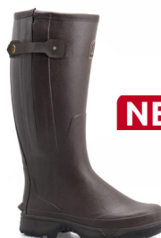
VERNEUR NEO ZIP Boot Brown Sizes: 40 to 46