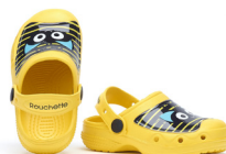
AXEL clog Yellow PT: 25 to 29