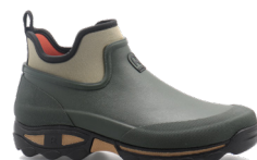
CLEAN LAND Ankle boot Khaki Sizes : 40 to 47