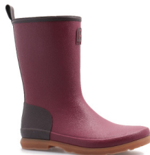
ORIGIN Half boot Eggplant Sizes : 36 to 41