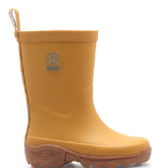
CLEAN KIDS Boot Mustard Sizes: 24/25 to 34/35