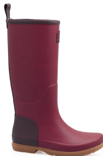
ORIGIN Boot Eggplant Sizes : 36 to 41