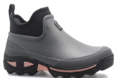
CLEAN LADY Ankle boot Grey Sizes: 36 to 41