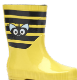
AXEL Boot Yellow PT: 22 to 26