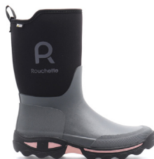
CLEAN GARDEN half-boot Grey Sizes :: 36 to 41