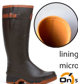
GRAND VERNEUR Boot Brown Sizes: 40 to 46