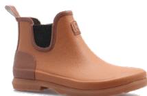
ORIGIN Ankle boot Camel Sizes : 36 to 41