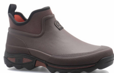
CLEAN LAND Ankle boot Brown Sizes 40 to 47