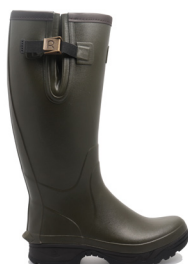
VERNEUR NEO Boot Khaki Sizes: 40 to 46