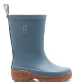
CLEAN KIDS Boot Blue Sizes: 24/25 to 34/35