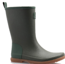
ORIGIN Half boot Khaki Sizes : 36 to 46