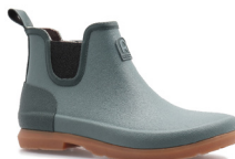
ORIGIN Ankle boot Water green Sizes : 36 to 41