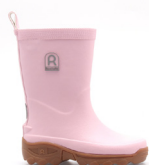
CLEAN KIDS Boot Mustard Sizes: 24/25 to 34/35