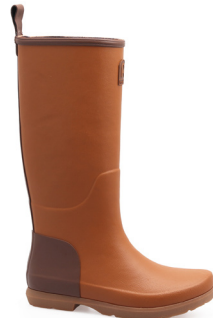
ORIGIN Boot Camel Sizes : 36 to 41

Description: An educational and ecological approach, with a range of products handmade from premium natural rubber in our workshop in the Dominican Republic.