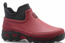
CLEAN LADY Ankle boot Plum Sizes : 36 to 41