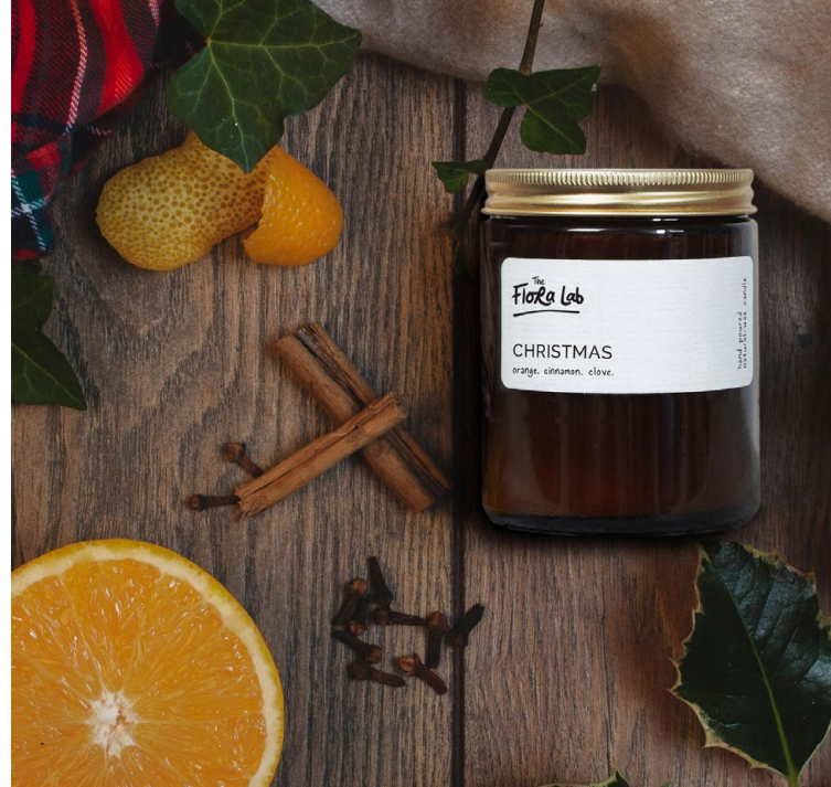
Above: Christmas 180ml Candle Below: Alpine Air 180ml Candle