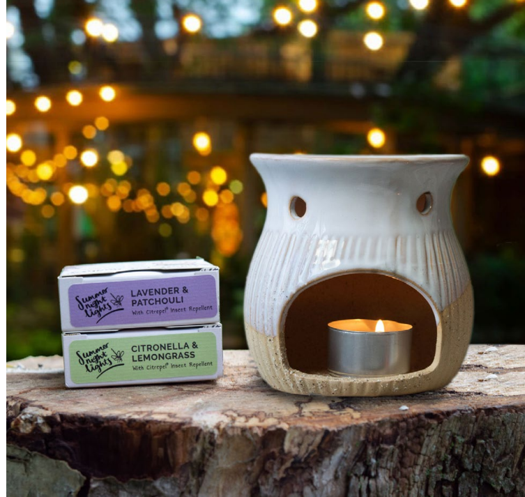
Above & Below: Summer Night lights Wax Melt Bar Collection