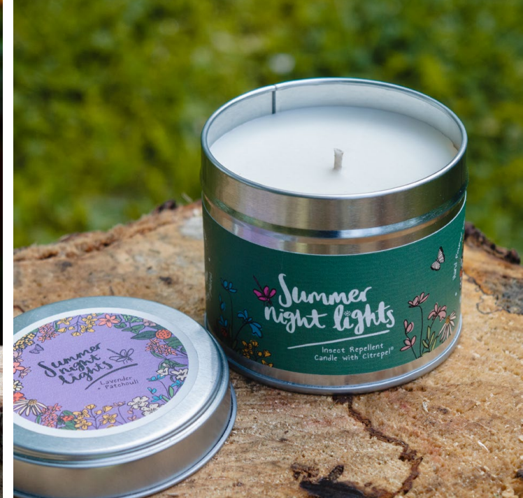
Above: Lavender & Patchouli 200ml Tin Candle Below: Citronella & Lemongrass 200ml Tin Candle