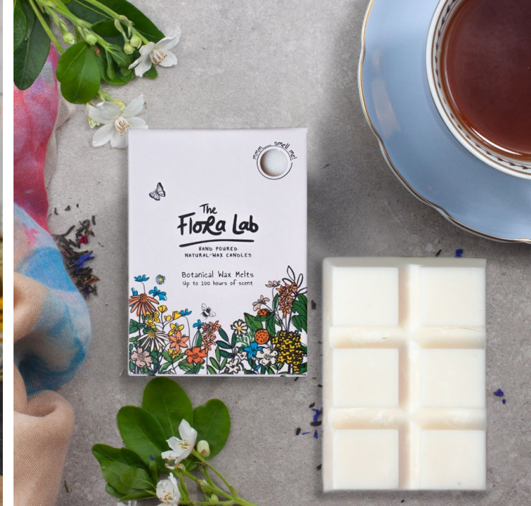
Above: Darjeeling Delights Wax Melt Bar Below: Renaissance Man Soy Derived Reed Diffuser