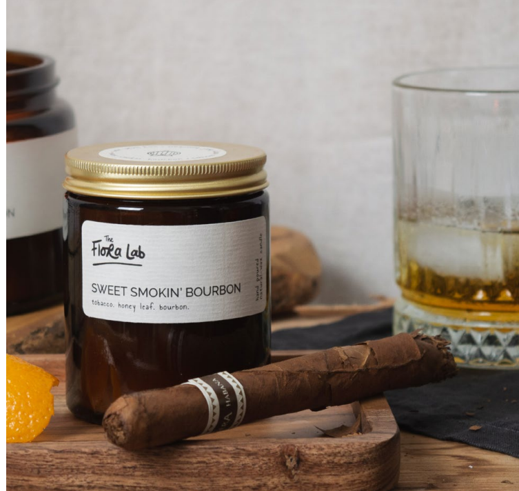
Above: Sweet Smokin' Bourbon 180ml Candle Below: Stargazer 500ml Candle

A kaleidoscope of green coupled with the warm comfort of a smokey turf fire. Vetiver. Precious Woods. Moss.