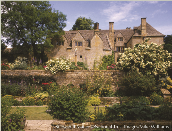
Snowhill Manor