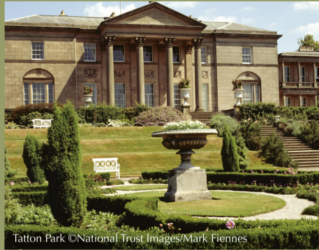
Tatton Park

With the same beautiful terracotta colouring as the Chedworth Tile, use these random shaped Stepping Stones to create colourful paths within your garden design.