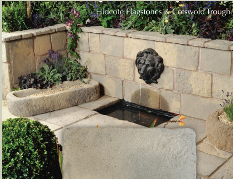
Hidcote Flagstones & Cotswold Trough