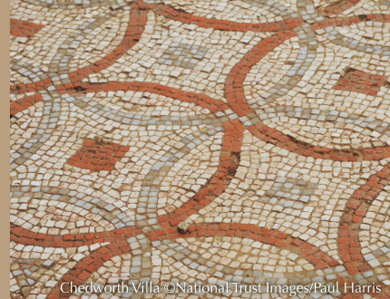
Chedworth Villa