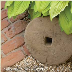
Millstone & Brick Pavers

Handmade to match the Barrington Flagstone, providing an exciting range of design options in their random shapes.