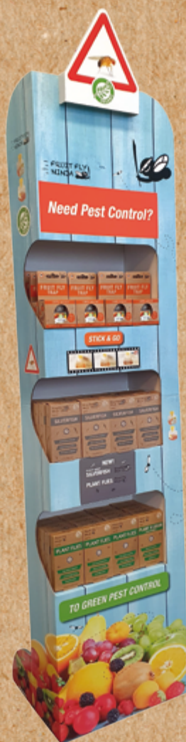
Display Medium ±35x28x147cm (incl. top card 165cm)