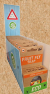
Display Mini ±7x30x26cm