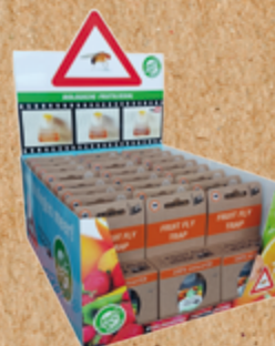
Display Small ±22x30x26cm