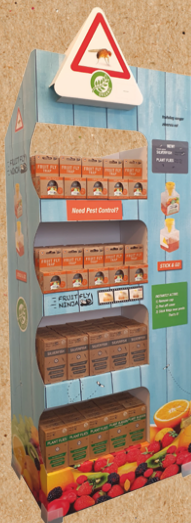
Display Large ±60x40x147cm (incl. top card 165 cm)

Our range of point of sale includes counter displays, pre-filled and tailor-made free-standing display units to meet all your needs and drive sales. See our range of support material.