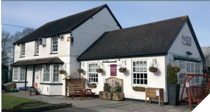
Squire's garden centre near London (UK)

A new entrance, a HighLight arched greenhouse and a venlo canopy will extent this garden centre with almost 1,700 m 2 extra space. It will give this garden centre a total metamorphose for the future.