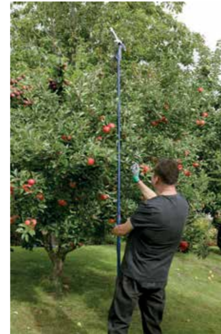
Shown with saw blade attached.