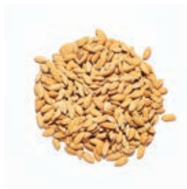
PADDY RICE REF: 9920 SIZE: 20KG