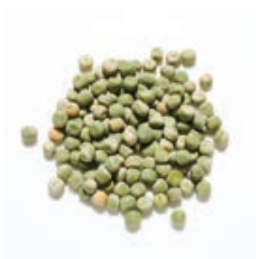
GREEN/BLUE PEAS REF: 80/12 SIZE: 20KG