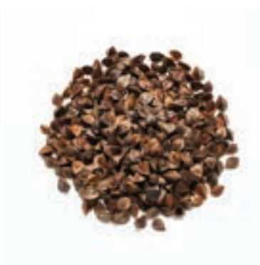
BUCKWHEAT REF: 10690 SIZE: 20KG