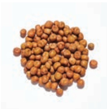
MAPLE PEAS REF: 70 SIZE: 20KG