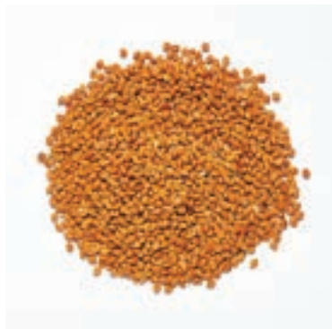
RED MILLET SEED REF: 117 SIZE: 20KG