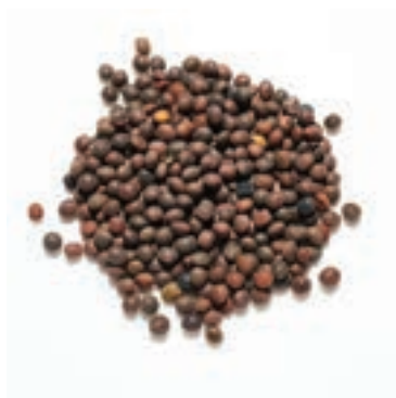
TARES (VETCHES) REF: 57126 SIZE: 20KG