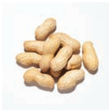
PEANUTS IN SHELL REF: 1092 SIZE: 10KG