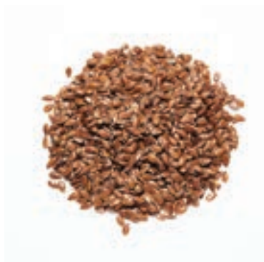
SCREENED LINSEED REF: 573 SIZE: 20KG