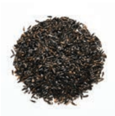
NIGER (NYJER) SEED REF: 5030 SIZE: 1.7KG