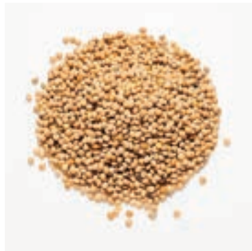
WHITE MILLET REF: 5024 SIZE: 1.7KG REF: 118 SIZE: 20KG