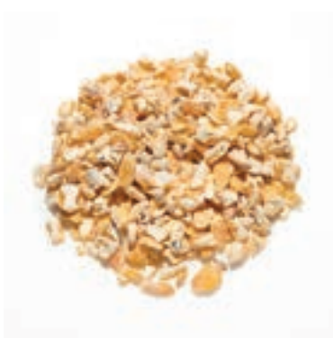
CUT MAIZE REF: T006 SIZE: 20KG