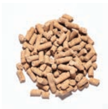
SUET PELLETS – MEALWORM & INSECT REF: 5525 SIZE: 12.55KG