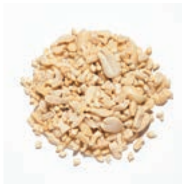
PEANUT GRANULES REF: 6629 SIZE: 25KG