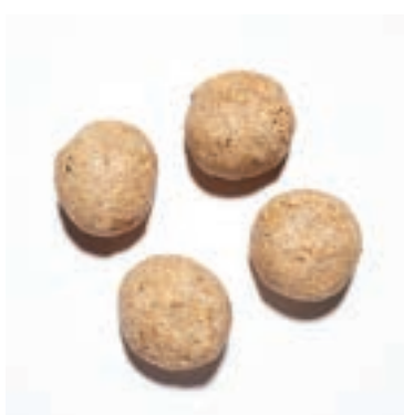
FAT BALLS (NO NETS) REF: 10527 SIZE: 150 X 85G