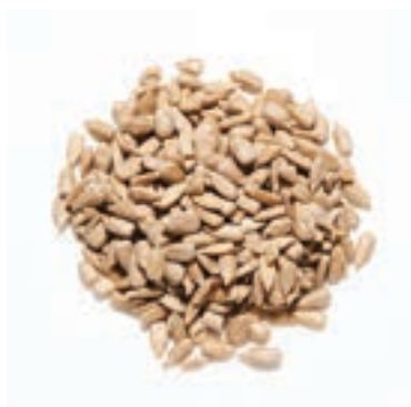
SUNFLOWER HEARTS REF: 5028 SIZE: 1.5KG