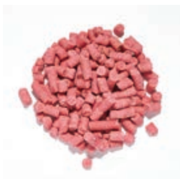
SUET PELLETS – BERRIES REF: 5523 SIZE: 12.55KG