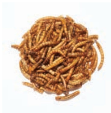
MEALWORMS – BULK BOX REF: 5522 SIZE: 12.55KG