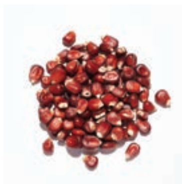
RED MAIZE REF: 2798 SIZE: 20KG