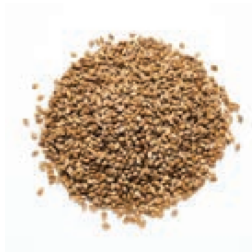
JAPANESE MILLET SEED REF: 236 SIZE: 13KG