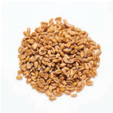
WHEAT REF: 88/20 SIZE: 20KG