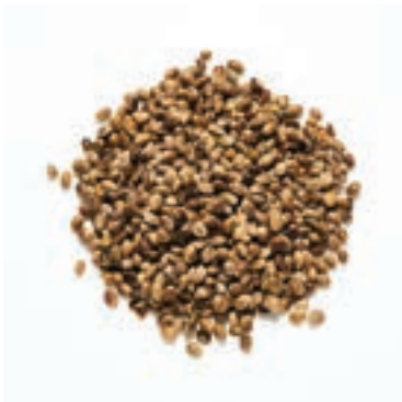
HEMP SEED REF: 5023 SIZE: 1.7KG