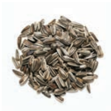
SMALL STRIPED SUNFLOWER SEED REF: 5026 SIZE: 1.5KG