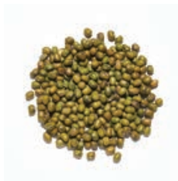
MUNG BEANS REF: 1084 SIZE: 20KG