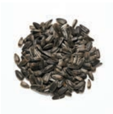
BLACK SUNFLOWER SEED REF: 5029 SIZE: 1.2KG REF: 9701 SIZE: 13KG