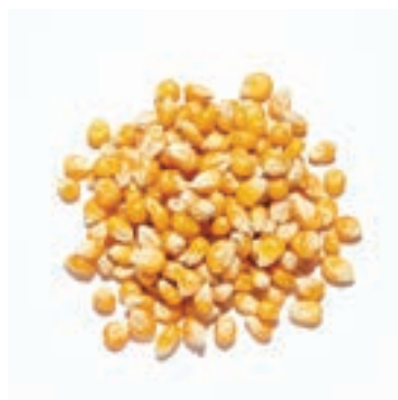
POPCORN MAIZE REF: 13353 SIZE: 20KG