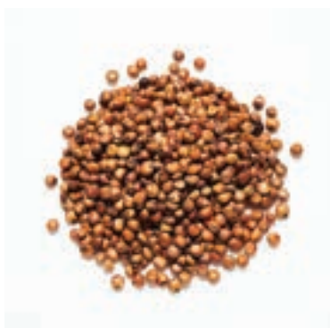
RED DARI REF: 523 SIZE: 20KG