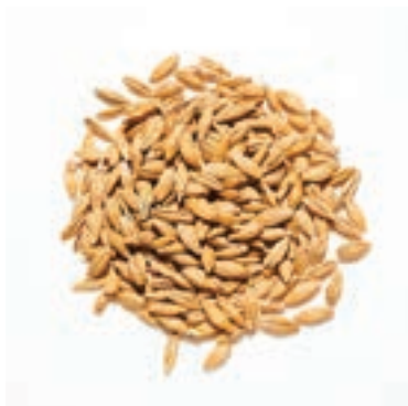
BARLEY REF: 89 SIZE: 20KG