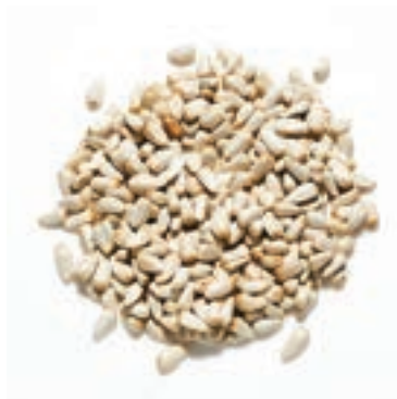
SAFFLOWER REF: 57220 SIZE: 20KG