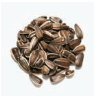
MEDIUM/ LARGE STRIPED SUNFLOWER SEED REF: 119 SIZE: 12.55KG