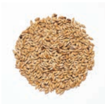
PLAIN CANARY SEED REF: 5025 SIZE: 1.7KG REF: 16 SIZE: 20KG