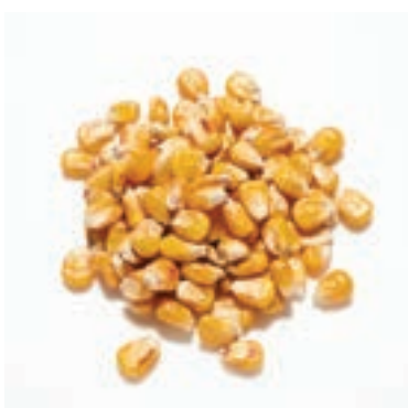
FRENCH ROUND BERRY MAIZE REF: 87 SIZE: 20KG