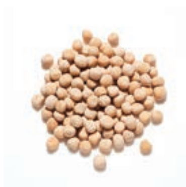
WHITE/YELLOW PEAS REF: 81/12 SIZE: 20KG