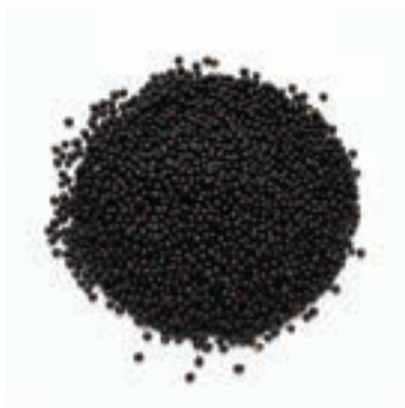
BLACK RAPESEED REF: 1095 SIZE: 20KG