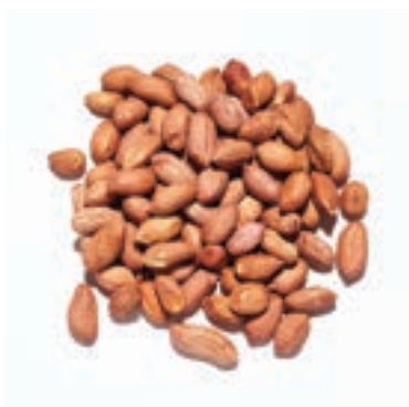
PEANUTS REF: 5027 SIZE: 1.7KG REF: 63-20 SIZE: 20KG