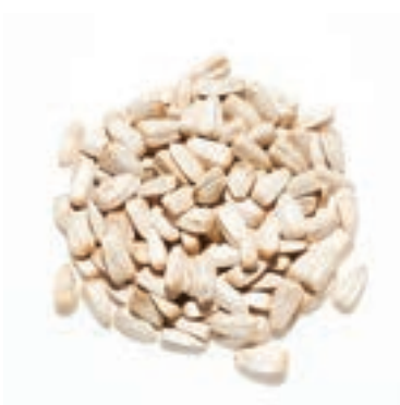
WHITE SUNFLOWER SEED REF: 79/12 SIZE: 13KG