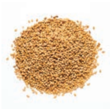
PANICUM MILLET SEED REF: 69 SIZE: 20KG