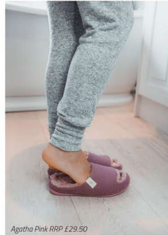
Agatha Pink RRP £29.50