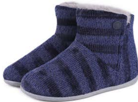
Jenny Navy RRP £39