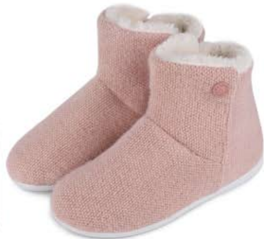
Jenny Pink RRP £39