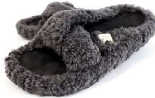
Katie Charcoal RRP £32

The vegan Katie slipper features a crossover slider design with a soft mould footbed for ultimate comfort. The easy slip-on design makes these sliders perfect for lounging round the house or wearing outdoors. Available in Charcoal and Oat.