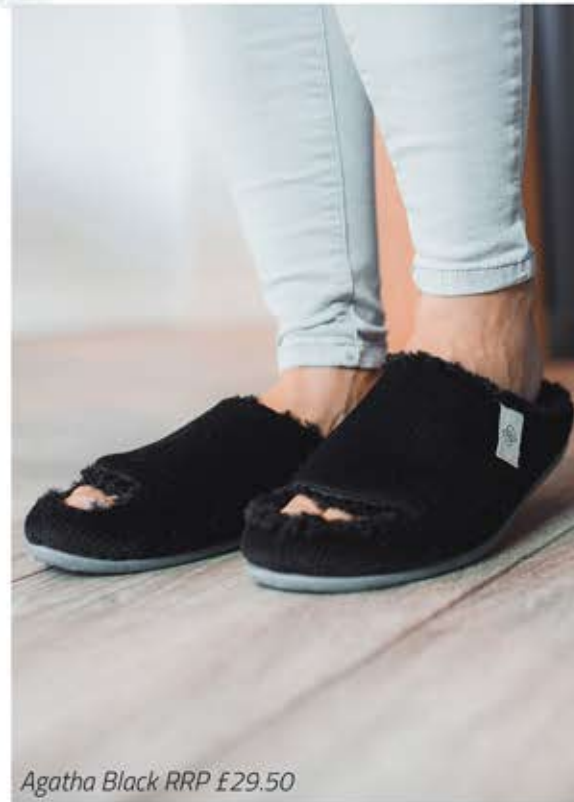
Agatha Black RRP £29.50