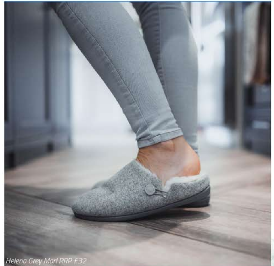
Helena Grey Marl RRP £32