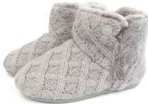
Jenny Grey Knit £39