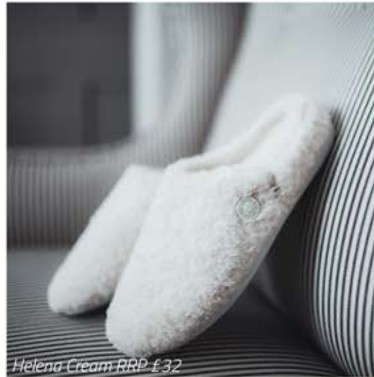
Helena Cream RRP £32