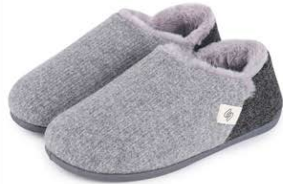
Isobel Charcoal RRP £34