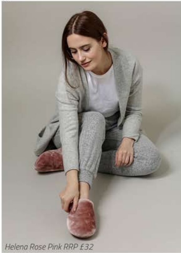
Helena Rose Pink RRP £32