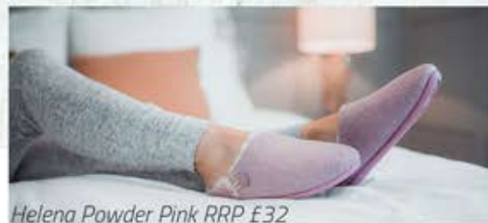
Helena Powder Pink RRP £32