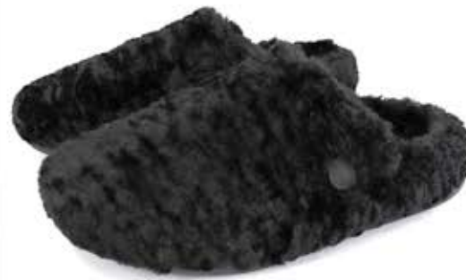
Helena Black RRP £32