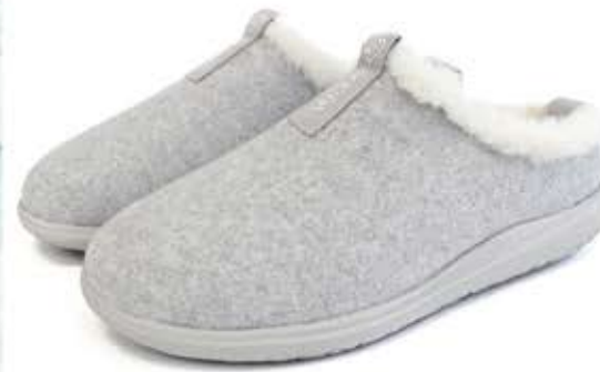
Laura Grey RRP £42

Vegan product. Available in grey and mink.