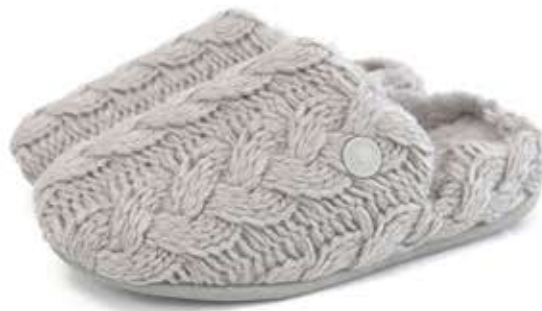
Helena Grey Knit RRP £32