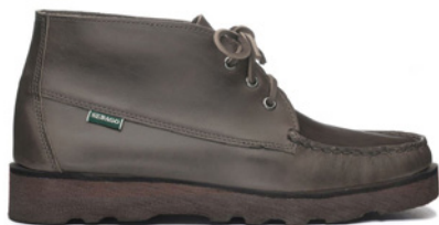
914 BROWN MUD

SIZES: 6 6.5 7 7.5 8 8.5 9 9.5 10 10.5 11 11.5 12 12.5 13 13.5 14 14.5 15