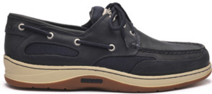
908 BLUE NAVY

SIZES: 6 6.5 7 7.5 8 8.5 9 9.5 10 10.5 11 11.5 12 12.5 13