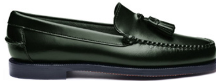
A7R GREEN CHIVE