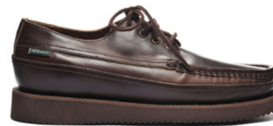
920 TOTAL DK BROWN

SIZES: 6 6.5 7 7.5 8 8.5 9 9.5 10 10.5 11 11.5 12 12.5 13 13.5 14 14.5 15