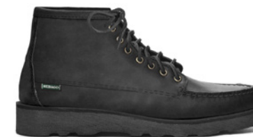
924 TOTAL BLACK