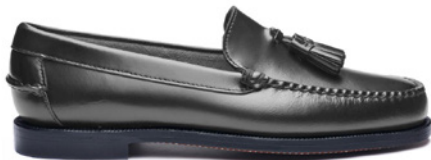
A89 STEEL GREY