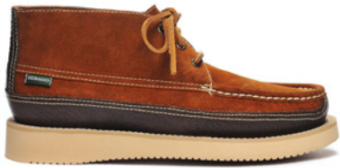
A5W COGNAC-DK BROWN

SIZES: 6 6.5 7 7.5 8 8.5 9 9.5 10 10.5 11 11.5 12 12.5 13 13.5 14 14.5 15