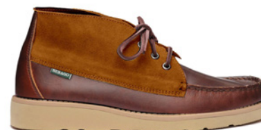
A65 BROWN COGNAC-BROWN

SIZES: 6 6.5 7 7.5 8 8.5 9 9.5 10 10.5 11 11.5 12 12.5 13 13.5 14 14.5 15