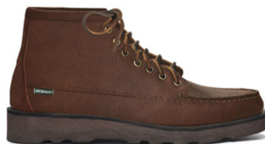
920 TOTAL DK BROWN