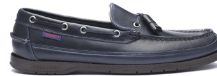
978 BLUE NAVY GUM

SIZES: 6 6.5 7 7.5 8 8.5 9 9.5 10 10.5 11 11.5 12 12.5 13