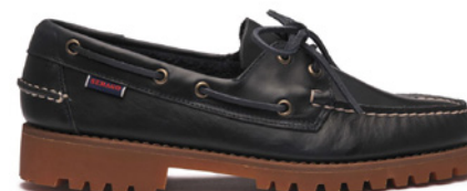
908 BLUE NAVY

SIZES: 6 6.5 7 7.5 8 8.5 9 9.5 10 10.5 11 11.5 12 12.5 13 13.5 14 14.5 15