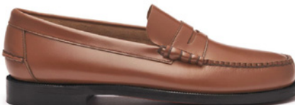
A87 BROWN GINGER