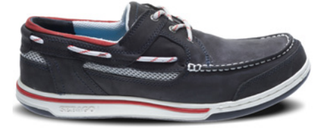
908 BLUE NAVY