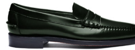
A7R GREEN CHIVE