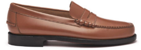
A87 BROWN GINGER