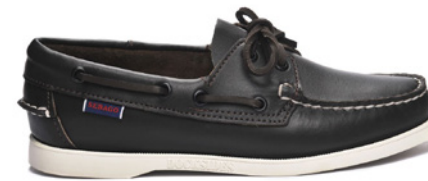
901 DARK BROWN

SIZES: 5 5.5 6 6.5 7 7.5 8 8.5 9 9.5 10 10.5 11