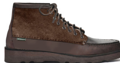
914 BROWN MUD

SIZES: 6 6.5 7 7.5 8 8.5 9 9.5 10 10.5 11 11.5 12 12.5 13 13.5 14 14.5 15