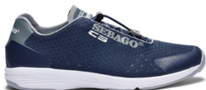
908 BLUE NAVY

SIZES: 5 5.5 6 6.5 7 7.5 8 8.5 9 9.5 10 10.5 11