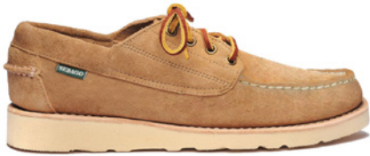
906 BEIGE CAMEL

SIZES: 6 6.5 7 7.5 8 8.5 9 9.5 10 10.5 11 11.5 12 12.5 13 13.5 14 14.5 15