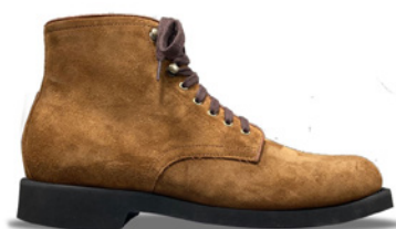
907 BROWN COGNAC