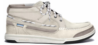
A2J OFF WHITE