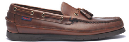
925 BROWN GUM