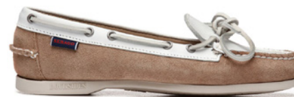
A2A BEIGE WHITE

SIZES: 5 5.5 6 6.5 7 7.5 8 8.5 9 9.5 10 10.5 11