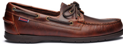
925 BROWN GUM