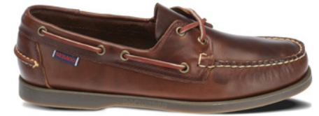
925 BROWN GUM