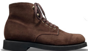
901 DK BROWN

SIZES: 6 6.5 7 7.5 8 8.5 9 9.5 10 10.5 11 11.5 12 12.5 13 13.5 14 14.5 15