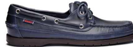
978 BLUE NAVY GUM

SIZES: 6 6.5 7 7.5 8 8.5 9 9.5 10 10.5 11 11.5 12 12.5 13 13.5