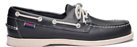
908 BLUE NAVY