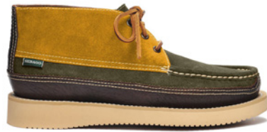
A8H COGNAC-MUSTARD-DK GREEN-DK BROWN