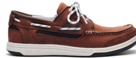
983 BROWN - DK BROWN

SIZES: 6 6.5 7 7.5 8 8.5 9 9.5 10 10.5 11 11.5 12 12.5 13