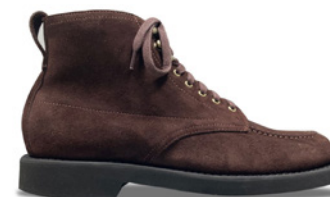
901 DK BROWN

SIZES: 6 6.5 7 7.5 8 8.5 9 9.5 10 10.5 11 11.5 12 12.5 13 13.5 14 14.5 15