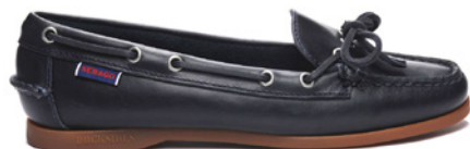
978 BLUE NAVY GUM