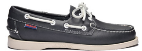
908 BLUE NAVY