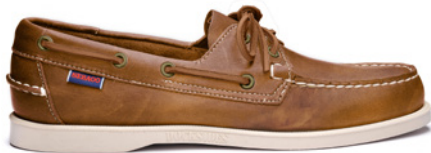
912 BROWN TAN

SIZES: 6 6.5 7 7.5 8 8.5 9 9.5 10 10.5 11 11.5 12 12.5 13