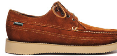
907 BROWN COGNAC

SIZES: 6 6.5 7 7.5 8 8.5 9 9.5 10 10.5 11 11.5 12 12.5 13 13.5 14 14.5 15