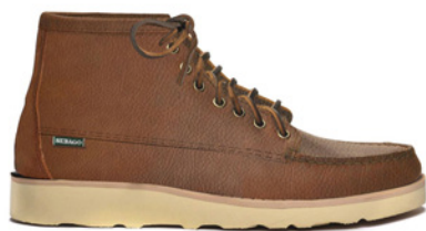
912 BROWN TAN

SIZES: 6 6.5 7 7.5 8 8.5 9 9.5 10 10.5 11 11.5 12 12.5 13 13.5 14 14.5 15