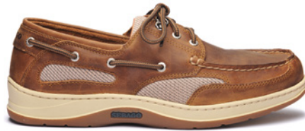
922 BROWN CINNAMON