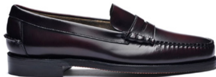
903 BROWN BURGUNDY