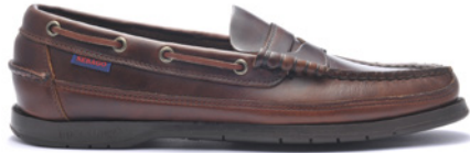
925 BROWN GUM

SIZES: 6 6.5 7 7.5 8 8.5 9 9.5 10 10.5 11 11.5 12 12.5 13