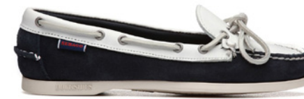
A1Z NAVY WHITE