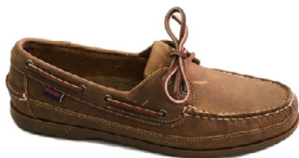
912 BROWN TAN

SIZES: 6 6.5 7 7.5 8 8.5 9 9.5 10 10.5 11 11.5 12 12.5 13 13.5