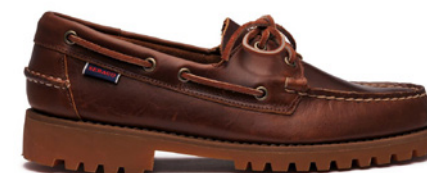
925 BROWN GUM