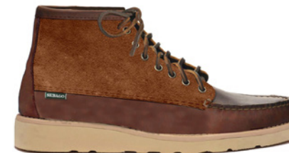
A5S BROWN-BROWN COGNAC