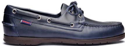
978 BLUE NAVY GUM

SIZES: 6 6.5 7 7.5 8 8.5 9 9.5 10 10.5 11 11.5 12 12.5 13