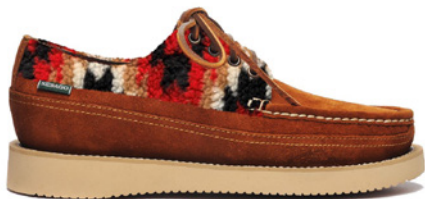
A8A BROWN COGNAC- NAVAJO

SIZES: 6 6.5 7 7.5 8 8.5 9 9.5 10 10.5 11 11.5 12 12.5 13 13.5 14 14.5 15