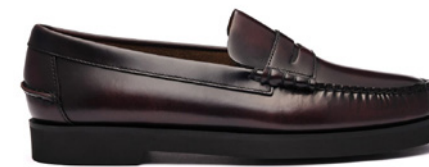
903 BROWN BURGUNDY