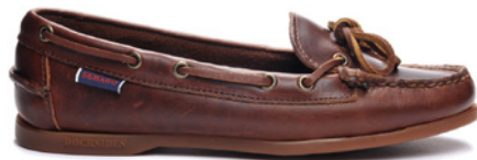
925 BROWN GUM

SIZES: 5 5.5 6 6.5 7 7.5 8 8.5 9 9.5 10 10.5 11