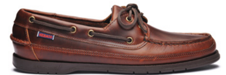
925 BROWN GUM