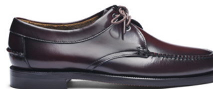
903 BROWN BURGUNDY

SIZES: 6 6.5 7 7.5 8 8.5 9 9.5 10 10.5 11 11.5 12 12.5 13 13.5 14 14.5 15