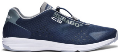
908 BLUE NAVY

SIZES: 6 6.5 7 7.5 8 8.5 9 9.5 10 10.5 11 11.5 12 12.5 13