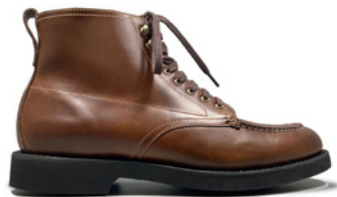
901 DK BROWN

SIZES: 6 6.5 7 7.5 8 8.5 9 9.5 10 10.5 11 11.5 12 12.5 13 13.5 14 14.5 15