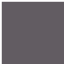
SILVER GREY 109