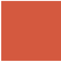
BURNT ORANGE 181