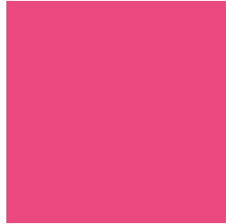
SHOCKING PINK 113