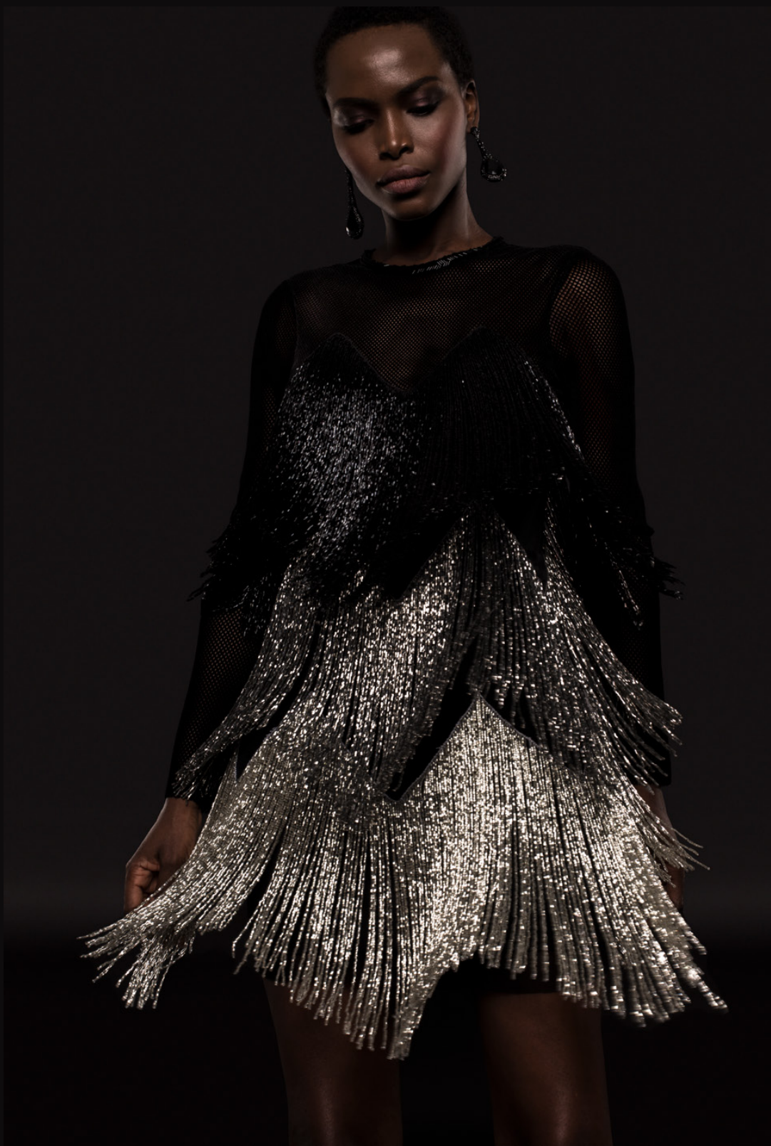
Silver ombre beaded fringe dress