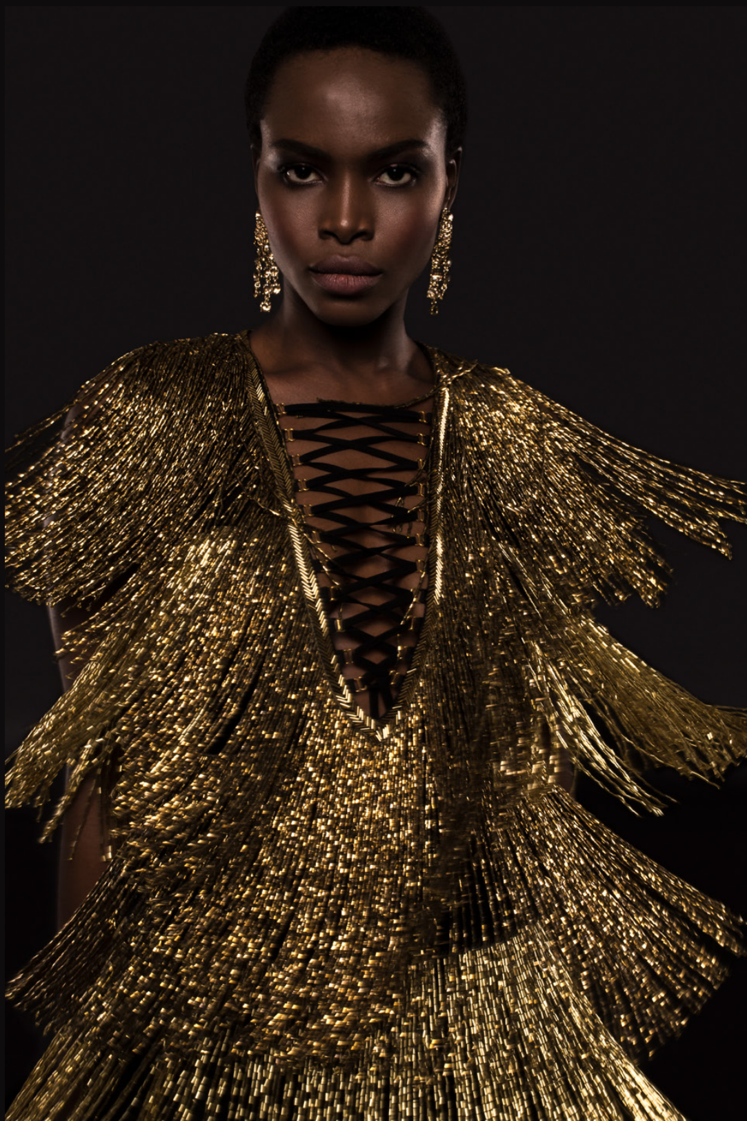
Beaded fringe party dress