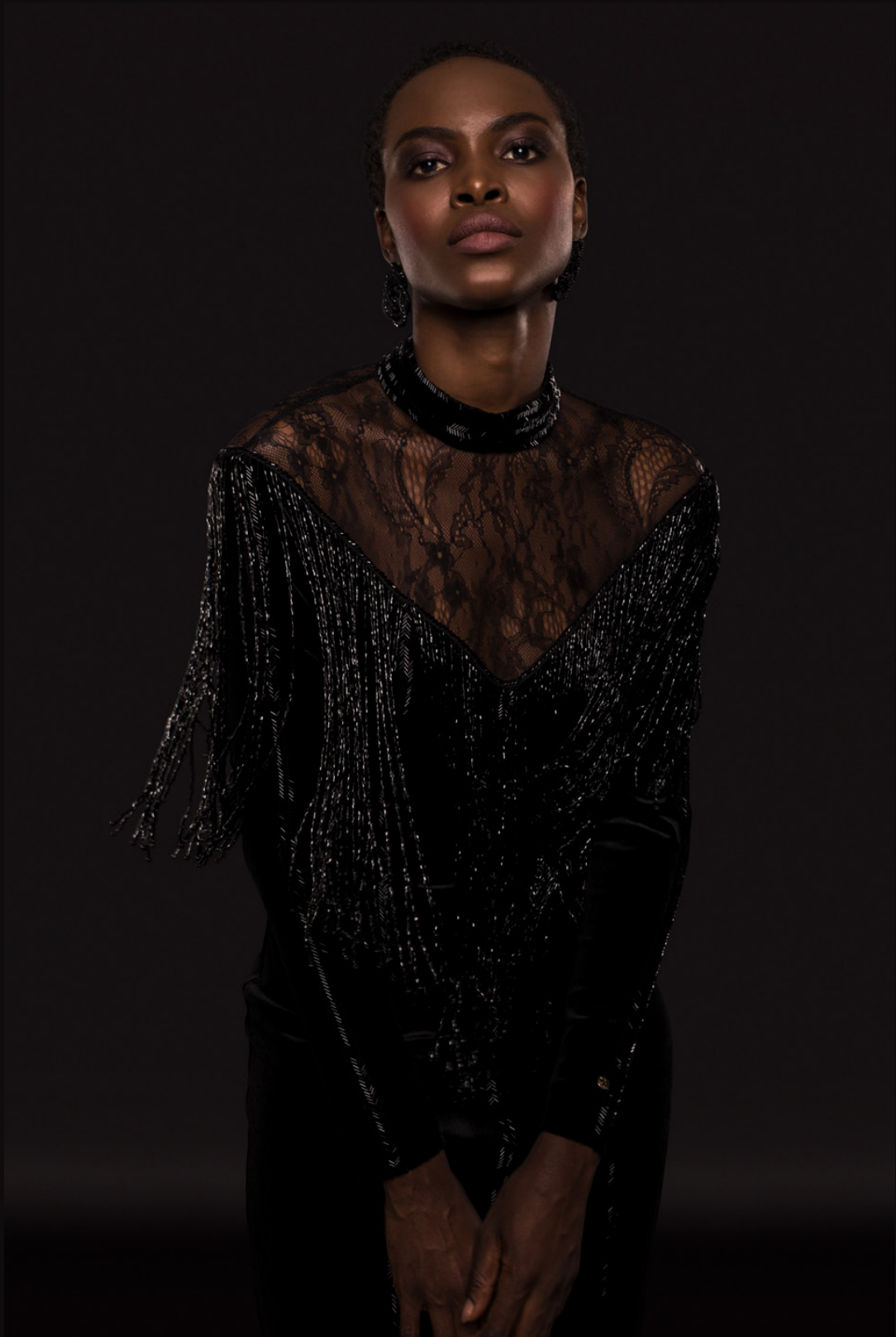
Velvet midi dress with beaded fringe & lace