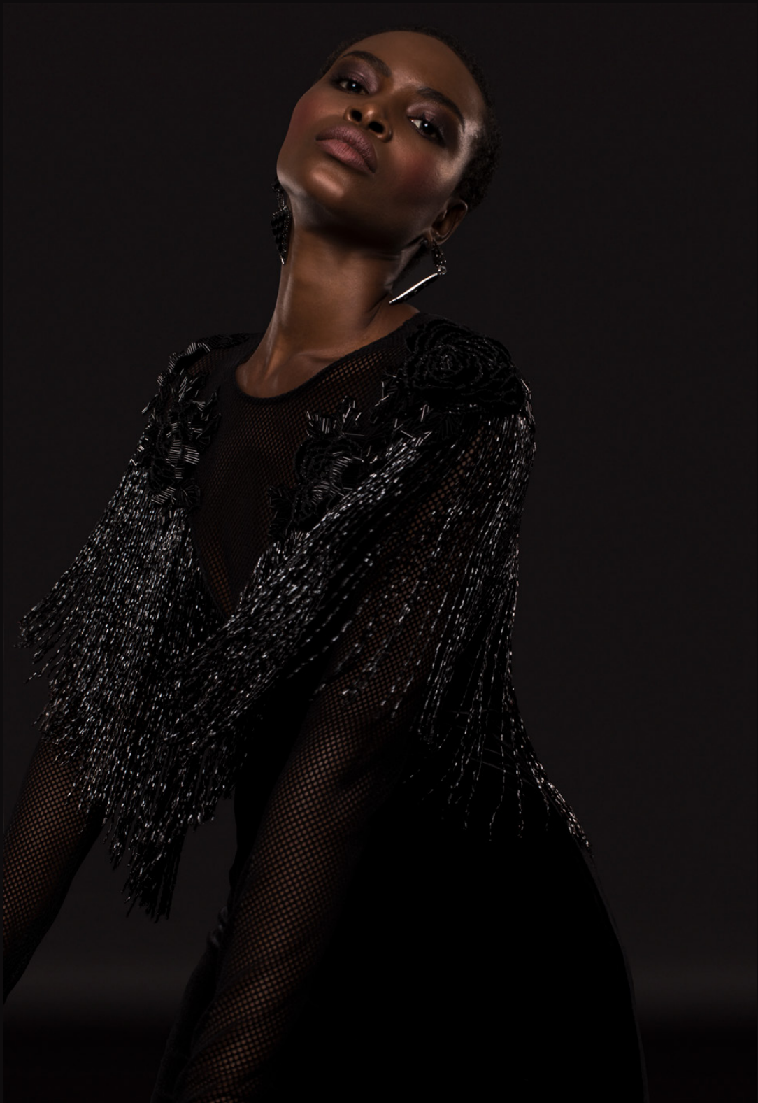
Velvet jumpsuit with beaded fringe & flowers