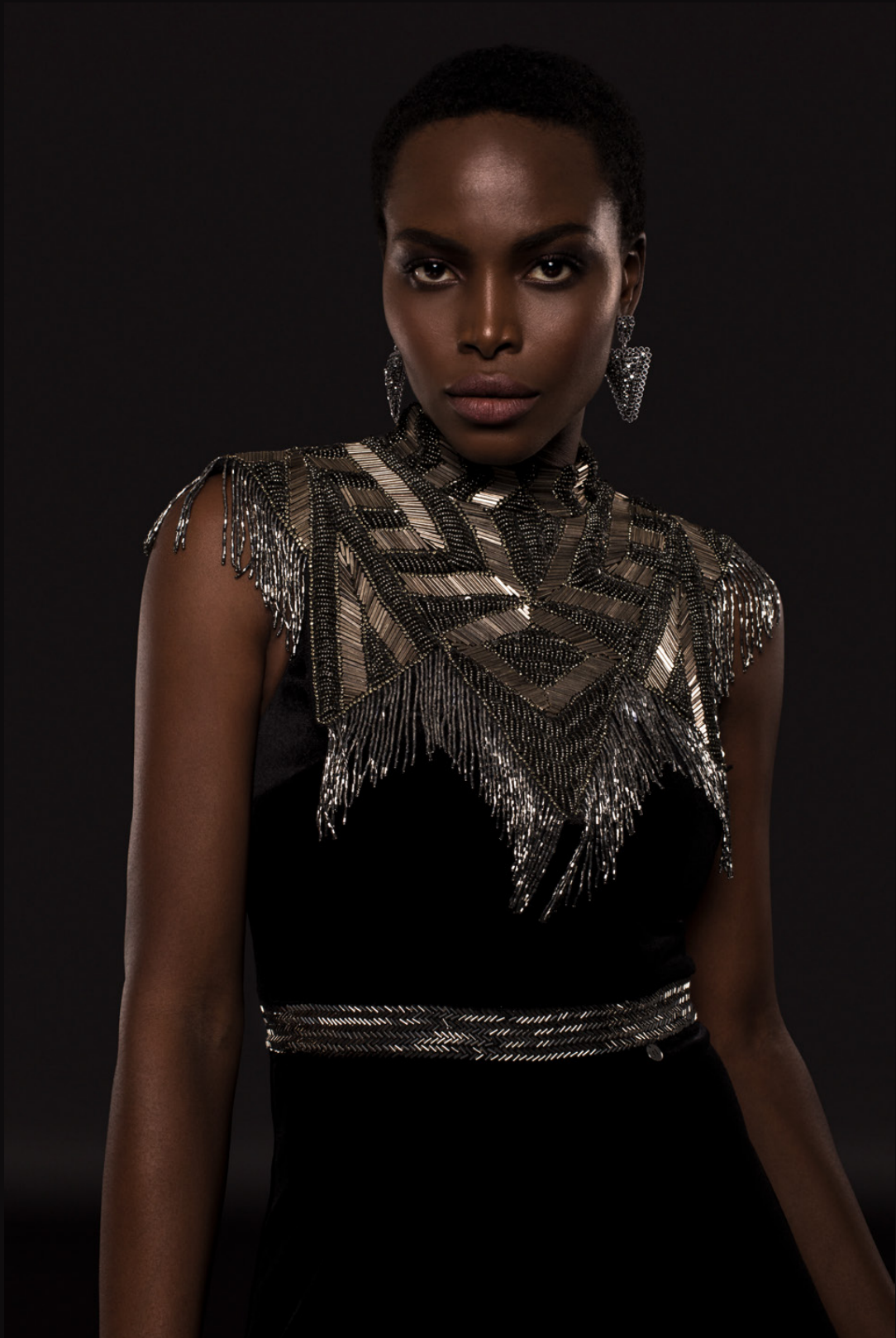
Silver bead embellished collar jumpsuit