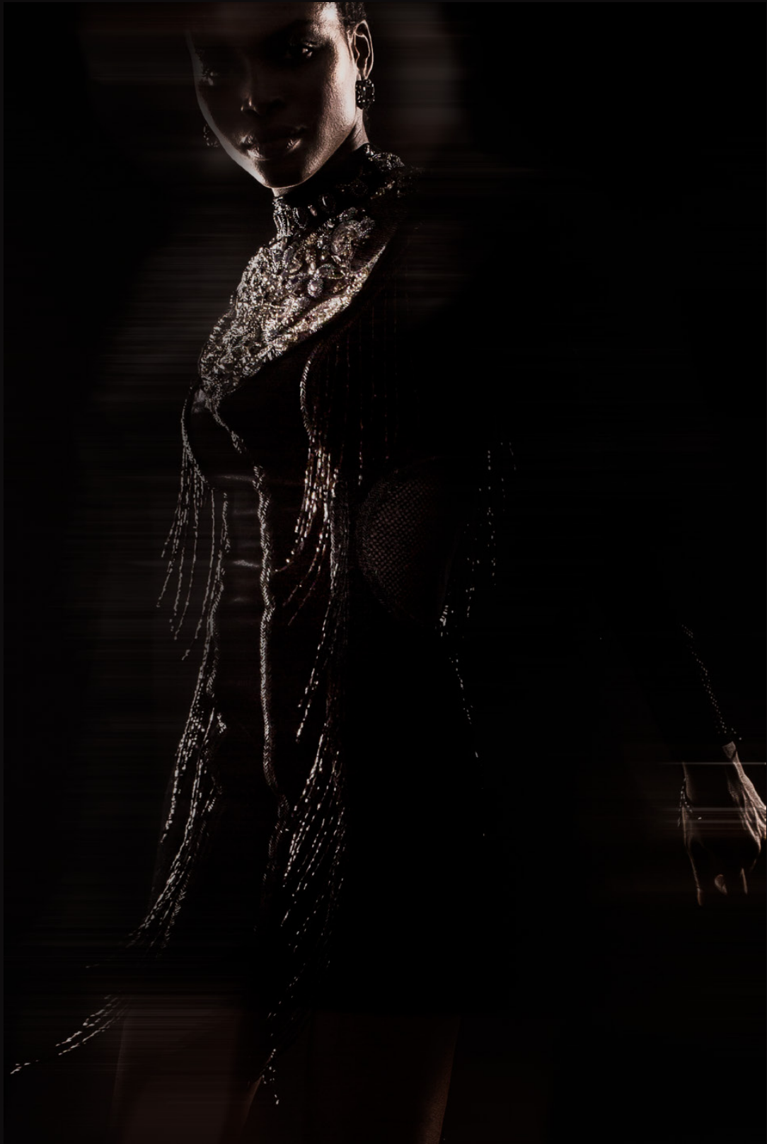
Velvet mini dress with handmade beading & fringes