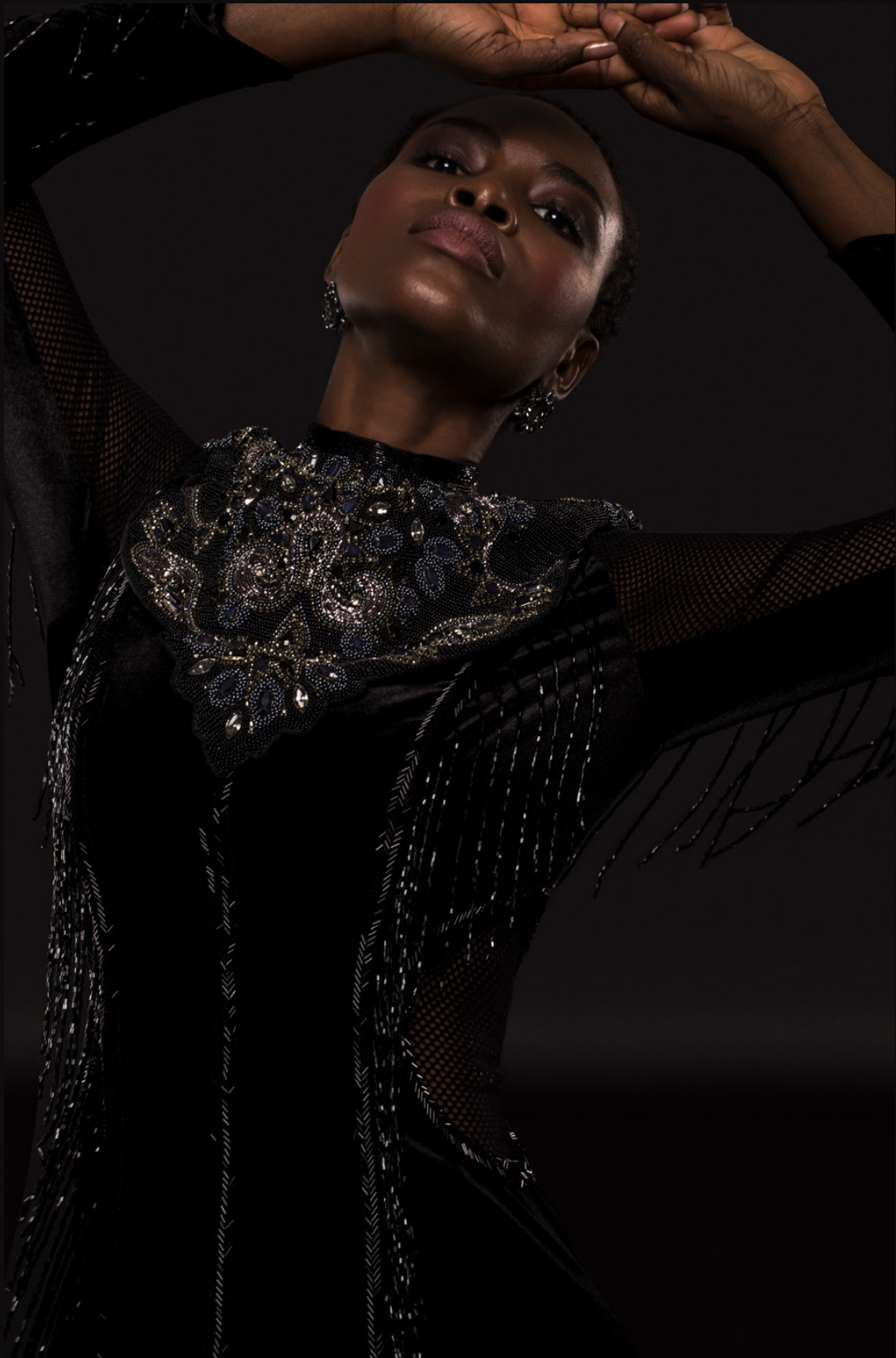
Beaded fringe party dress