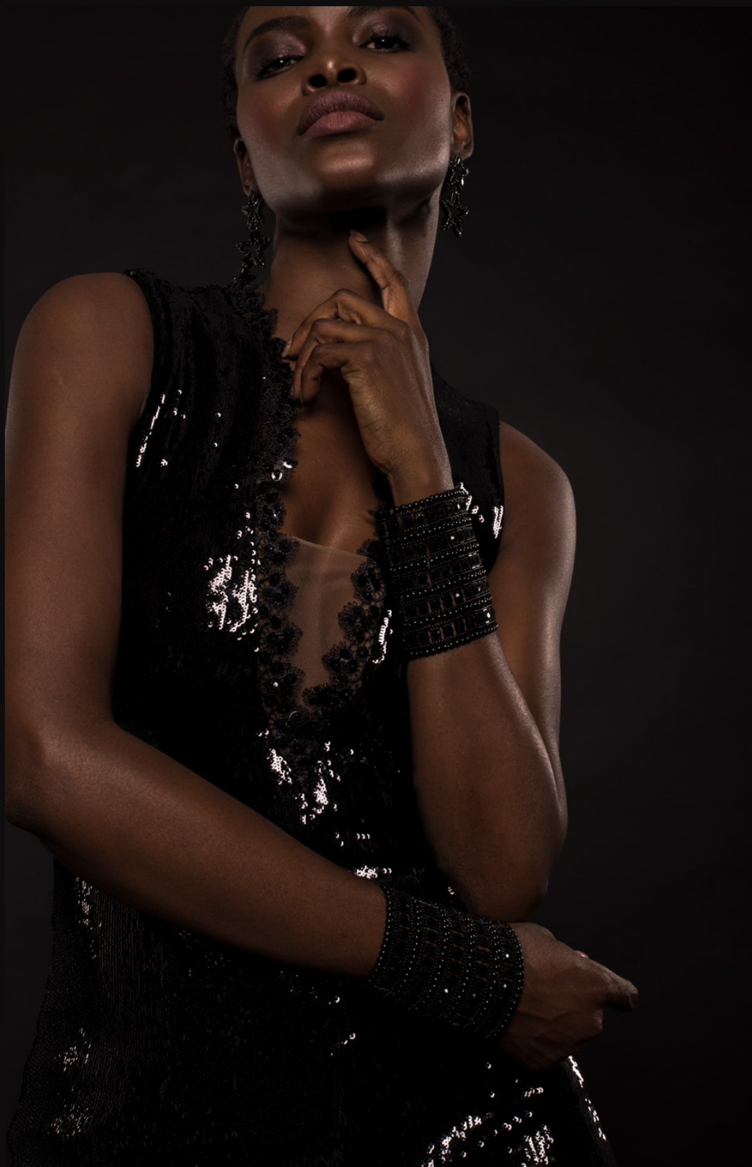
Black sequin jumpsuit