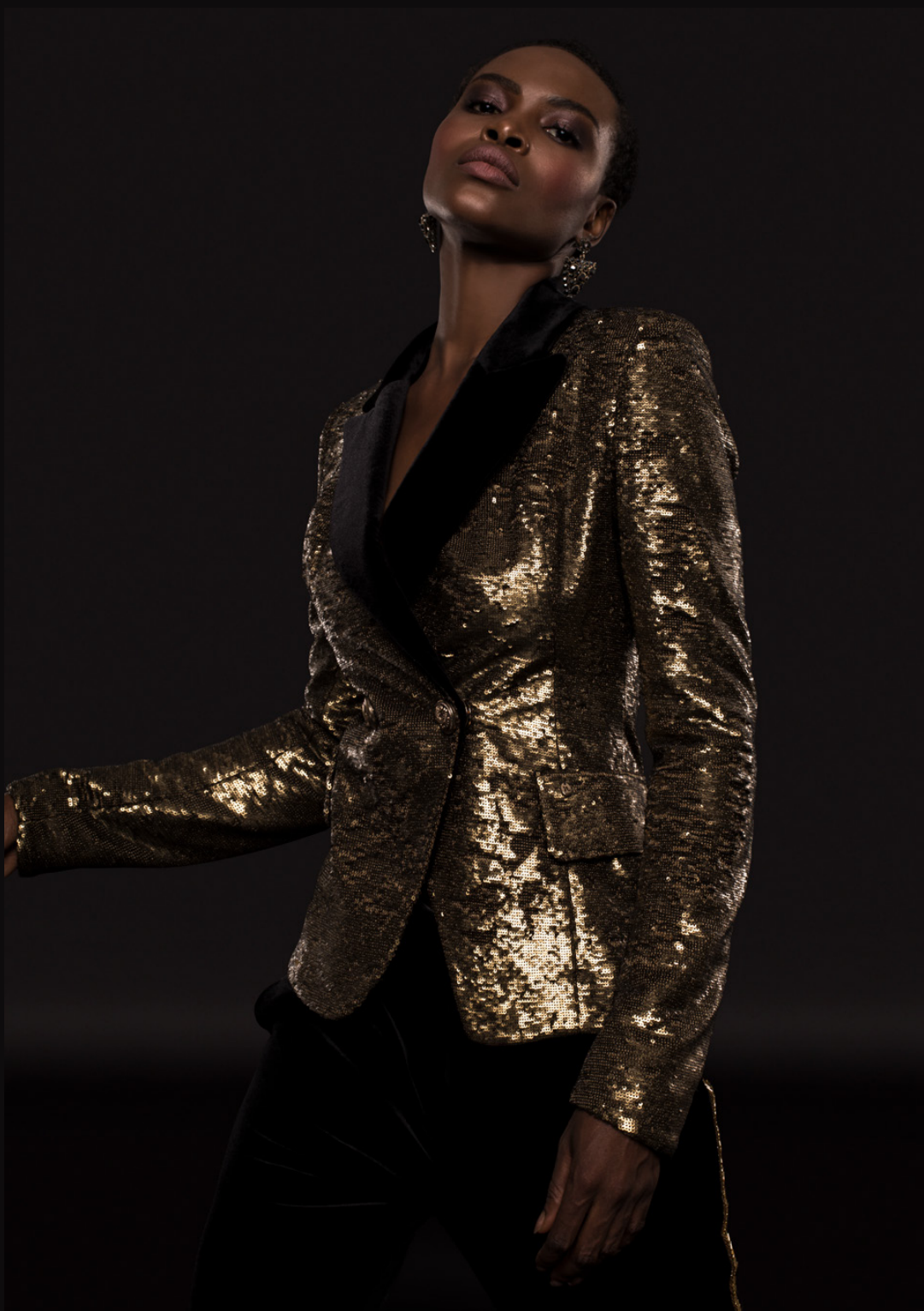
Antique gold blazer with velvet lapel Velvet slim pants with antique gold side stripe