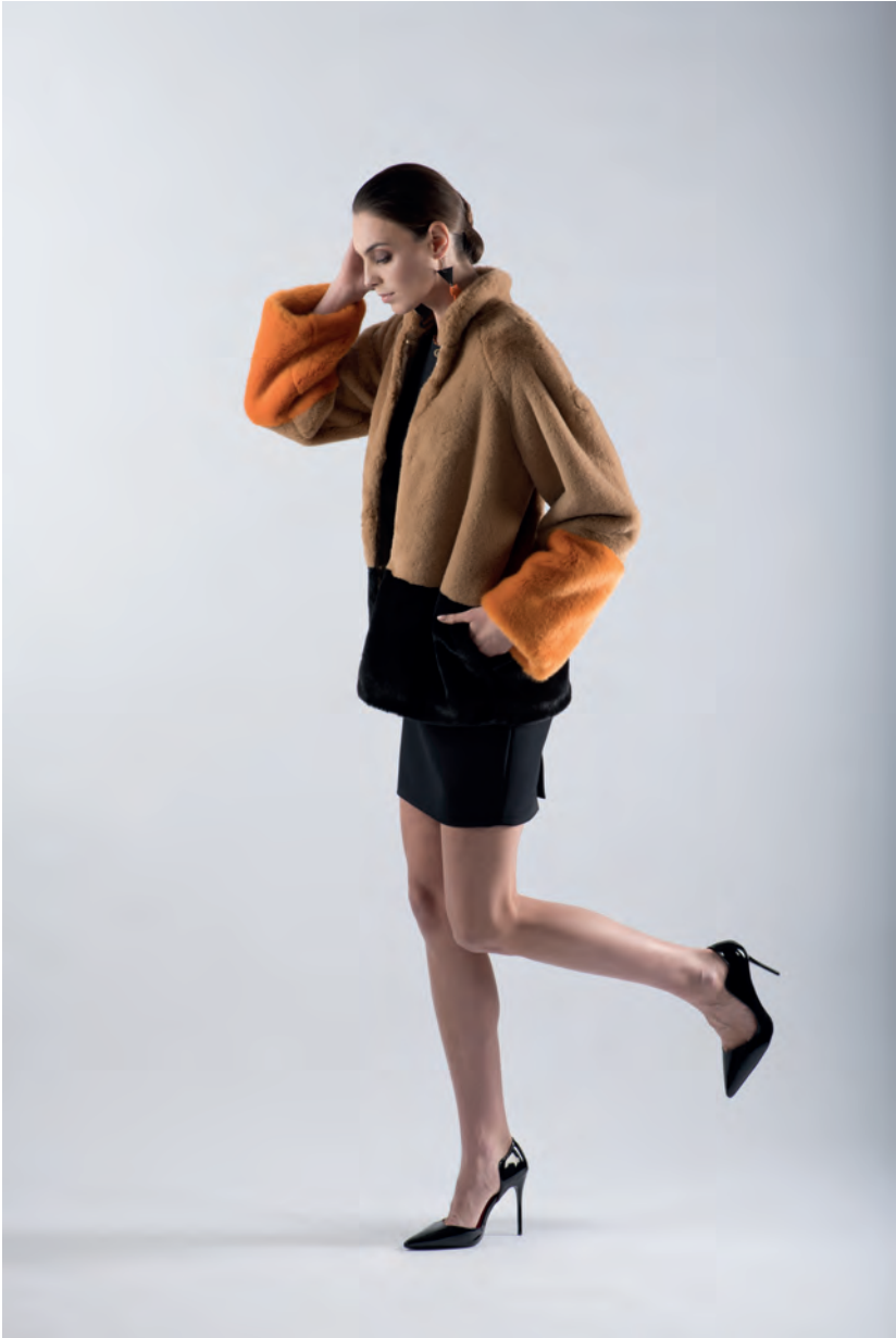
Ecological Fur PL3200 Dress AT214 Earrings CHEETAH