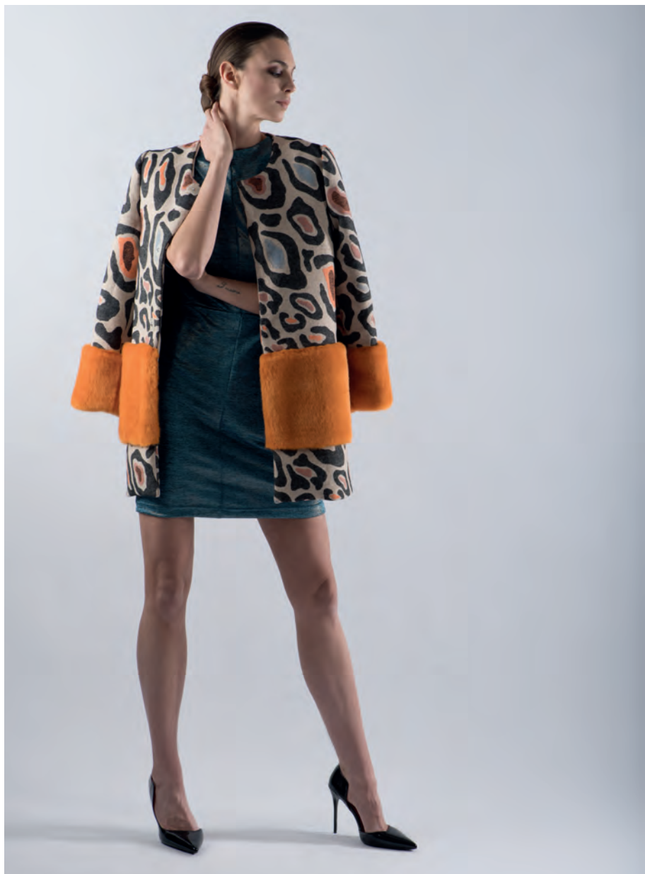
Coat CPL230 Dress ABJ226