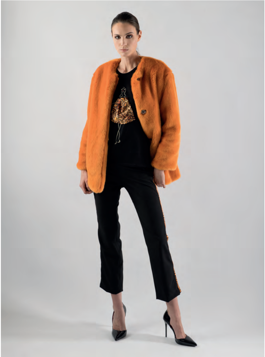
Ecological Fur PLS201 T-shirt TSL 206 Trousers PT213