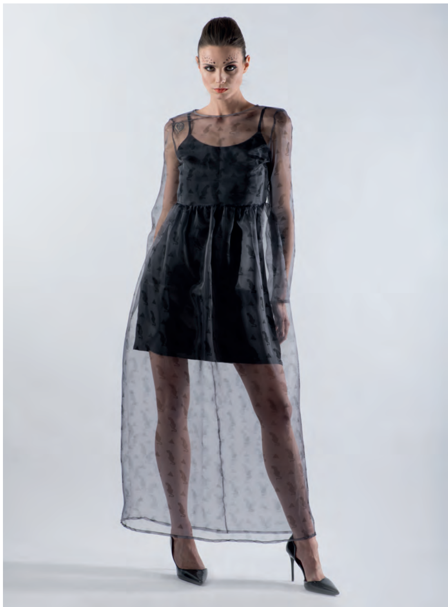
Dress ABT223 Shirt CTT221