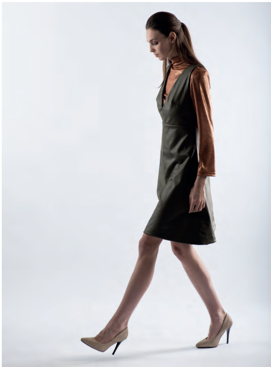
Turtleneck DVJ226 Dress AL218