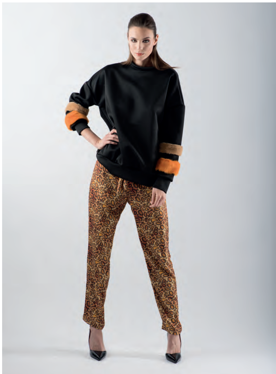
Sweatshirt FEP219 Trousers PLT212