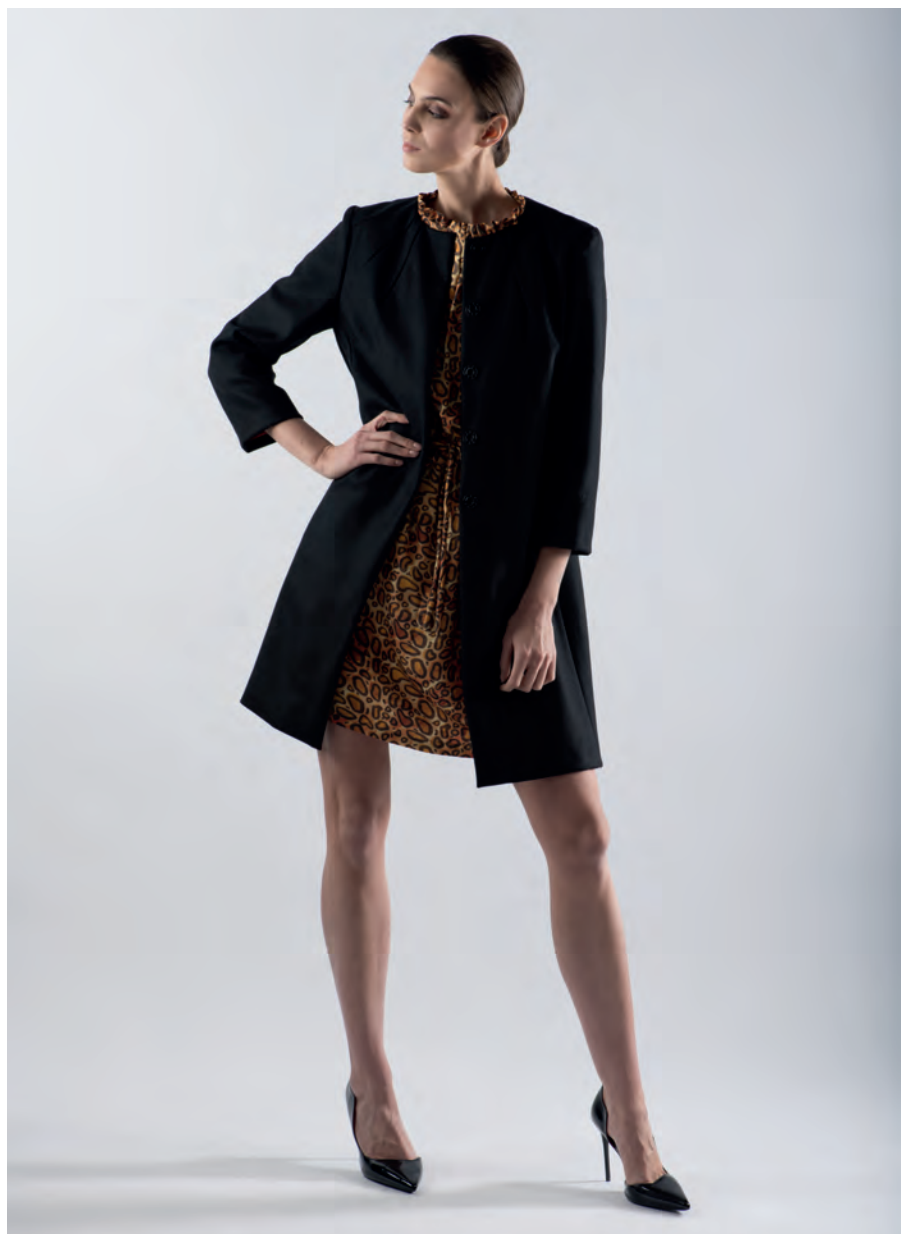
Coat CPT207 Dress ABL210