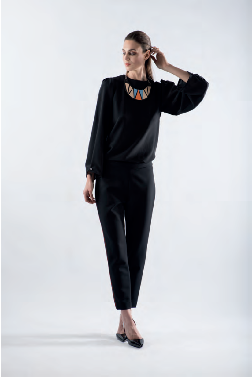
Gilet GLM203 Blouse BL208 Trousers PT213