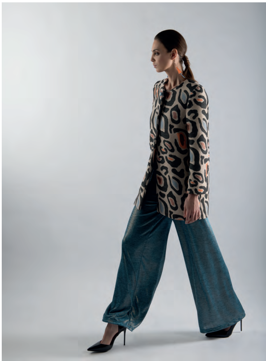
Coat CPL217 Trousers PPJ227