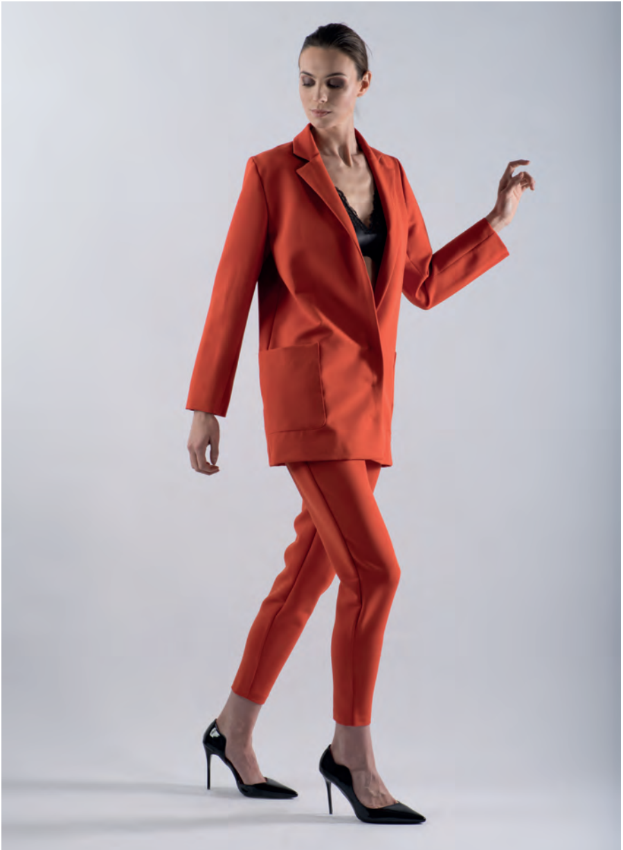
Jacket GC215 Blouse CLT211 Trousers PT216