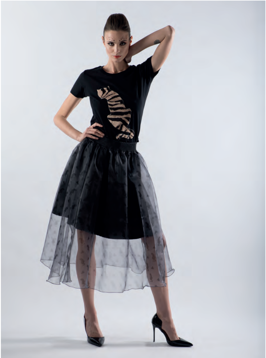
T-shirt TSL206 Skirt GNT222