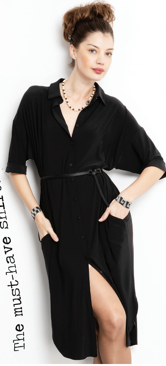
The must-have shirtwaister