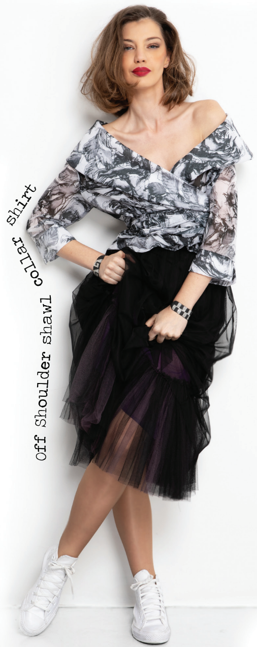
Off shoulder shawl collar shirt