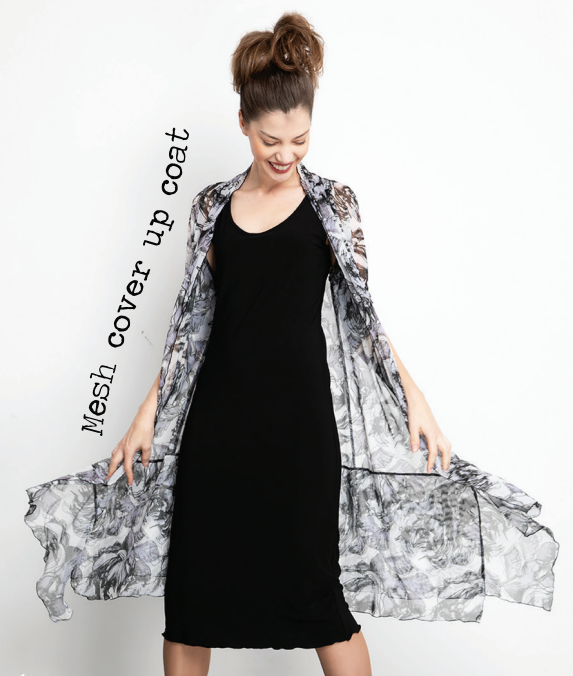
Mesh cover up coat