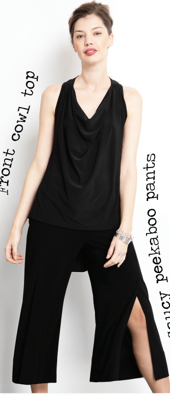
saucy peekaboo pants