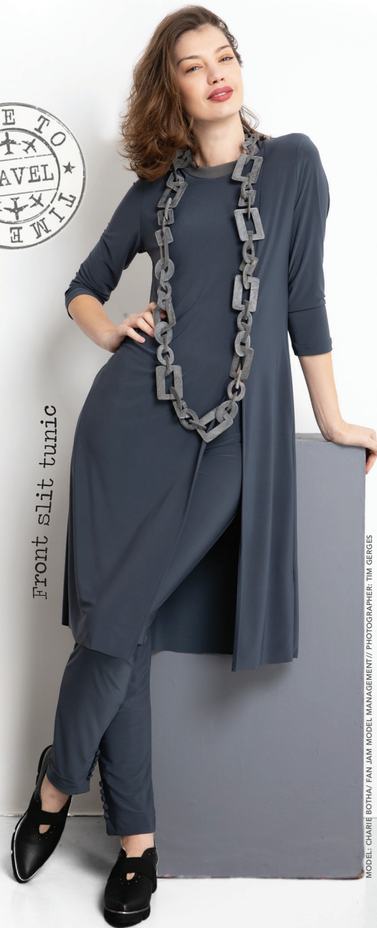
Front slit tunic