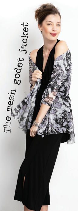
The mesh godet jacket

HABITS CORE TRAVEL RANGE IS MADE OF JERSEY LYCRA, ROLLS UP IN A BALL, SKIMS THE BODY BEAUTIFULLY, IS LOW-CREASE AND BEST OF ALL - DELIVERIES ALL YEAR ROUND. AVAILABLE IN BLACK, NAVY AND SMOKE OUR MOTTO IS "BUY NOW, WEAR FOREVER!"