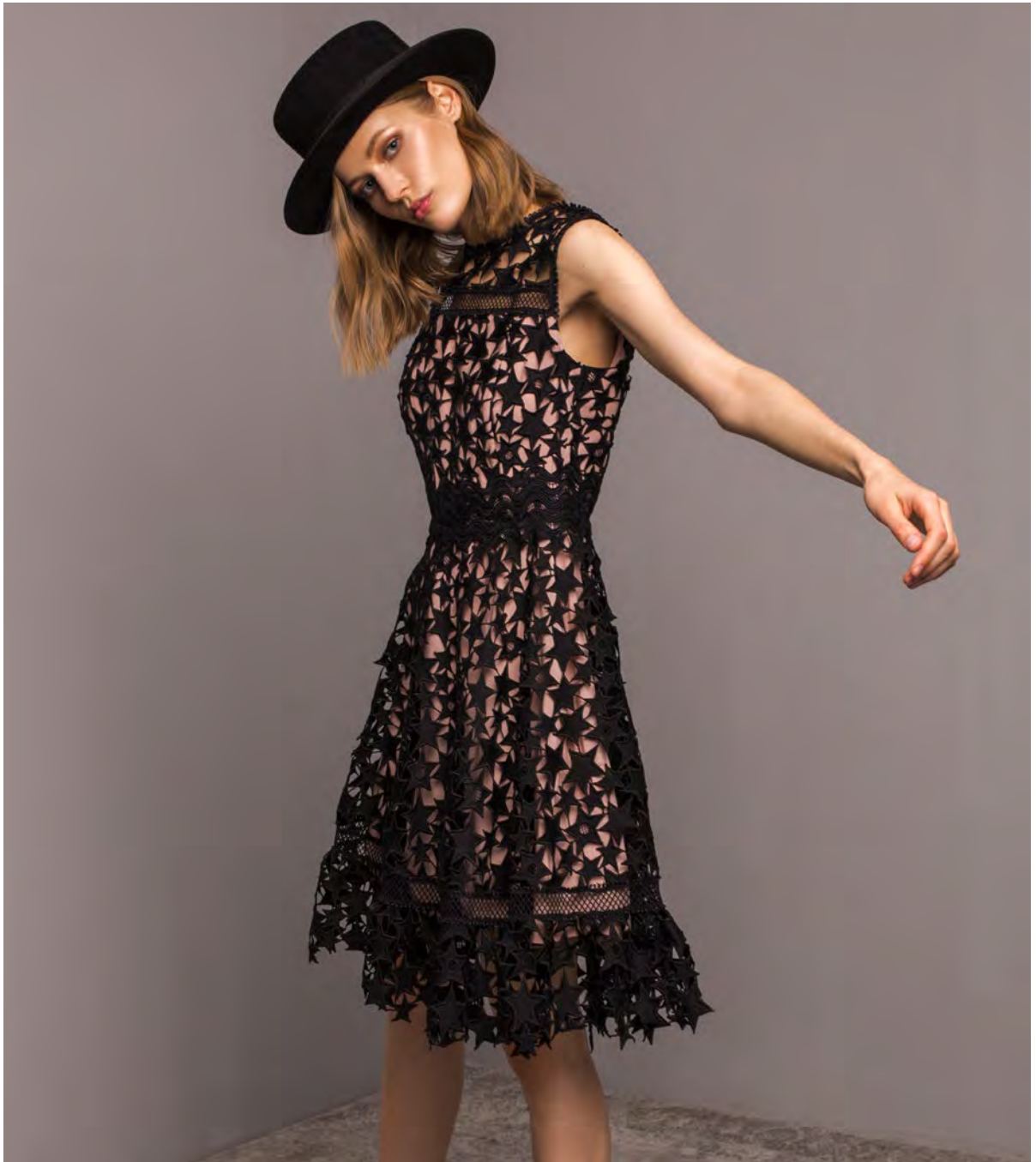
Star lace midi dress