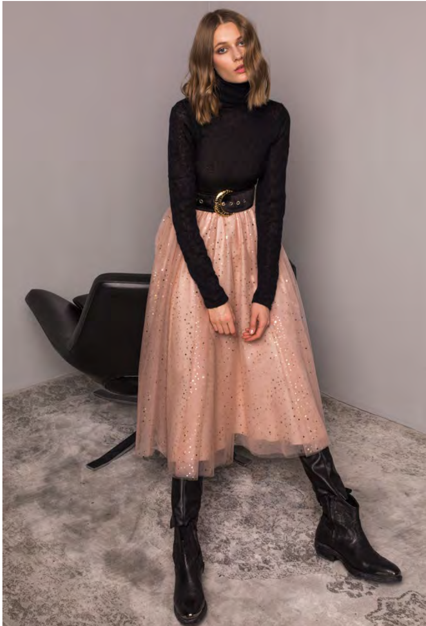
Tulle midi skirt with golden stars Velvet belt with golden buckle