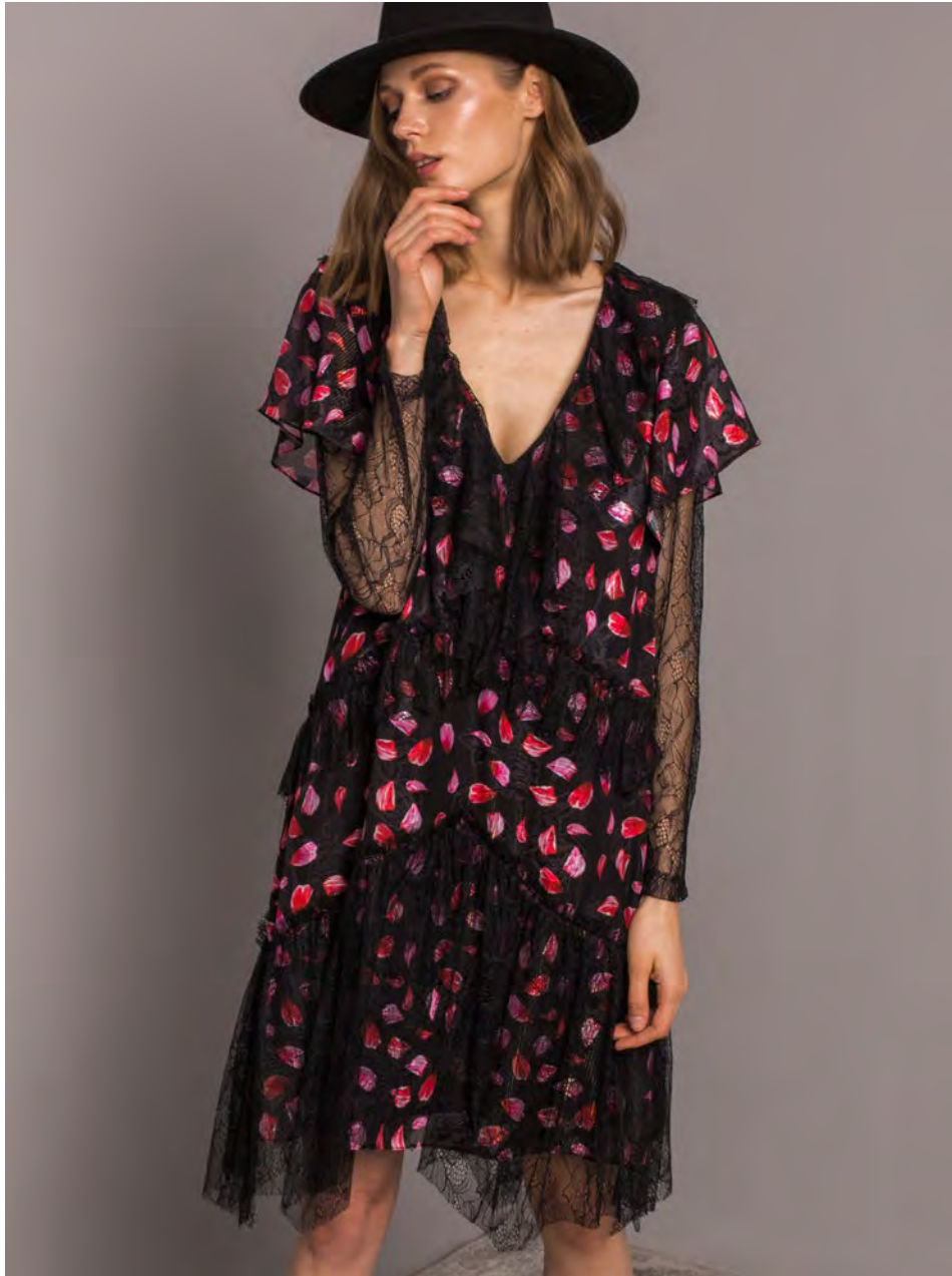
Printed veil short dress with lace details