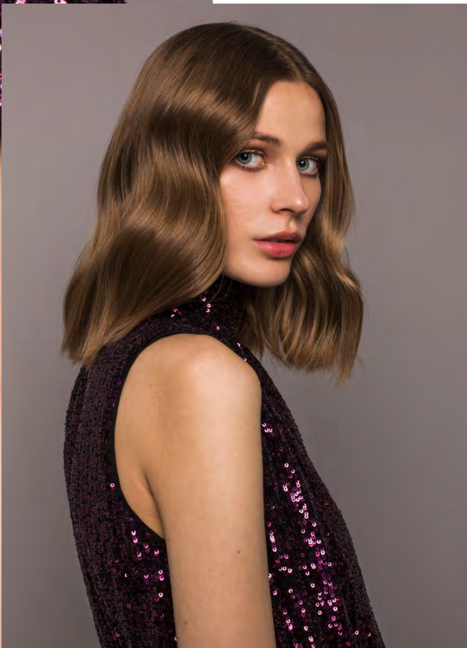
Velvet belt with crystal buckle Sequined purple jumpsuit with scarf