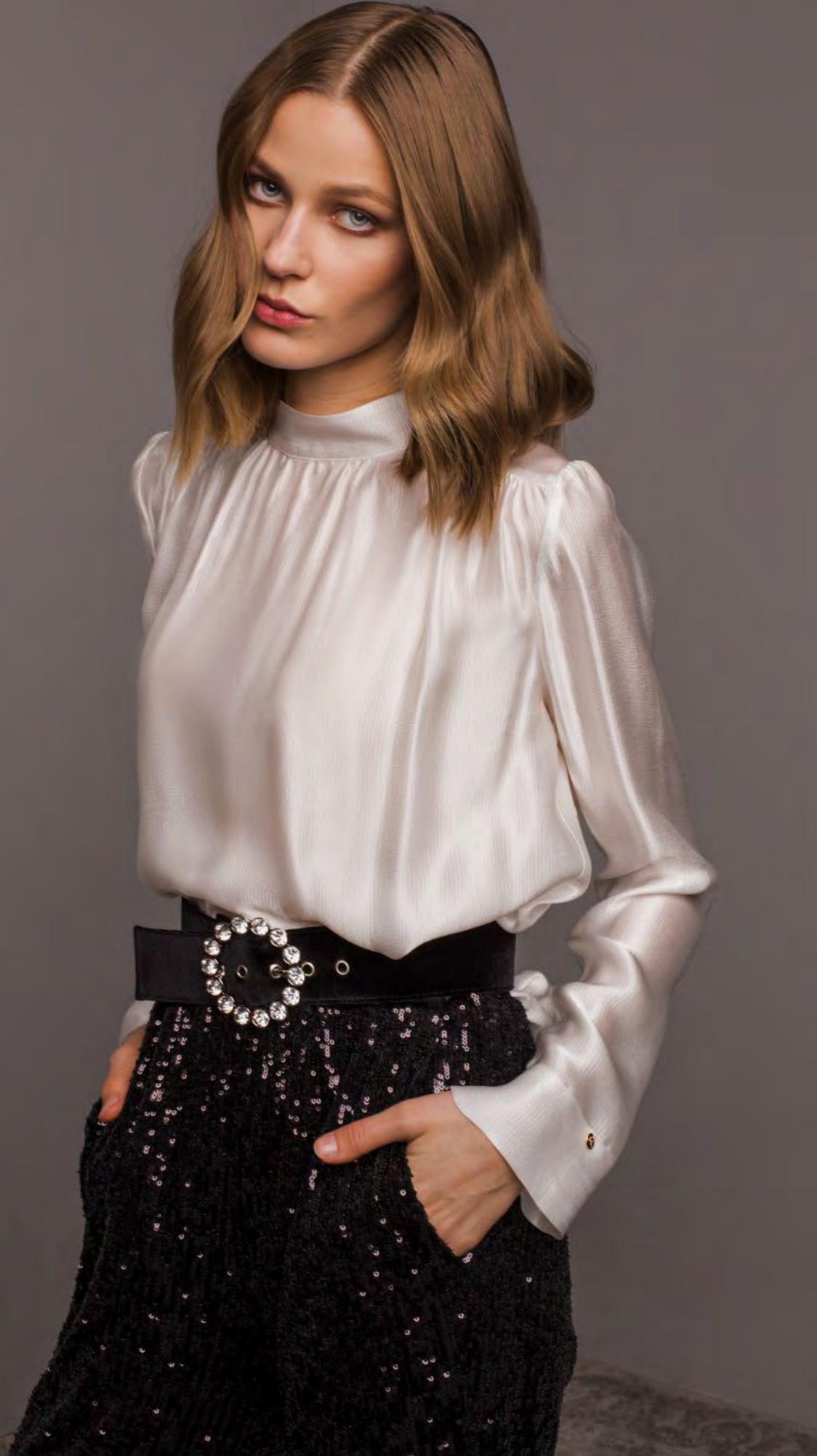
Viscose satin blouse Sequined black pants Velvet belt with crystal buckle