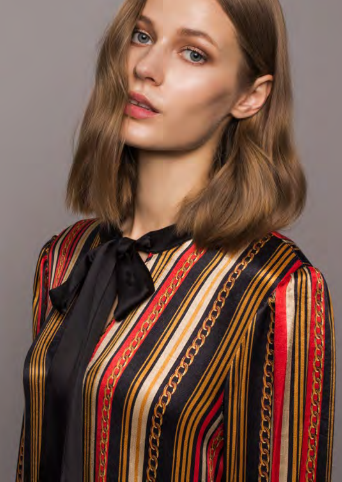
Cupro viscose printed dress with bow detail