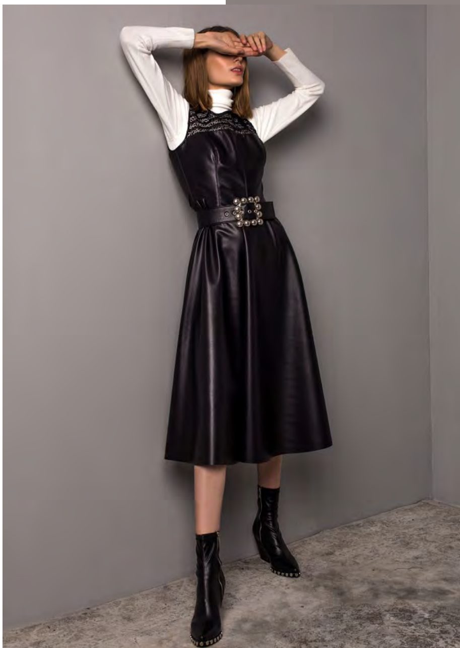
Faux leather flared dress with lace Silver metal buckle belt Faux leather wrap jumpsuit