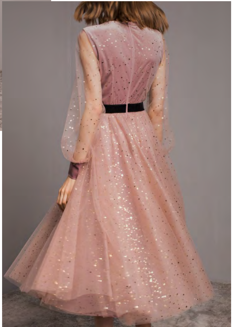
Tulle & velvet midi dress with golden stars