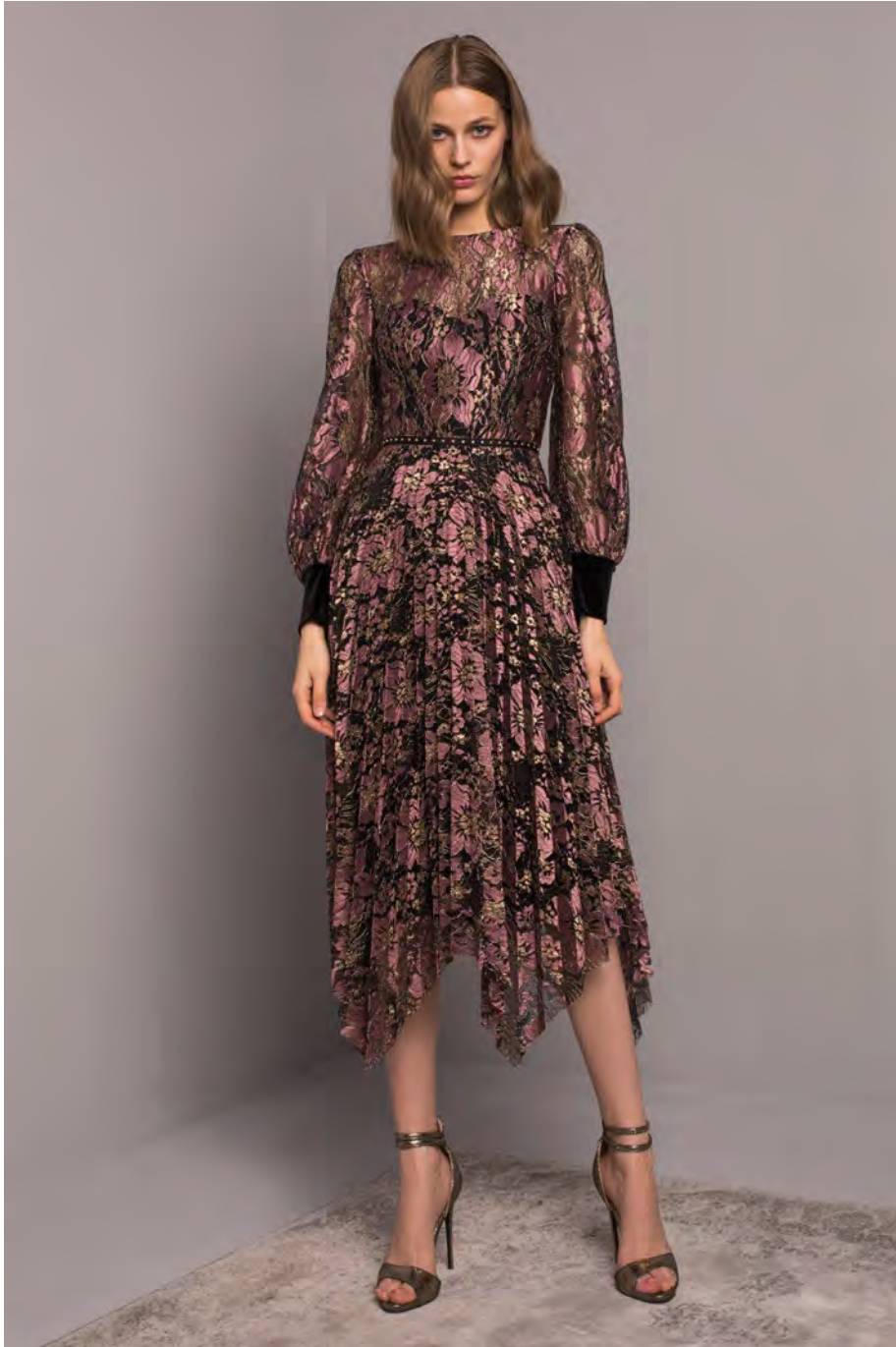
Rose gold lace midi asymmetrical dress