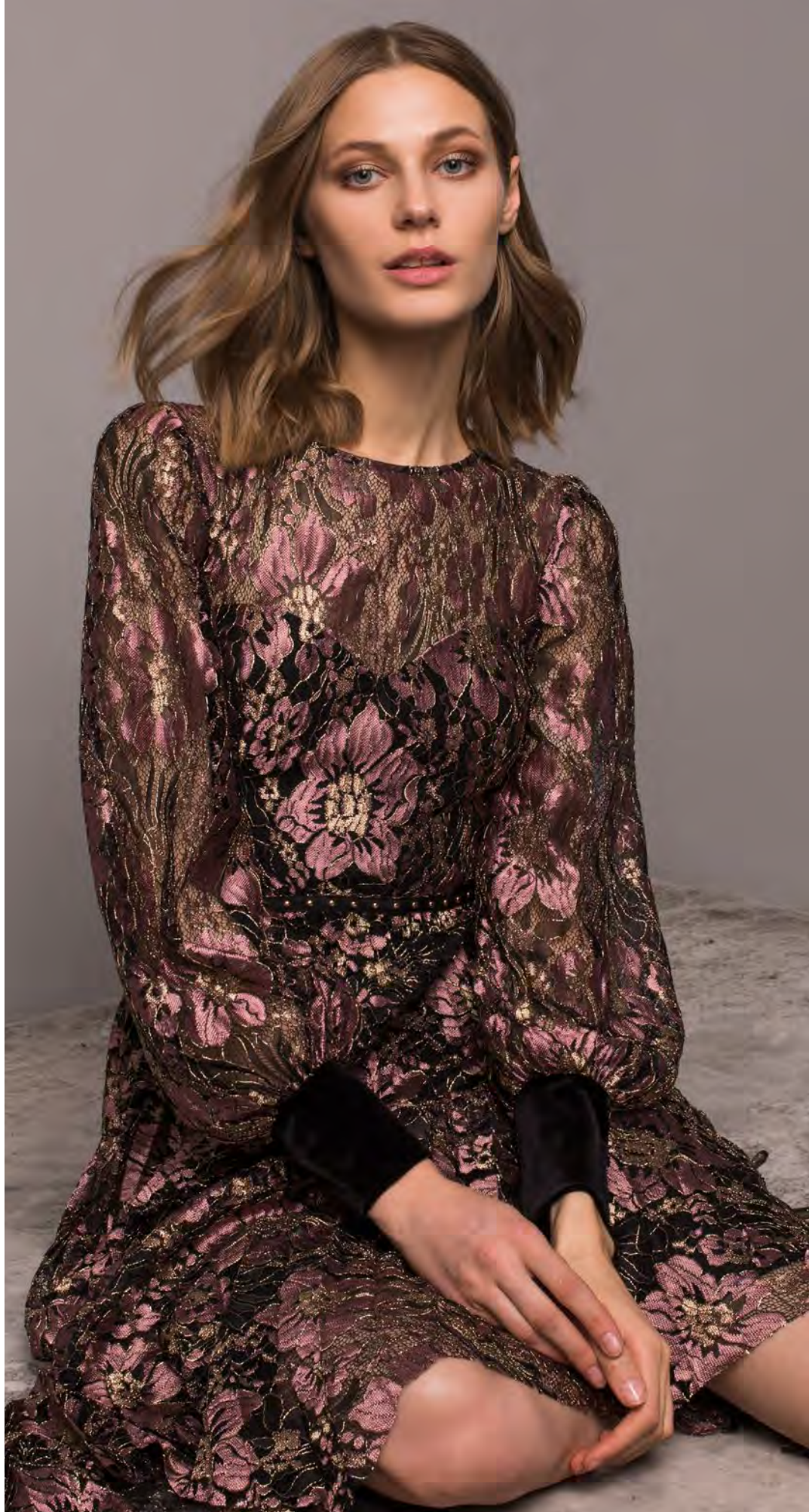
Rose gold lace midi asymmetrical dress