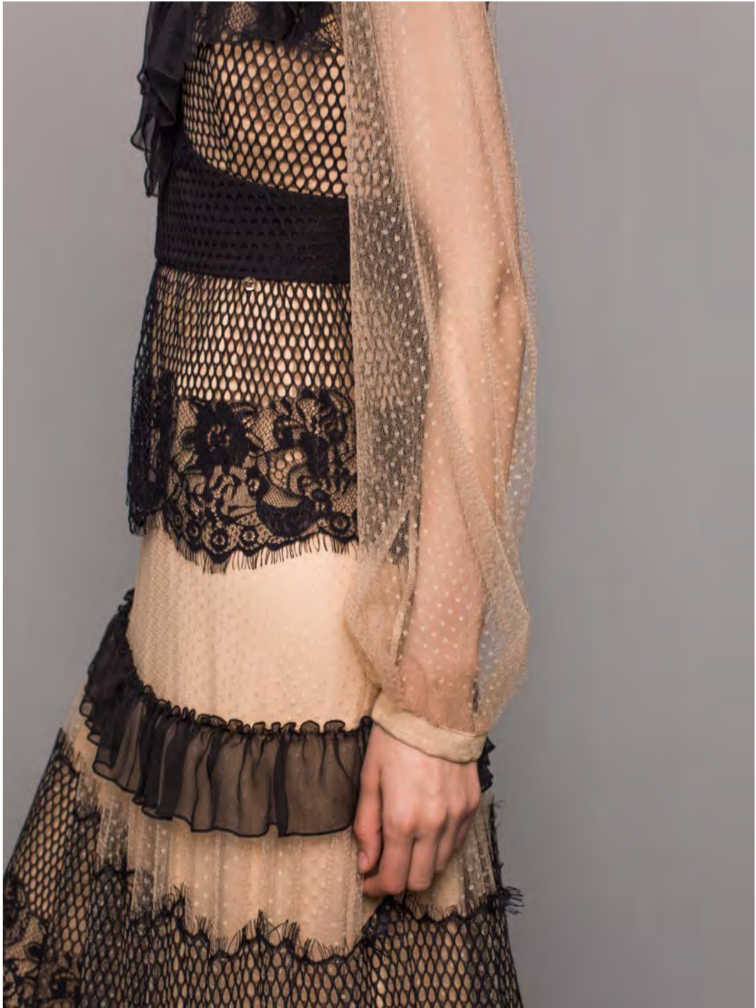
Tiered tulle, lace & silk dress