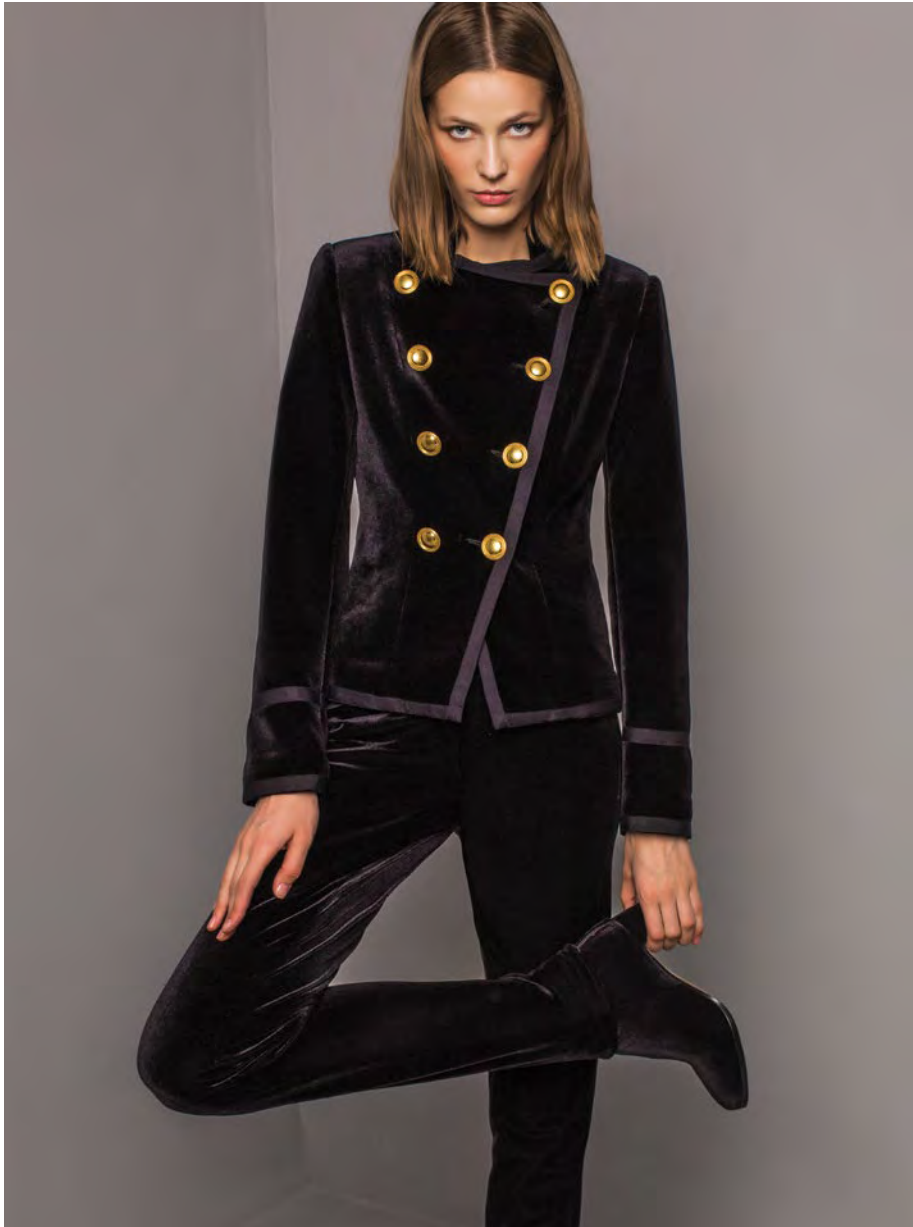
Double breasted velvet jacket Slim velvet pants