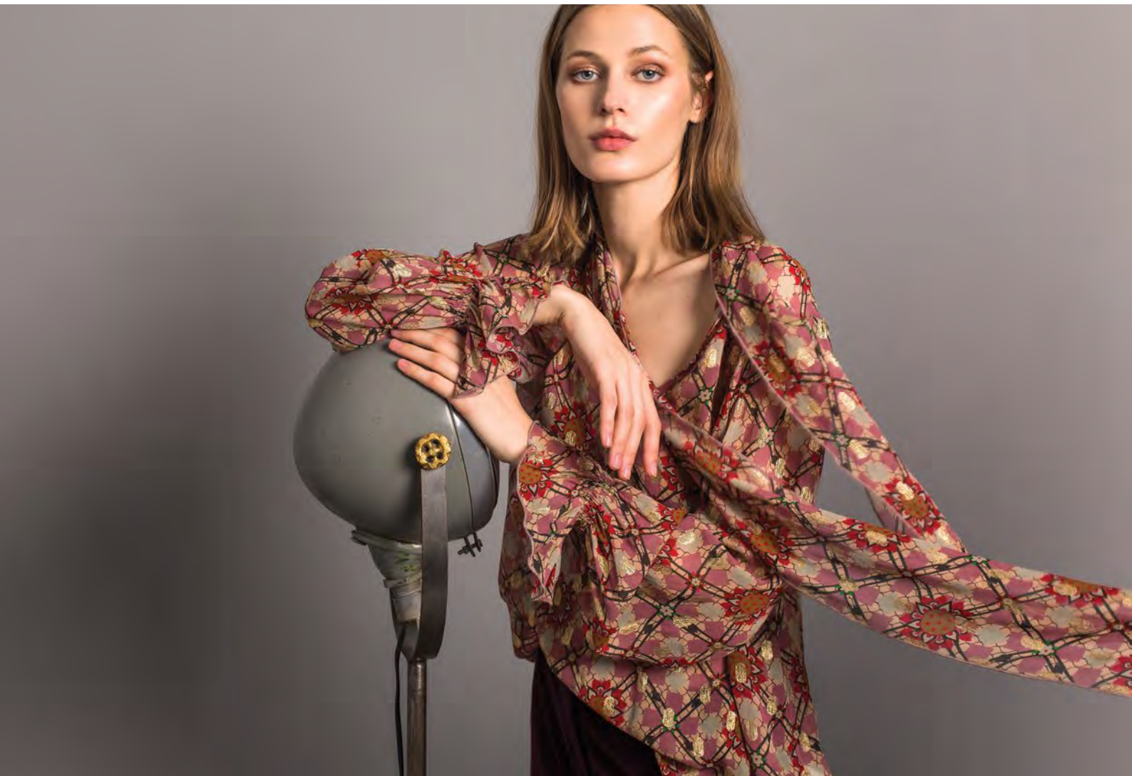
Viscose chiffon blouse with gold details Printed viscose chiffon dress