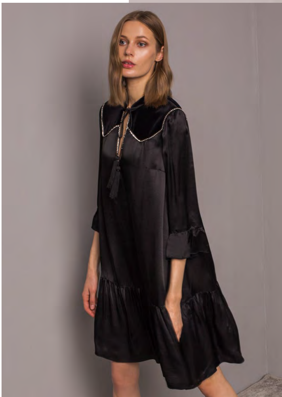
Viscose satin dress with velvet & crystal details