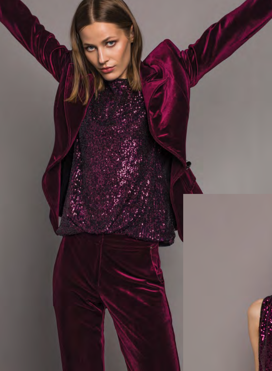
Velvet two-piece suit