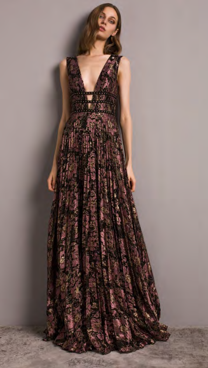
Rose gold lace pleated gown