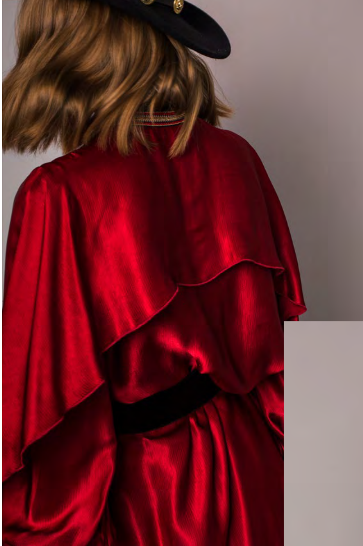
Viscose satin mini dress with tassels