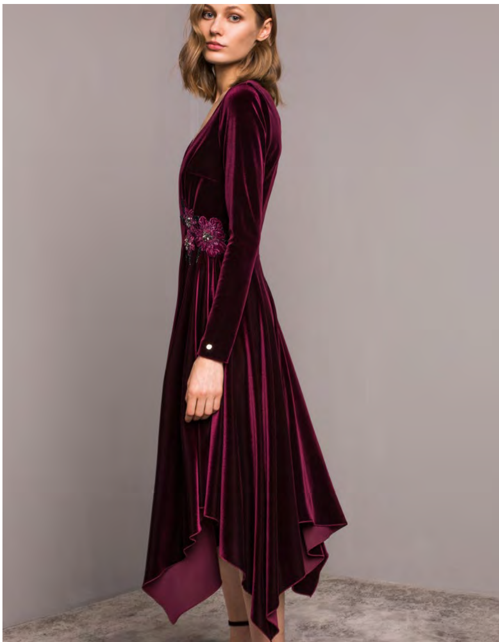
Velvet midi dress with handmade floral applique