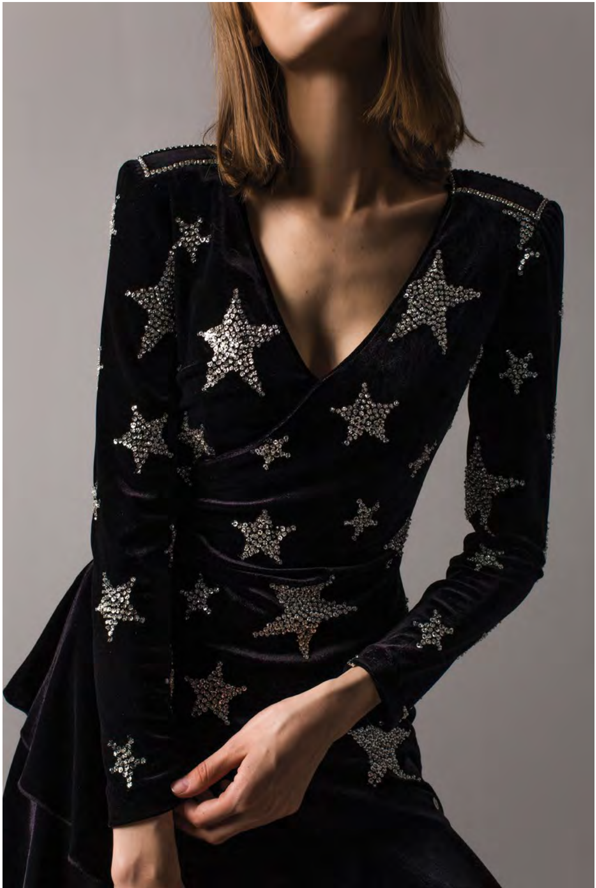
Velvet dress with sequin and crystal embroidery