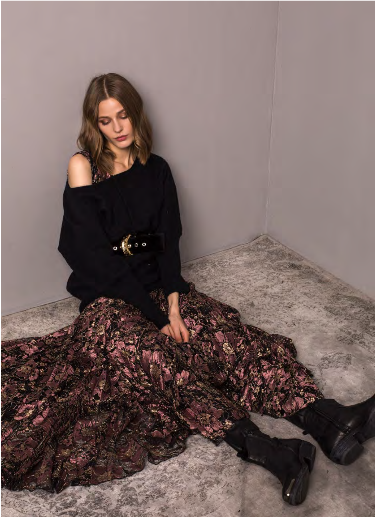
Rose gold lace pleated gown