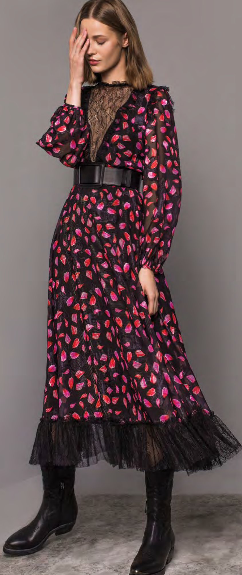
Printed vei midi dress with lace inserts