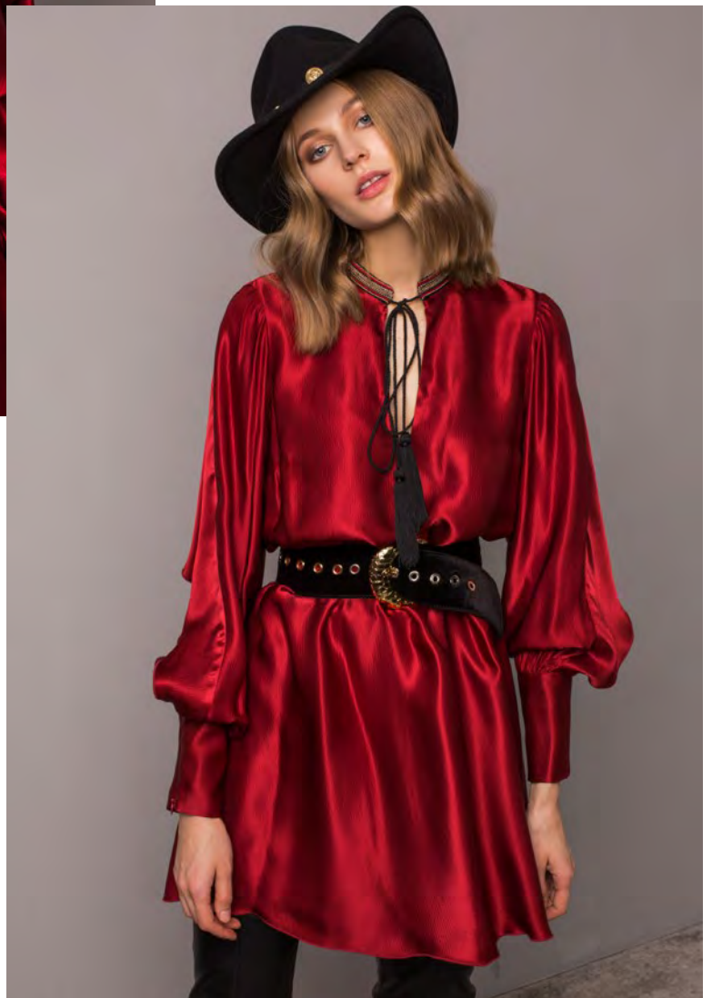
Velvet belt with golden buckle