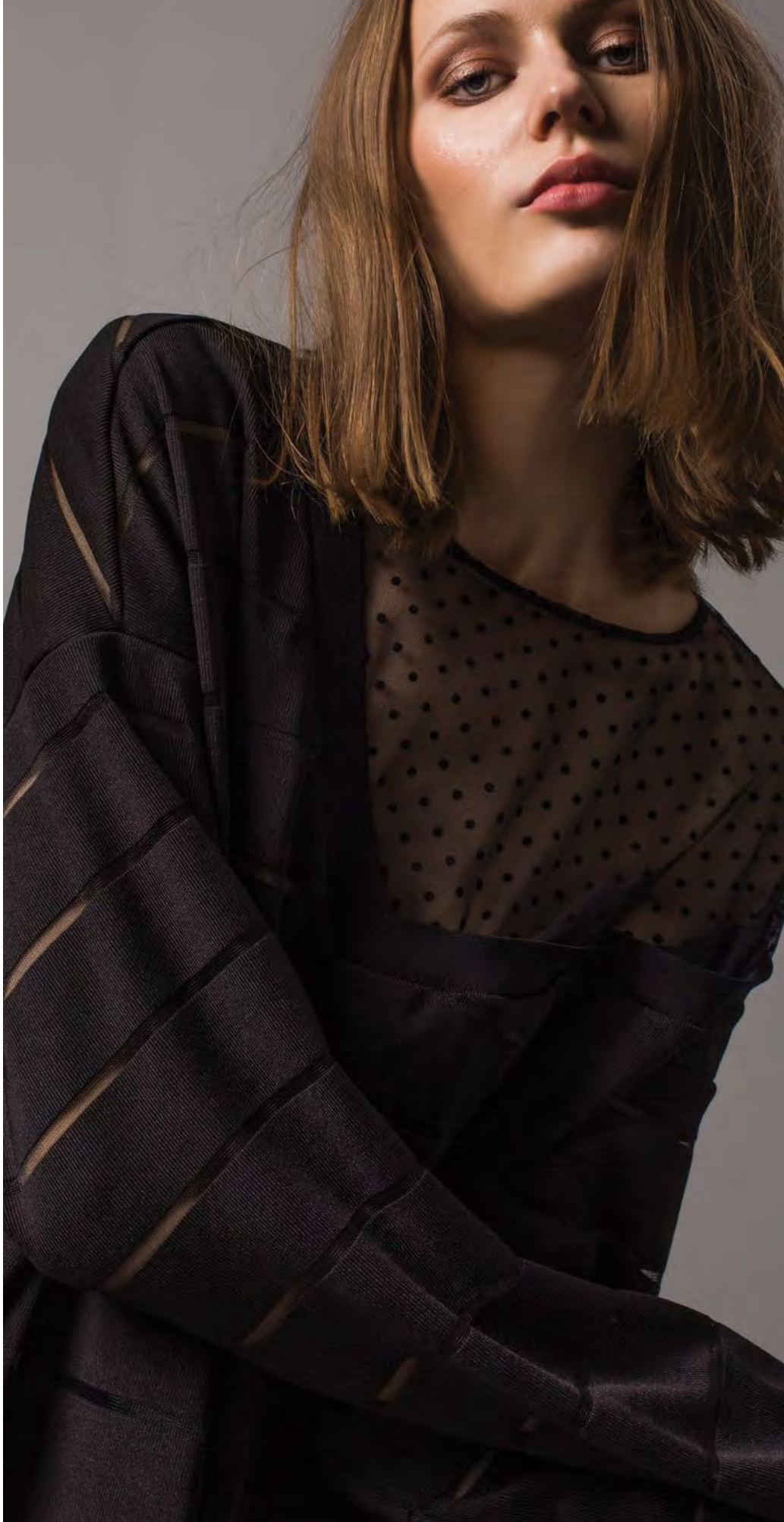
Off-the-shoulder sweatshirt with tulle Tulle & lace asymmetric skirt