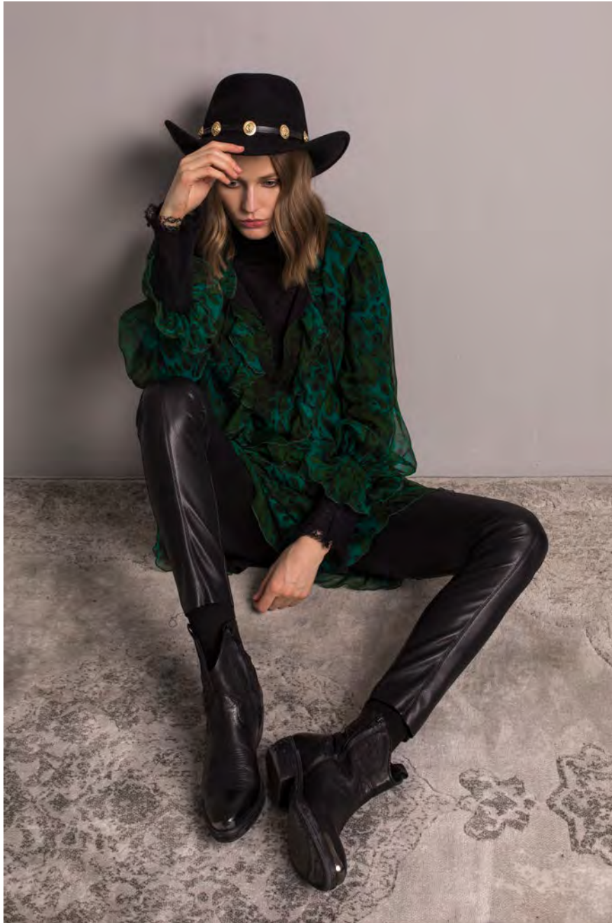
Animal print silk chiffon dress