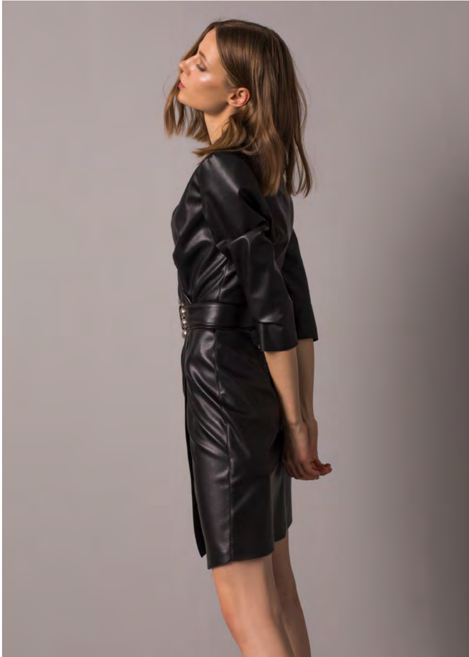
Faux leather mini dress