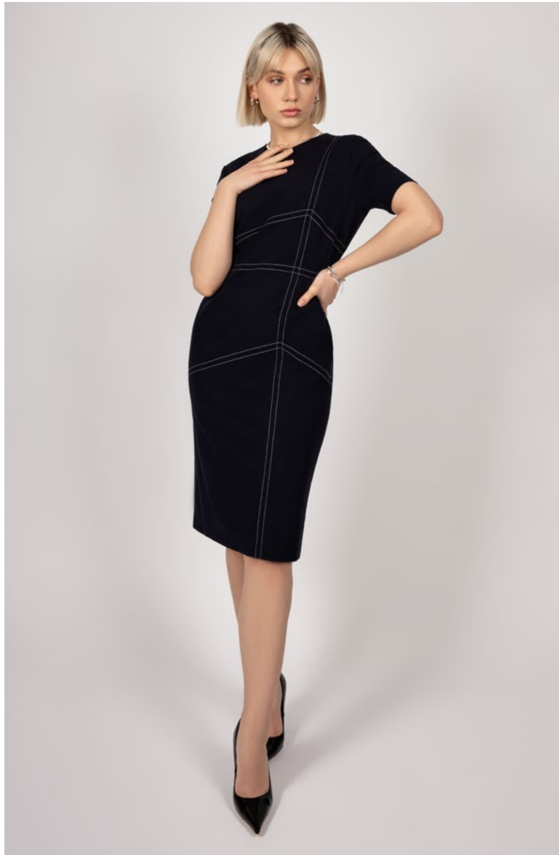
A Night On The Hudson River