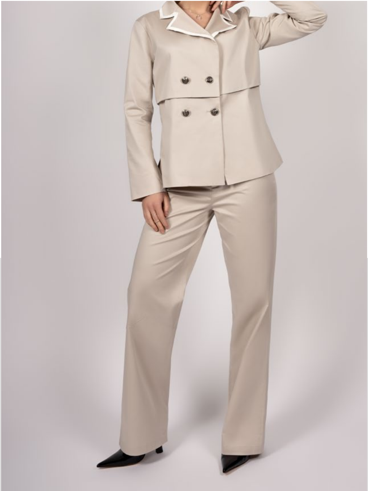
6th Avenue Pace - Pants