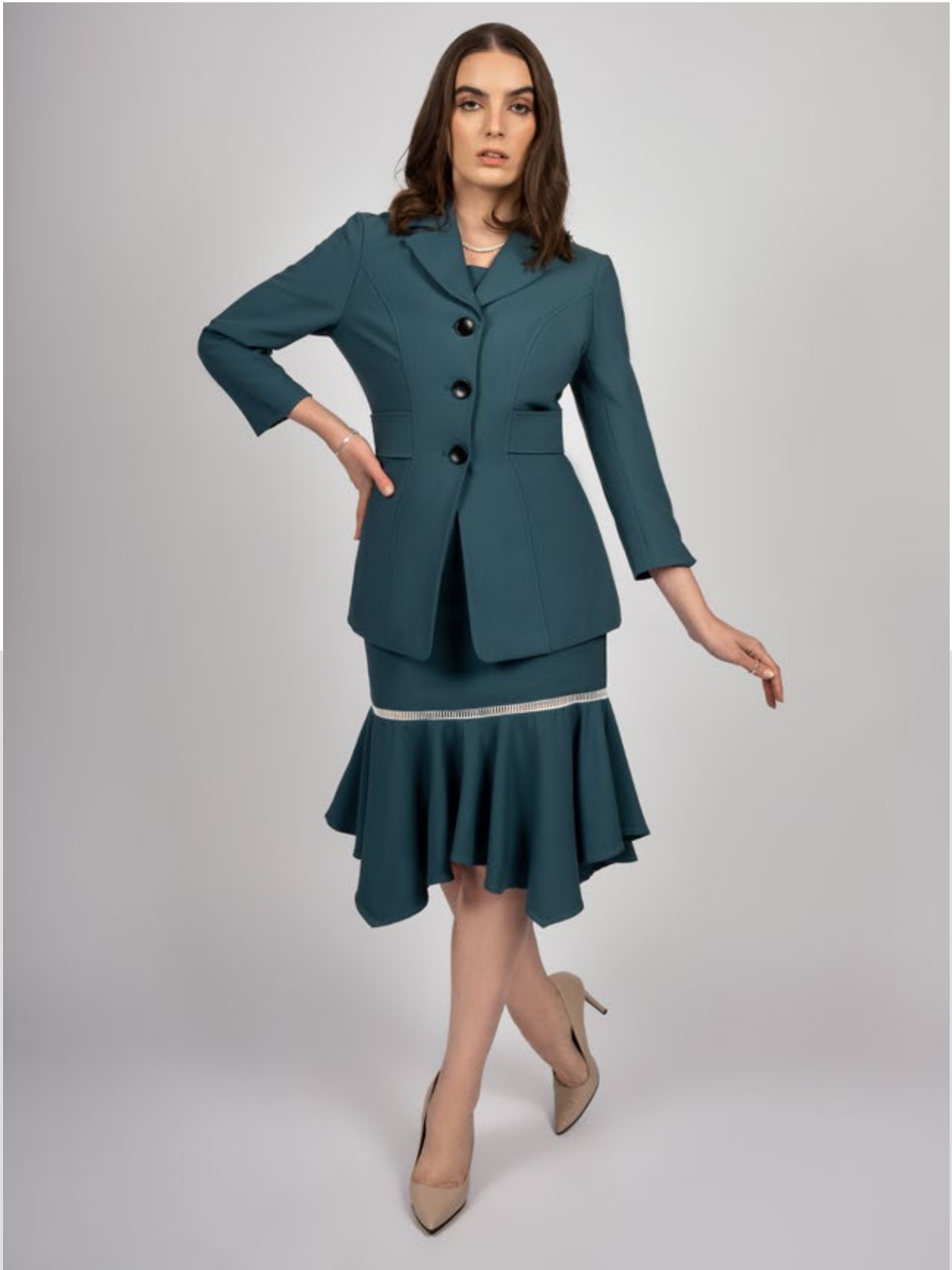
Broadway Show - Blazer