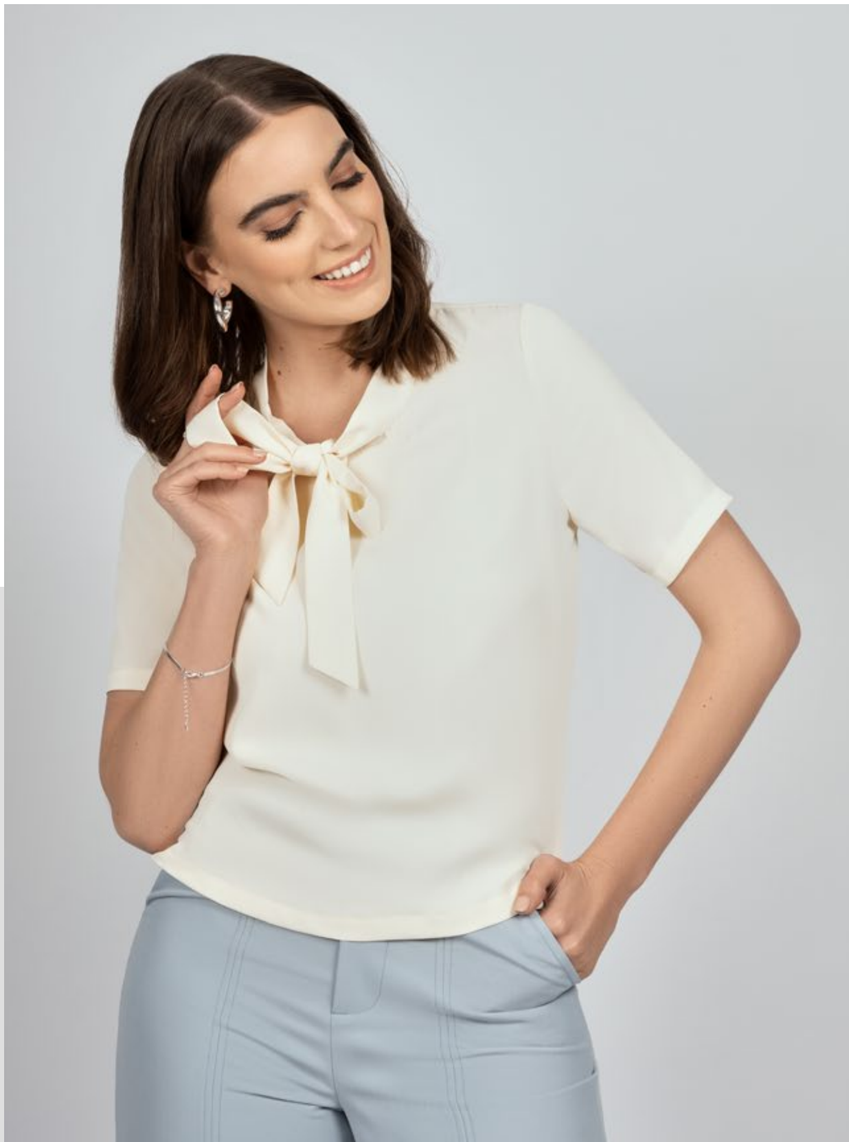
Everyday essentials - Short Sleeves