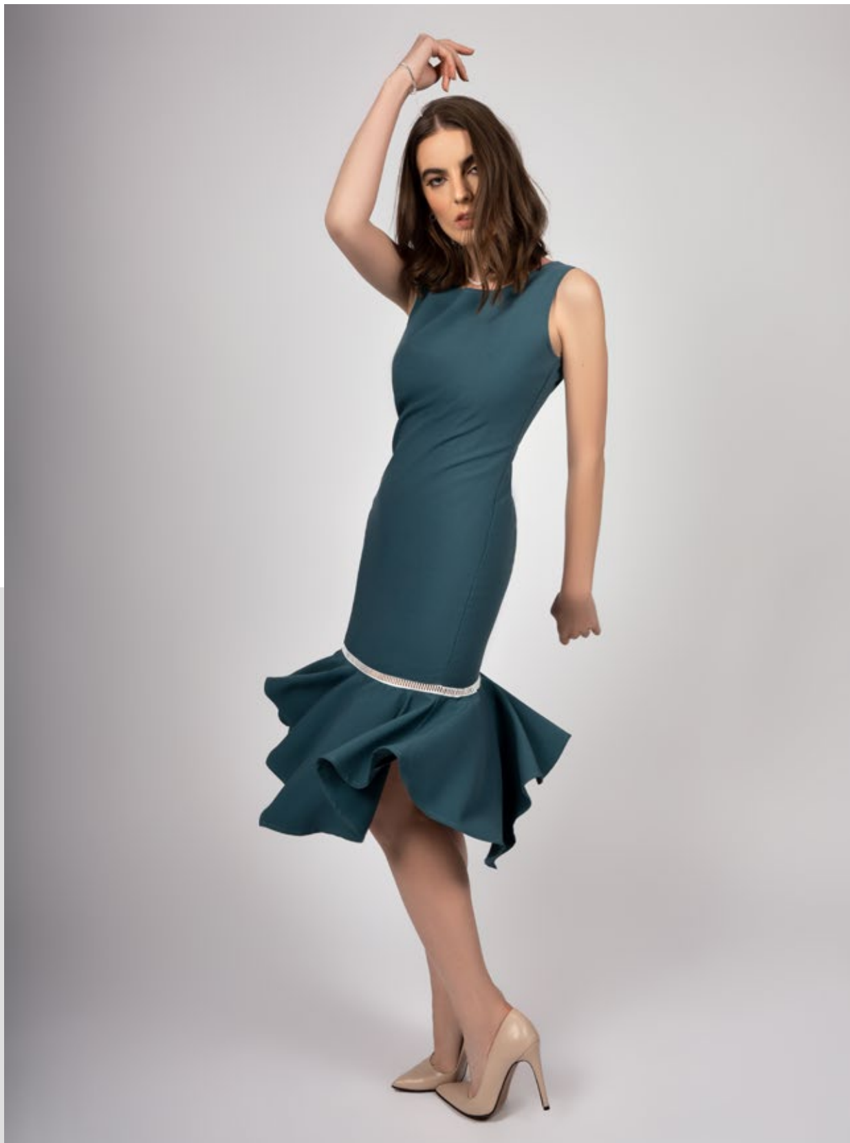
Broadway Show - Short Dress