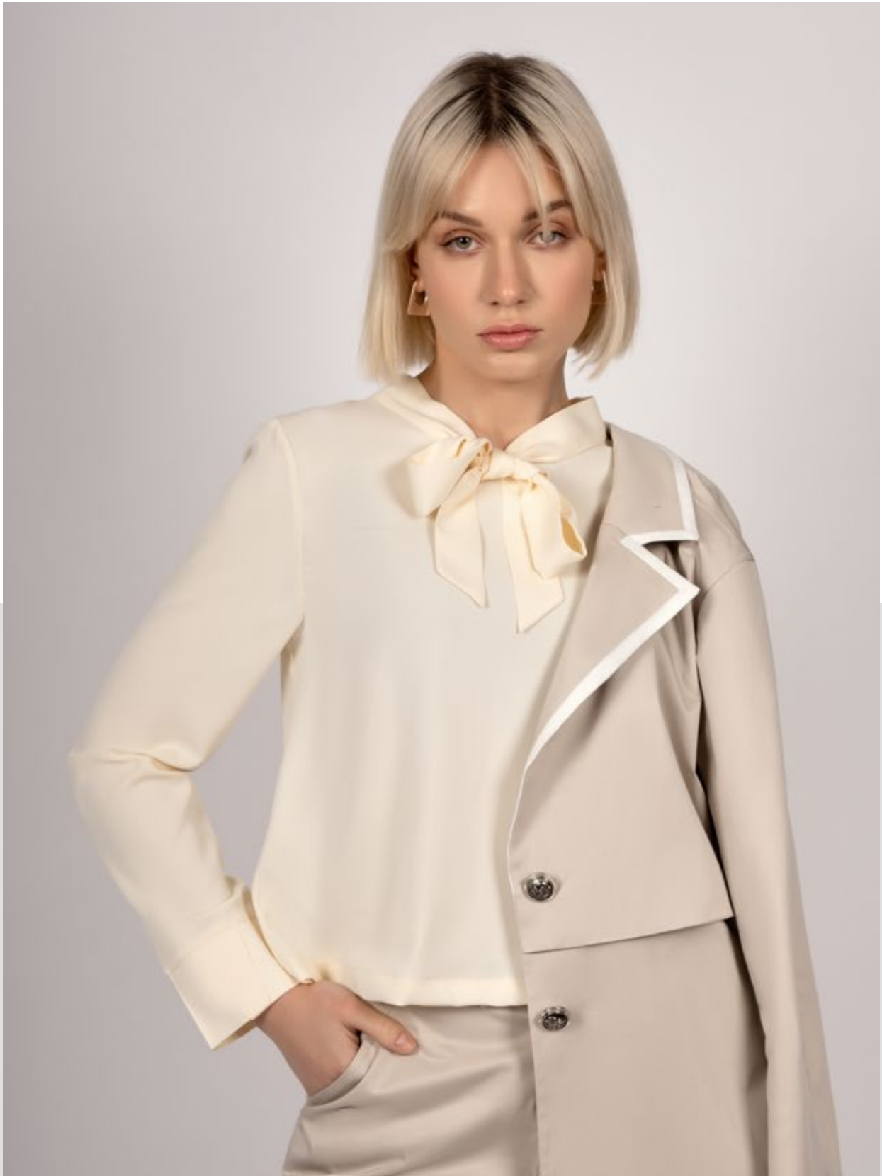
Every Day Essentials - Long Sleeves