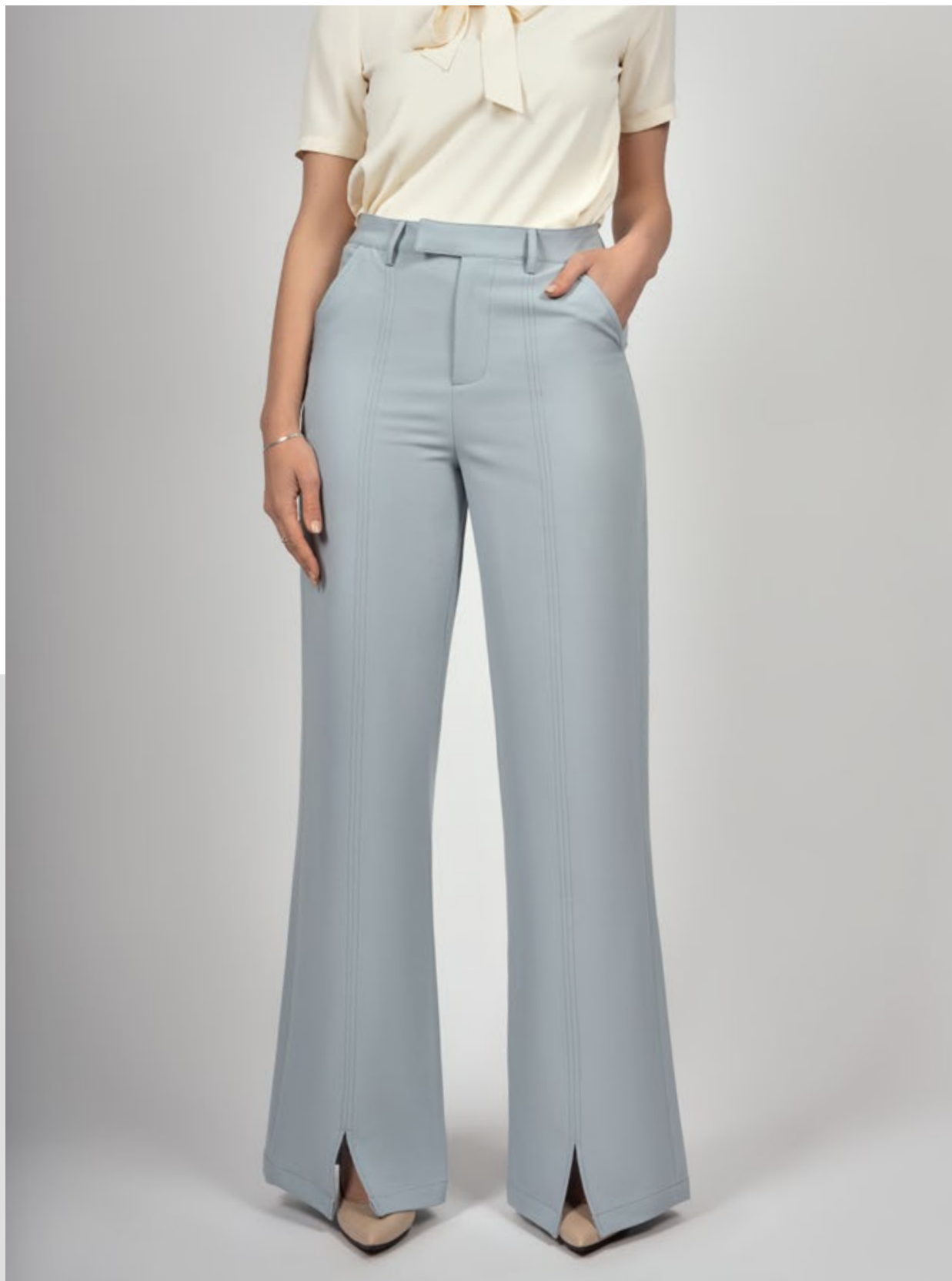
The Big Apple Swagger -Pants