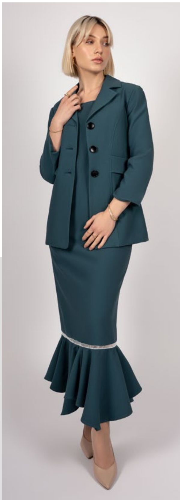
Broadway Show - Jacket