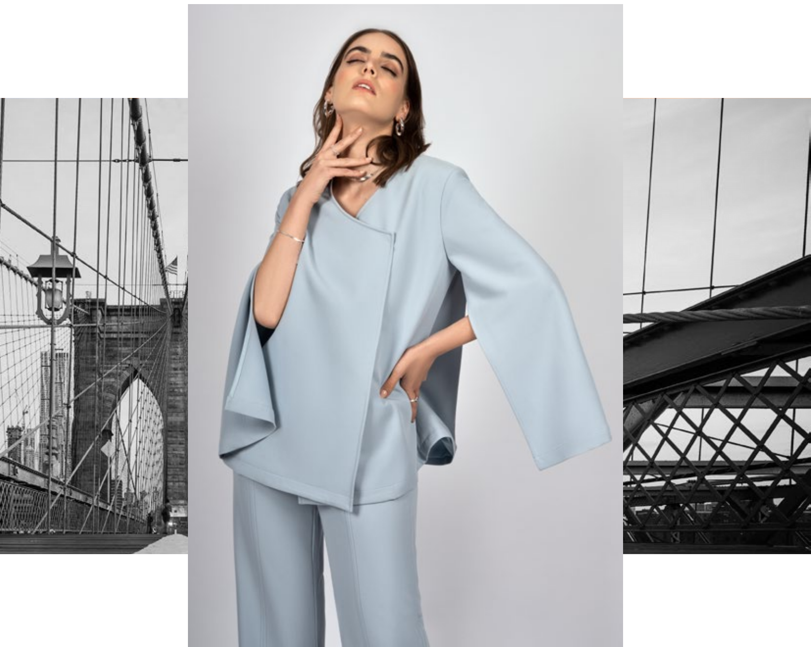
The Big Apple Swagger- Jacket