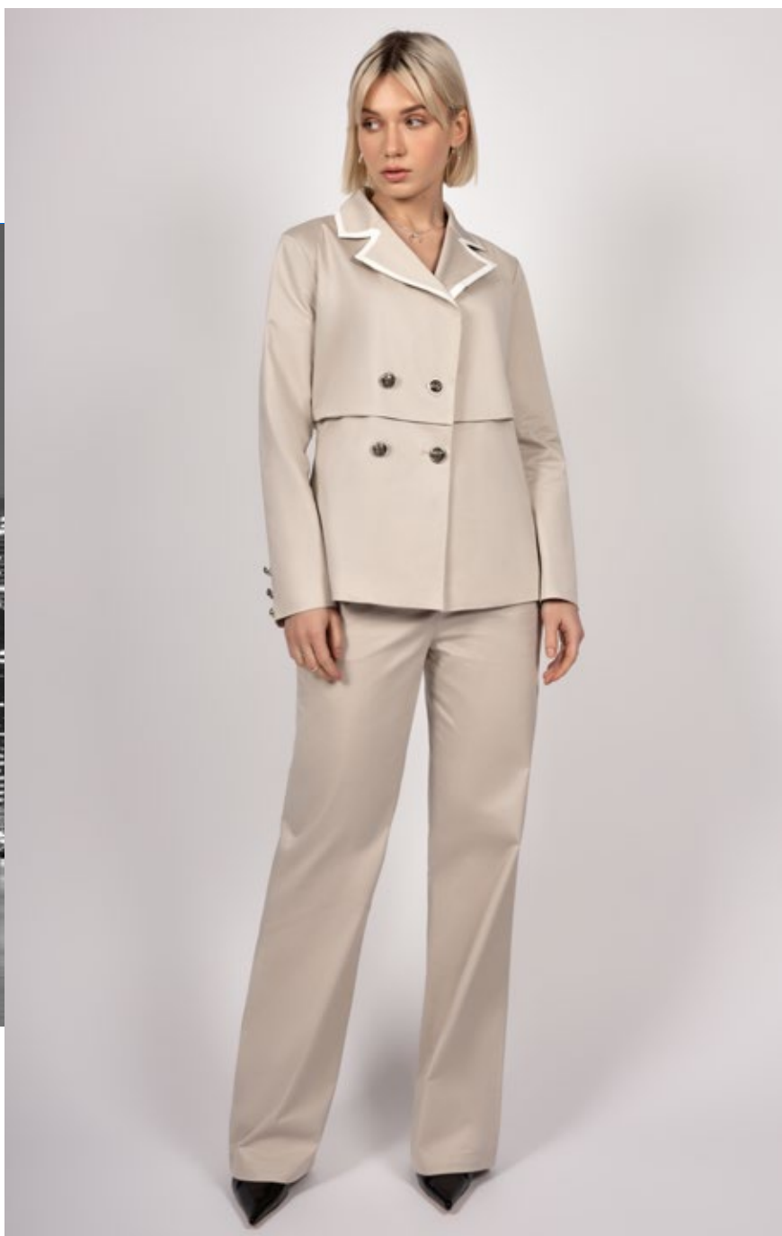
6th Avenue Pace - Blazer