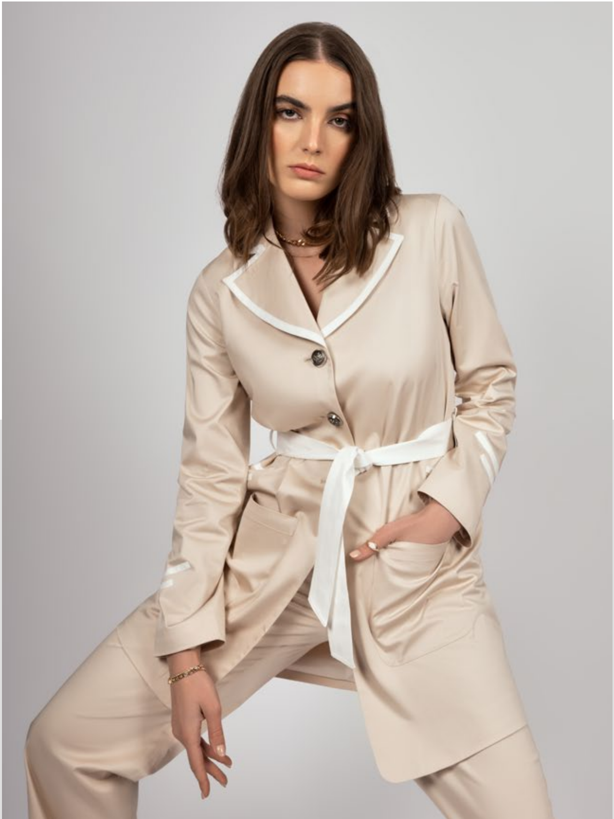
Wall Street Buzz - Blazer