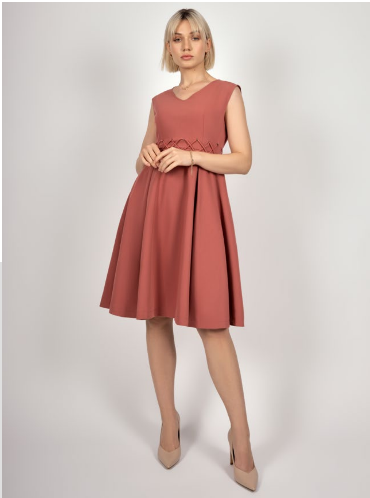
5th Avenue Day- Dress