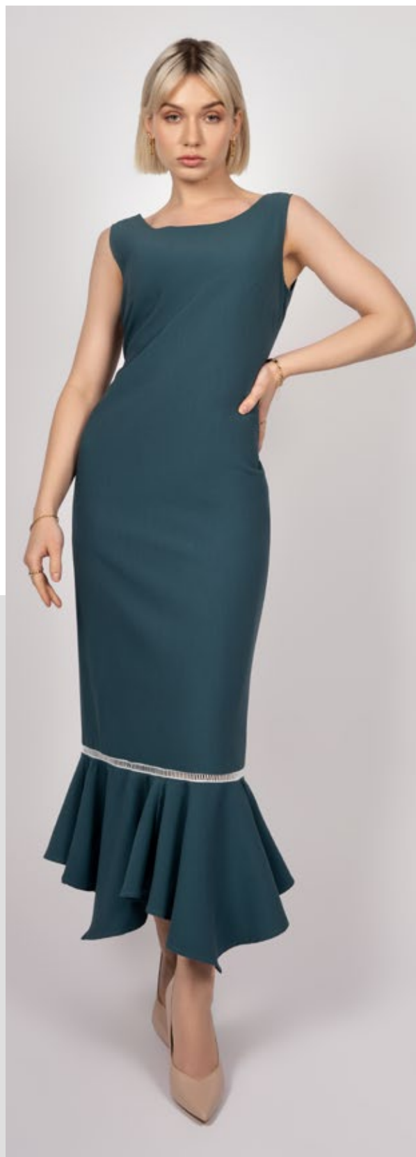
Broadway Show - Long Dress