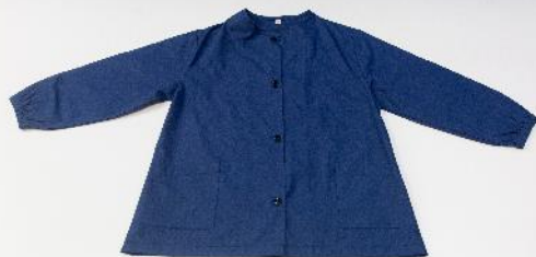
REF 012 ROSINE