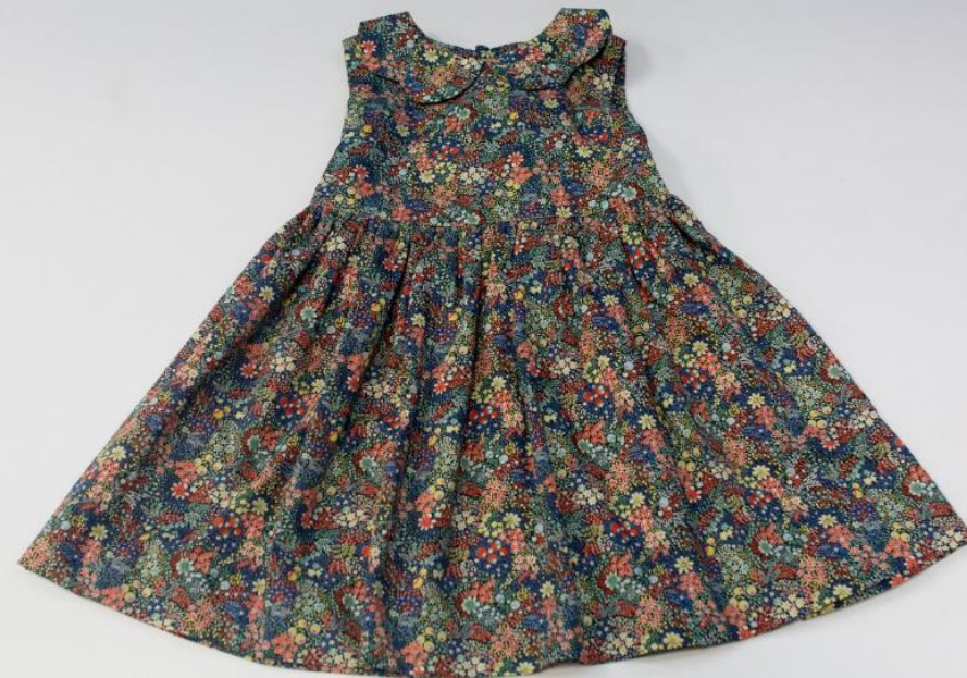
REF 014 MANOLIA