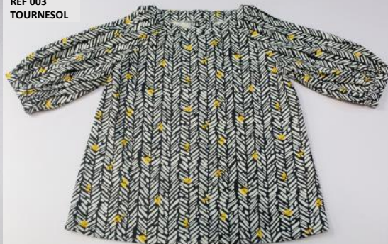
REF 003 TOURNESOL