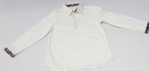
REF 013 AGATHE