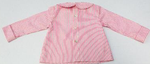
REF 006 IRIS