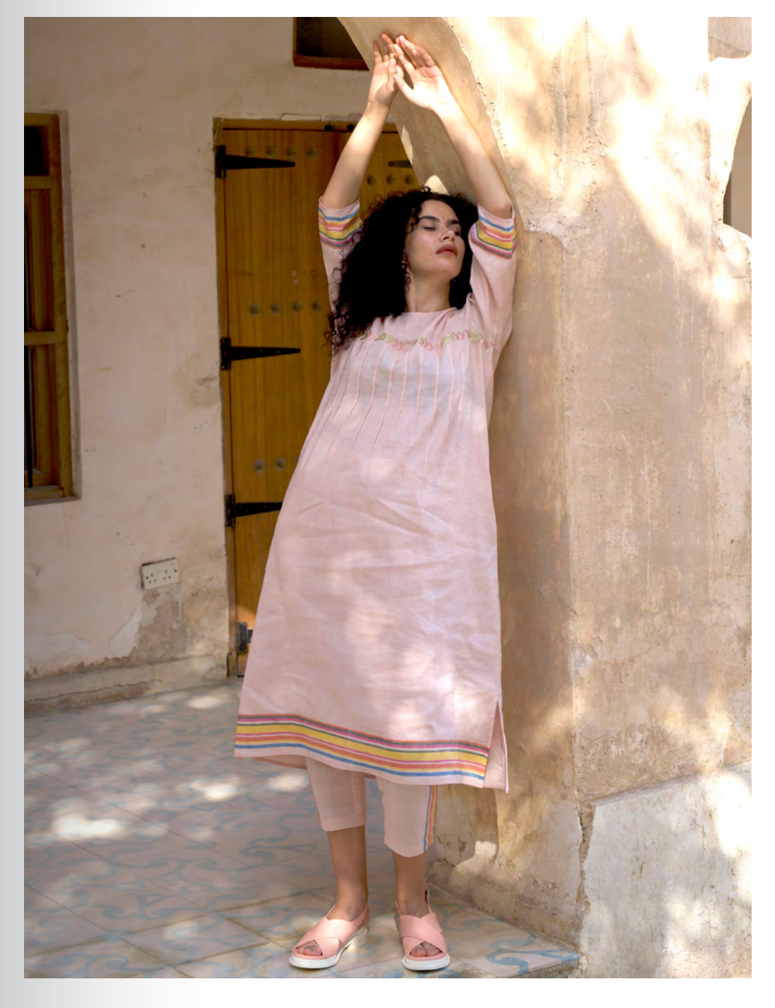
Ujjain + Murshidabad Almond