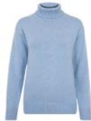
Sky Blue Melange