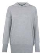
Light Grey Marl