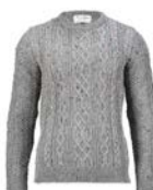
Dark Grey Nepp