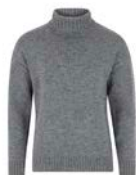
Dark Grey Nepp