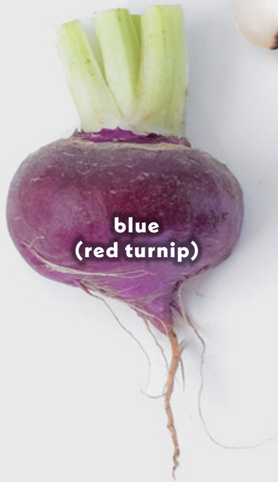
blue (red turnip)