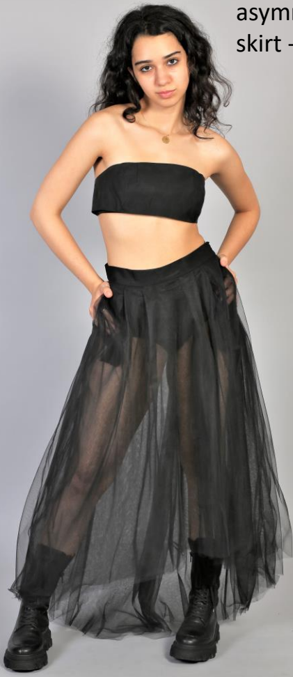
Transparent asymmetric tulle skirt -80 €