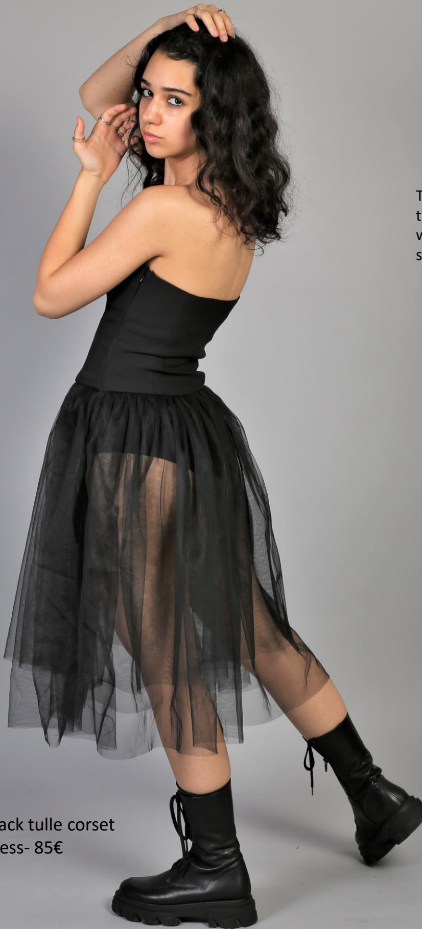
Black tulle corset dress- 85€