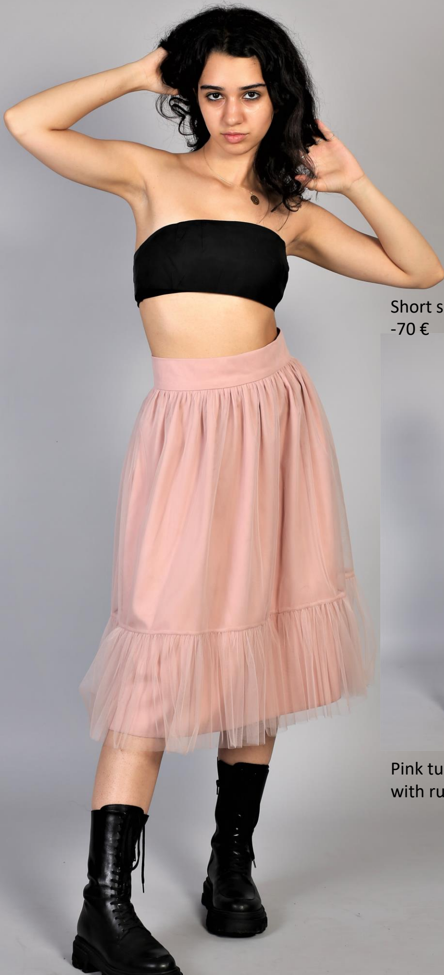
Short silk black top -70 €