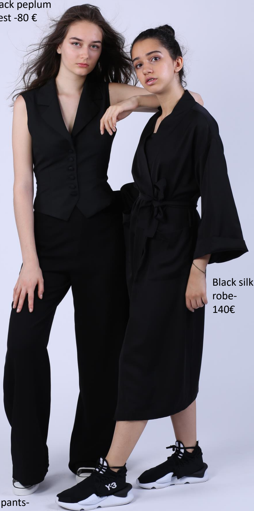
Silk pants- 95 €