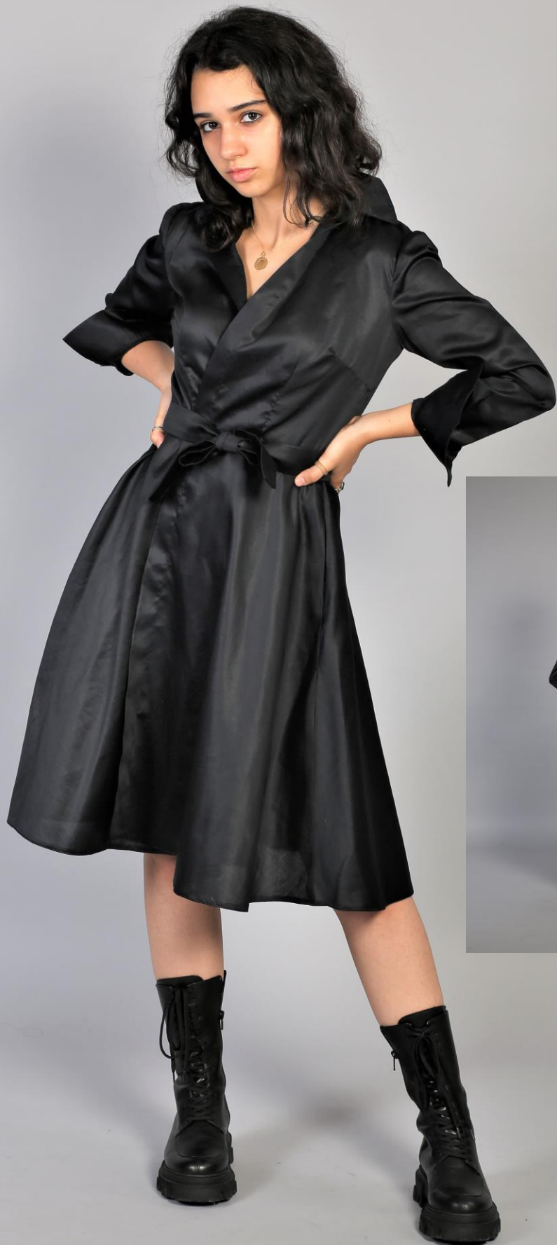
Shirt type dress from silk linen fabric - 105 €