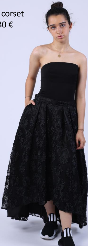
Black corset top -80 €