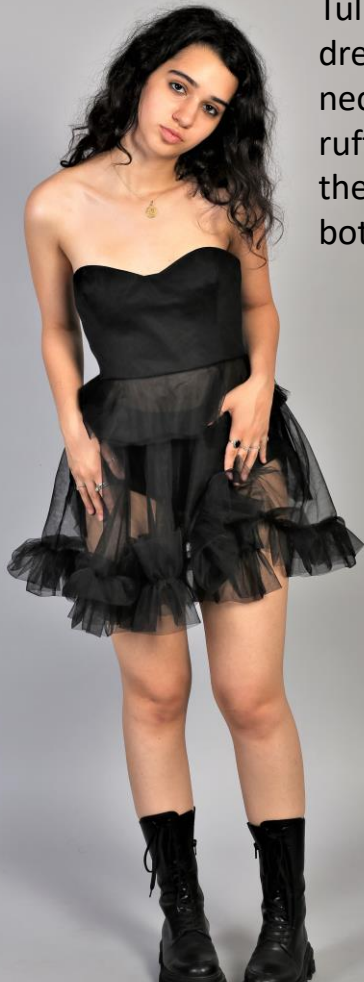
Tulle corset dress with heart neckline and ruffles around the waist and bottom- 90€