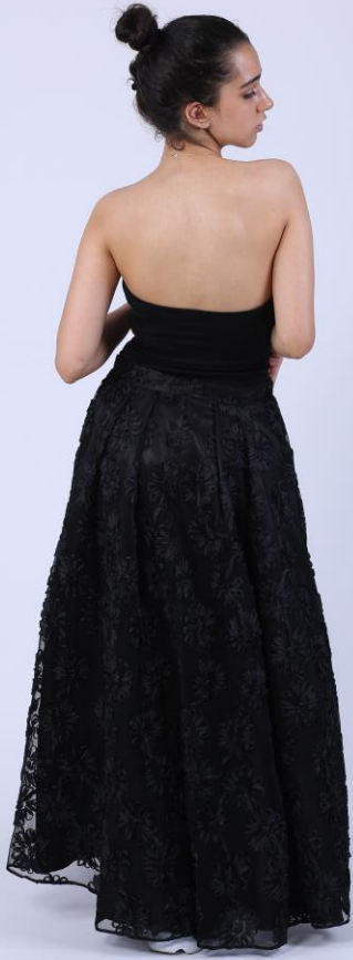
Asymmetric black lace skirt -120 €