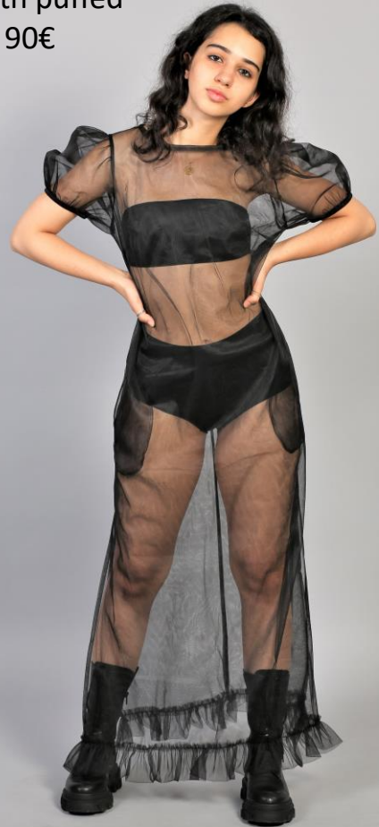
Transparent tulle dress with puffed sleeves- 90€