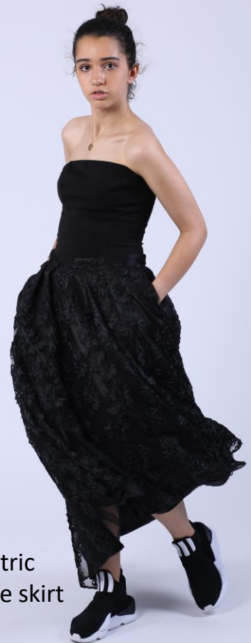
Asymmetric black lace skirt -120 €