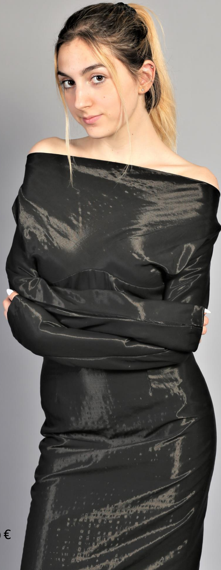
Black silk dress with bare shoulders - 160 €