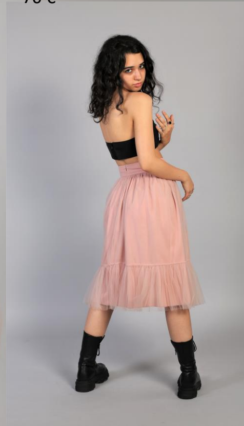
Pink tulle skirt, lined, with ruffles -65 €