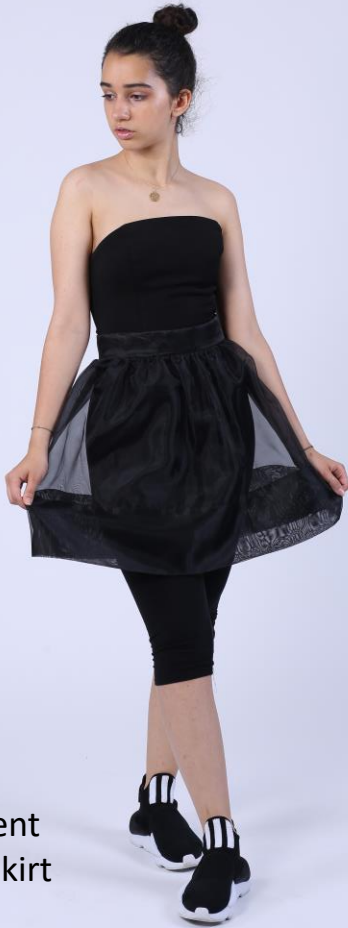
Transparent organza skirt -50 €