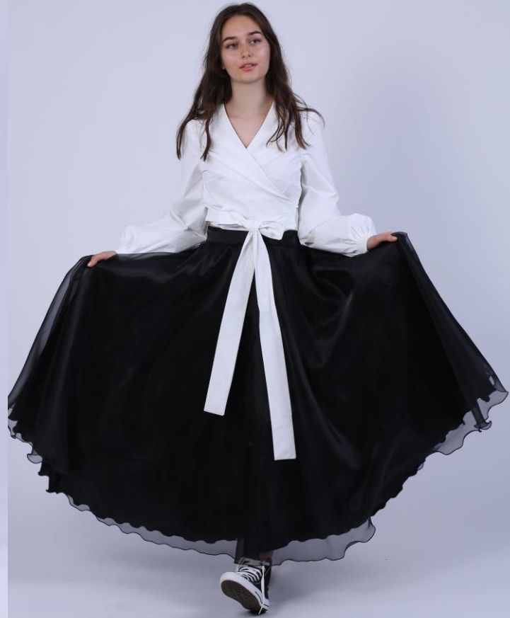
Side by side short blouse, puffy long sleeve, white cotton -70 €