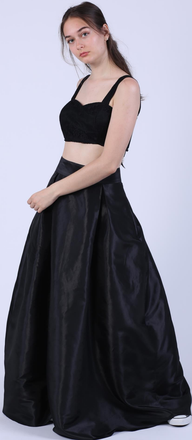
Long skirt, black tafta, waist folds -80 €