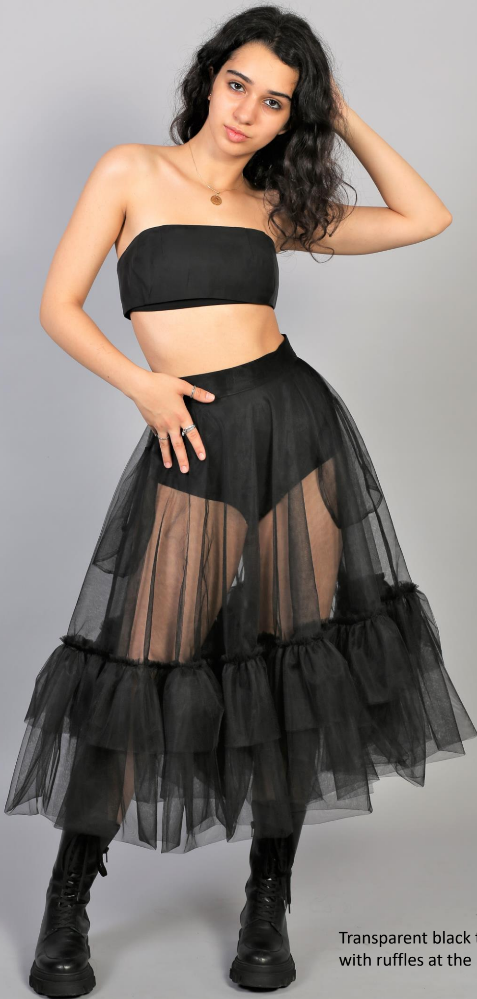
Transparent black tulle skirt with ruffles at the bottom- 85€