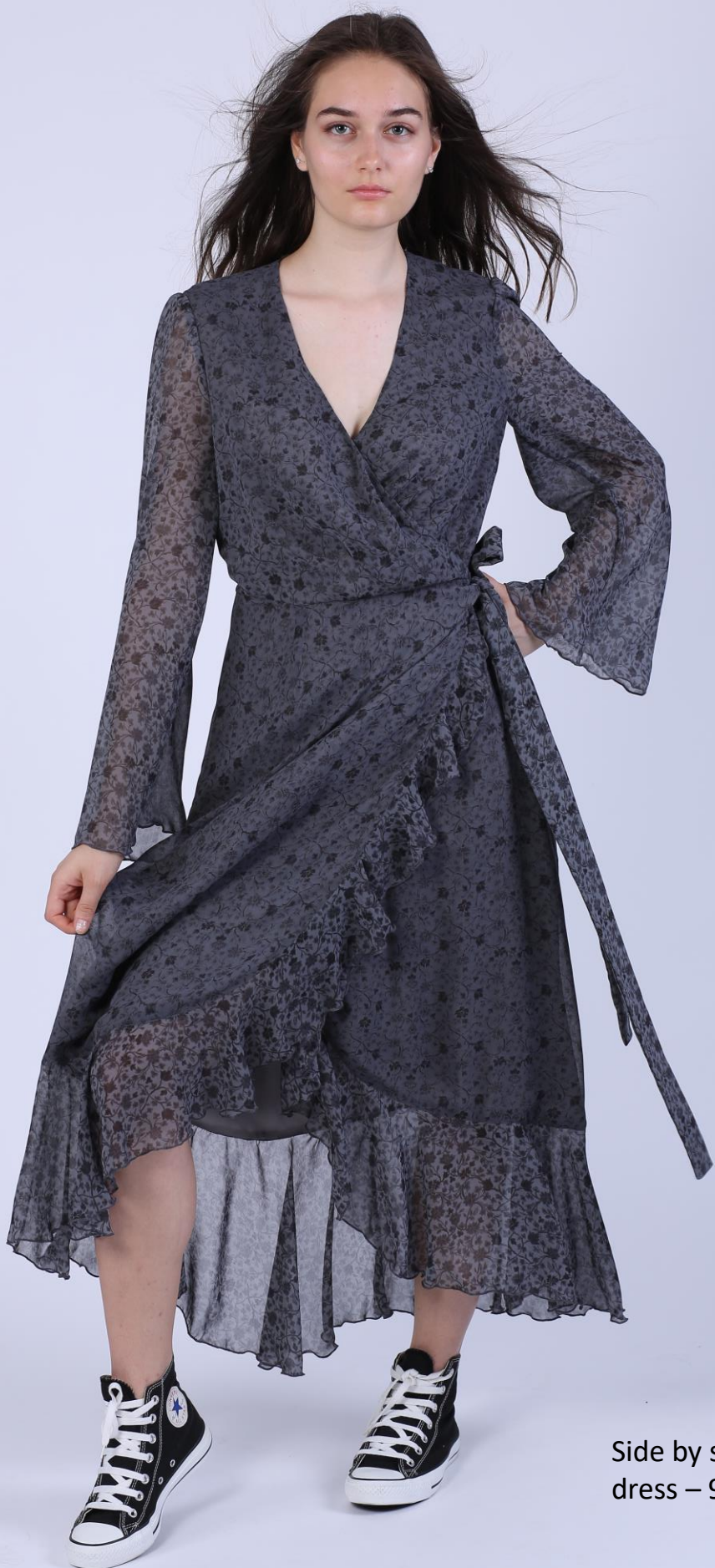
Side by side veil dress – 95 €