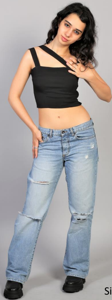
Silk top with asymmetrical straps- 105€