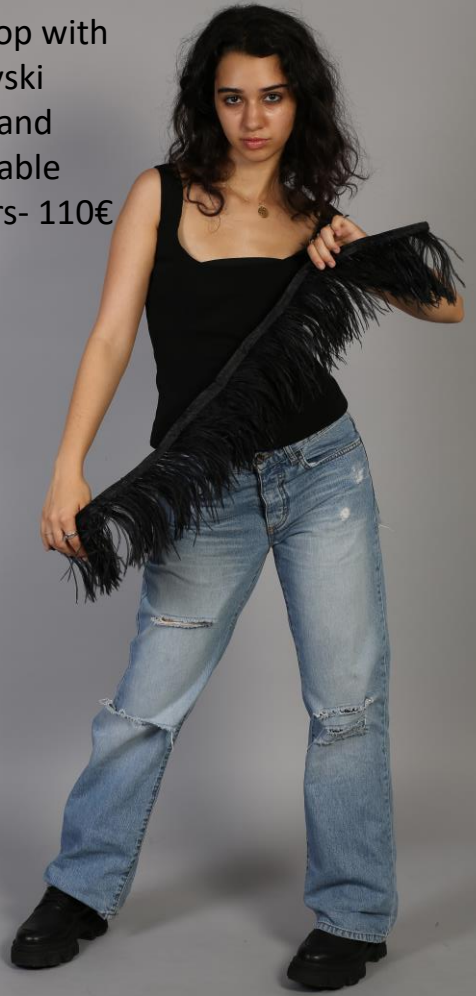
Black top with Swarovski zipper and detachable feathers- 110€