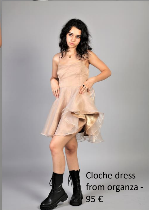
Cloche dress from organza - 95 €