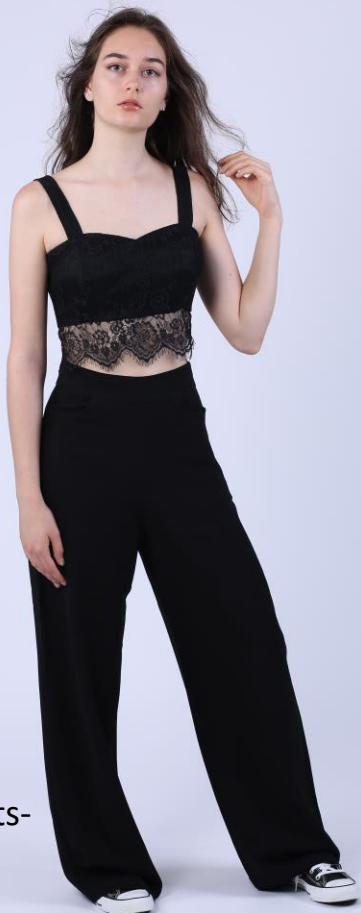
Silk pants- 95 €