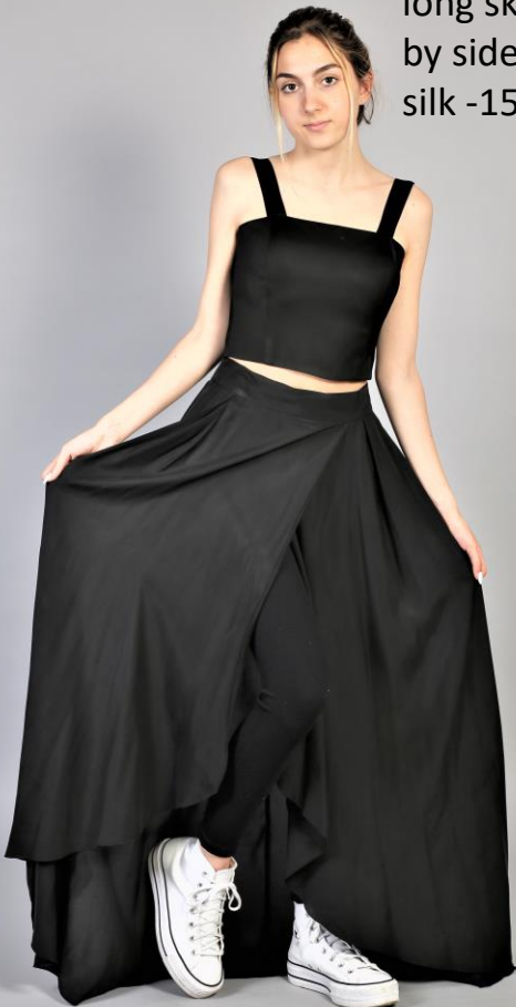
Asymmetric long skirt, side by side, black silk -150 €