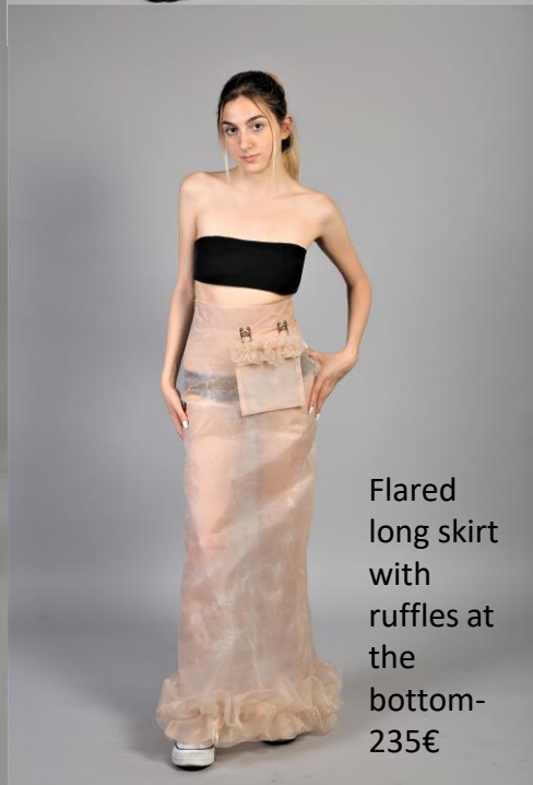
Flared long skirt with ruffles at the bottom- 235€