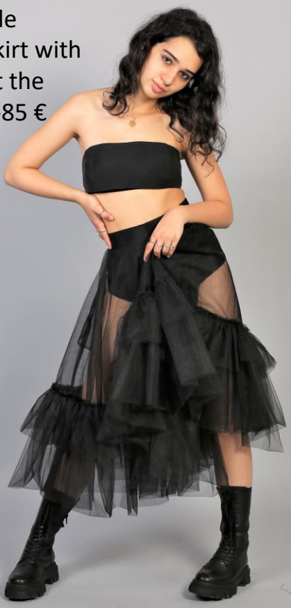
Transparent black tulle cloche skirt with ruffles at the bottom -85 €