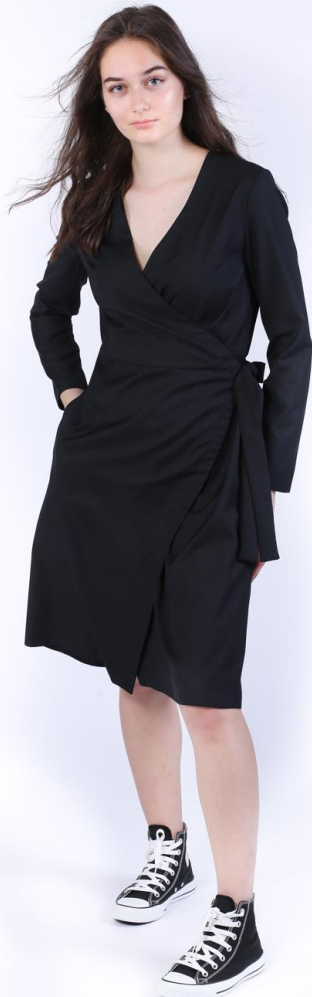
Side by side black dress– 95€