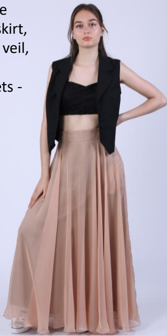
Cloche long skirt, beige veil, with pockets - 70 €