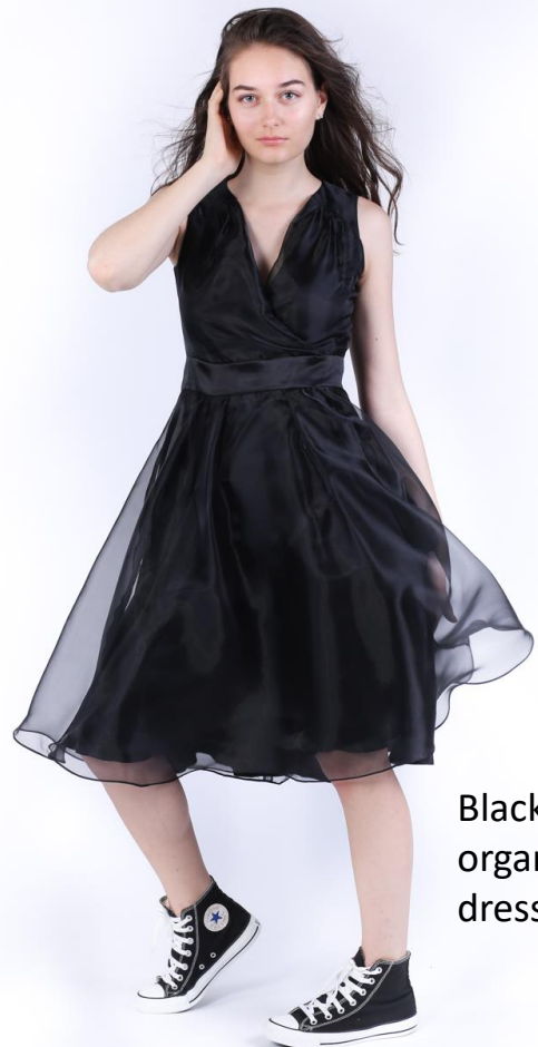
Black organza dress - 95 €