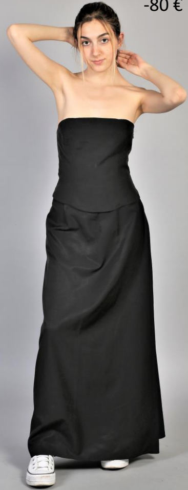
Black cotton flower long skirt -80 €