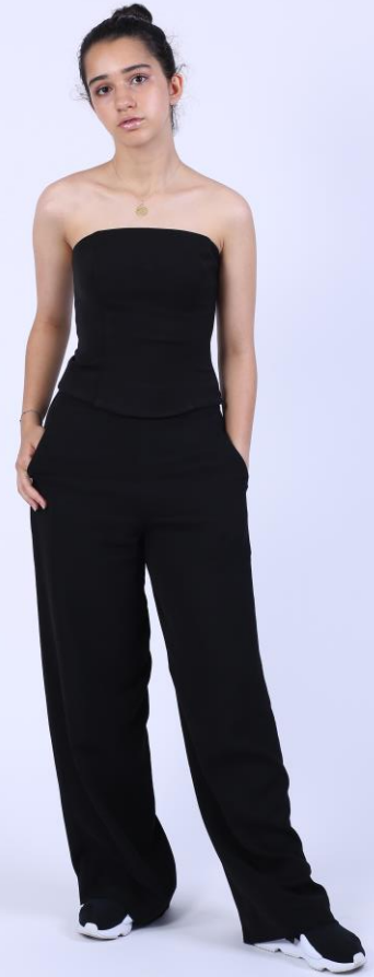
Black corset top -80 €