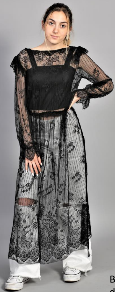
Black lace dress- 130 €