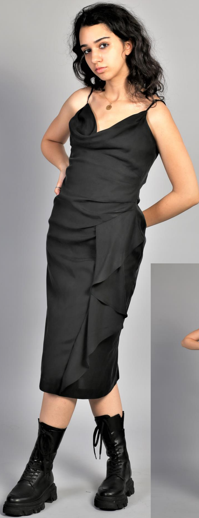
Black silk dress with straps and fringes - 160 €