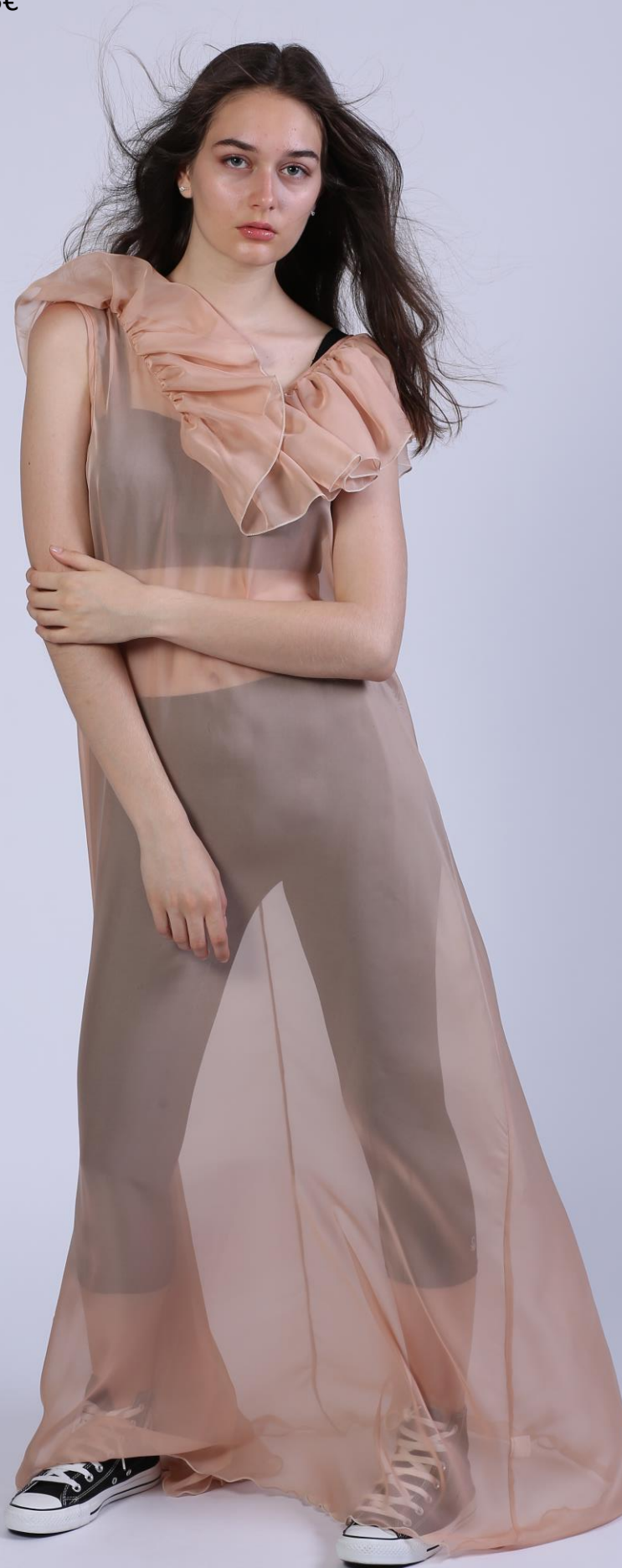
Transparent veil dress with ruffles around the neckline- 85€