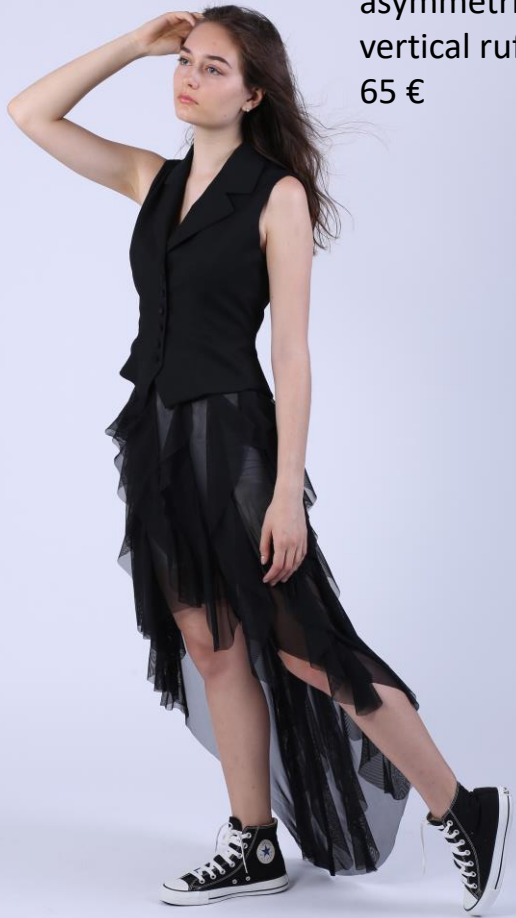
Black mesh skirt asymmetric vertical ruffles - 65 €