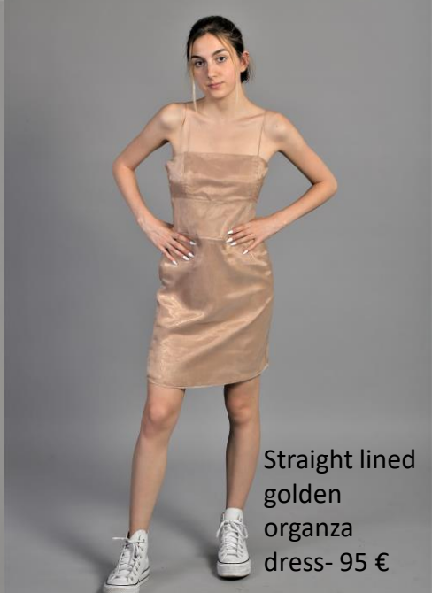
Straight lined golden organza dress- 95 €