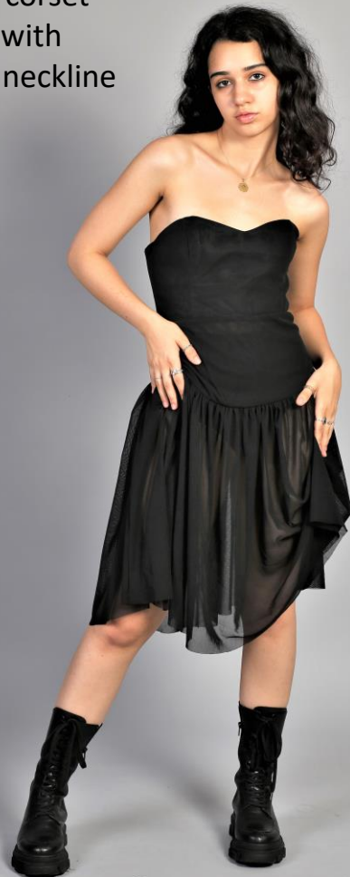
Mesh corset dress with heart neckline - 90 €