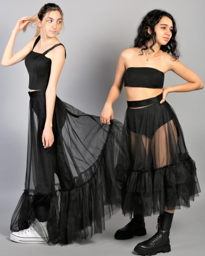
Tulle long skirt, ruffles -80 €