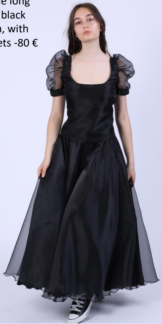
Cloche long skirt, black organ, with pockets -80 €