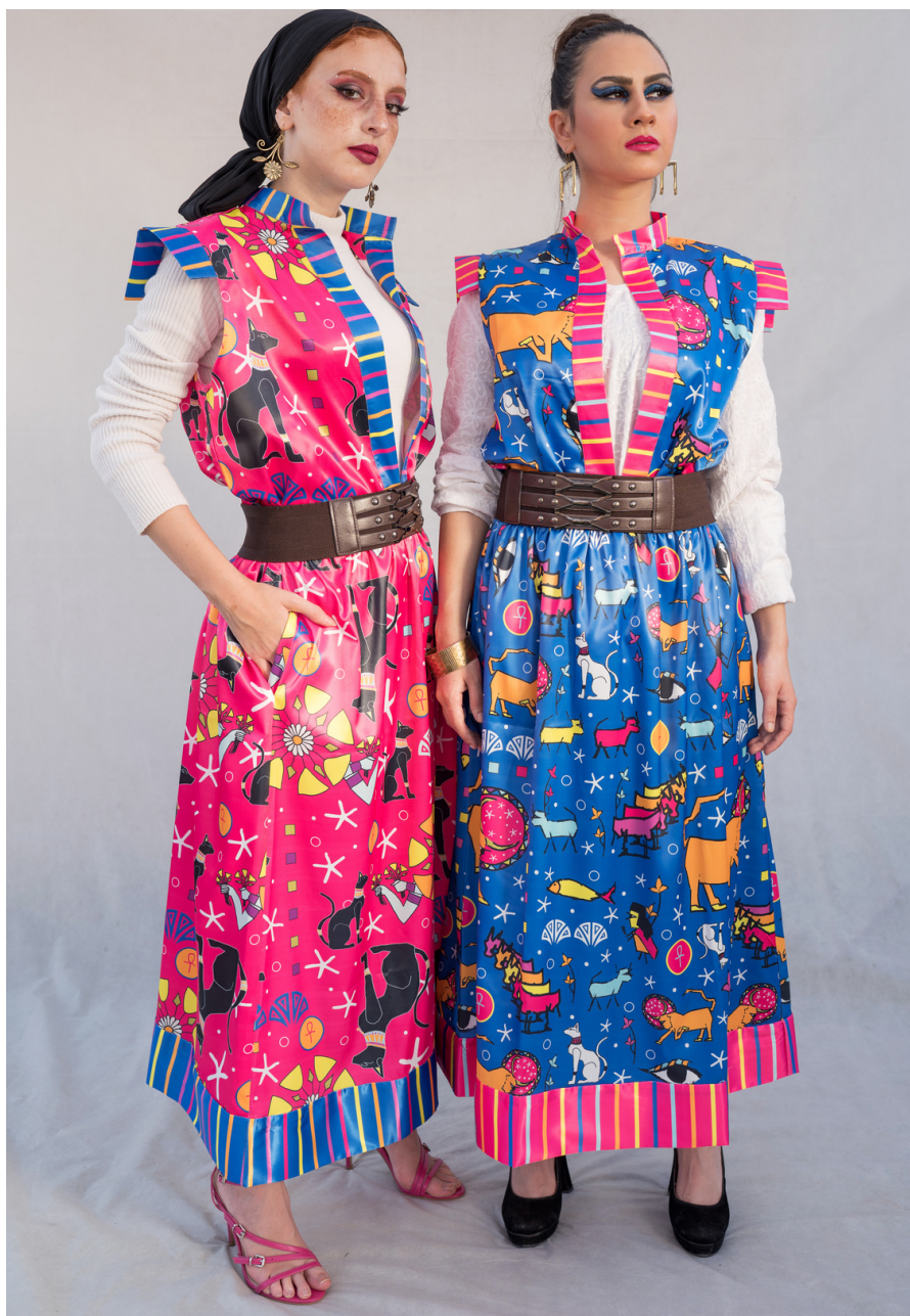
Vest and Skirt Outfit