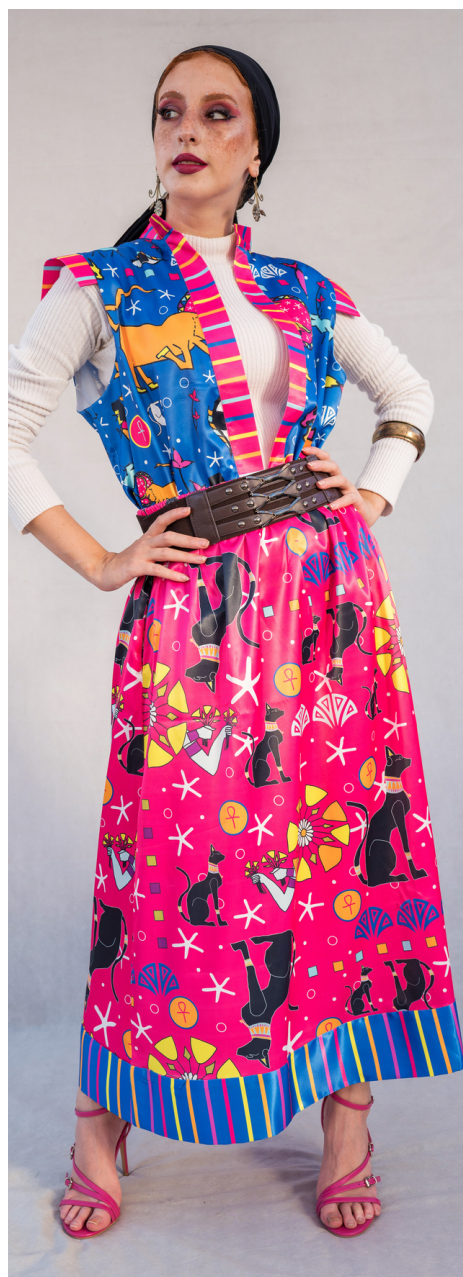
Vest and Skirt Outfit