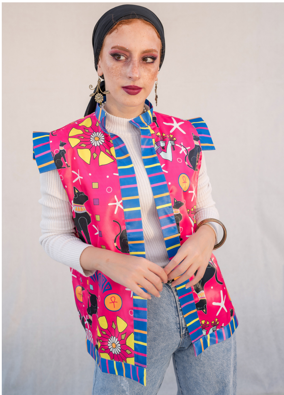
Pretty Bastet Vest