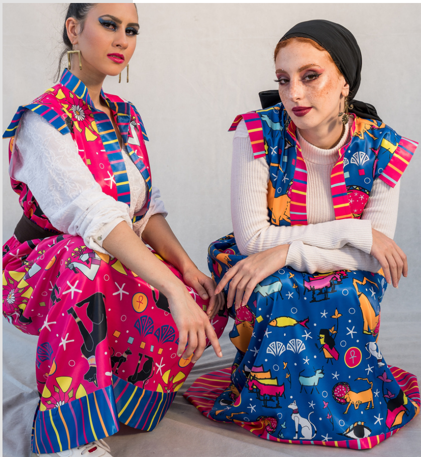
VEST AND SKIRT OUTFIT