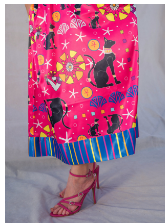
Pretty Bastet Skirt