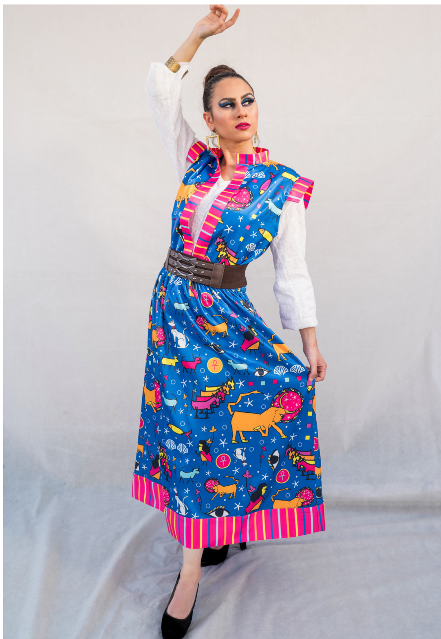
Dreamy Apis Vest and Skirt Outfit