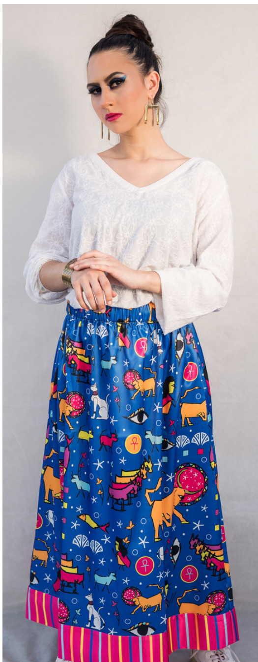
Dreamy Apis Skirt