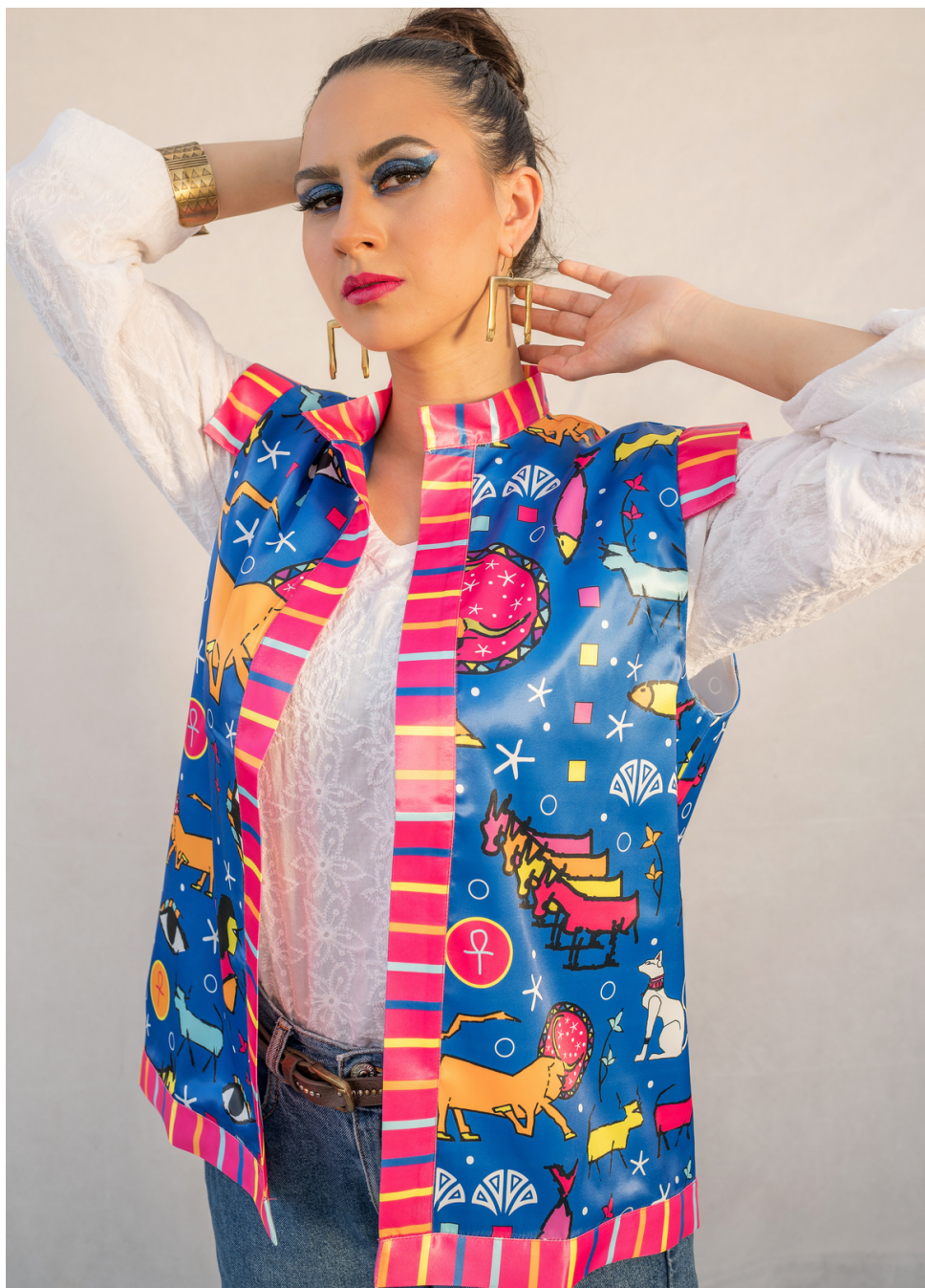
Dreamy Apis Vest