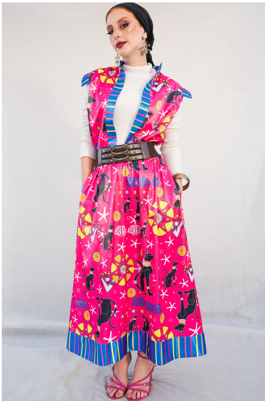
Pretty Bastet Vest and Skirt Outfit