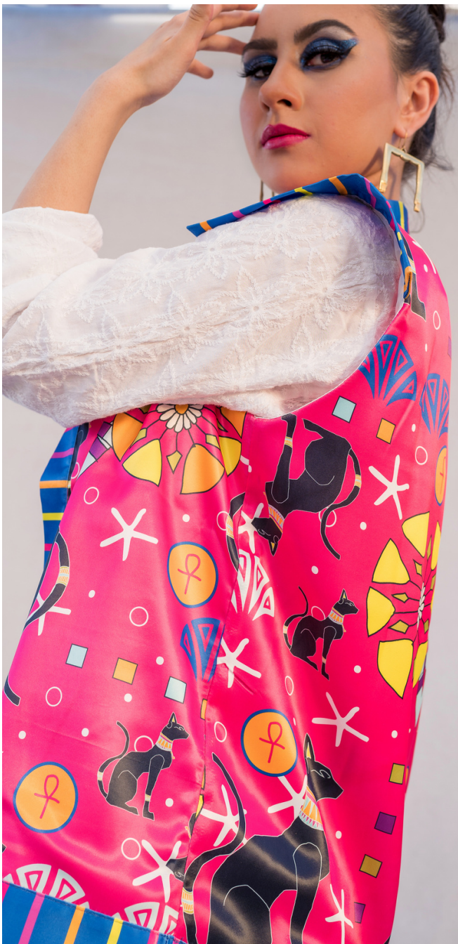
Pretty Bastet Vest