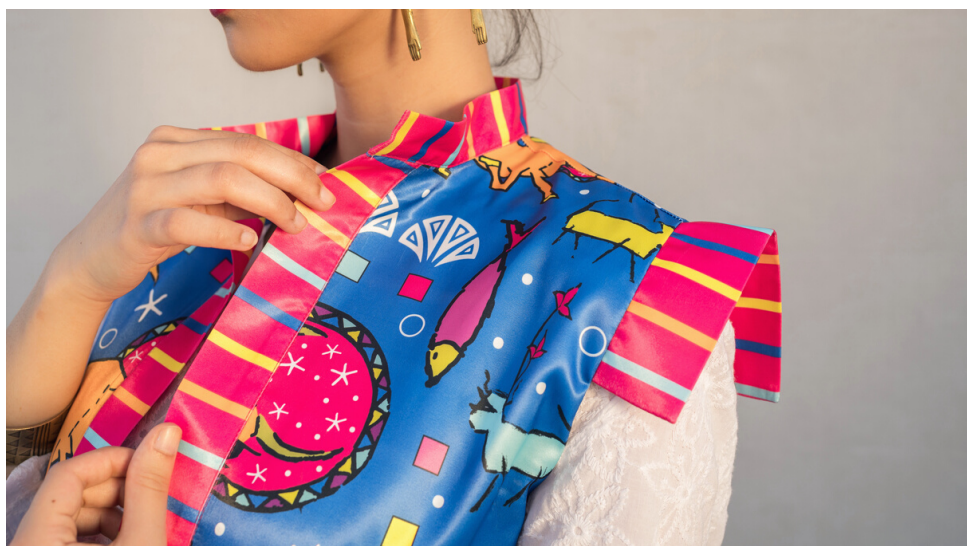
Dreamy Apis Vest