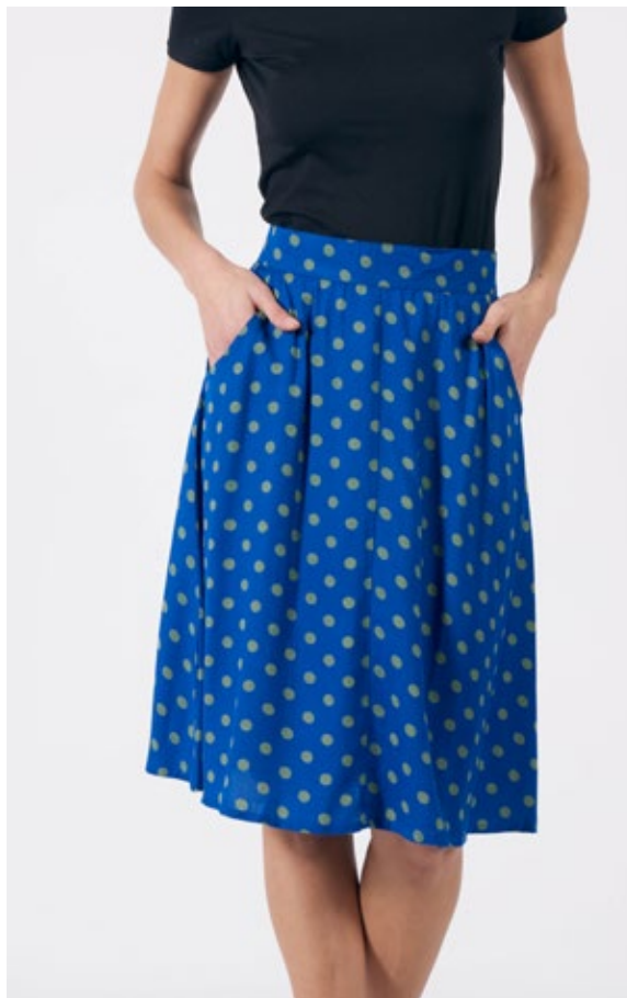
STYLE: ANNABEL PRINT: POLKA FABRIC: 100% VISCOSE FSC CERTIFIED FABRIC

SIZES: UK8/XS, UK10/S UK12/M UK14/L UK16/XL UK18/XXL