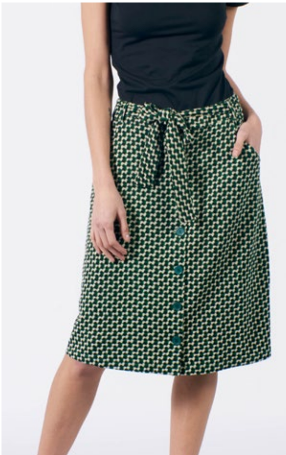
STYLE: AGNETHA PRINT: SQUIGGLE FABRIC: 97% VISCOSE, 3% ELASTANE FSC CERTIFIED FABRIC