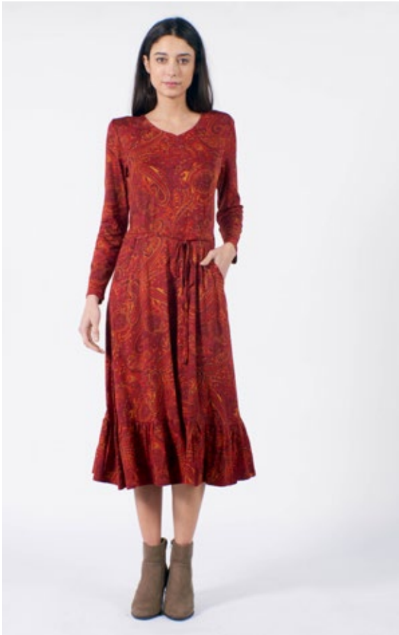
STYLE: GABI PRINT: PAISLEY FABRIC: 97% VISCOSE, 3% ELASTANE FSC CERTIFIED FABRIC

SIZES: UK8/XS, UK10/S UK12/M UK14/L UK16/XL UK18/XXL