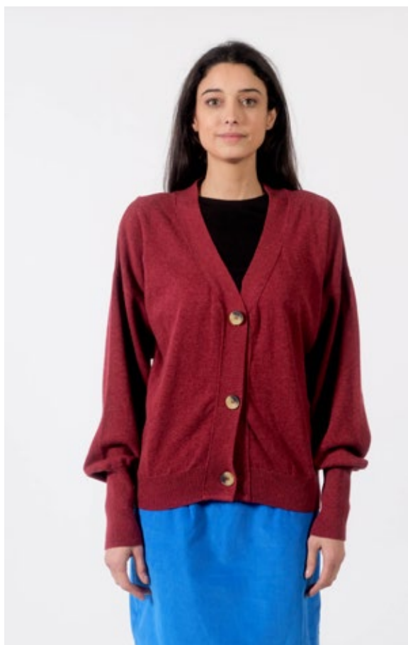
STYLE: OVERSIZED CARDIGAN COLOUR: BURGUNDY FABRIC: 70% WOOL / 30% COTTON