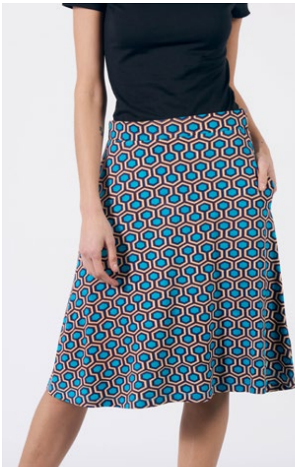
STYLE: BLOSSOM PRINT: HEX FABRIC: 97% VISCOSE, 3% ELASTANE FSC CERTIFIED FABRIC

SIZES: UK8/XS, UK10/S UK12/M UK14/L UK16/XL UK18/XXL