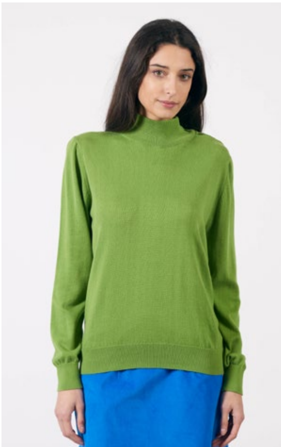
STYLE: BUTTON SHOULDER COLOUR: PERIDOT FABRIC: 100% ORGANIC COTTON