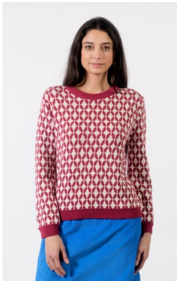
STYLE: STARBURST SWEATER COLOUR: RED BUD FABRIC: 100% ORGANIC COTTON

SIZES: UK8/XS, UK10/S UK12/M UK14/L UK16/XL UK18/XXL