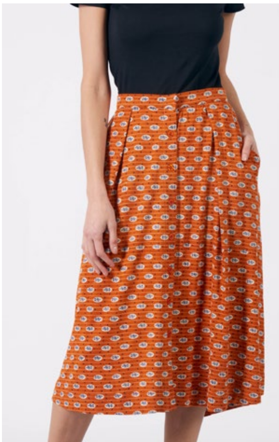
STYLE: LENA PRINT: HEART FLOWER FABRIC: 97% VISCOSE, 3% ELASTANE FSC CERTIFIED FABRIC