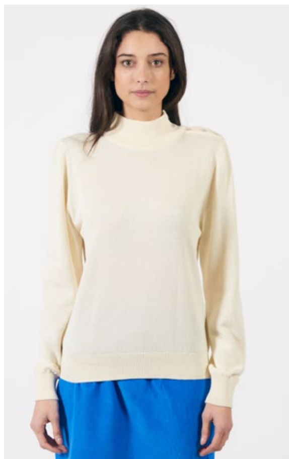
STYLE: BUTTON SHOULDER COLOUR: ANTIQUE WHITE FABRIC: 100% ORGANIC COTTON