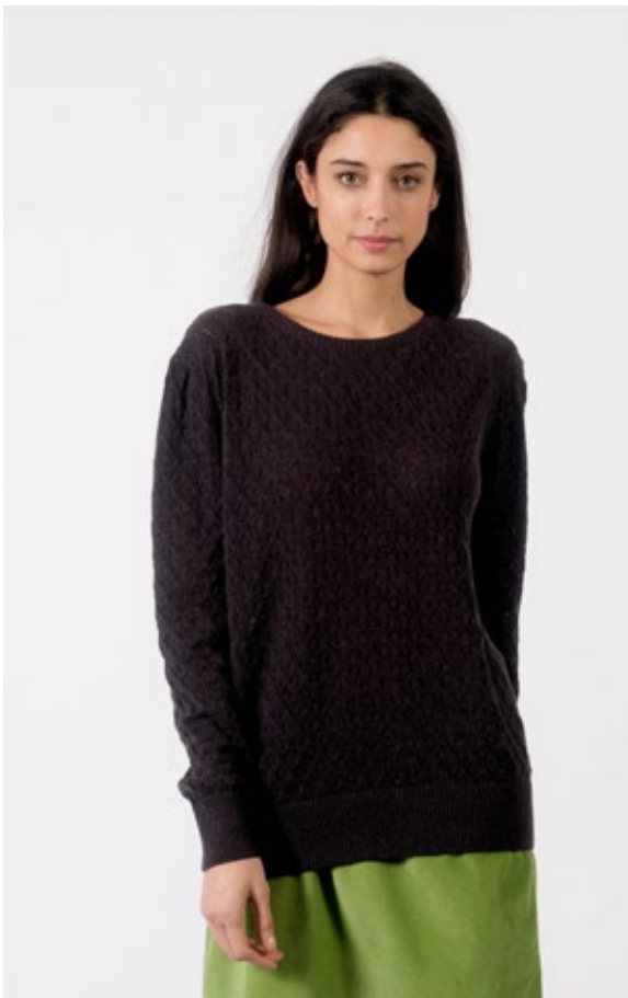
STYLE: DIDI POINTELLE PRINT: CHARCOAL FABRIC: 70% WOOL / 30% COTTON