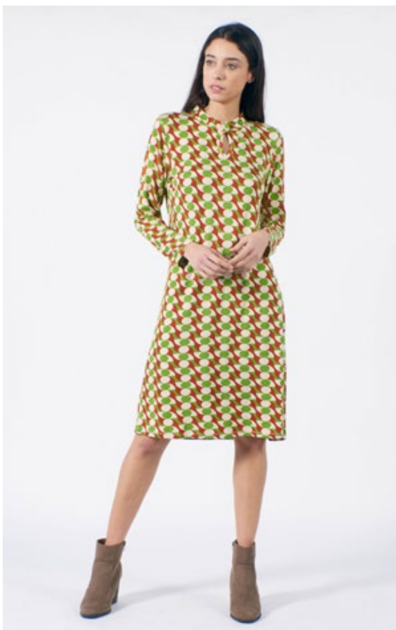
STYLE: ELEANOR PRINT: SWOOSH FABRIC: 97% VISCOSE, 3% ELASTANE FSC CERTIFIED FABRIC