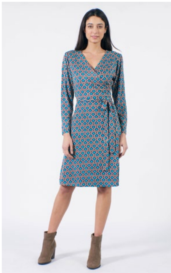
STYLE: ROBIN PRINT: HEX FABRIC: 97% VISCOSE,3% ELASTANE FSC CERTIFIED FABRIC