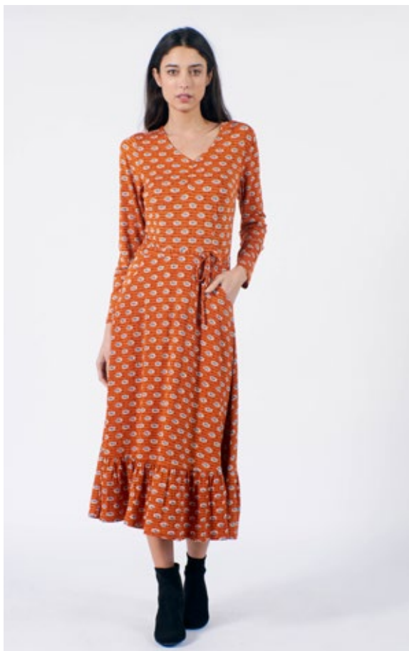
STYLE: GABI PRINT: HEART FLOWER FABRIC: 97% VISCOSE, 3% ELASTANE FSC CERTIFIED FABRIC

SIZES: UK8/XS, UK10/S, UK12/M, UK14/L, UK16/XL, UK18/XXL