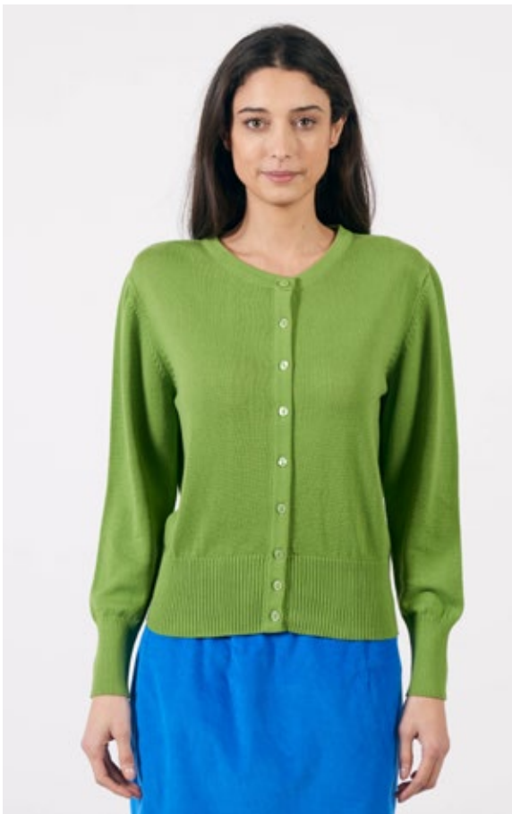
STYLE: BASIC CARDIGAN COLOUR: PERIDOT FABRIC: 100% ORGANIC COTTON