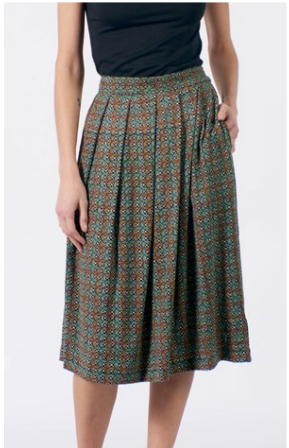
STYLE: MAGGIE PRINT: GREEN LEAF FABRIC: 97% VISCOSE, 3% ELASTANE FSC CERTIFIED FABRIC