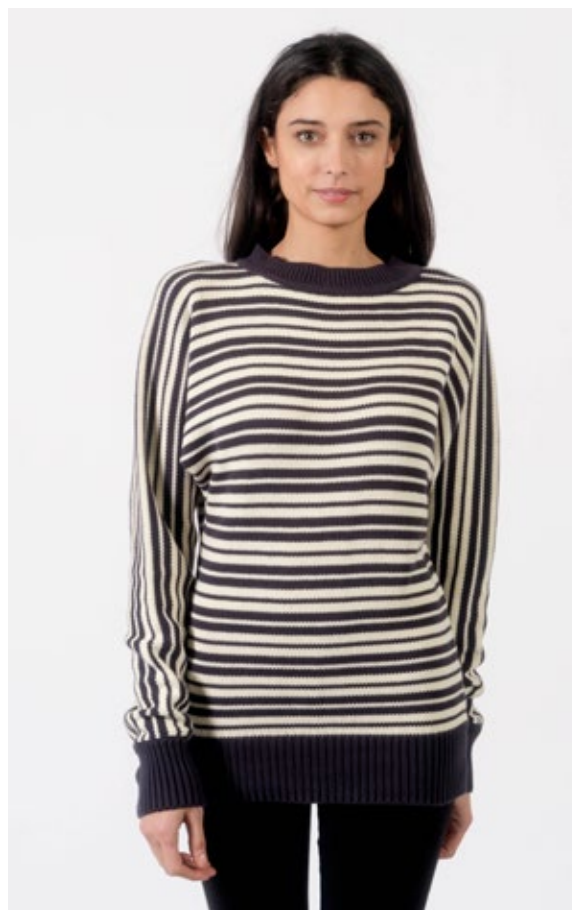
STYLE: CHARLIE BATWING COLOUR: BLACK ONYX/ANTIQUE WHITE FABRIC: 100% ORGANIC COTTON