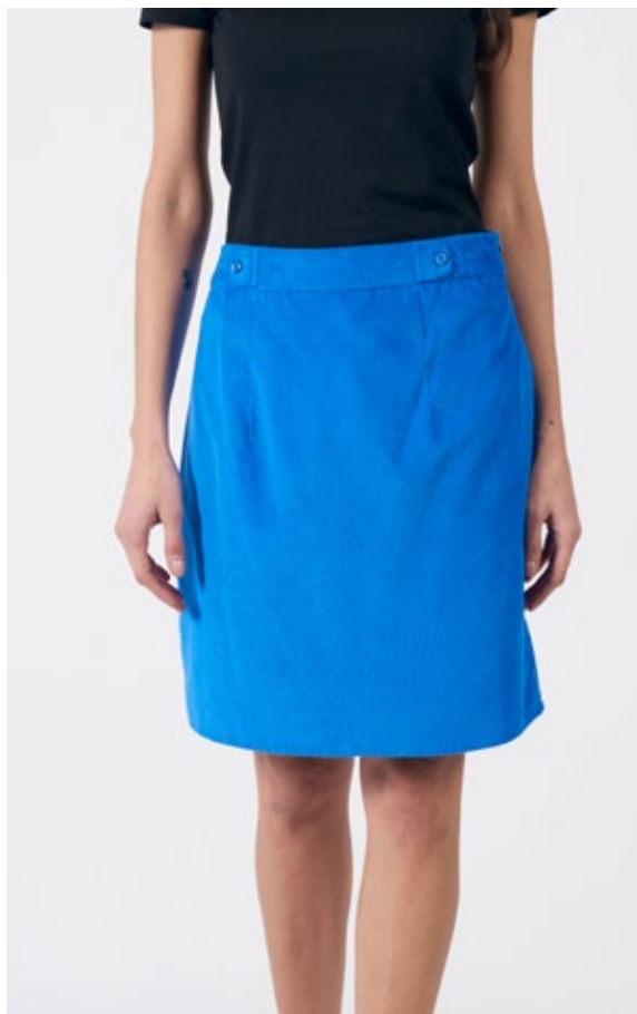
STYLE: MELANIE PRINT: PRINCESS BLUE FABRIC: 100% COTTON CORDUROY