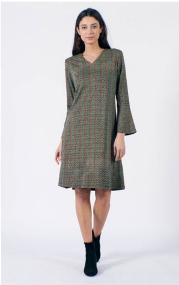
STYLE: SONYA PRINT: GREEN LEAF FABRIC: 97% VISCOSE, 3% ELASTANE FSC CERTIFIED FABRIC