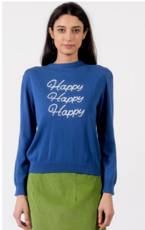
STYLE: HAPPY COLOUR: TRUE BLUE FABRIC: 100% ORGANIC COTTON