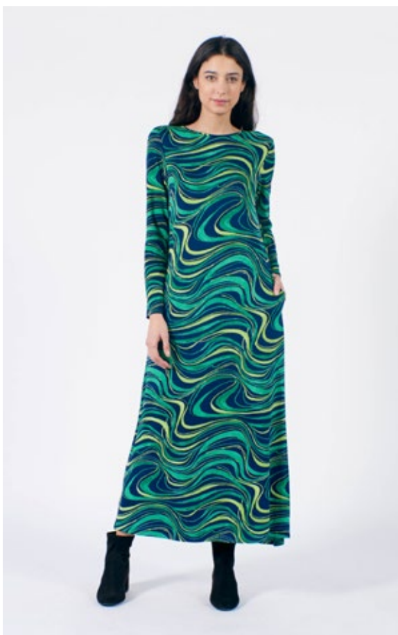
STYLE: DELLA DRESS PRINT: LIME SWIRL FABRIC: 97% VISCOSE, 3% ELASTANE FSC CERTIFIED FABRIC

SIZES: UK8/XS UK10/S UK12/M UK14/L UK16/XL UK18/XXL