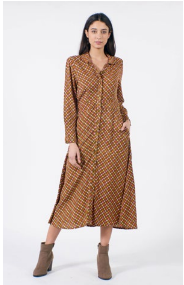
STYLE: JONIE PRINT: PINK DIAMONDS FABRIC: 100% VISCOSE FSC CERTIFIED FABRIC