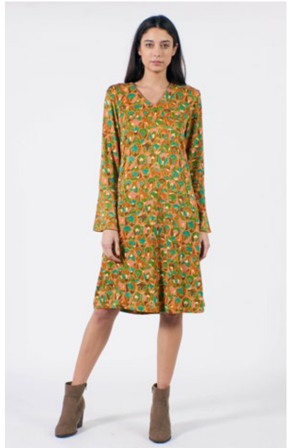
STYLE: SONYA PRINT: CLOWN FABRIC: 97% VISCOSE, 3% ELASTANE FSC CERTIFIED FABRIC

SIZES: UK8/XS, UK10/S UK12/M UK14/L UK16/XL UK18/XXL