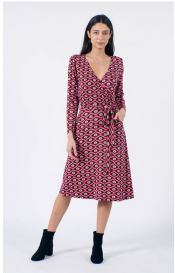
STYLE: CLARA PRINT: GOOD LIFE FABRIC: 97% VISCOSE, 3% ELASTANE FSC CERTIFIED FABRIC