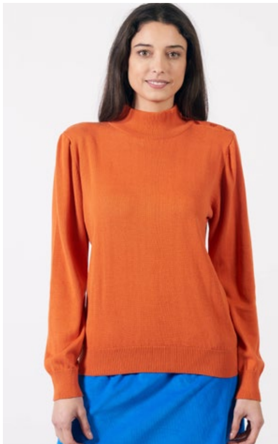
STYLE: BUTTON SHOULDER COLOUR: JAFFA FABRIC: 100% ORGANIC COTTON

SIZES: UK8/XS, UK10/S UK12/M UK14/L UK16/XL UK18/XXL