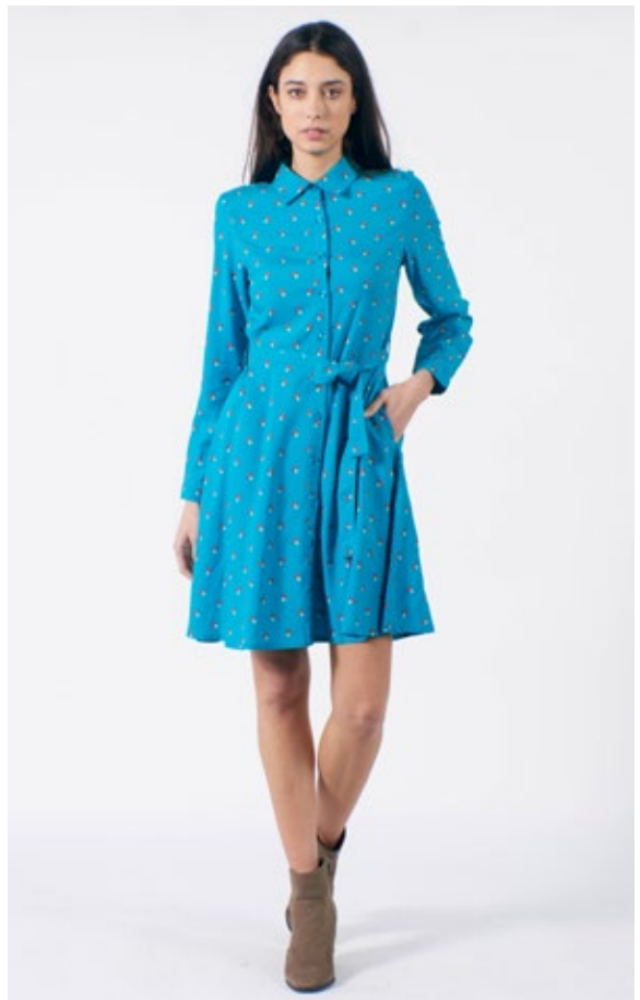
STYLE: TIFFANY PRINT: TOADSTOOL FABRIC: 100% VISCOSE FSC CERTIFIED FABRIC

SIZES: UK8/XS, UK10/S UK12/M UK14/L UK16/XL UK18/XXL