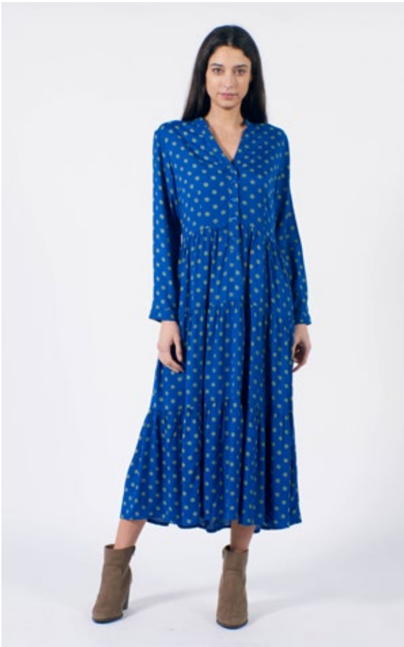
STYLE: INDIA PRINT: POLKA FABRIC: 100% VISCOSE FSC CERTIFIED FABRIC

SIZES: UK8/XS, UK10/S UK12/M UK14/L UK16/XL UK18/XXL