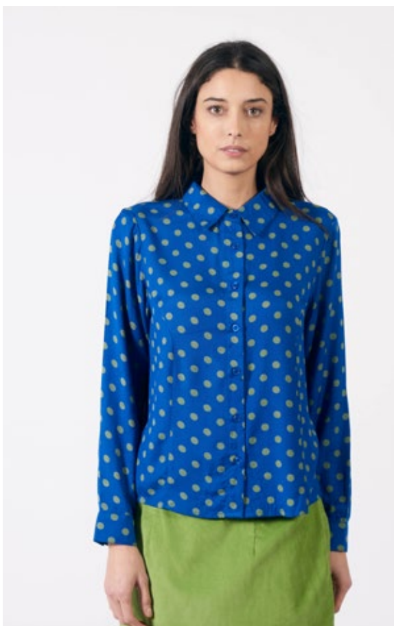
STYLE: OLIVE PRINT: POLKA FABRIC: 100% VISCOSE FSC CERTIFIED FABRIC