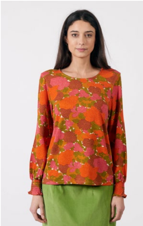
STYLE: HELGA PRINT: FALL FLOWERS FABRIC: 97% VISCOSE, 3% ELASTANE FSC CERTIFIED FABRIC