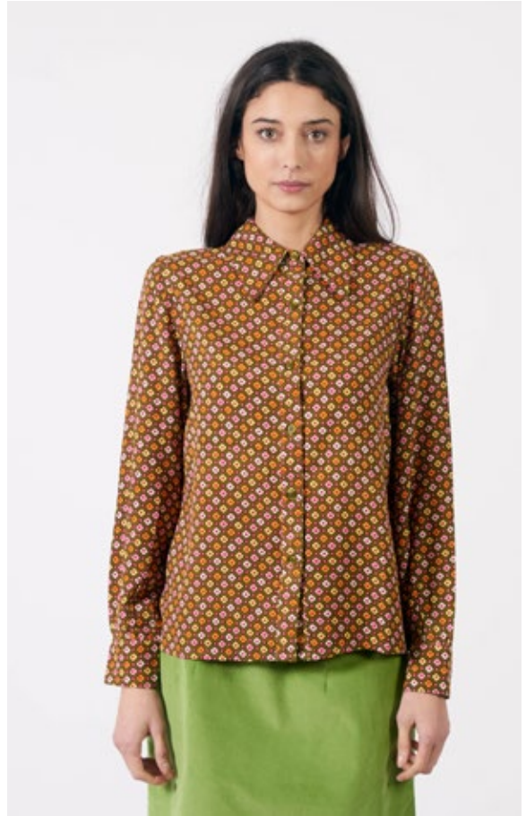
STYLE: 70'S BLOUSE PRINT: PINK DIAMONDS FABRIC: 100% VISCOSE FSC CERTIFIED FABRIC

SIZES: UK8/XS, UK10/S, UK12/M, UK14/L, UK16/XL, UK18/XXL