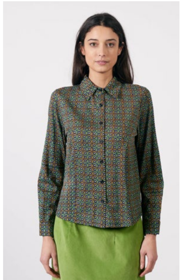
STYLE: OLIVE PRINT: GREEN LEAF FABRIC: 97% VISCOSE, 3% ELASTANE FSC CERTIFIED FABRIC