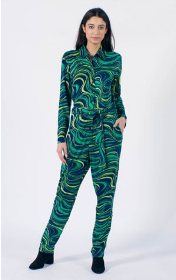
STYLE: ORLA JUMPSUIT PRINT: LIME SWIRL FABRIC: 97% VISCOSE,3% ELASTANE FSC CERTIFIED FABRIC

SIZES: UK8/XS, UK10/S UK12/M UK14/L UK16/XL UK18/XXL