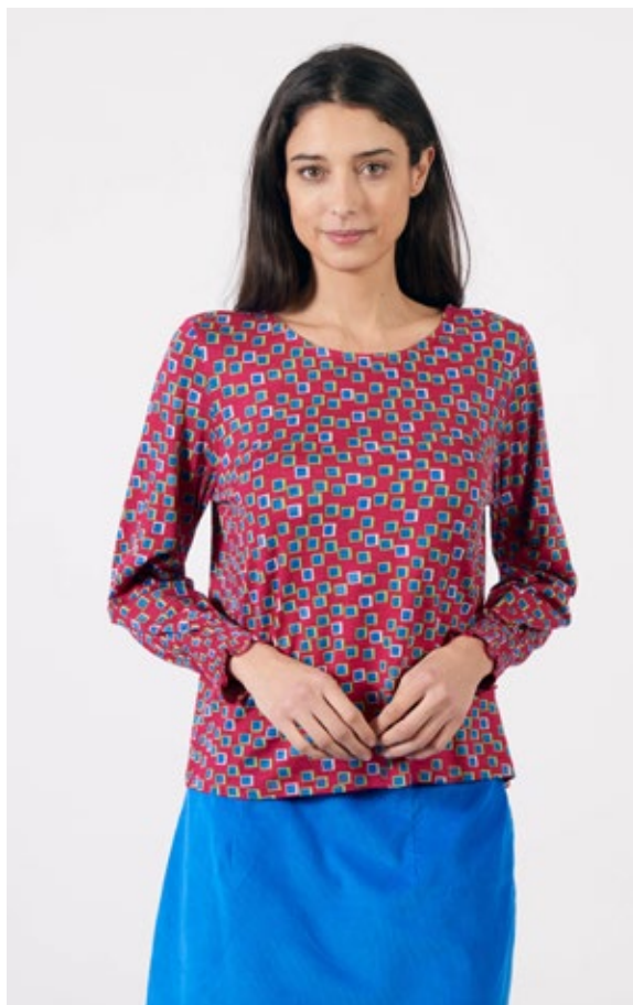
STYLE: HELGA PRINT: CUBE FABRIC: 97% VISCOSE, 3% ELASTANE FSC CERTIFIED FABRIC

SIZES: UK8/XS, UK10/S, UK12/M, UK14/L, UK16/XL, UK18/XXL