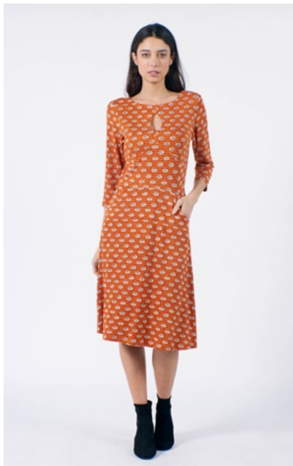
STYLE: FIFI PRINT: HEART FLOWER FABRIC: 97% VISCOSE, 3% ELASTANE FSC CERTIFIED FABRIC

SIZES: UK8/XS, UK10/S, UK12/M, UK14/L, UK16/XL, UK18/XXL