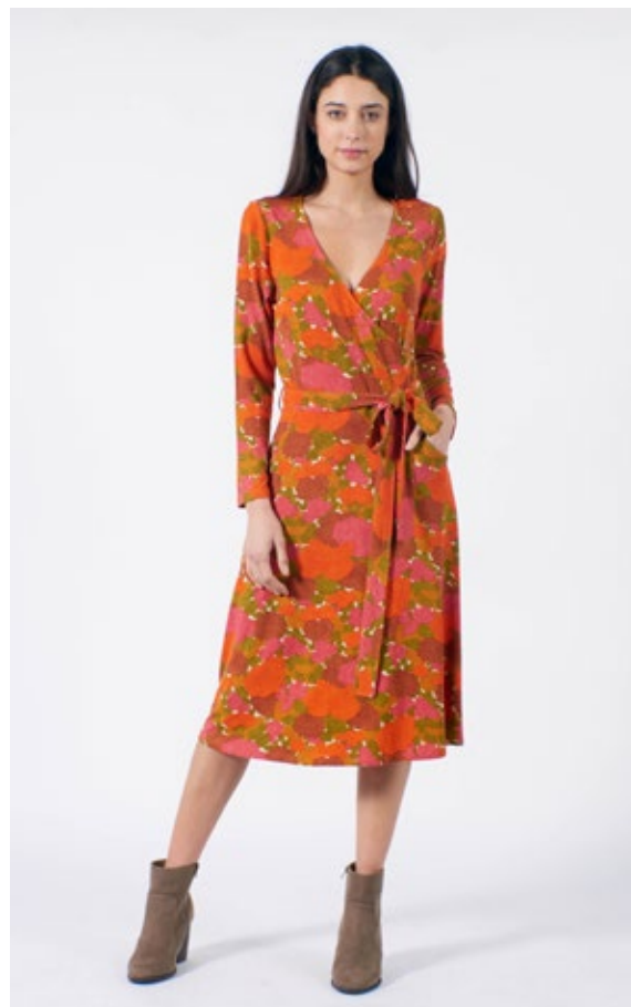
STYLE: CLARA PRINT: FALL FLOWERS FABRIC: 97% VISCOSE, 3% ELASTANE FSC CERTIFIED FABRIC