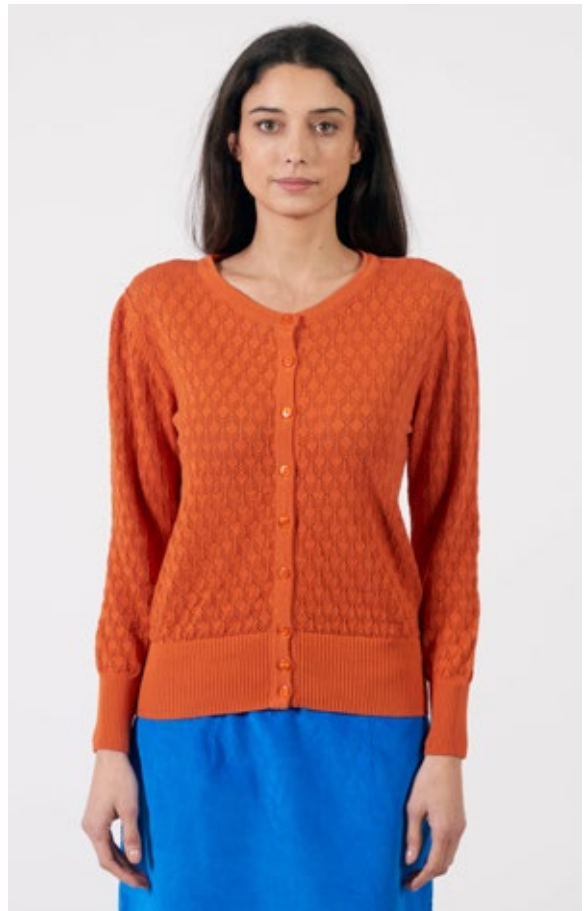
STYLE: GWEN POINTELLE CARDIGAN COLOUR: RED BUD FABRIC: 100% ORGANIC COTTON

SIZES: UK8/XS, UK10/S UK12/M UK14/L UK16/XL UK18/XXL