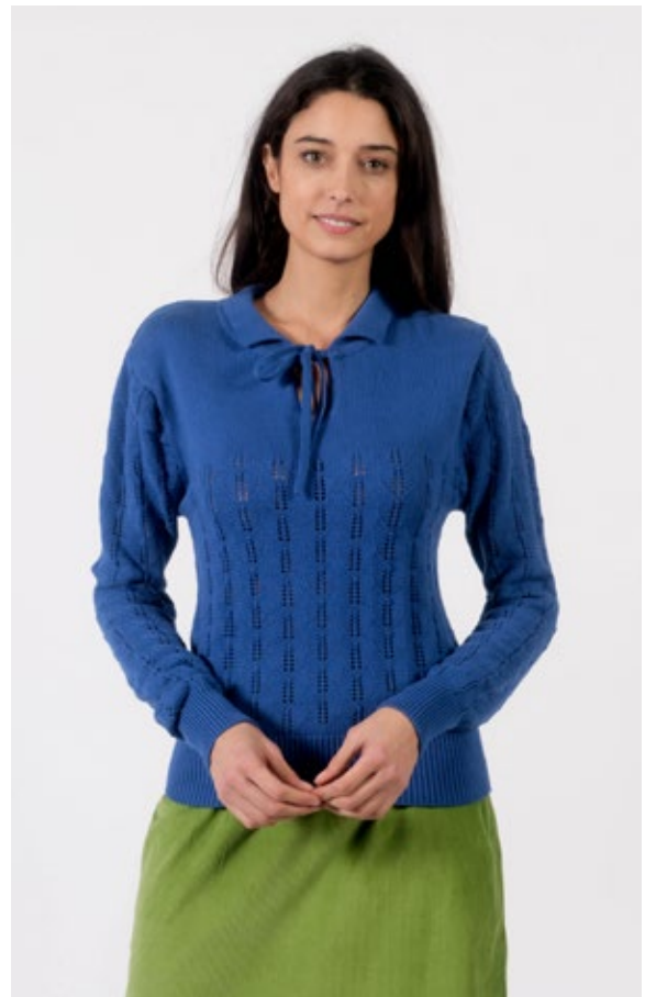
STYLE: DINA COLOUR: TRUE BLUE FABRIC: 100% ORGANIC COTTON