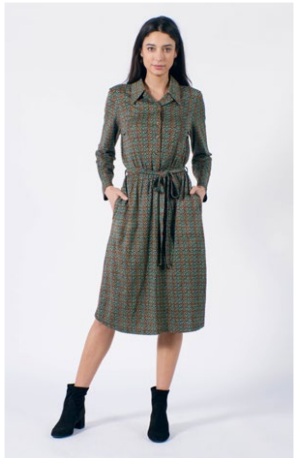
STYLE: GERTIE PRINT: GREEN LEAF FABRIC: 97% VISCOSE, 3% ELASTANE FSC CERTIFIED FABRIC