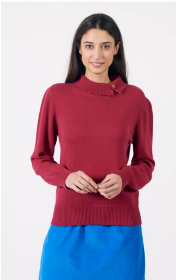
STYLE: CHRISTINA ROLL NECK COLOUR: RED BUD FABRIC: 100% ORGANIC COTTON