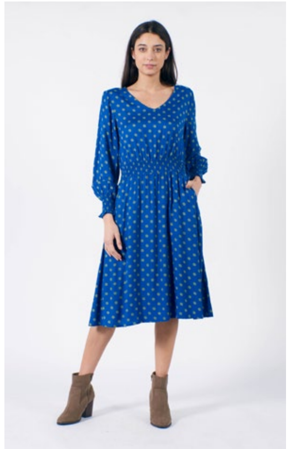
STYLE: HILDA PRINT: POLKA FABRIC: 100% VISCOSE FSC CERTIFIED FABRIC

SIZES: UK8/XS, UK10/S UK12/M UK14/L UK16/XL UK18/XXL