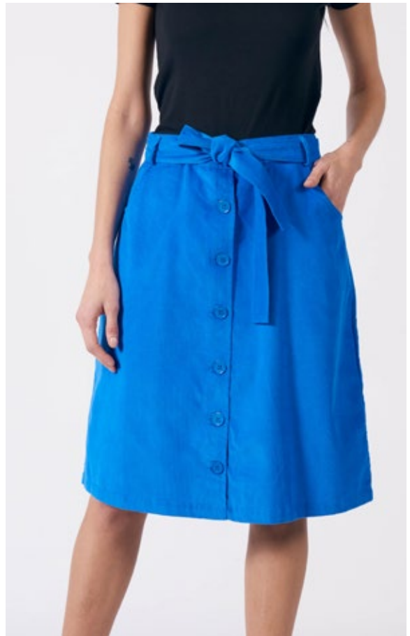
STYLE: AGNETHA PRINT: PRINCESS BLUE FABRIC: 100% COTTON CORDUROY

SIZES: UK8/XS, UK10/S UK12/M UK14/L UK16/XL UK18/XXL