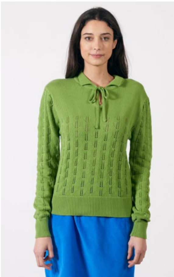
STYLE: DINA COLOUR: PERIDOT FABRIC: 100% ORGANIC COTTON