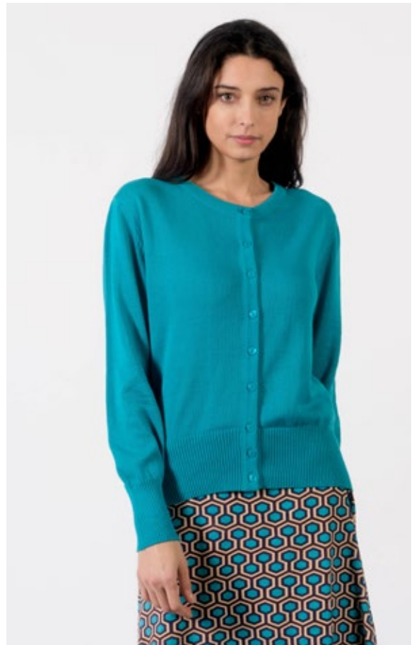
STYLE: BASIC CARDIGAN COLOUR: TILE BLUE FABRIC: 100% ORGANIC COTTON

SIZES: UK8/XS, UK10/S UK12/M UK14/L UK16/XL UK18/XXL