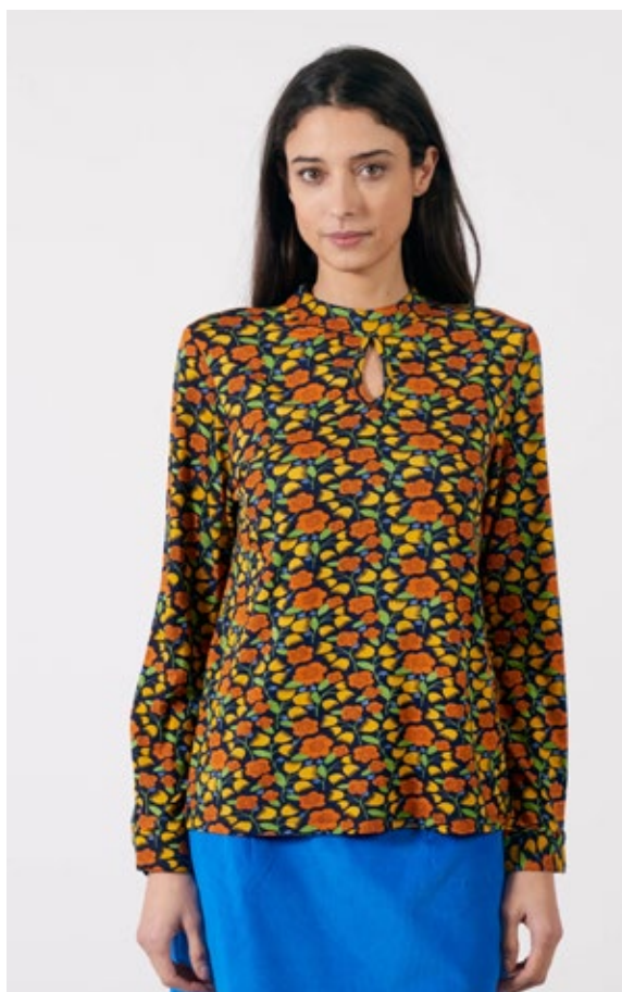
STYLE: EDIE PRINT: MIMOSA FABRIC: 97% VISCOSE, 3% ELASTANE FSC CERTIFIED FABRIC