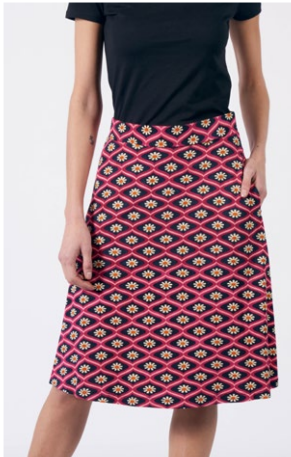
STYLE: BLOSSOM PRINT: GOOD LIFE FABRIC: 97% VISCOSE, 3% ELASTANE FSC CERTIFIED FABRIC