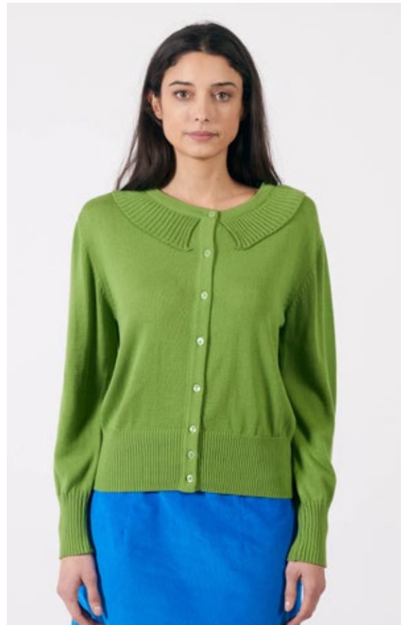
STYLE: JO CARDIGAN COLOUR: PERIDOT FABRIC: 100% ORGANIC COTTON

SIZES: UK8/XS, UK10/S UK12/M UK14/L UK16/XL UK18/XXL