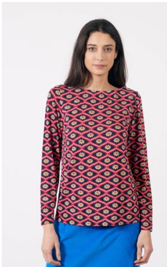
STYLE: ANNE PRINT: GOOD LIFE FABRIC: 97% VISCOSE, 3% ELASTANE FSC CERTIFIED FABRIC