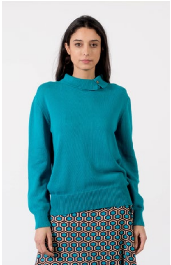
STYLE: CHRISTINA ROLL NECK COLOUR: TILE BLUE FABRIC: 100% ORGANIC COTTON