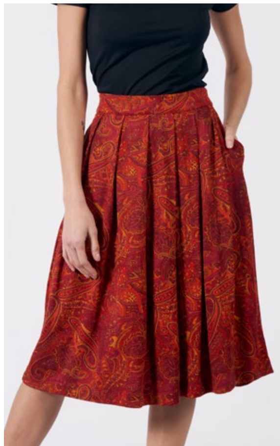
STYLE: MAGGIE PRINT: PAISLEY FABRIC: 97% VISCOSE, 3% ELASTANE FSC CERTIFIED FABRIC