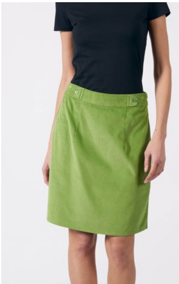
STYLE: MELANIE PRINT: PERIDOT FABRIC: 100% COTTON CORDUROY