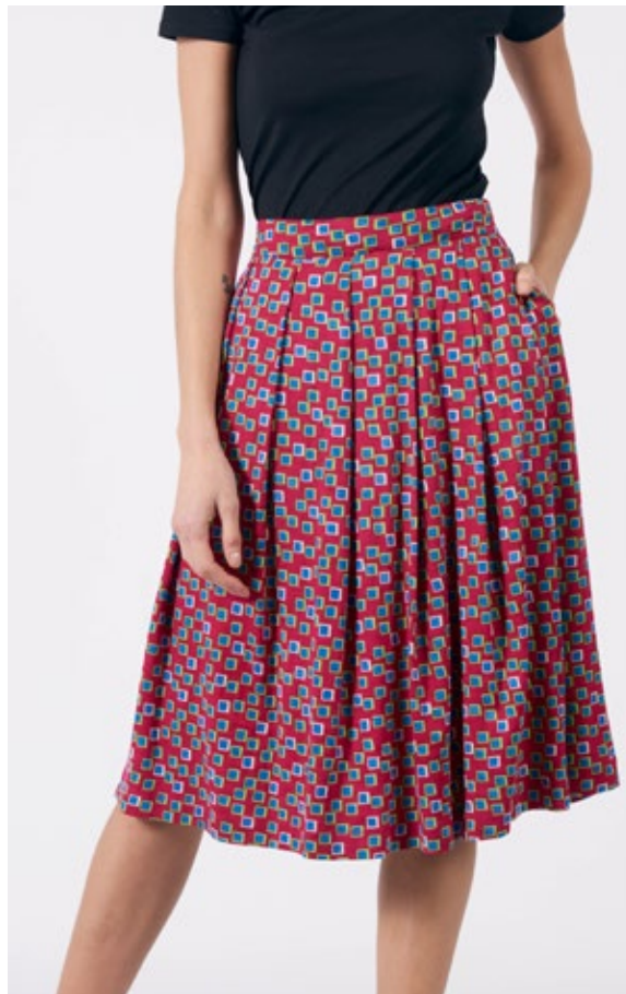
STYLE: MAGGIE PRINT: CUBE FABRIC: 97% VISCOSE, 3% ELASTANE FSC CERTIFIED FABRIC