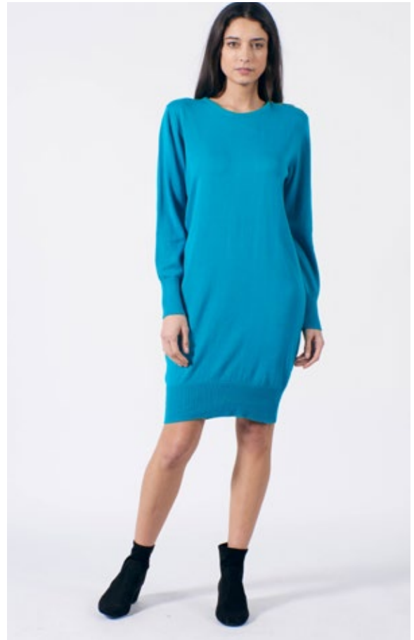
STYLE: TUNIC COLOUR: TRUE BLUE FABRIC: 100% ORGANIC COTTON

SIZES: UK8/XS, UK10/S UK12/M UK14/L UK16/XL UK18/XXL