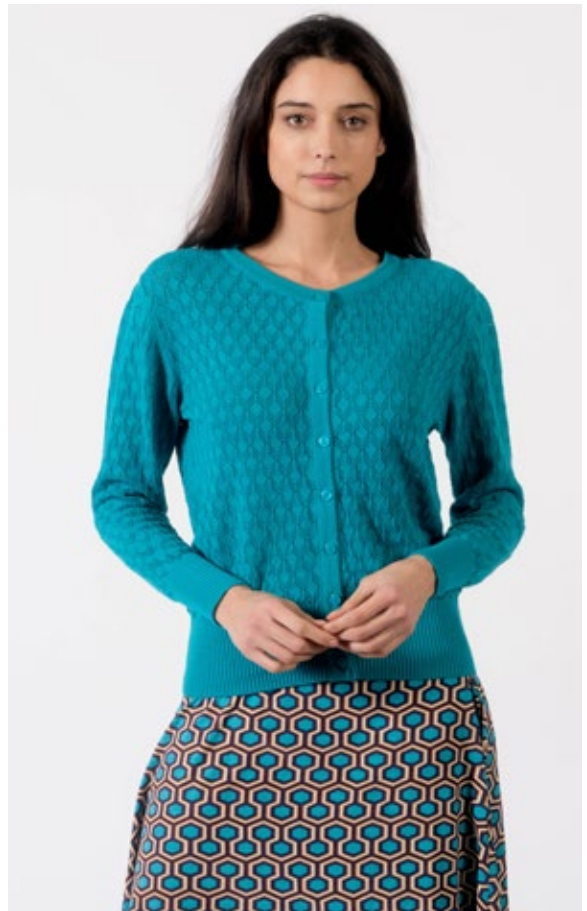
STYLE: GWEN POINTELLE CARDIGAN COLOUR: TILE BLUE FABRIC: 100% ORGANIC COTTON

SIZES: UK8/XS, UK10/S UK12/M UK14/L UK16/XL UK18/XXL