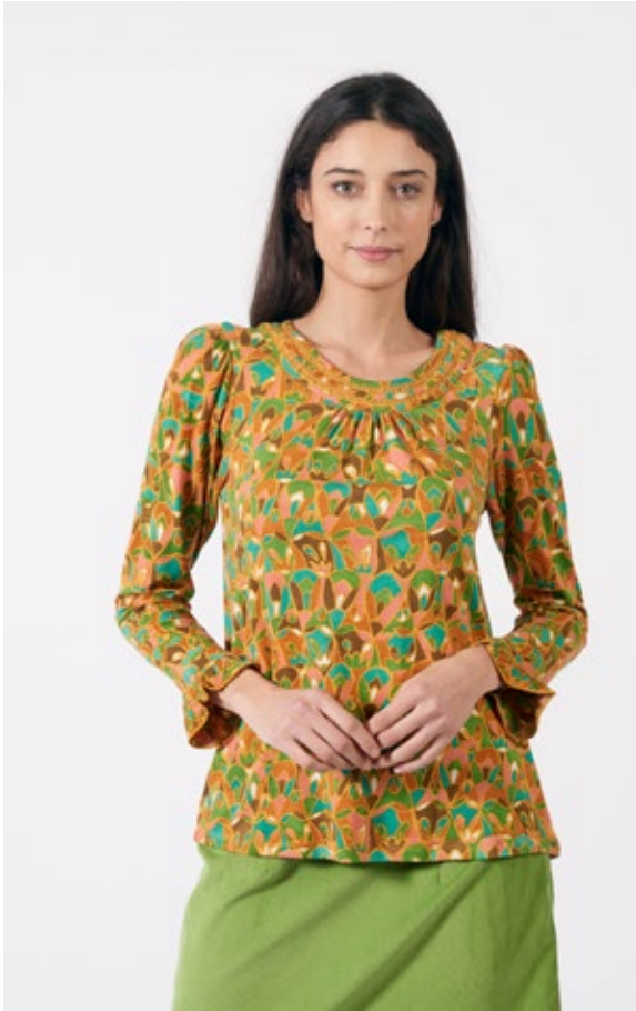
STYLE: RIZZO PRINT: CLOWN FABRIC: 97% VISCOSE, 3% ELASTANE FSC CERTIFIED FABRIC

SIZES: UK8/XS, UK10/S, UK12/M, UK14/L, UK16/XL, UK18/XXL