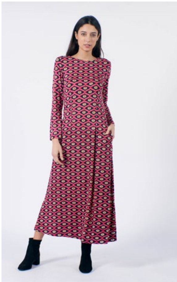
STYLE: DELLA PRINT: GOOD LIFE FABRIC: 97% VISCOSE, 3% ELASTANE FSC CERTIFIED FABRIC