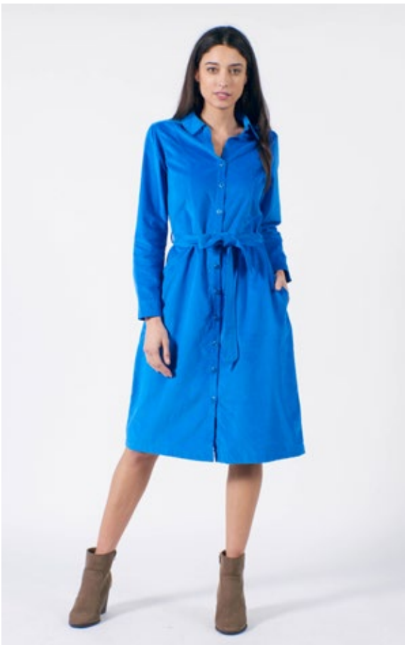
STYLE: PAULA PRINT: PRINCESS BLUE FABRIC: 100% COTTON CORDUROY