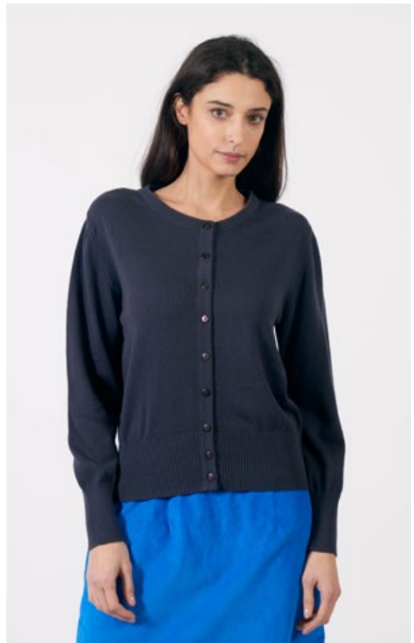
STYLE: BASIC CARDIGAN COLOUR: BLACK ONYX FABRIC: 100% ORGANIC COTTON