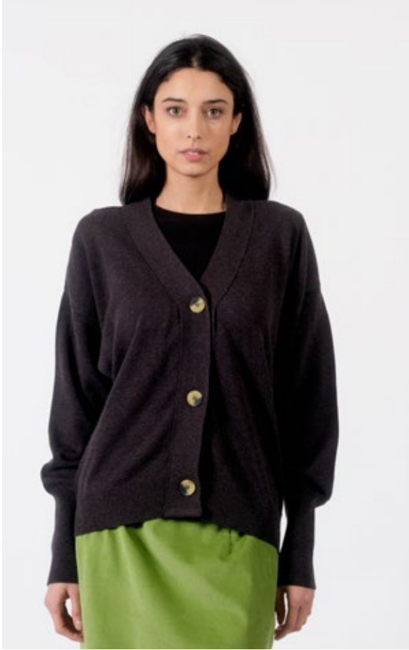
STYLE: OVERSIZED CARDIGAN PRINT: CHARCOAL FABRIC: 70% WOOL / 30% COTTON

SIZES: UK8/XS, UK10/S UK12/M UK14/L UK16/XL UK18/XXL