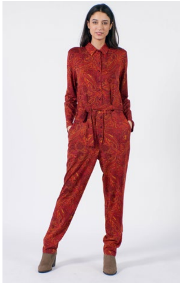
STYLE: ORLA JUMPSUIT PRINT: PAISLEY FABRIC: 97% VISCOSE,3% ELASTANE FSC CERTIFIED FABRIC