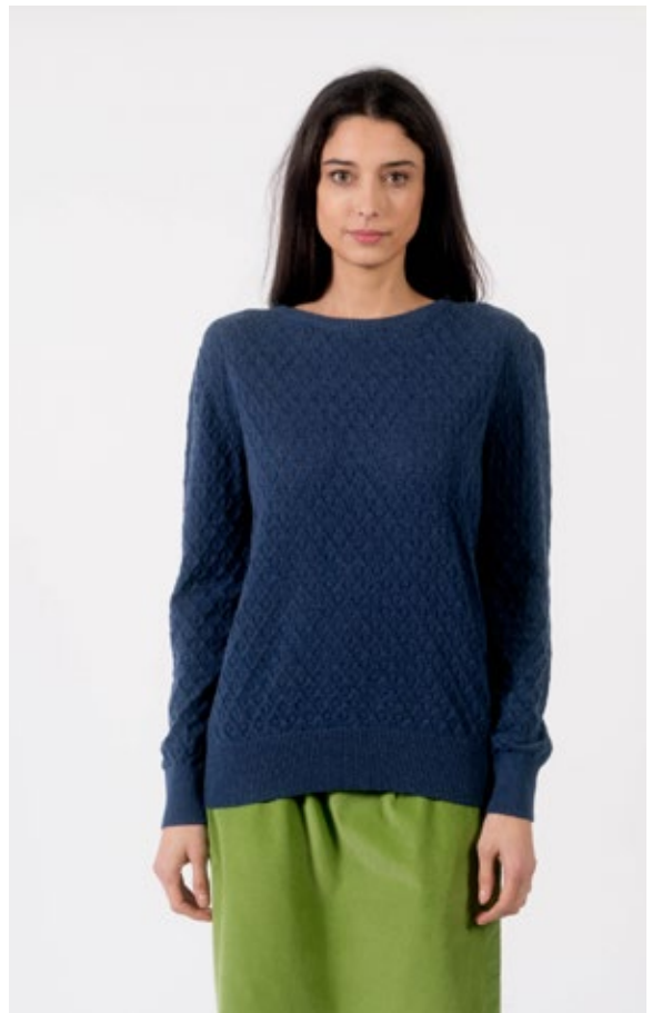
STYLE: DIDI POINTELLE PRINT: NAVY FABRIC: 70% WOOL / 30% COTTON