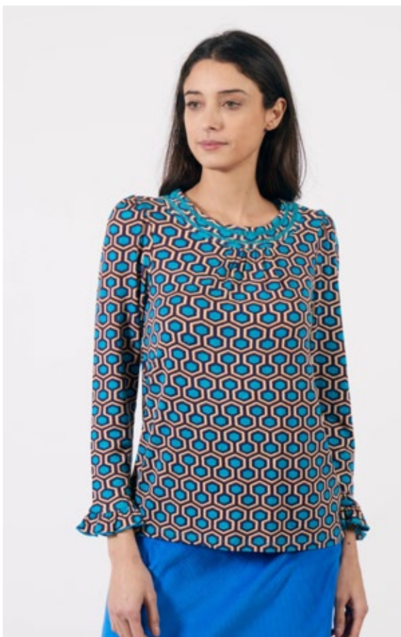
STYLE: RIZZO PRINT: HEX FABRIC: 97% VISCOSE, 3% ELASTANE FSC CERTIFIED FABRIC

SIZES: UK8/XS, UK10/S UK12/M UK14/L UK16/XL UK18/XXL