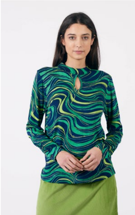
STYLE: EDIE PRINT: LIME SWIRL FABRIC: 97% VISCOSE, 3% ELASTANE FSC CERTIFIED FABRIC

SIZES: UK8/XS, UK10/S, UK12/M, UK14/L, UK16/XL, UK18/XXL