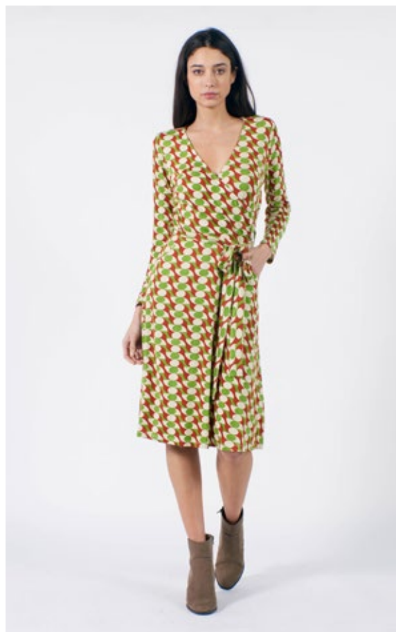
STYLE: CLARA PRINT: SWOOSH FABRIC: 97% VISCOSE, 3% ELASTANE FSC CERTIFIED FABRIC