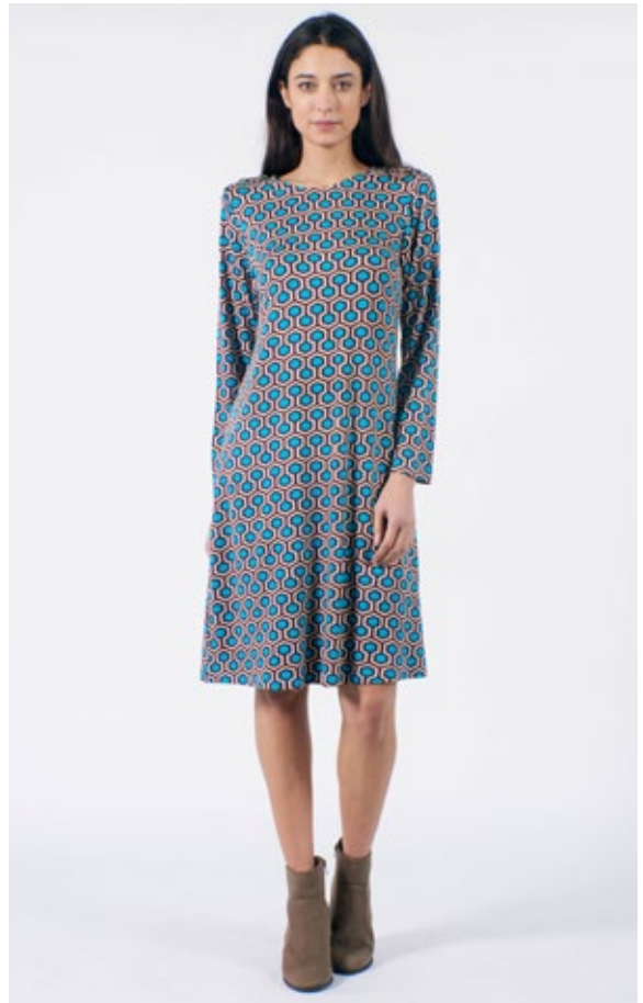
STYLE: BELLE PRINT: HEX FABRIC: 97% VISCOSE,3% ELASTANE FSC CERTIFIED FABRIC