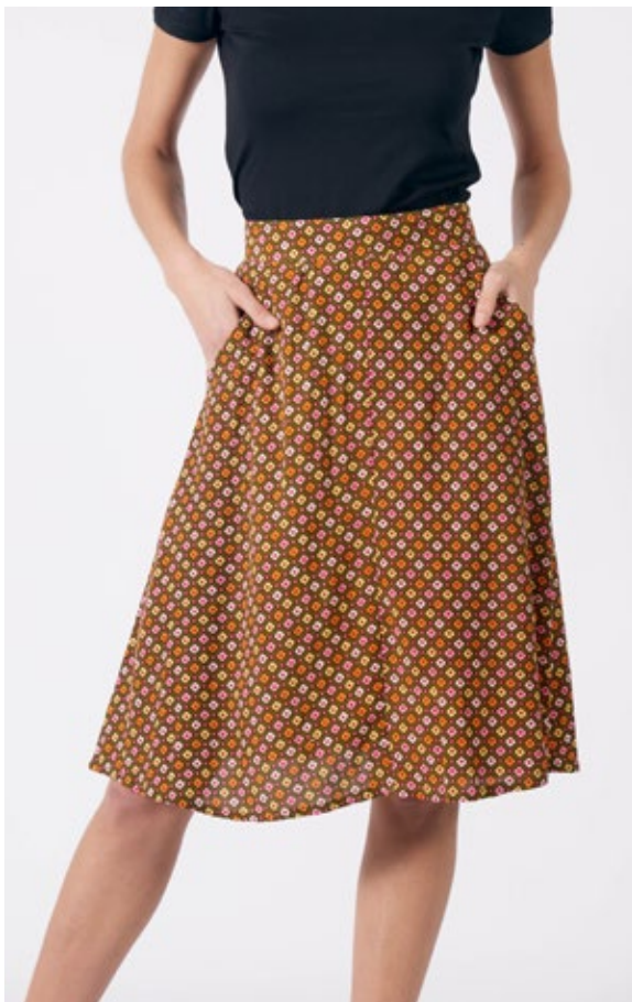
STYLE: ANNABEL PRINT: PINK DIAMONDS FABRIC: 100% VISCOSE FSC CERTIFIED FABRIC

SIZES: UK8/XS, UK10/S UK12/M UK14/L UK16/XL UK18/XXL