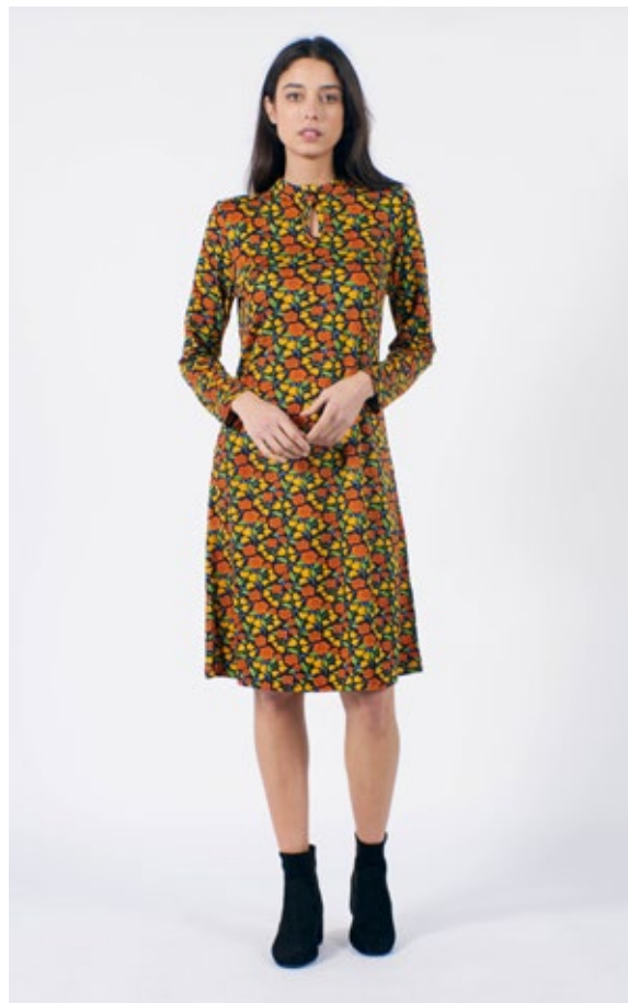
STYLE: ELEANOR PRINT: MIMOSA FABRIC: 97% VISCOSE 3% ELASTANE FSC CERTIFIED FABRIC

SIZES: UK8/XS, UK10/S UK12/M UK14/L UK16/XL UK18/XXL