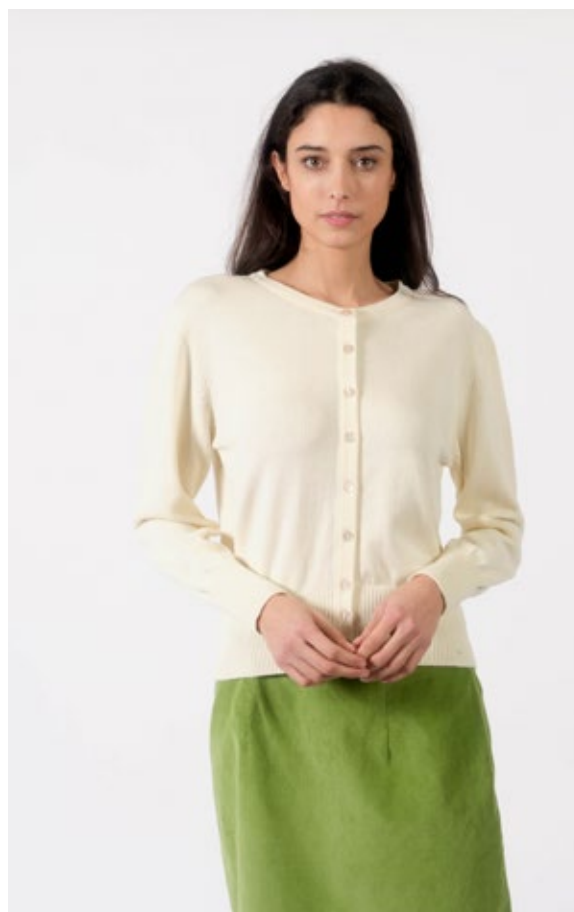
STYLE: BASIC CARDIGAN COLOUR: ANTIQUE WHITE FABRIC: 100% ORGANIC COTTON