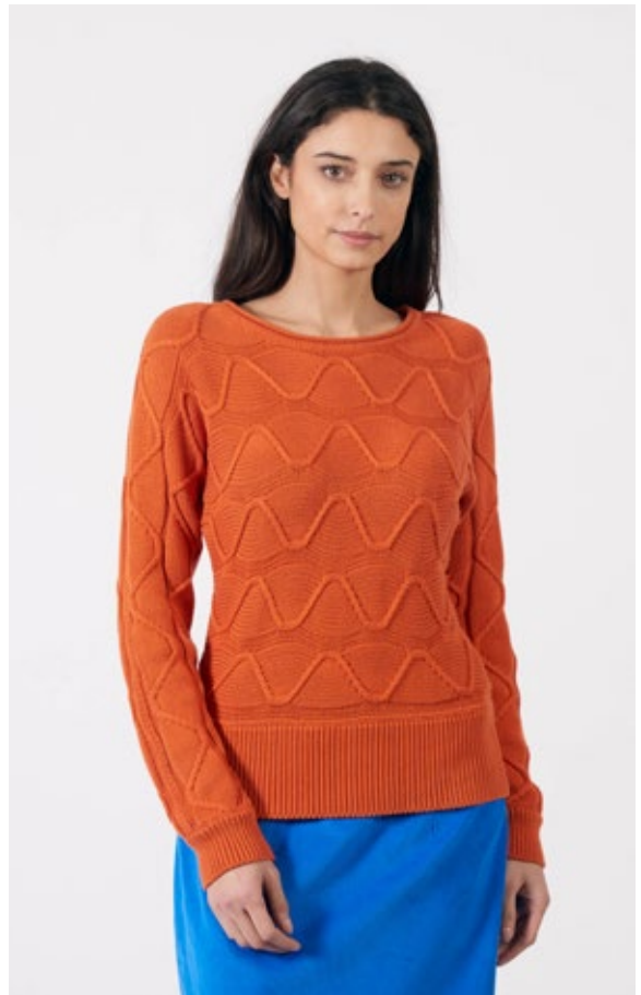
STYLE: RENEE BATWING COLOUR: JAFFA FABRIC: 100% ORGANIC COTTON

SIZES: UK8/XS, UK10/S UK12/M UK14/L UK16/XL UK18/XXL