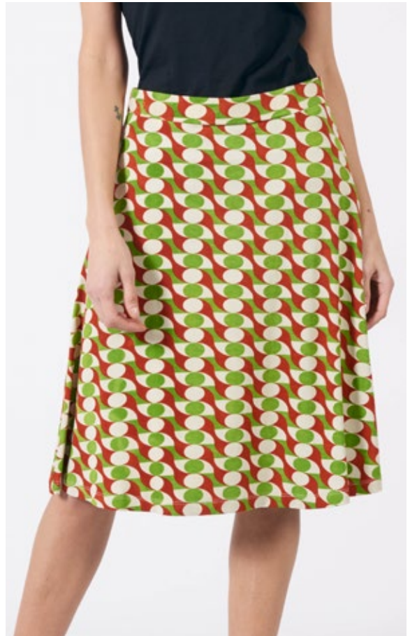
STYLE: BLOSSOM PRINT: SWOOSH FABRIC: 97% VISCOSE, 3% ELASTANE FSC CERTIFIED FABRIC

SIZES: UK8/XS, UK10/S, UK12/M, UK14/L, UK16/XL, UK18/XXL