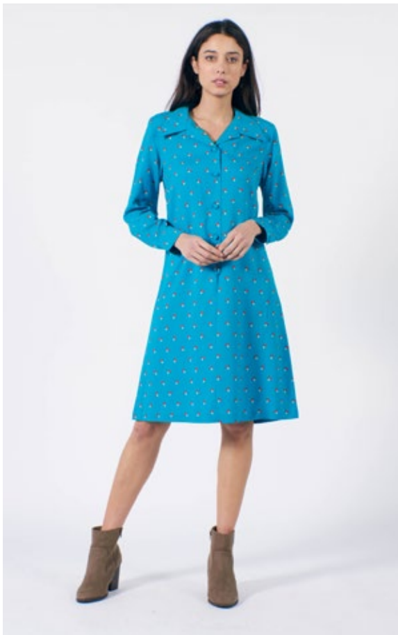
STYLE: BECKY PRINT: TOADSTOOL FABRIC: 100% VISCOSE FSC CERTIFIED FABRIC

SIZES: UK8/XS, UK10/S UK12/M UK14/L UK16/XL UK18/XXL