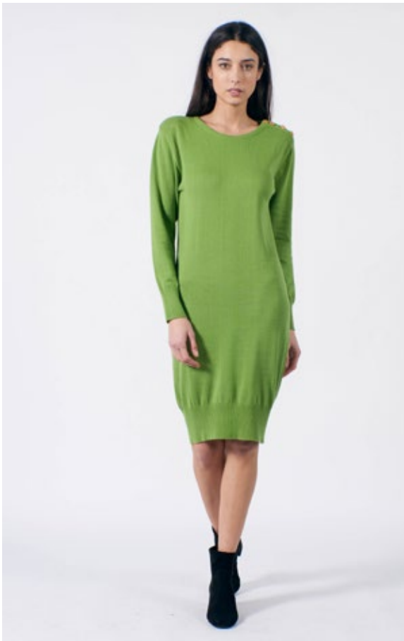
STYLE: TUNIC COLOUR: PERIDOT FABRIC: 100% ORGANIC COTTON