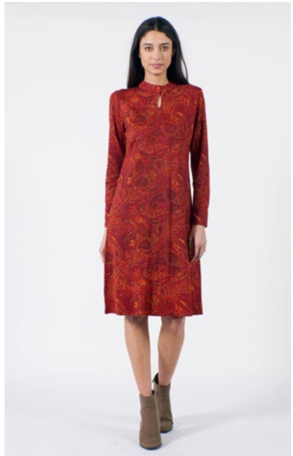
STYLE: ELEANOR PRINT: PAISLEY FABRIC: 97% VISCOSE, 3% ELASTANE FSC CERTIFIED FABRIC

SIZES: UK8/XS, UK10/S UK12/M UK14/L UK16/XL UK18/XXL