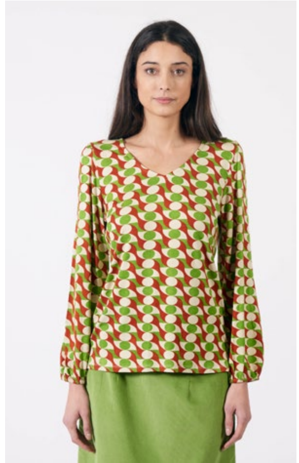
STYLE: BARBARA PRINT: SWOOSH FABRIC: 97% VISCOSE, 3% ELASTANE FSC CERTIFIED FABRIC

SIZES: UK8/XS, UK10/S, UK12/M, UK14/L, UK16/XL, UK18/XXL