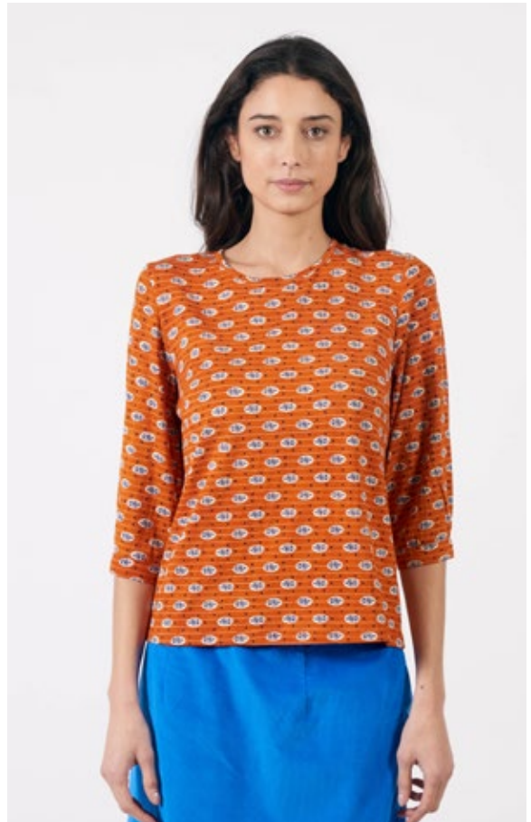
STYLE: MABEL PRINT: HEART FLOWER FABRIC: 97% VISCOSE, 3% ELASTANE FSC CERTIFIED FABRIC