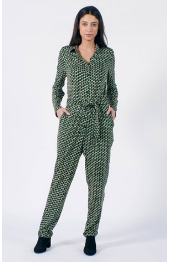
STYLE: ORLA JUMPSUIT PRINT: SQUIGGLE FABRIC: 97% VISCOSE,3% ELASTANE FSC CERTIFIED FABRIC

SIZES: UK8/XS, UK10/S UK12/M UK14/L UK16/XL UK18/XXL