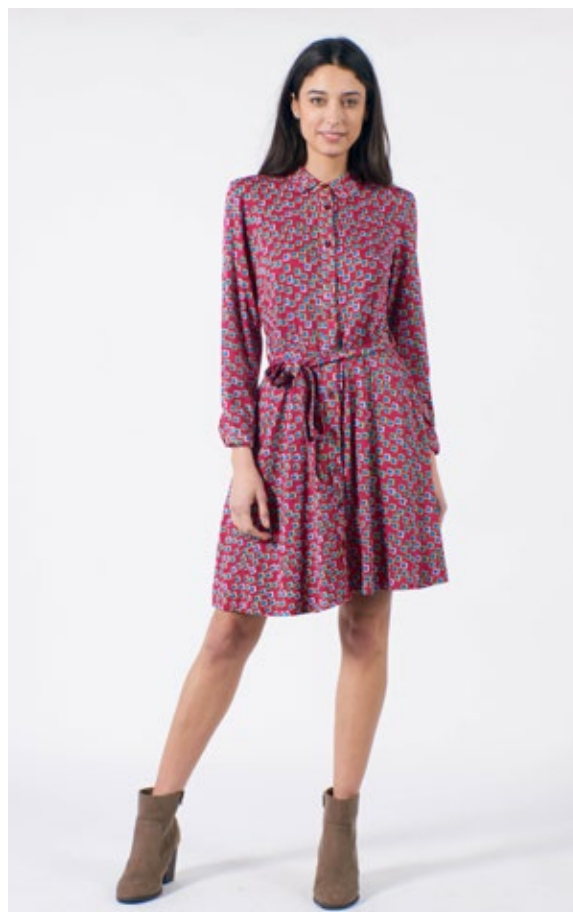
STYLE: TIFFANY PRINT: CUBE FABRIC: 97% VISCOSE, 3% ELASTANE FSC CERTIFIED FABRIC