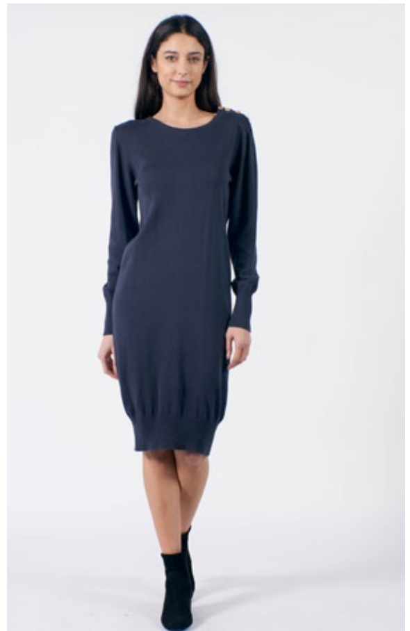
STYLE: TUNIC COLOUR: BLACK ONYX FABRIC: 100% ORGANIC COTTON