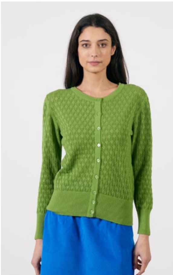
STYLE: GWEN POINTELLE CARDIGAN COLOUR: PERIDOT FABRIC: 100% ORGANIC COTTON