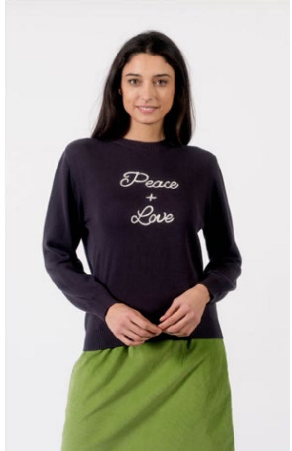
STYLE: PEACE AND LOVE COLOUR: BLACK ONYX FABRIC: 100% ORGANIC COTTON

SIZES: UK8/XS, UK10/S UK12/M UK14/L UK16/XL UK18/XXL