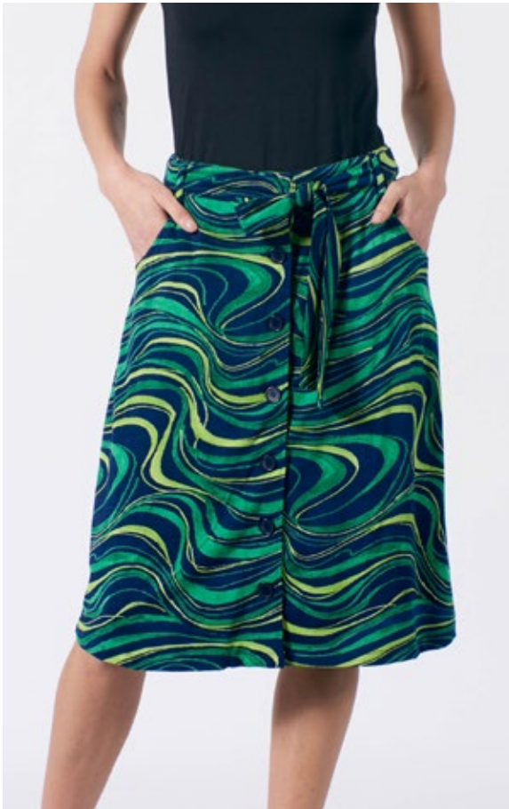
STYLE: AGNETHA PRINT: LIME SWIRL FABRIC: 97% VISCOSE, 3% ELASTANE FSC CERTIFIED FABRIC

SIZES: UK8/XS, UK10/S, UK12/M, UK14/L, UK16/XL, UK18/XXL