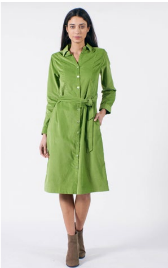
STYLE: PAULA PRINT: PERIDOT FABRIC: 100% COTTON CORDUROY