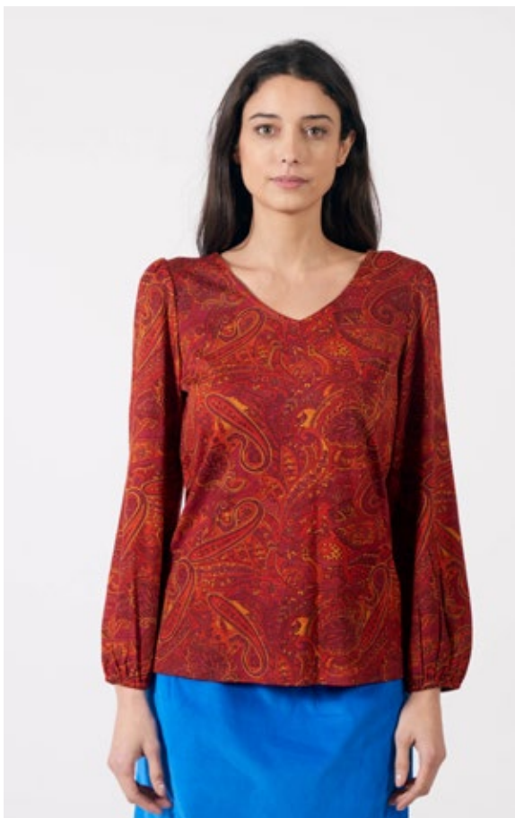
STYLE: BARBARA PRINT: PAISLEY FABRIC: 97% VISCOSE, 3% ELASTANE FSC CERTIFIED FABRIC

SIZES: UK8/XS, UK10/S, UK12/M, UK14/L, UK16/XL, UK18/XXL