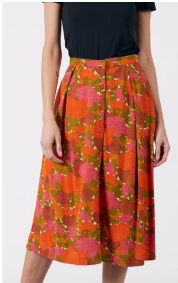
STYLE: LENA PRINT: FALL FLOWERS FABRIC: 97% VISCOSE, 3% ELASTANE FSC CERTIFIED FABRIC

SIZES: UK8/XS, UK10/S UK12/M UK14/L UK16/XL UK18/XXL