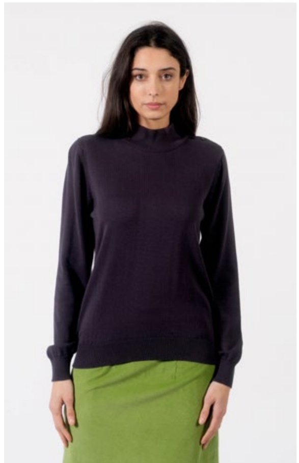
STYLE: BUTTON SHOULDER COLOUR: BLACK ONYX FABRIC: 100% ORGANIC COTTON