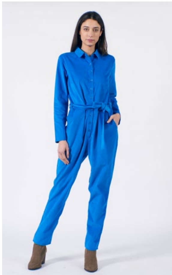
STYLE: ORLA JUMPSUIT PRINT: PRINCESS BLUE FABRIC: 100% COTTON CORDUROY

SIZES: UK8/XS, UK10/S UK12/M UK14/L UK16/XL UK18/XXL