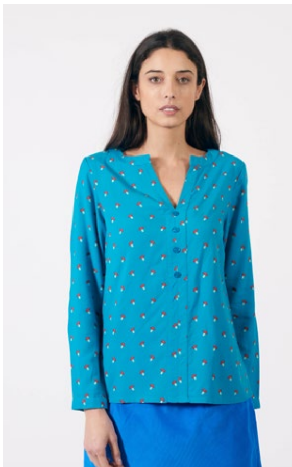
STYLE: DEBORAH PRINT: TOADSTOOL FABRIC: 100% VISCOSE FSC CERTIFIED FABRIC

SIZES: UK8/XS, UK10/S UK12/M UK14/L UK16/XL UK18/XXL