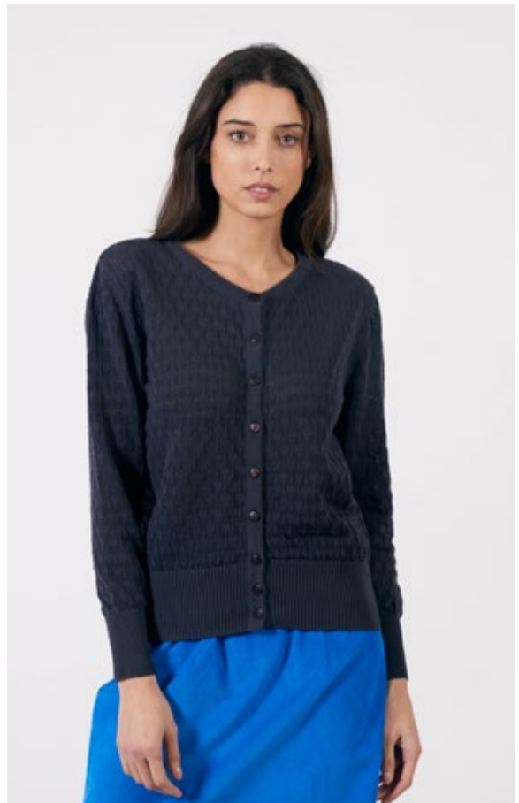
STYLE: GWEN POINTELLE CARDIGAN COLOUR: BLACK ONYX FABRIC: 100% ORGANIC COTTON