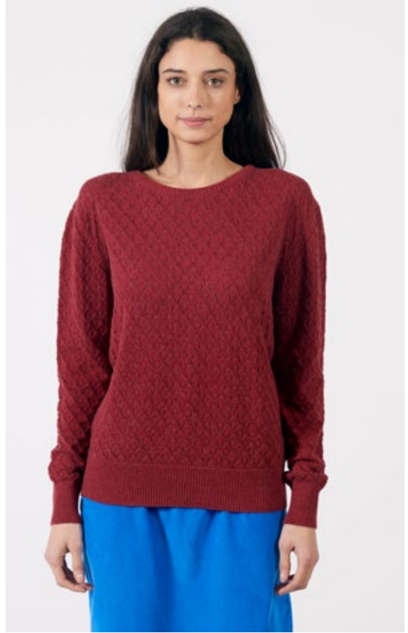
STYLE: DIDI POINTELLE PRINT: BURGUNDY FABRIC: 70% WOOL / 30% COTTON

SIZES: UK8/XS, UK10/S UK12/M UK14/L UK16/XL UK18/XXL