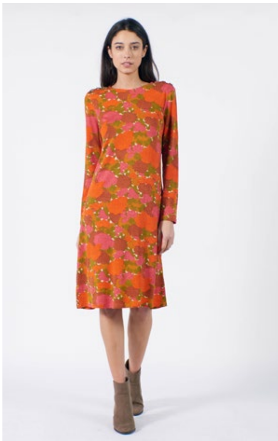
STYLE: BELLE PRINT: FALL FLOWERS FABRIC: 97% VISCOSE, 3% ELASTANE FSC CERTIFIED FABRIC