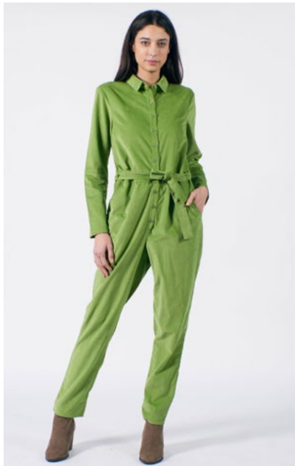
STYLE: ORLA JUMPSUIT PRINT: PERIDOT FABRIC: 100% COTTON CORDUROY

SIZES: UK8/XS, UK10/S UK12/M UK14/L UK16/XL UK18/XXL