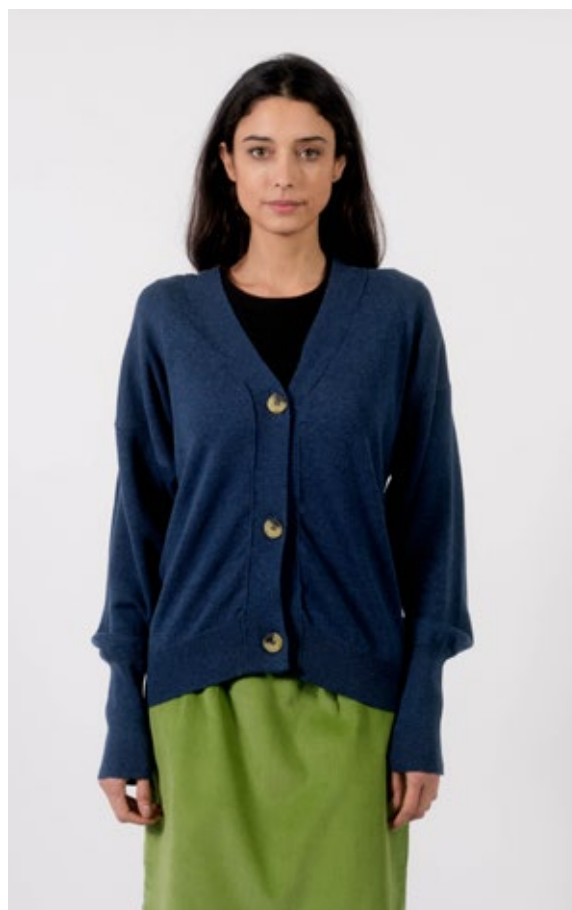
STYLE: OVERSIZED CARDIGAN COLOUR: NAVY BLUE FABRIC: 70% WOOL / 30% COTTON