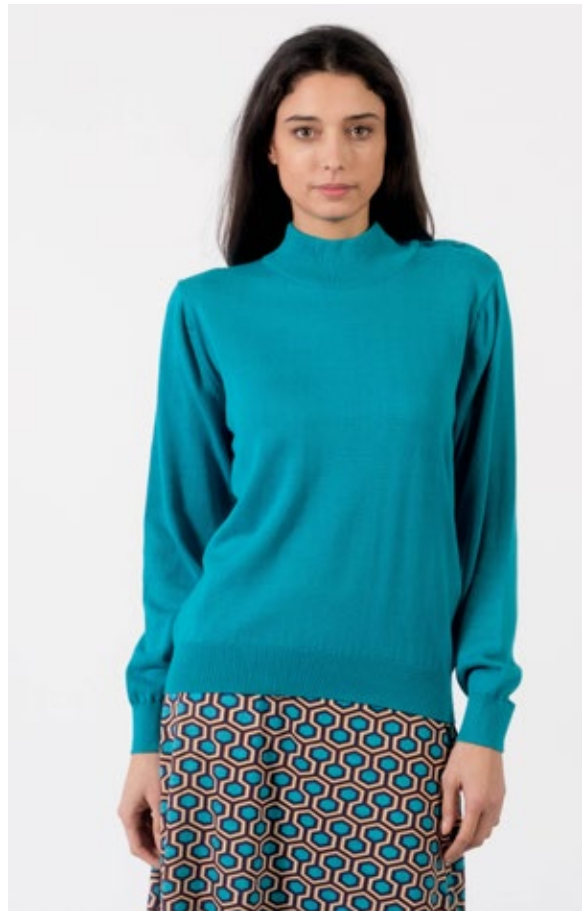
STYLE: BUTTON SHOULDER COLOUR: TILE BLUE FABRIC: 100% ORGANIC COTTON

SIZES: UK8/XS, UK10/S UK12/M UK14/L UK16/XL UK18/XXL