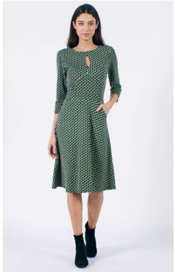
STYLE: FIFI PRINT: SQUIGGLE FABRIC: 97% VISCOSE, 3% ELASTANE FSC CERTIFIED FABRIC

SIZES: UK8/XS, UK10/S UK12/M UK14/L UK16/XL UK18/XXL