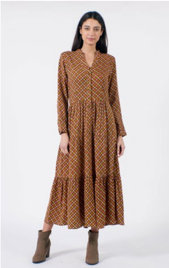
STYLE: INDIA PRINT: PINK DIAMONDS FABRIC: 100% VISCOSE FSC CERTIFIED FABRIC