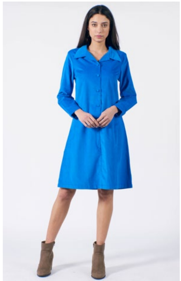
STYLE: BECKY PRINT: PRINCESS BLUE FABRIC: 100% COTTON CORDUROY