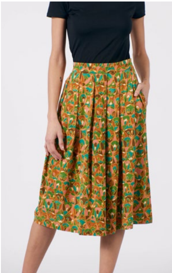
STYLE: MAGGIE PRINT: CLOWN FABRIC: 97% VISCOSE, 3% ELASTANE FSC CERTIFIED FABRIC