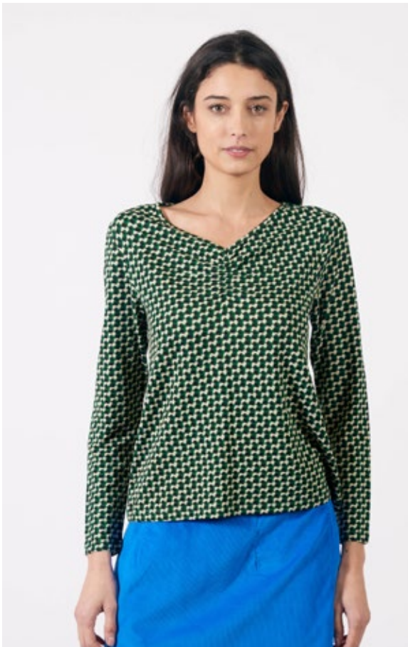
STYLE: GRETA PRINT: SQUIGGLE FABRIC: 97% VISCOSE, 3% ELASTANE FSC CERTIFIED FABRIC