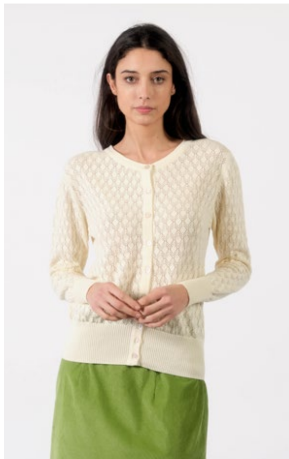
STYLE: GWEN POINTELLE CARDIGAN COLOUR: ANTIQUE WHITE FABRIC: 100% ORGANIC COTTON