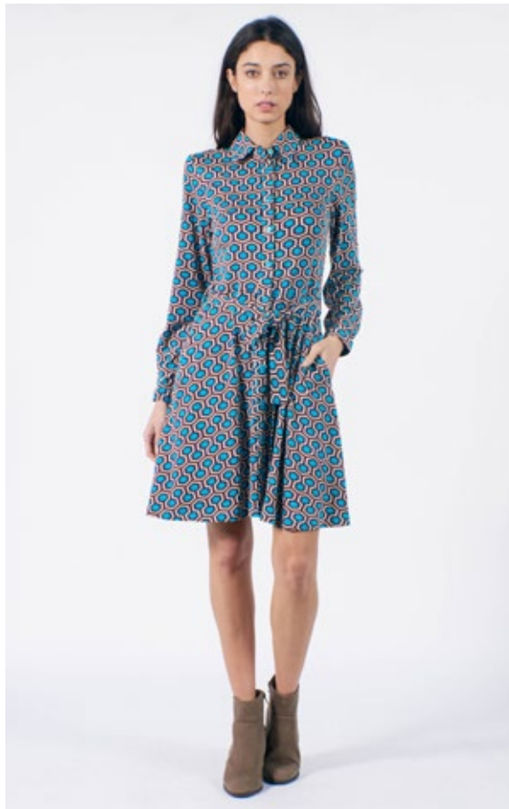
STYLE: TIFFANY PRINT: HEX FABRIC: 97% VISCOSE,3% ELASTANE FSC CERTIFIED FABRIC