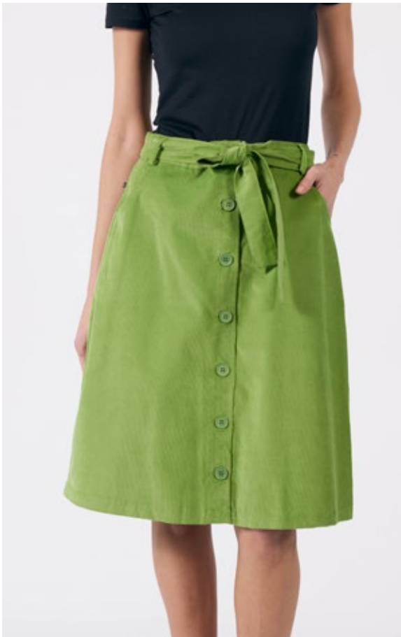
STYLE: AGNETHA PRINT: PERIDOT FABRIC: 100% COTTON CORDUROY

SIZES: UK8/XS, UK10/S UK12/M UK14/L UK16/XL UK18/XXL