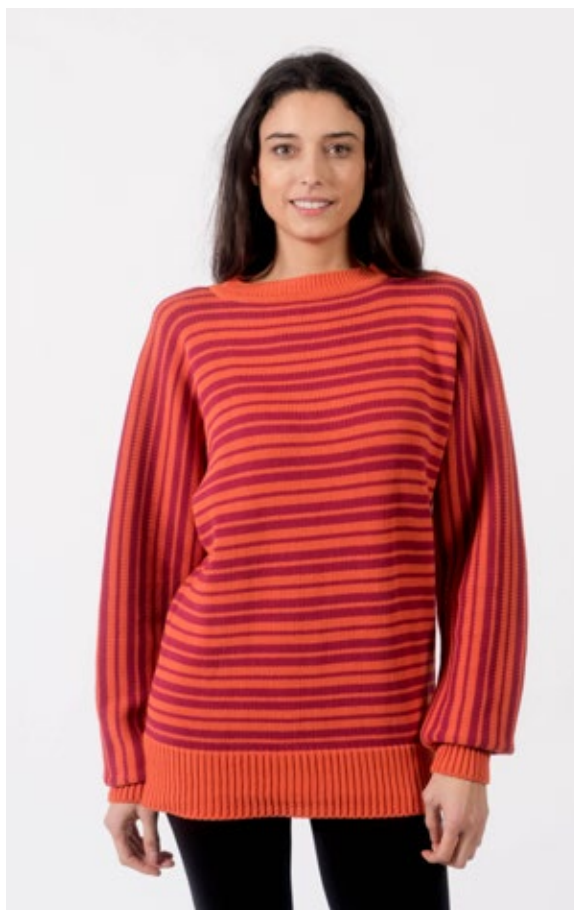
STYLE: CHARLIE BATWING COLOUR: JAFFA/RED BUD FABRIC: 100% ORGANIC COTTON