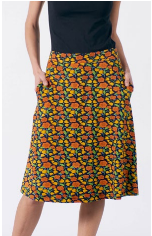
STYLE: BLOSSOM PRINT: MIMOSA FABRIC: 97% VISCOSE, 3% ELASTANE FSC CERTIFIED FABRIC