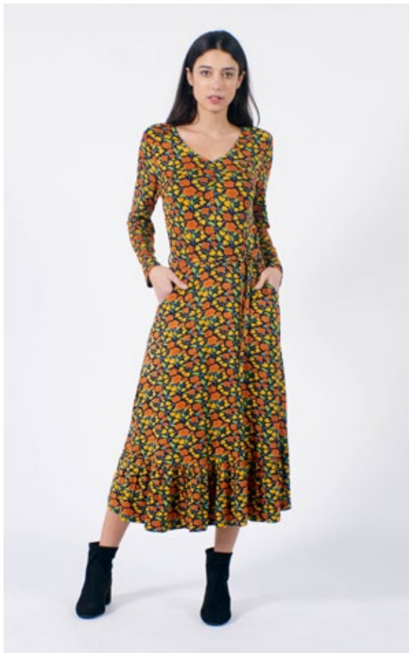
STYLE: GABI PRINT: MIMOSA FABRIC: 97% VISCOSE 3% ELASTANE FSC CERTIFIED FABRIC

SIZES: UK8/XS, UK10/S UK12/M UK14/L UK16/XL UK18/XXL