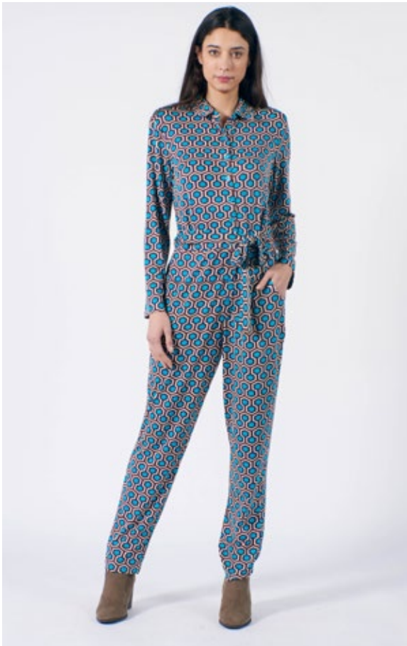
STYLE: ORLA JUMPSUIT PRINT: HEX FABRIC: 97% VISCOSE,3% ELASTANE FSC CERTIFIED FABRIC