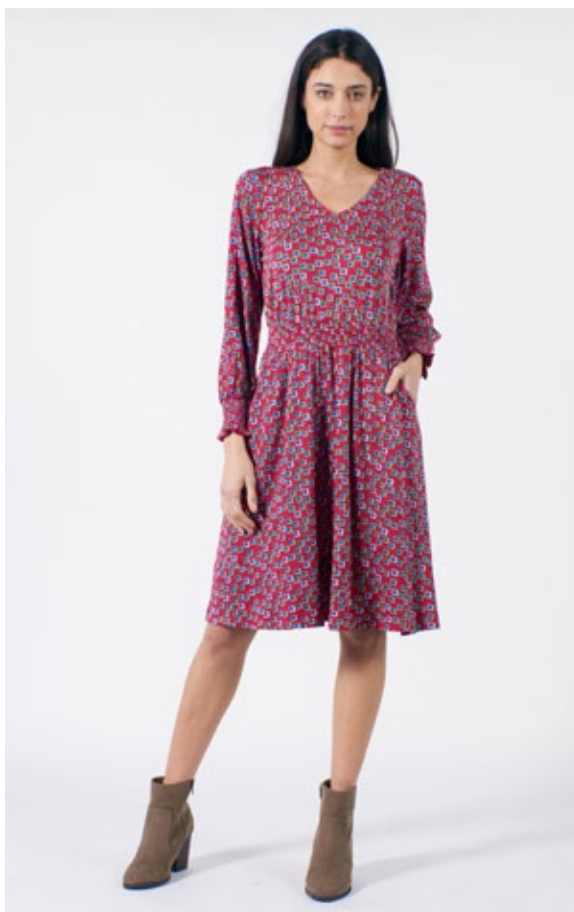
STYLE: HILDA PRINT: CUBE FABRIC: 97% VISCOSE, 3% ELASTANE FSC CERTIFIED FABRIC