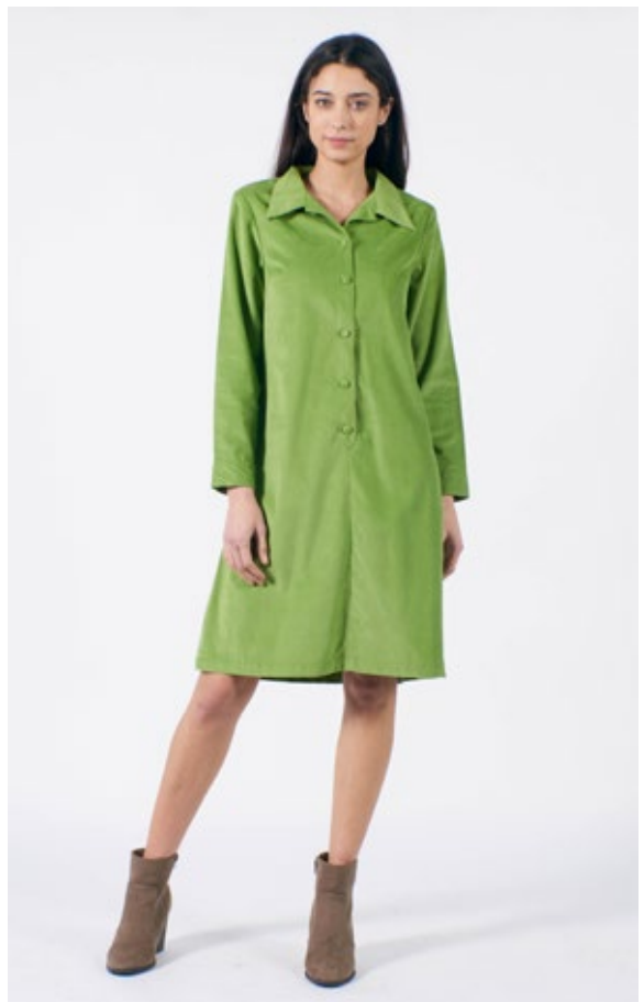
STYLE: PAULA PRINT: PERIDOT FABRIC: 100% COTTON CORDUROY