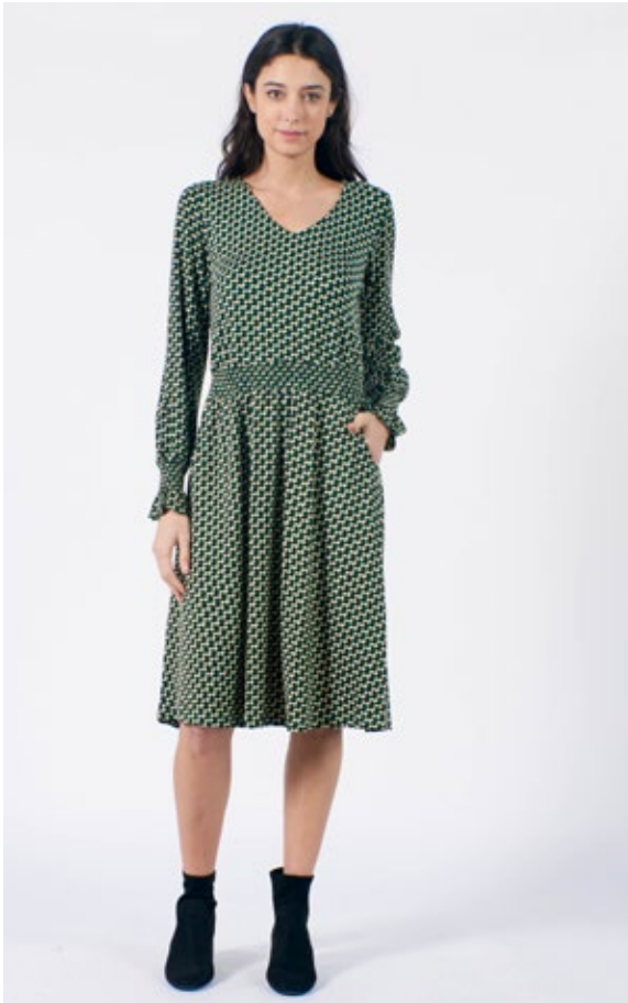
STYLE: HILDA PRINT: SQUIGGLE FABRIC: 97% VISCOSE, 3% ELASTANE FSC CERTIFIED FABRIC

SIZES: UK8/XS, UK10/S UK12/M UK14/L UK16/XL UK18/XXL