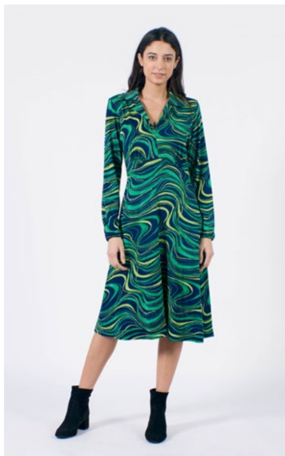
STYLE: TALLULAH PRINT: LIME SWIRL FABRIC: 97% VISCOSE, 3% ELASTANE FSC CERTIFIED FABRIC

SIZES: UK8/XS UK10/S UK12/M UK14/L UK16/XL UK18/XXL