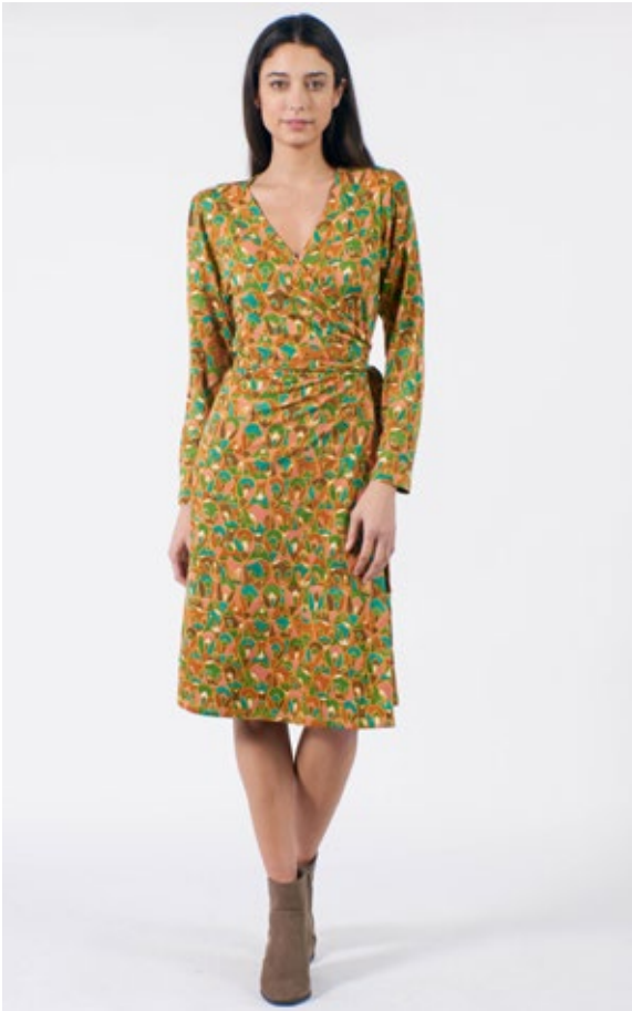
STYLE: ROBIN PRINT: CLOWN FABRIC: 97% VISCOSE, 3% ELASTANE FSC CERTIFIED FABRIC

SIZES: UK8/XS, UK10/S UK12/M UK14/L UK16/XL UK18/XXL