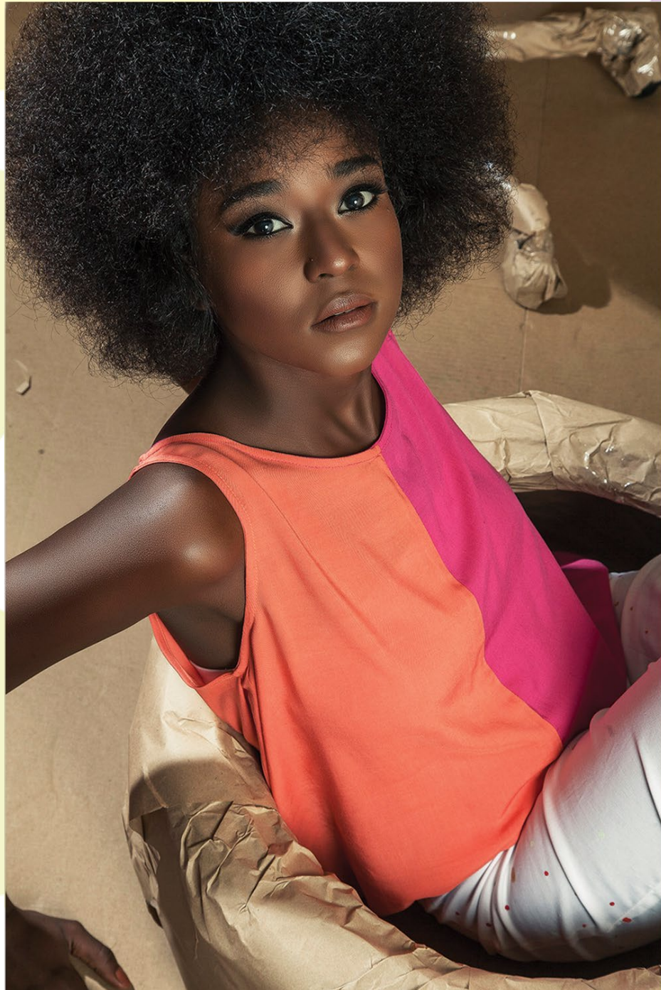
Makeup Artist: Kiki Ismail Model & hair styling: Fatima Ali

Color splash collection is inspired by color blocking and the power of colors