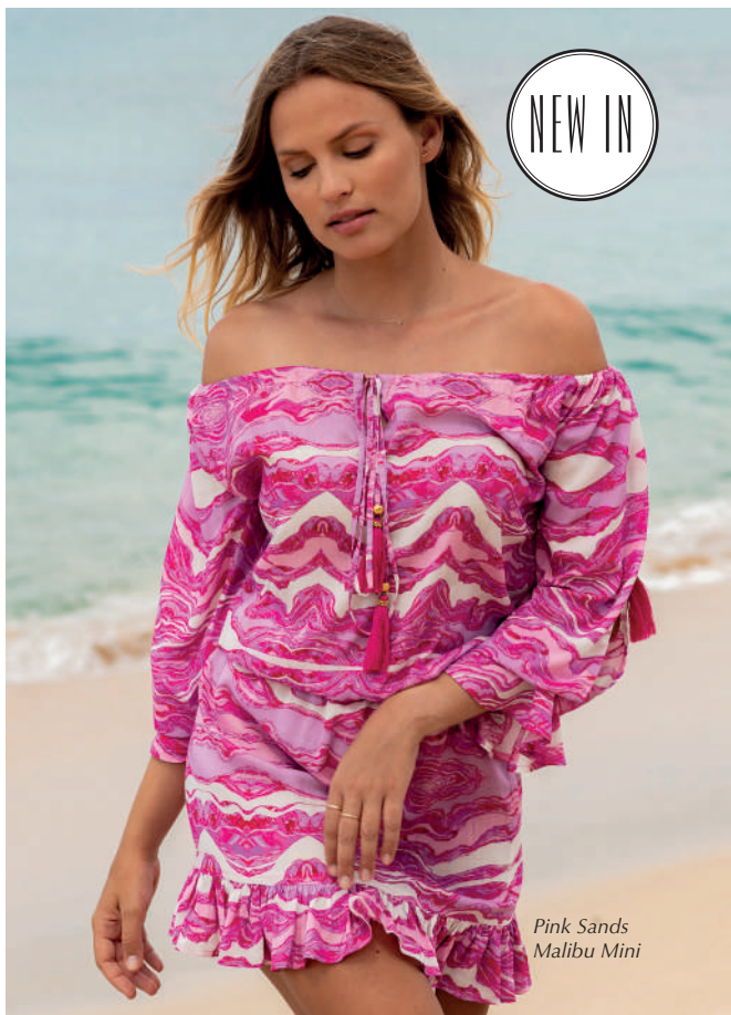
Pink Sands Malibu Mini