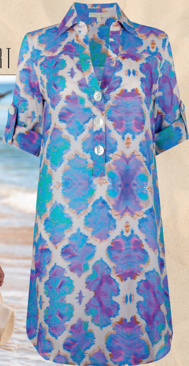
Orchid Paradise Beach Shirt