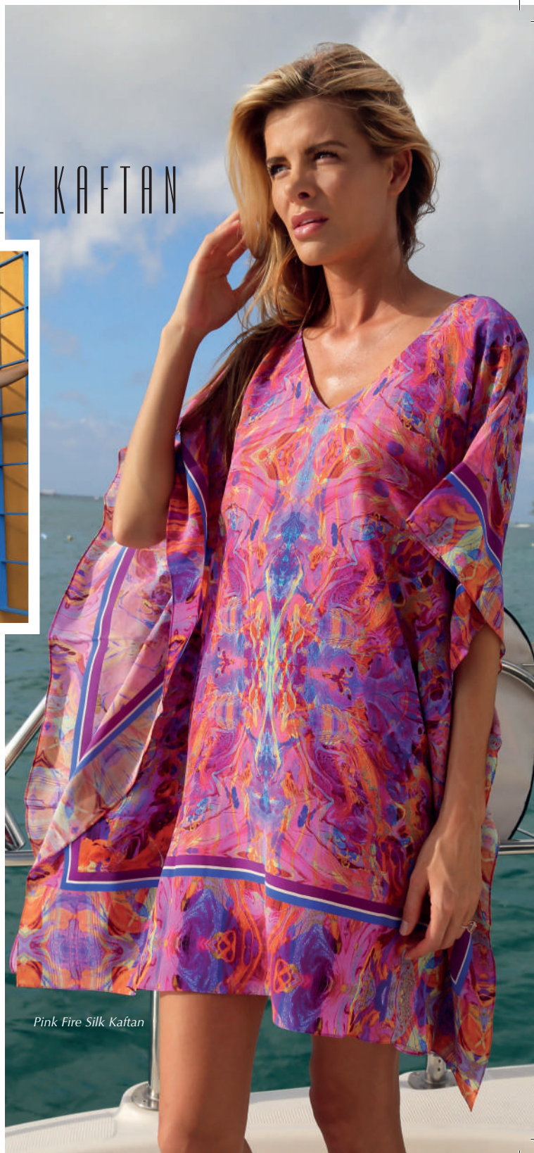
Pink Fire Silk Kaftan

Small, Medium, Large 12 prints and 2 lengths (2.5 inches difference).