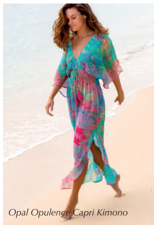
Opal Opulence Capri Kimono