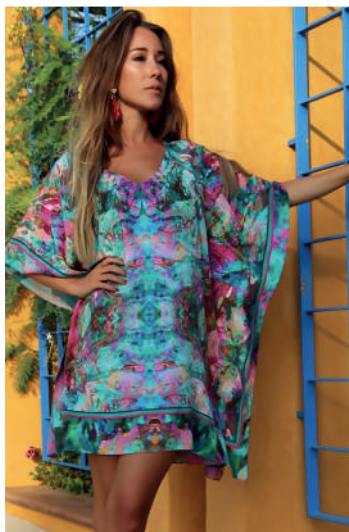
Liquid Rainbow Silk Kaftan

This luxurious silk kaftan sports a relaxed silhouette with a handkerchief hem, V neckline and wide cropped sleeves.