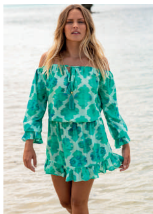
Jade Paradise Malibu Mini