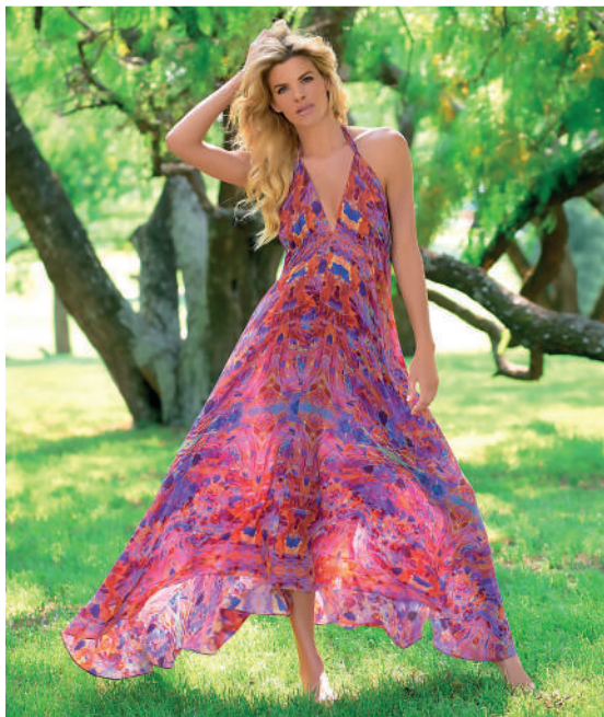
Pink Fire Maxi Silk Ibiza Dress