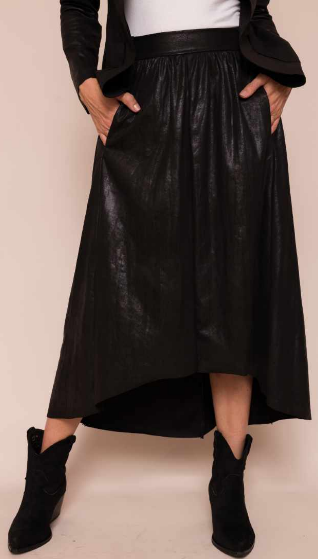
STYLE - OPHELIA Ophelia Vintage Leather Skirt Available in: Black, Brown Sizes: S/M, M/L