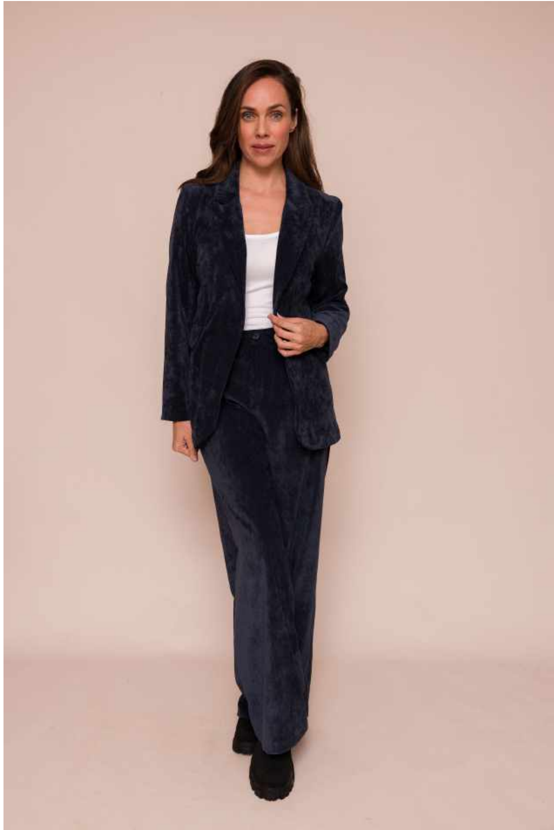
STYLE - MOXY