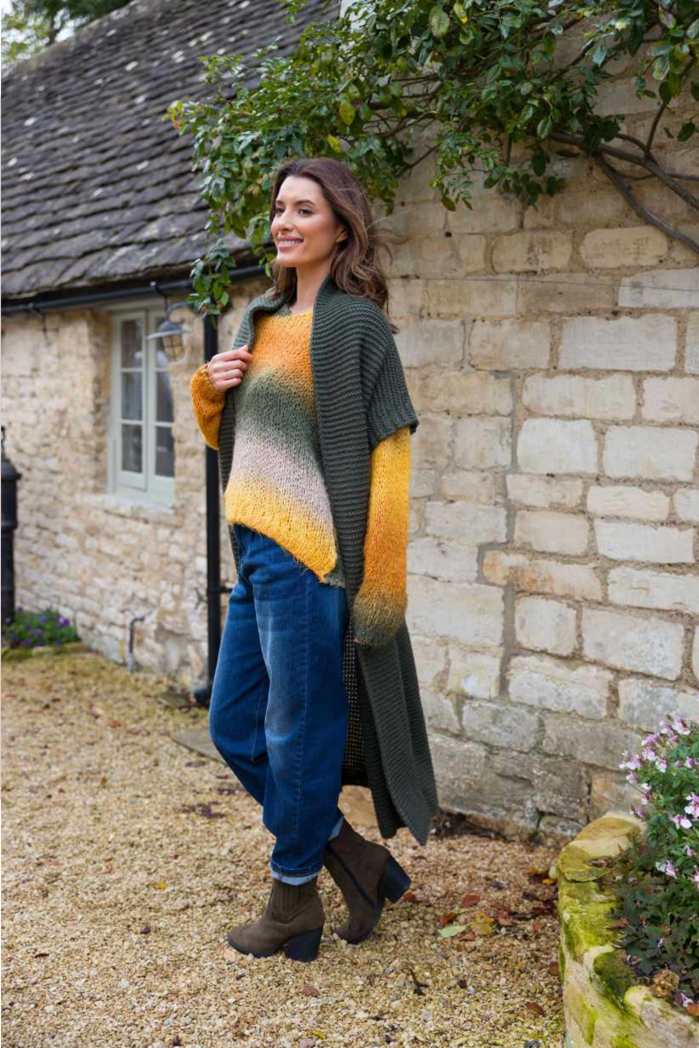
STYLE - FERNANDO Fernando Chunky Knit Long Gilet Available in: Olive, Camel, Black Sizes: O/S