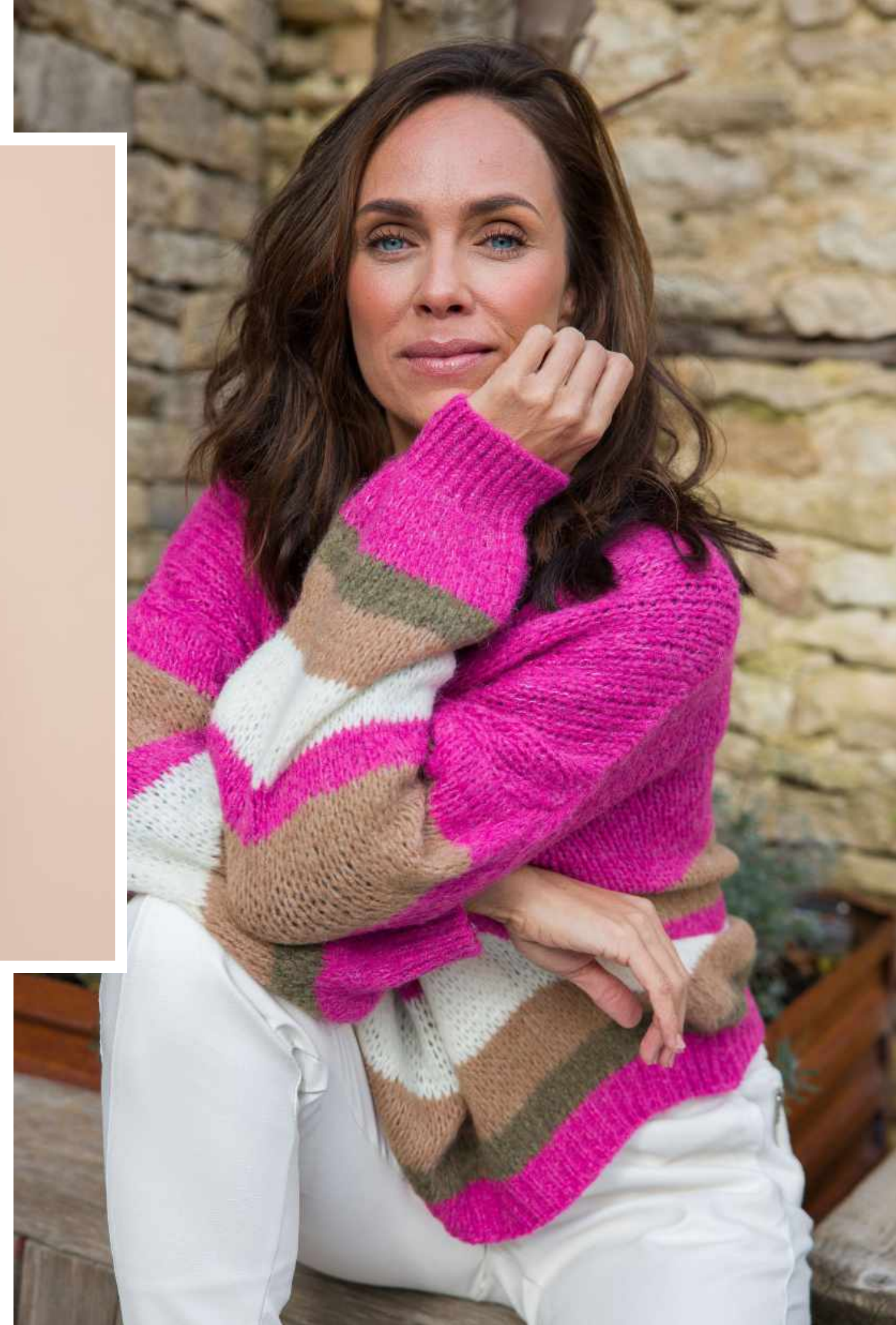
STYLE - FRANCESCO Francesco Stripe Knit Sweater Available in: Deep Pink, Jeans Sizes: O/S