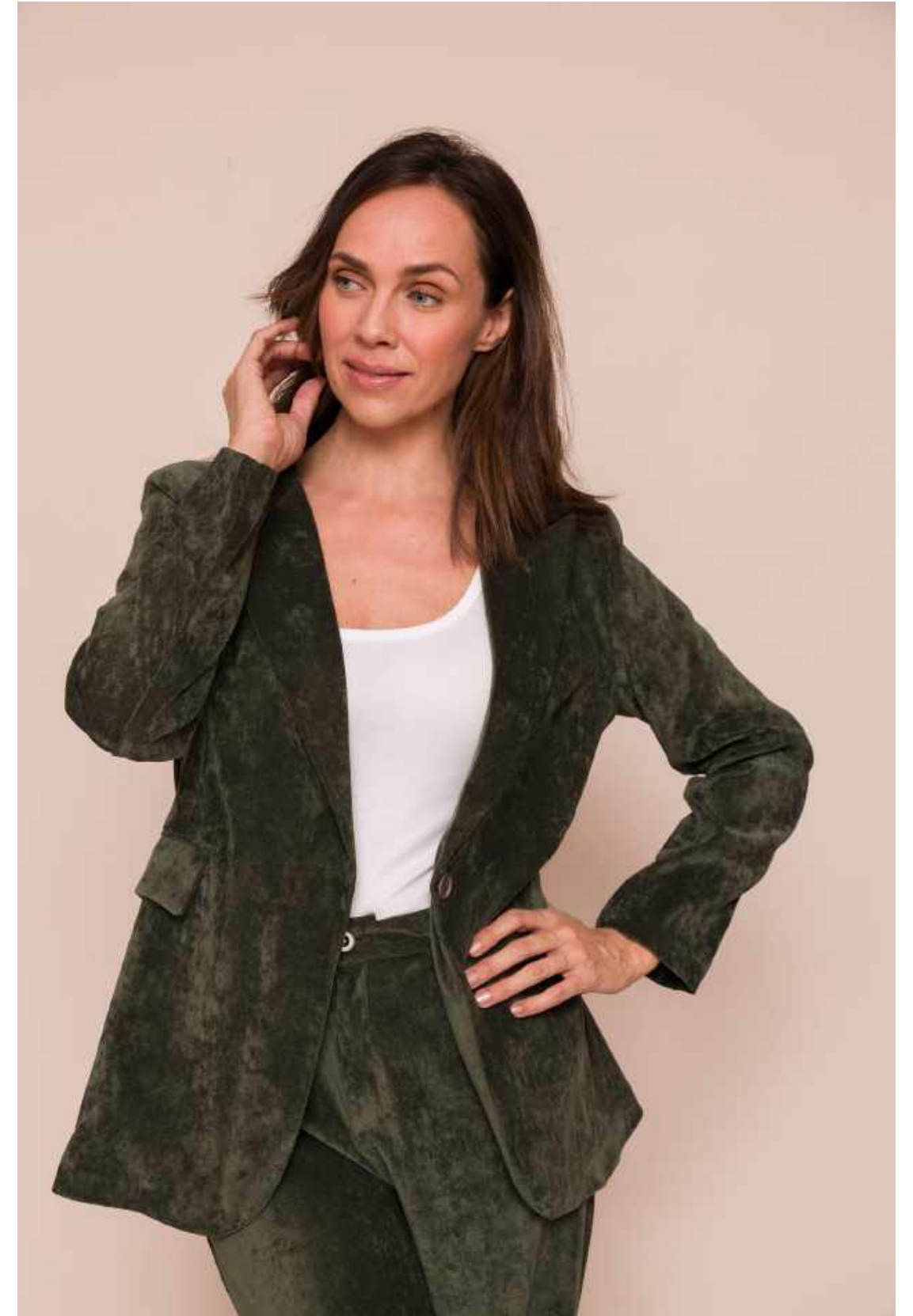
Moxy Velvet Blazer Available in: Black, Navy, Olive Sizes: S, M, L, XL