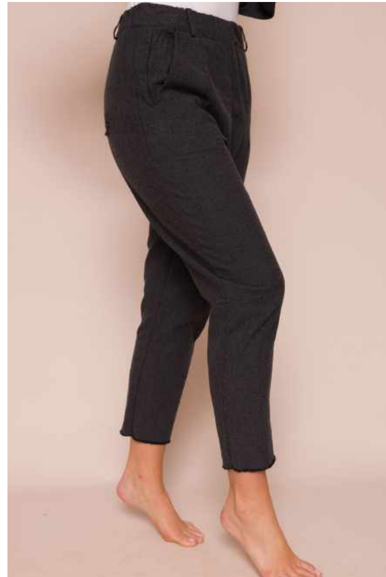
STYLE - ORLA Orla Tweed Frayed Hem Pants Available in: Dark Grey Sizes: S, M, L