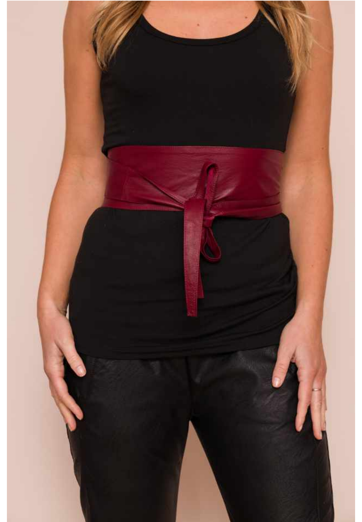
Olivia Leather Belt

Available in: Black, Dark Grey, Navy, Taupe, Camel, Bordo, Brown, Bottle Green