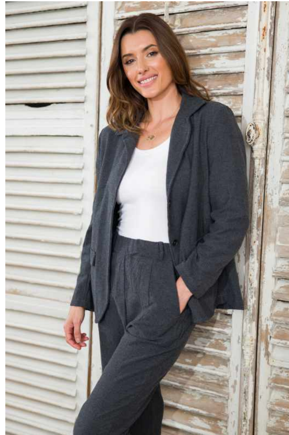
STYLE - OMA Oma Tweed Blazer Available in: Dark Grey Sizes: S, M, L