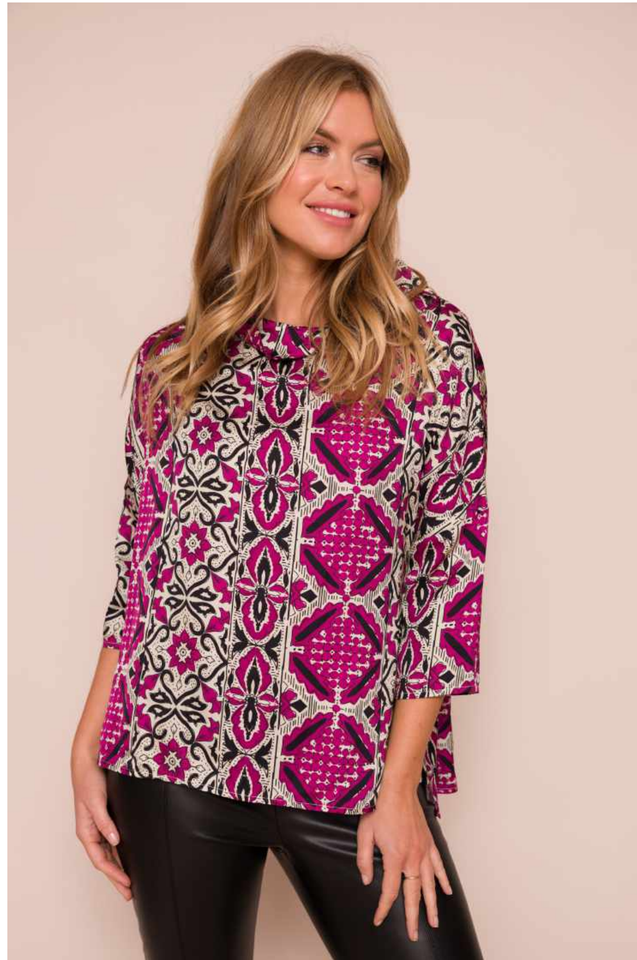
STYLE - KELLAN 2 Kellan [2] Print Audrey Top Available in: Deep Pink, Brown, Green Sizes: S, M, L