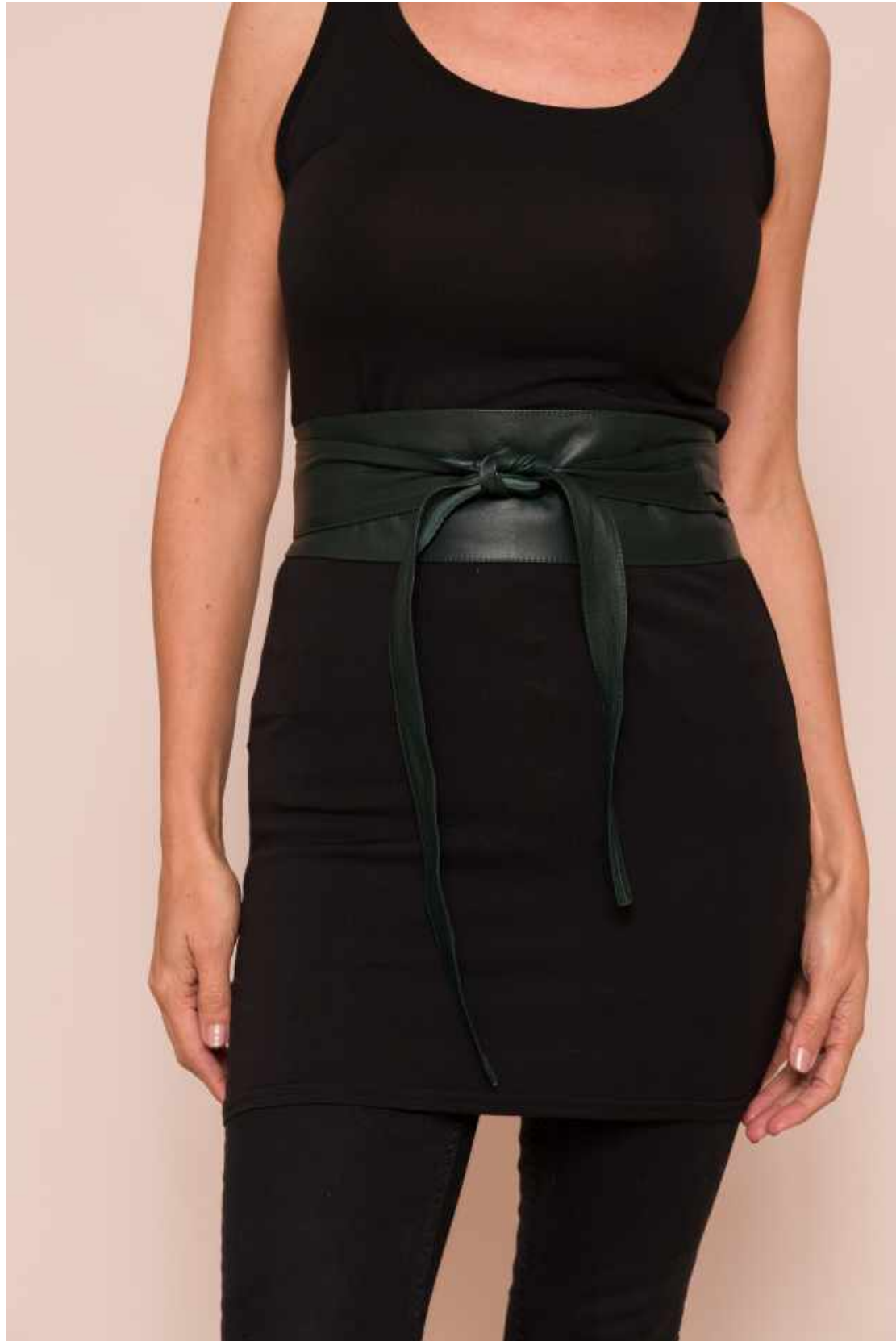
STYLE - OLIVIA