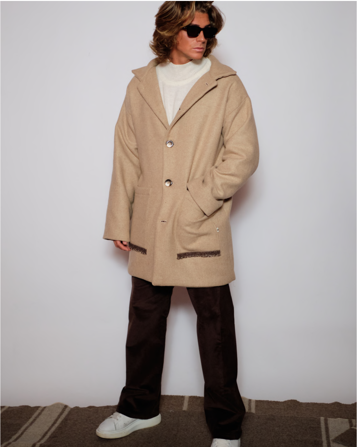
"Cedar" Coat: 100% Wool Havana "Gabera" Sunglasses