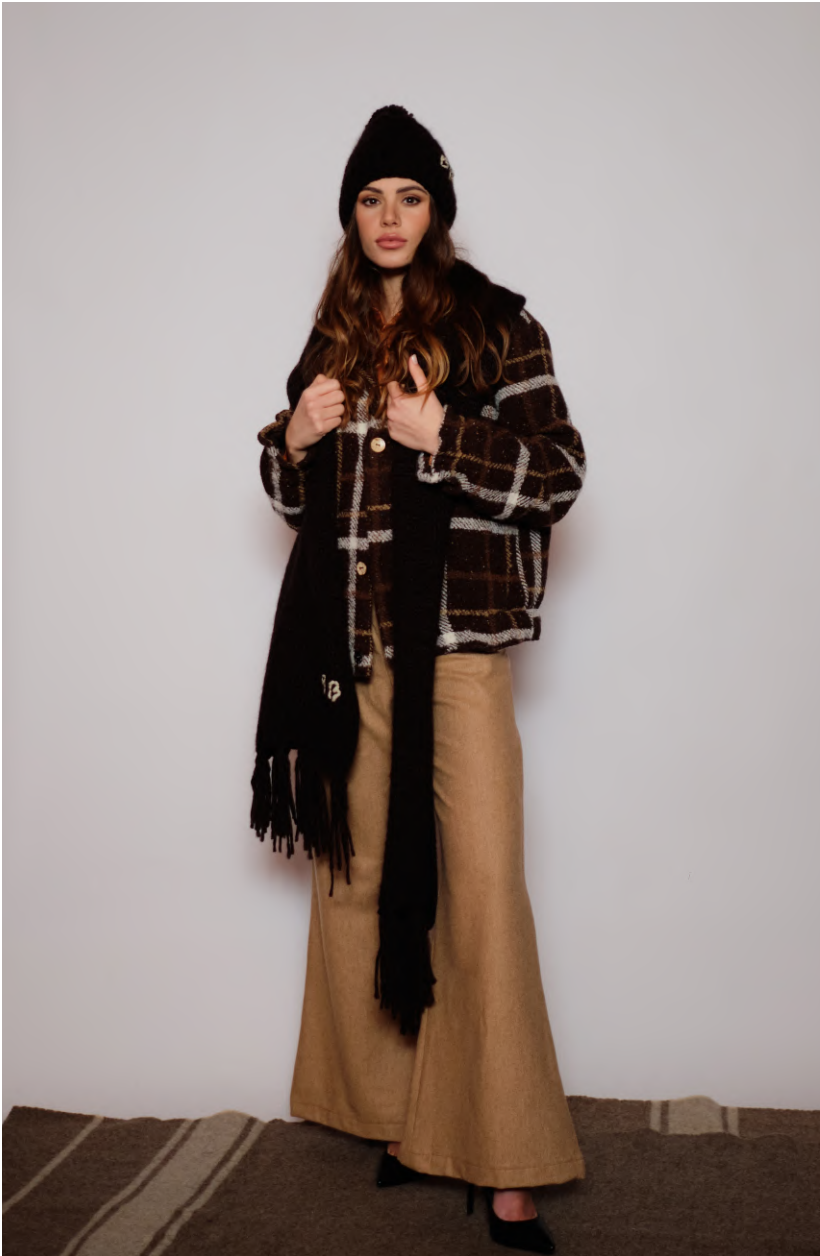
BB Logo Brown "Ebony" Scarf: 100% Wool BB Logo Brown "Ebony" Beanie: 100% Wool