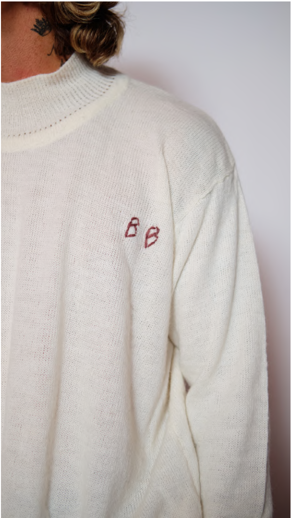
"Fir" Pullover: 70% Wool, 30% Acrylic "Ipe" Trousers: 100% Curdroy Cotton