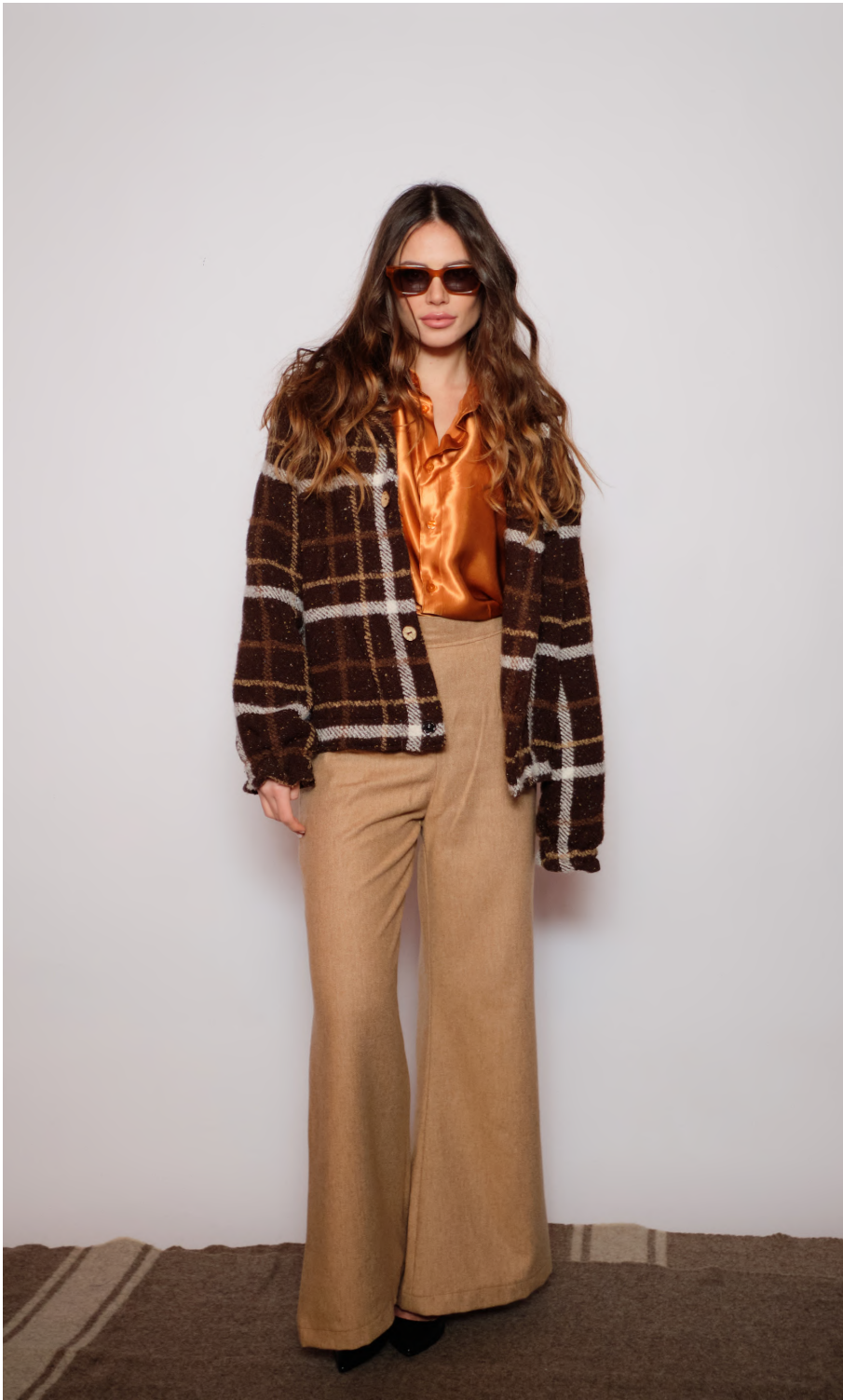
"Ponga" Jacket: 100% Wool Orange "Doussié" Shirt: 100% Viscose "Teak" Trousers: 100% Wool Caramel "Gabera" Sunglasses