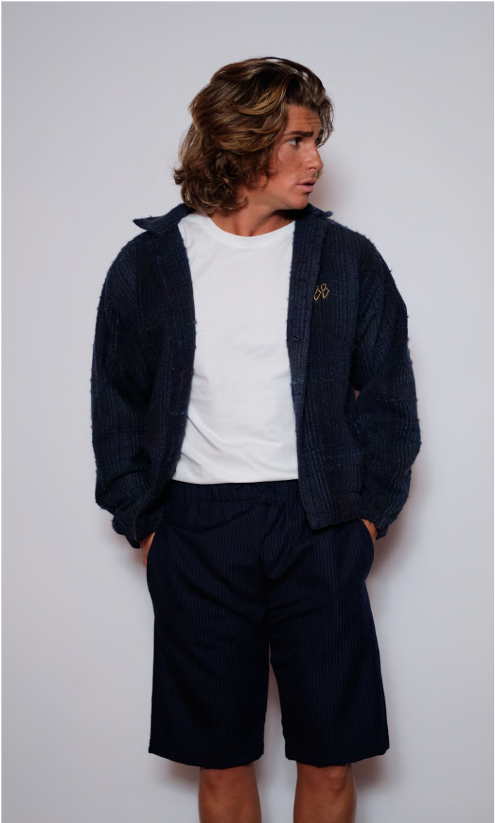
"Pine" Jacket: 100% Wool "Wengé" Shorts: 100% Wool