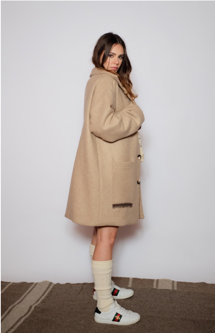
"Cedar" Coat: 100% Wool Quilted Ski "Balsa" Bucket Hat: 100% Polyester