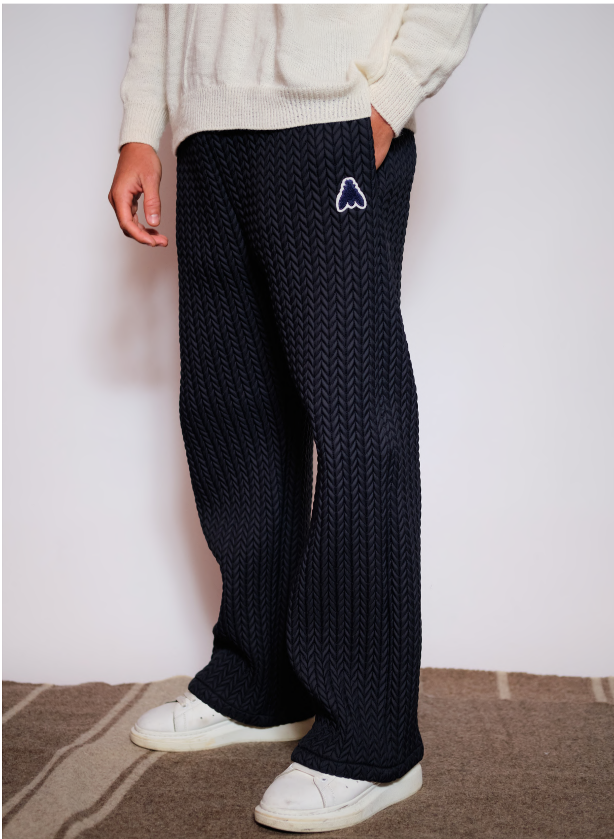
Quilted Ski "Balsa" Trousers: 100% Polyester