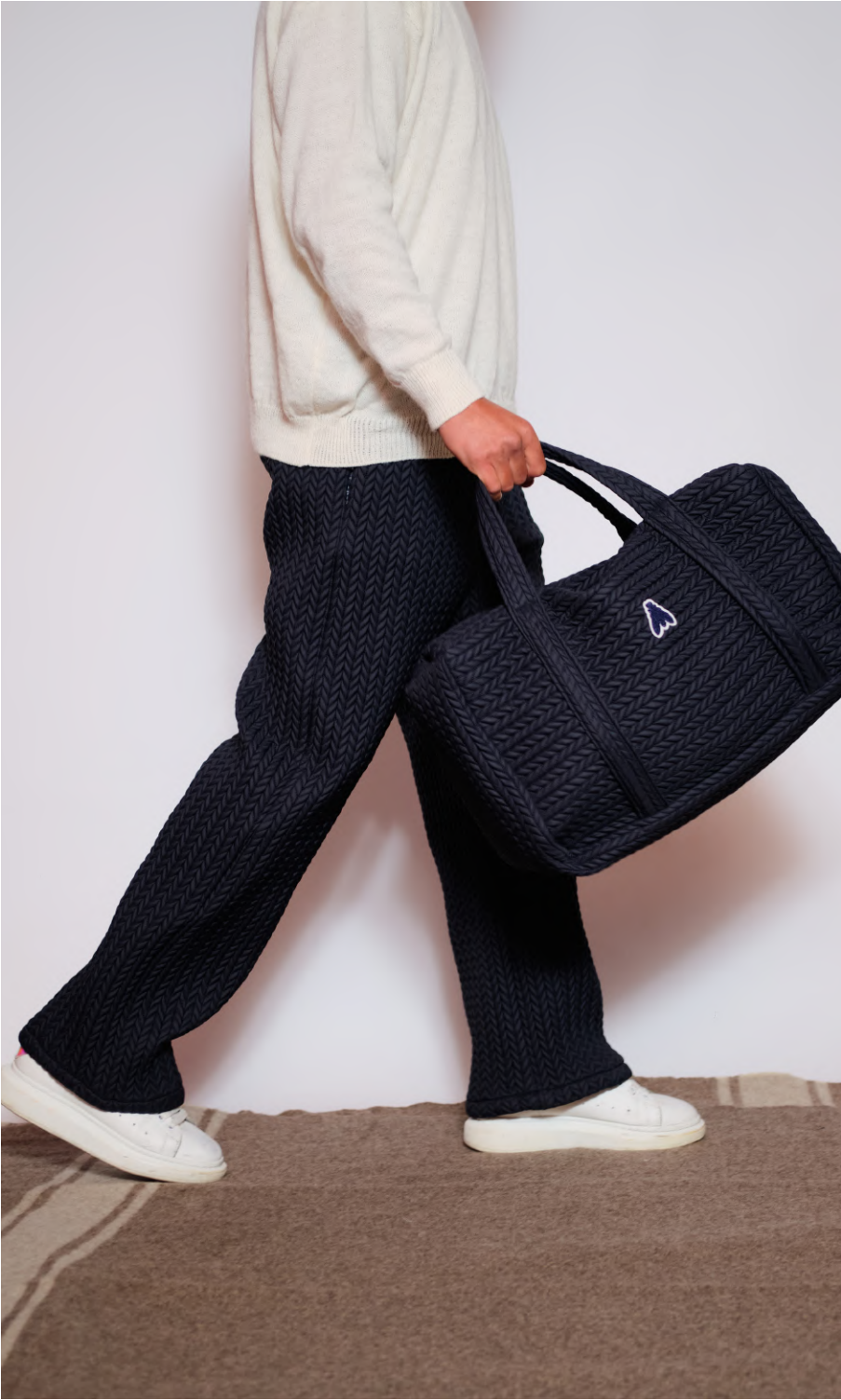
Quilted Ski "Balsa" Travel Bag: 100% Polyester