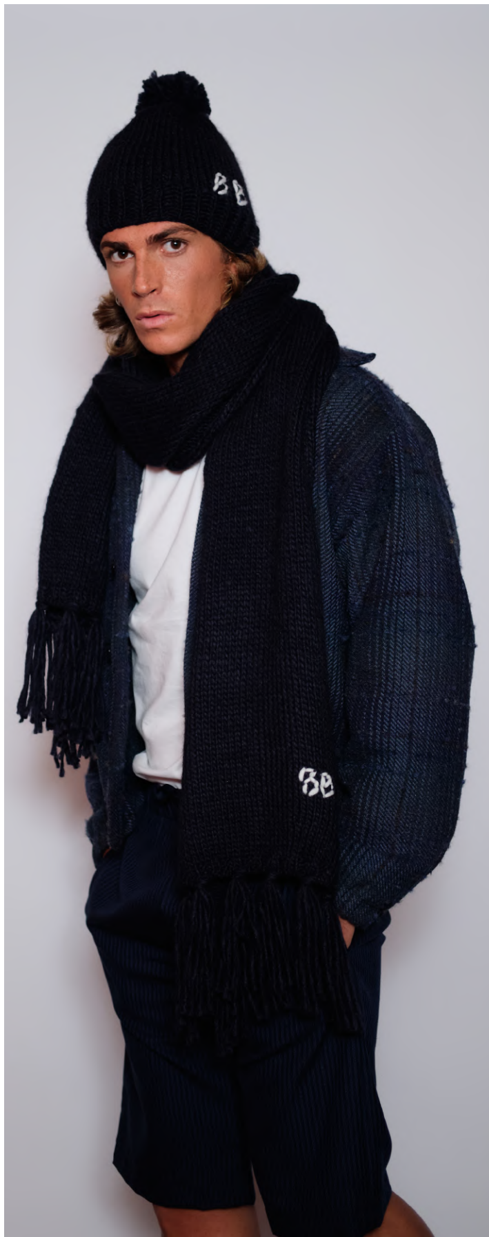
BB Logo Blue "Ebony" Scarf: 100% Wool BB Logo Blue "Ebony" Beanie: 100% Wool "Maple" T-Shirt: 100% Organic Cotton