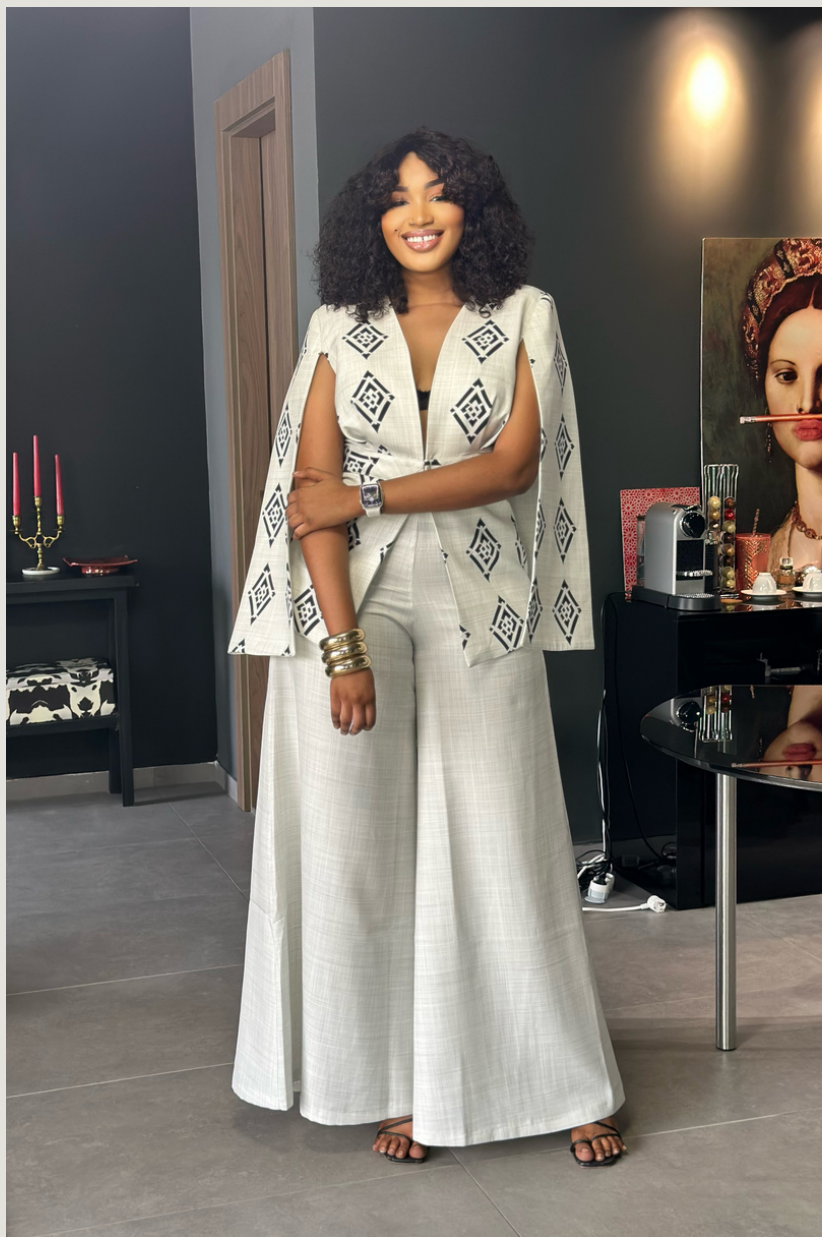
Cape jacket set