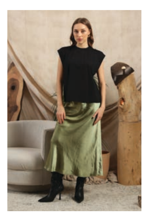
Satin Skirt: WS: £28.75 RRP: £69