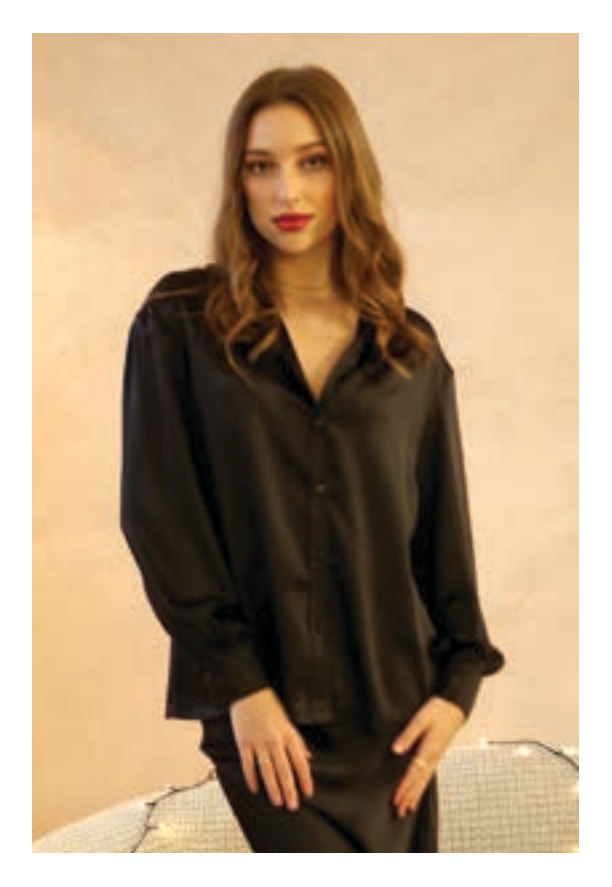
Satin Shirt: WS: £28.75 RRP: £69