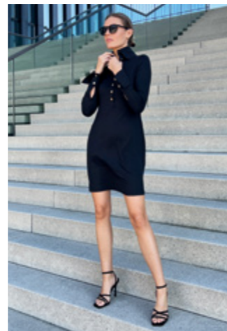
Item no. AVC 092 - 094