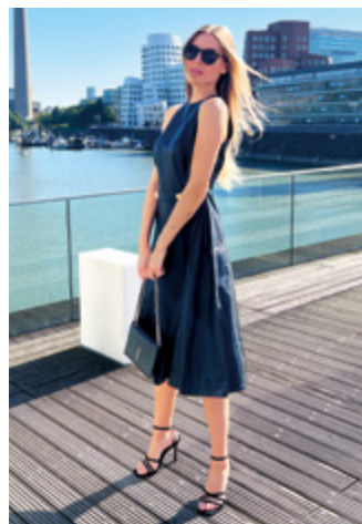
Item no. AVC 089 - 091