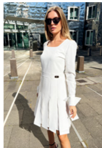
Item no. AVC 080 - 082