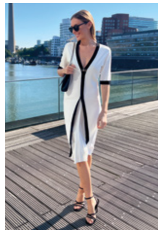
Item no. AVC 083 - 085