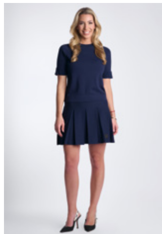
Item no. AVC 0146 - 0148 Item no. AVC 0137 - 0139