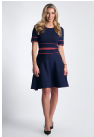
Item no. AVC 0128 - 0130