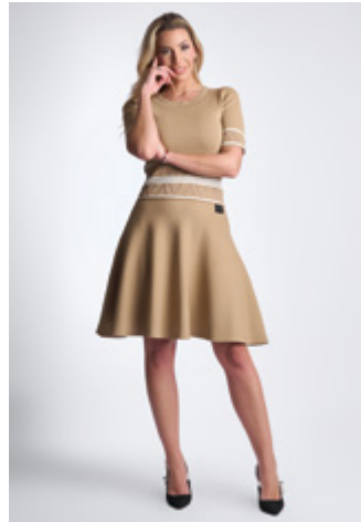
Item no. AVC 0124 - 0127