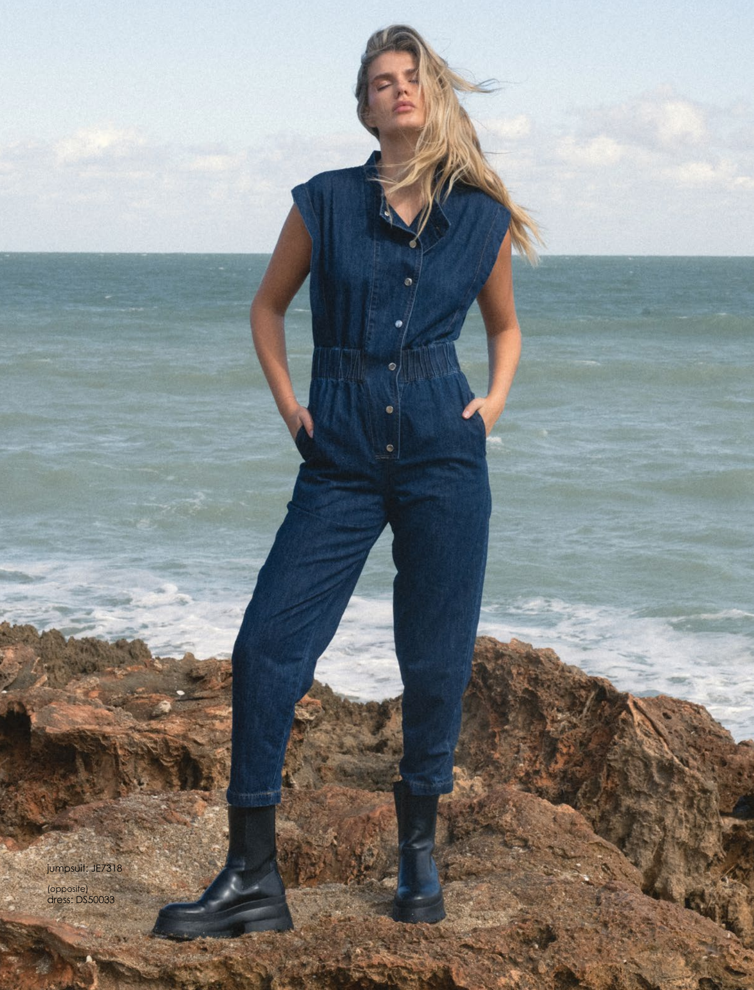
jumpsuit: JE7318 (opposite) dress: DS50033