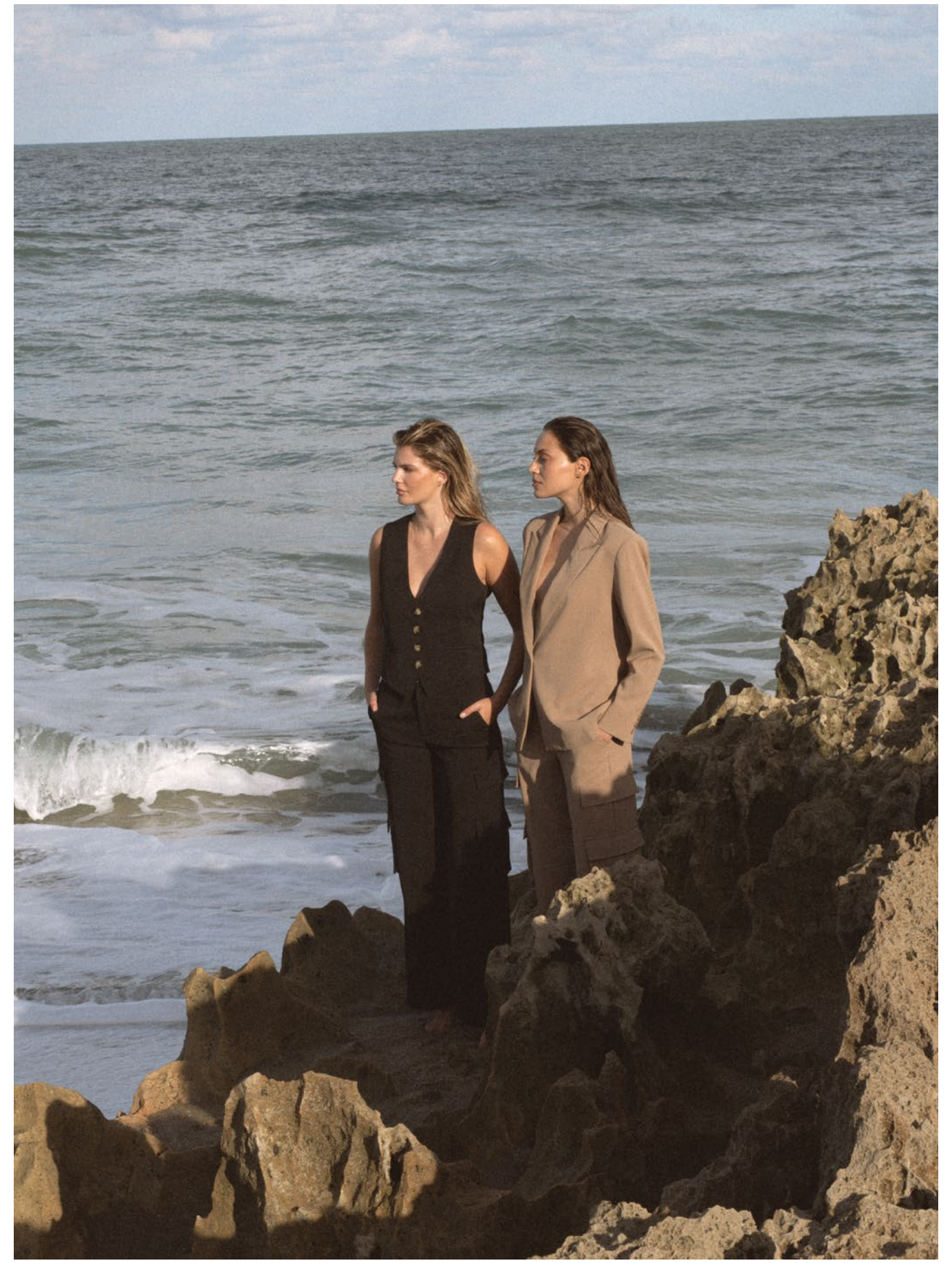
[opposite] vest: PC8193 pants: PC2335