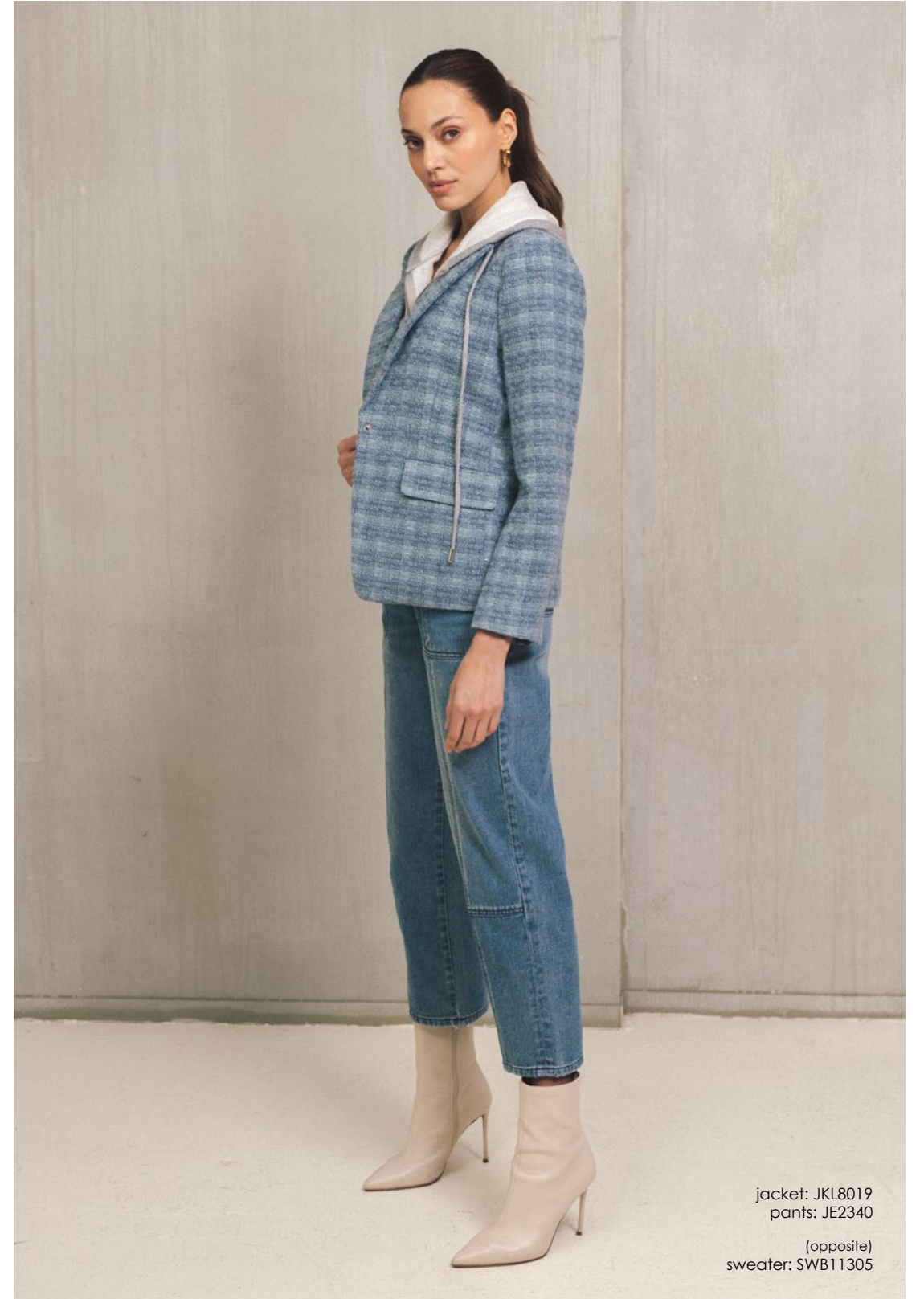
jacket: JKL8019 pants: JE2340 (opposite) sweater: SWB11305