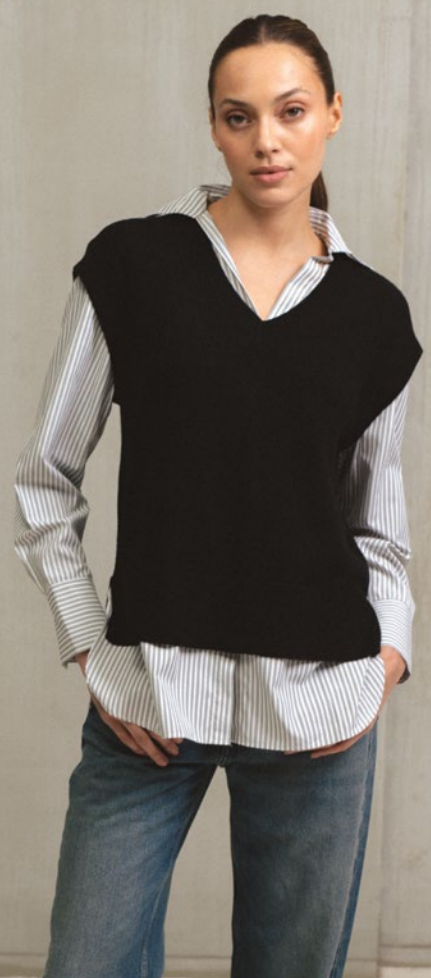
sweater/shirt: SW10902 sweater dress: SWV50047