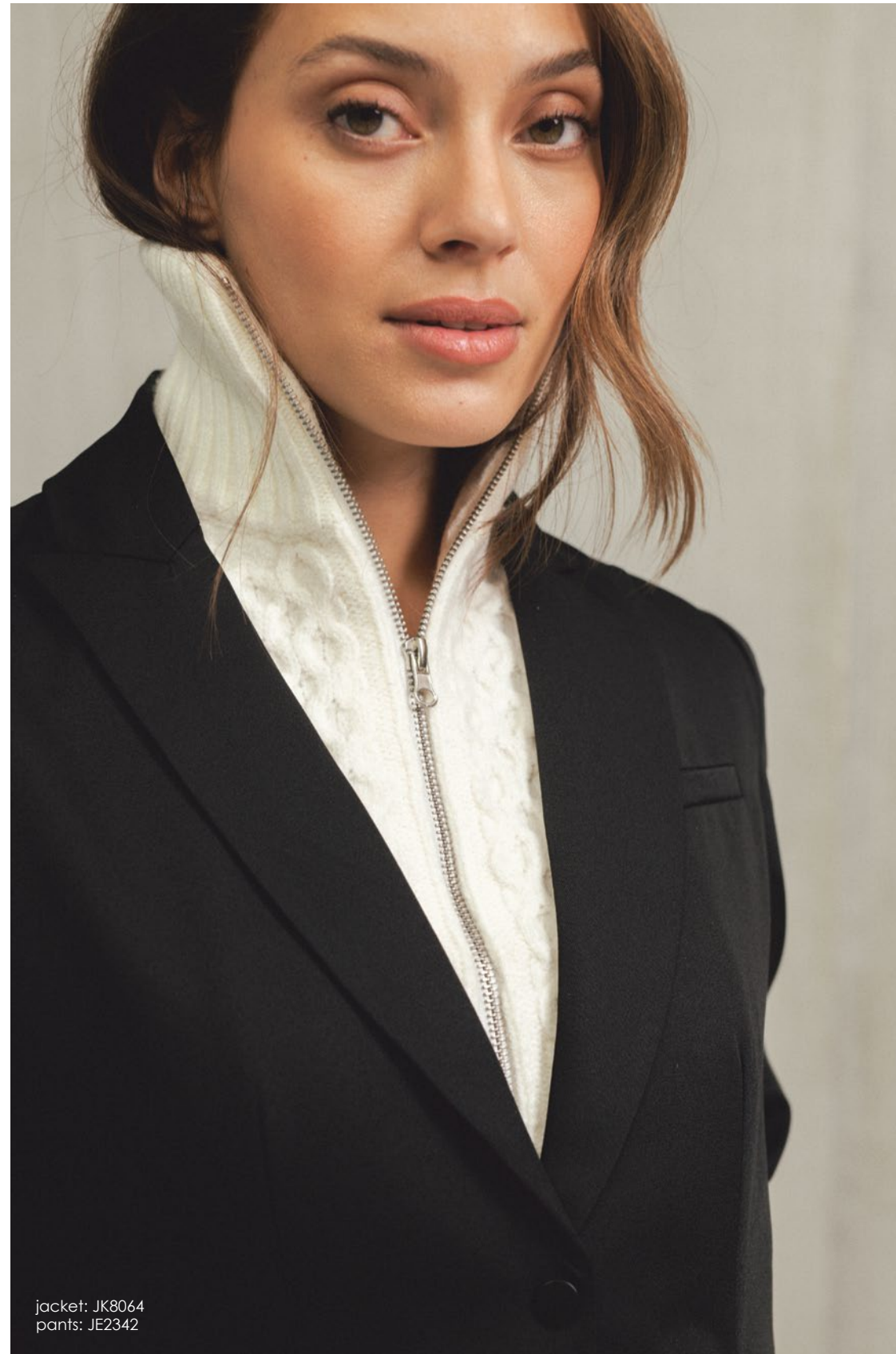
jacket: JK8064 pants: JE2342