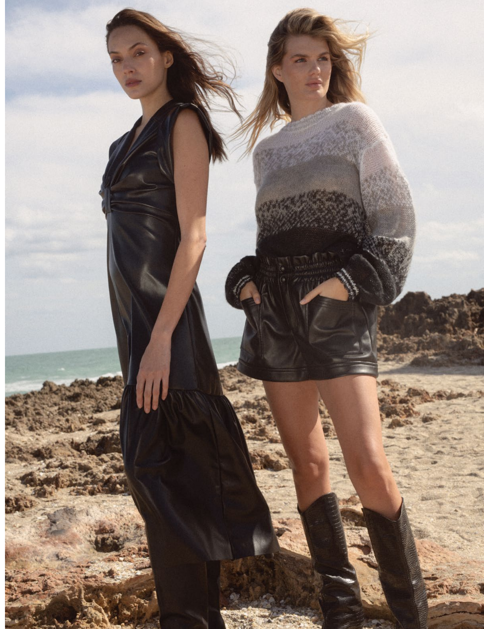
(opposite) sweater: SWS11184 shorts: FL3105