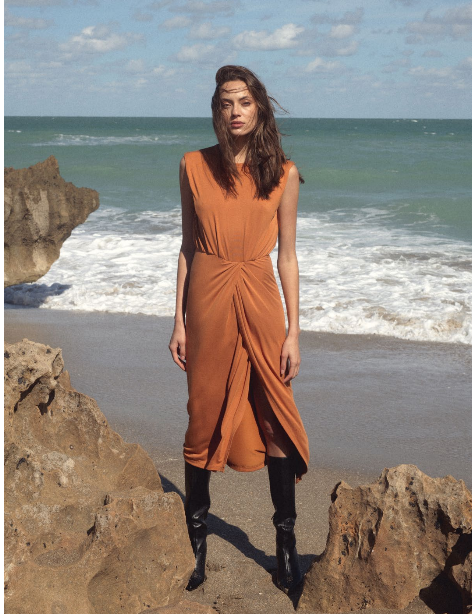
(opposite) dress: MC50028