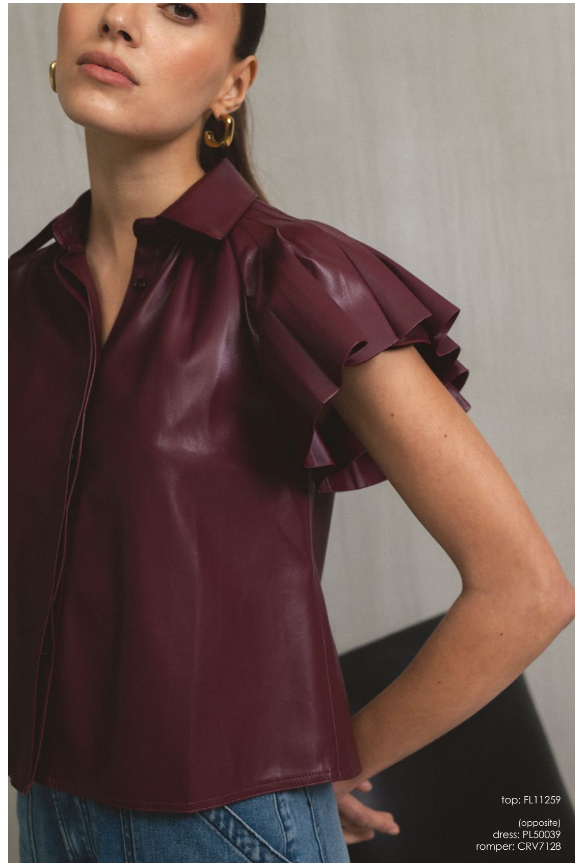
top: FL11259 (opposite) dress: PL50039 romper: CRV7128