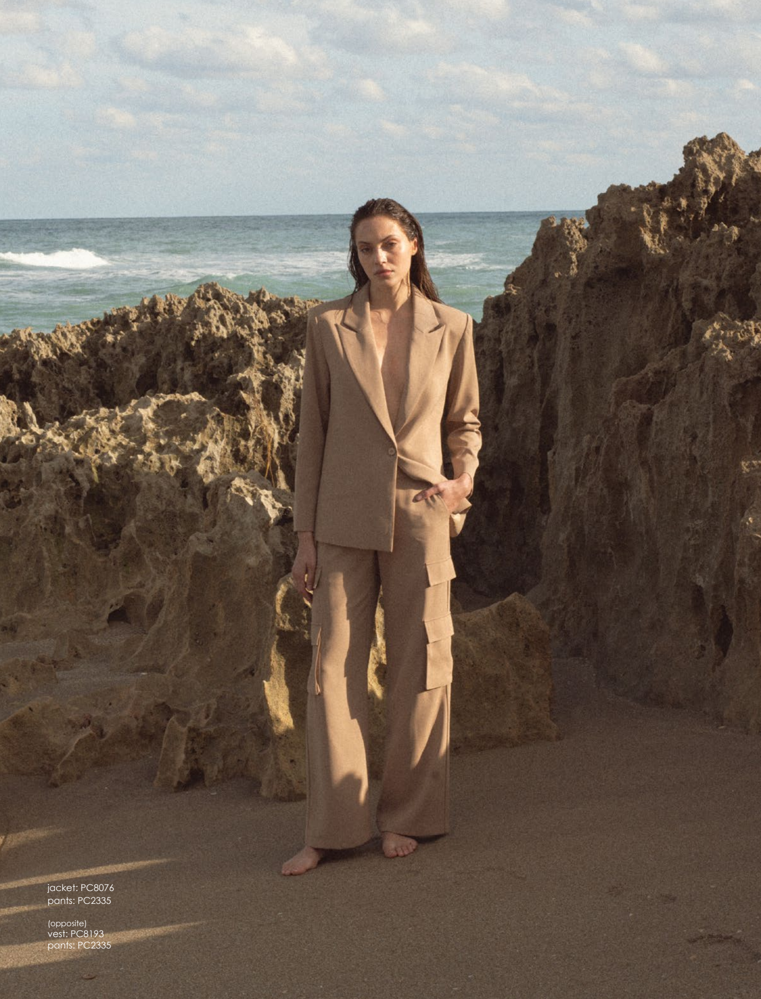
jacket: PC8076 pants: PC2335