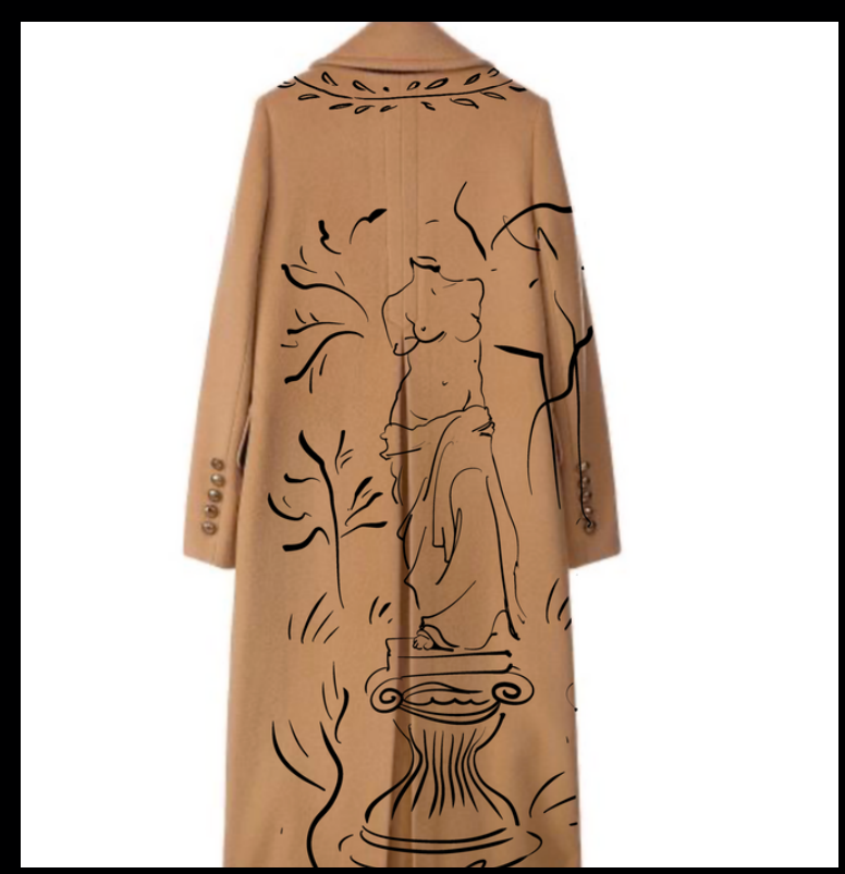
GRECIAN ELEGANCE UNVEILED

Grecian Elegance Unveiled: The Hand-Painted Trench Coat