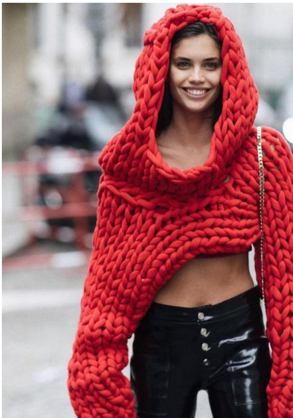
ASYMMETRICAL RED KNIT