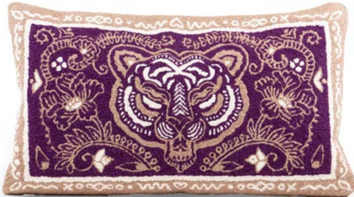
Tiger Purple Cushion

All our designs can be transformed into gorgeous cushions. Here are some examples.