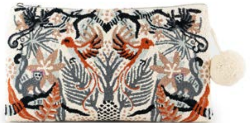
Paradise Natural Clutch M

Available in sizes XS and bigger, for more information contact us.