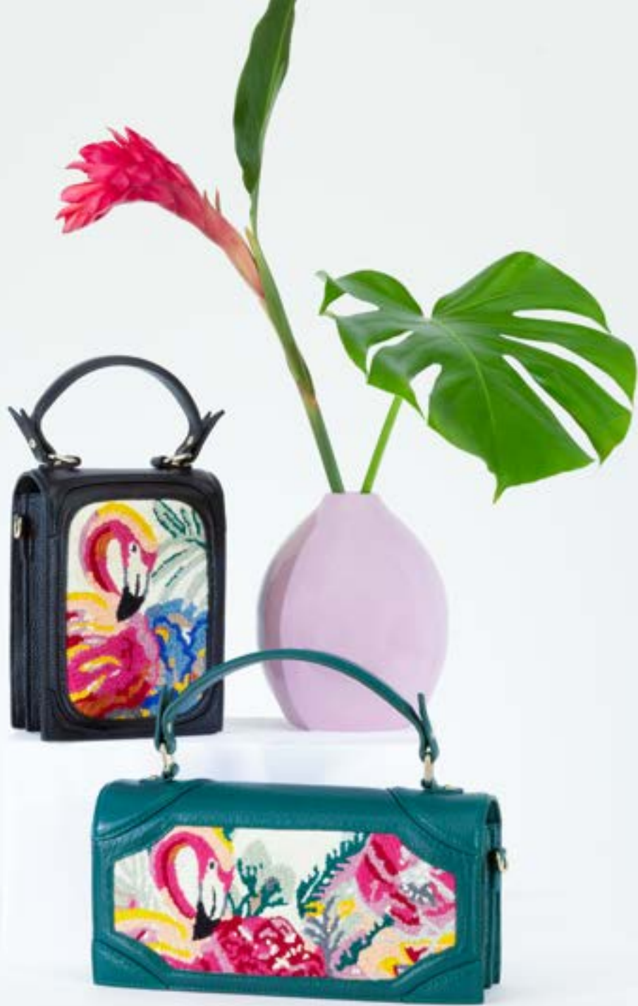
Niño Flamingo – Black Madre Flamingo – Pine Green