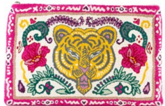
Tiger Wildflower Clutch XL