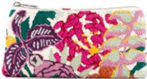
Flowers Wildflower Pouch XS