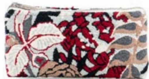
Flowers Natural Pouch XS