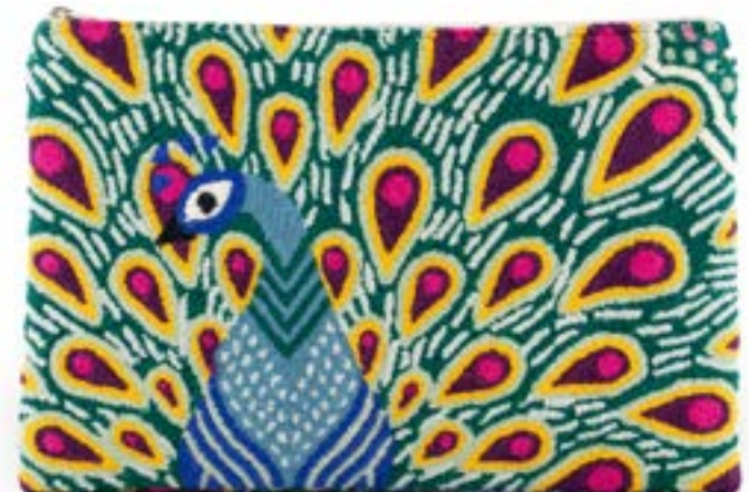
Peacock Green Clutch XL