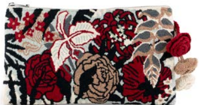
Flowers Natural Clutch M

Available in sizes XS and bigger, contact us for more information.