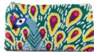
Peacock Green Pouch XS