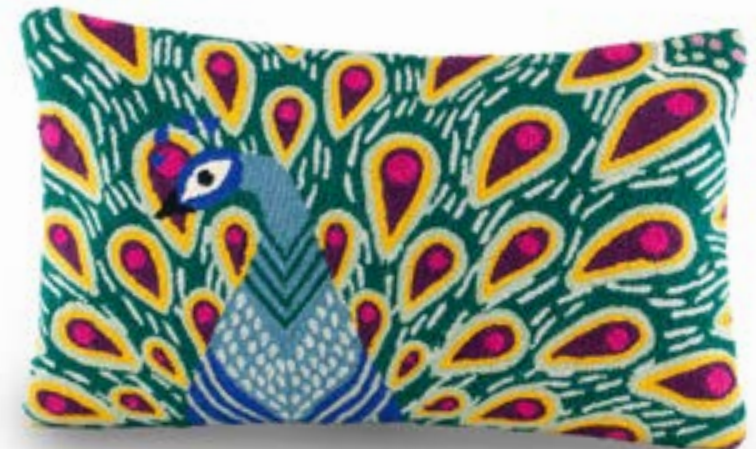
Peacock Green Cushion