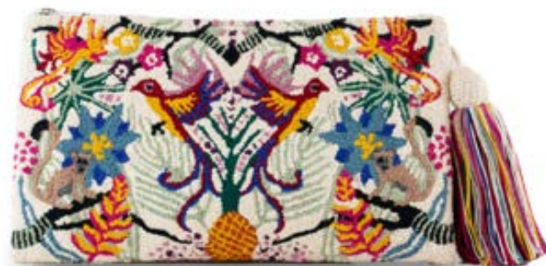
Paradise Wildflower Clutch M

Available in sizes XS and bigger, for more information contact us.