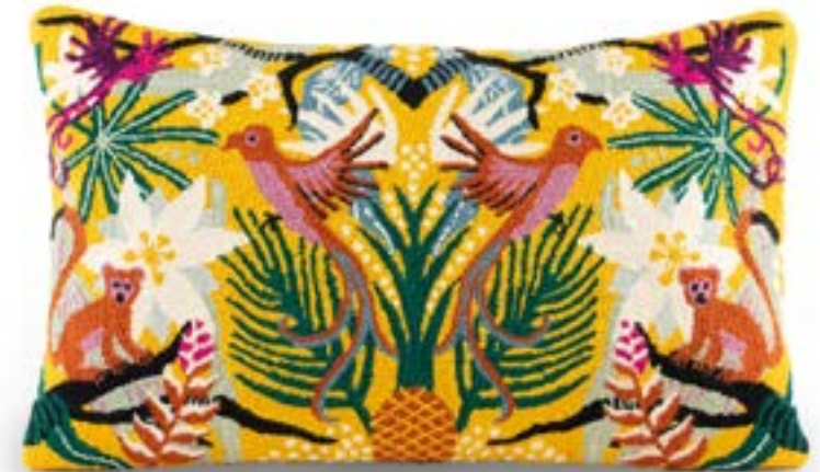
Paradise Yellow Cushion