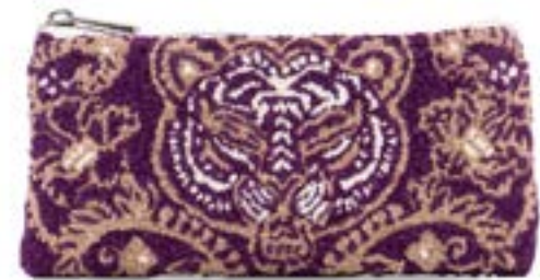
Tiger Purple Pouch XS