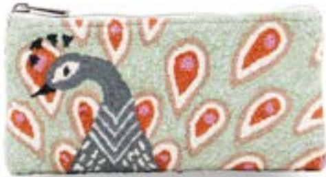
Peacock Natural Pouch XS