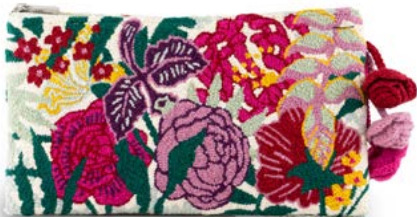
Flowers Wildflower Clutch M