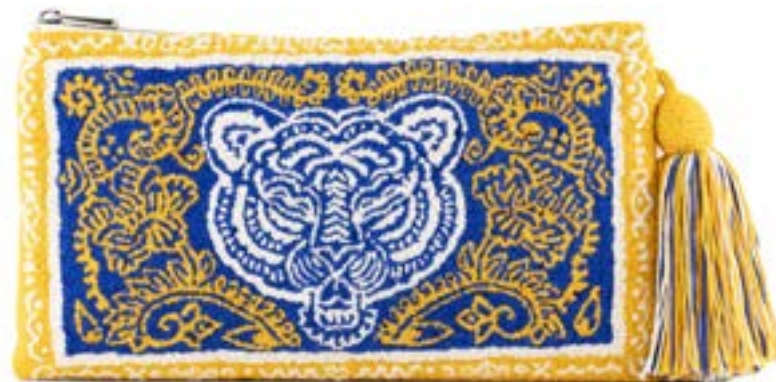
Tiger Yellow Clutch M