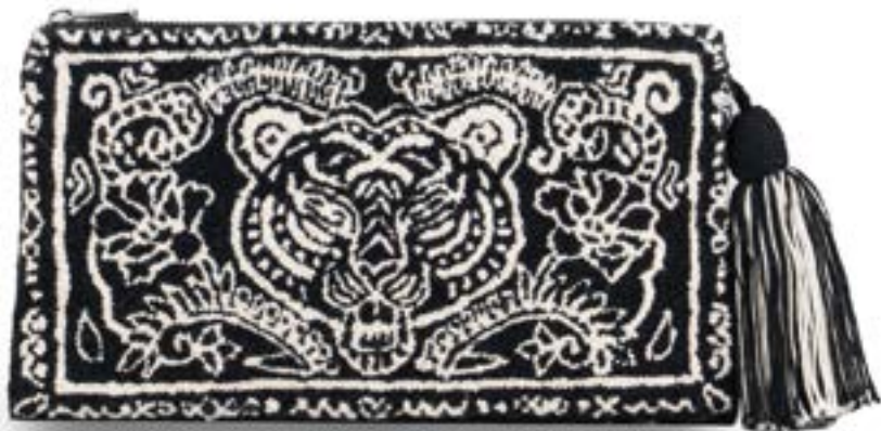
Tiger Black Clutch M