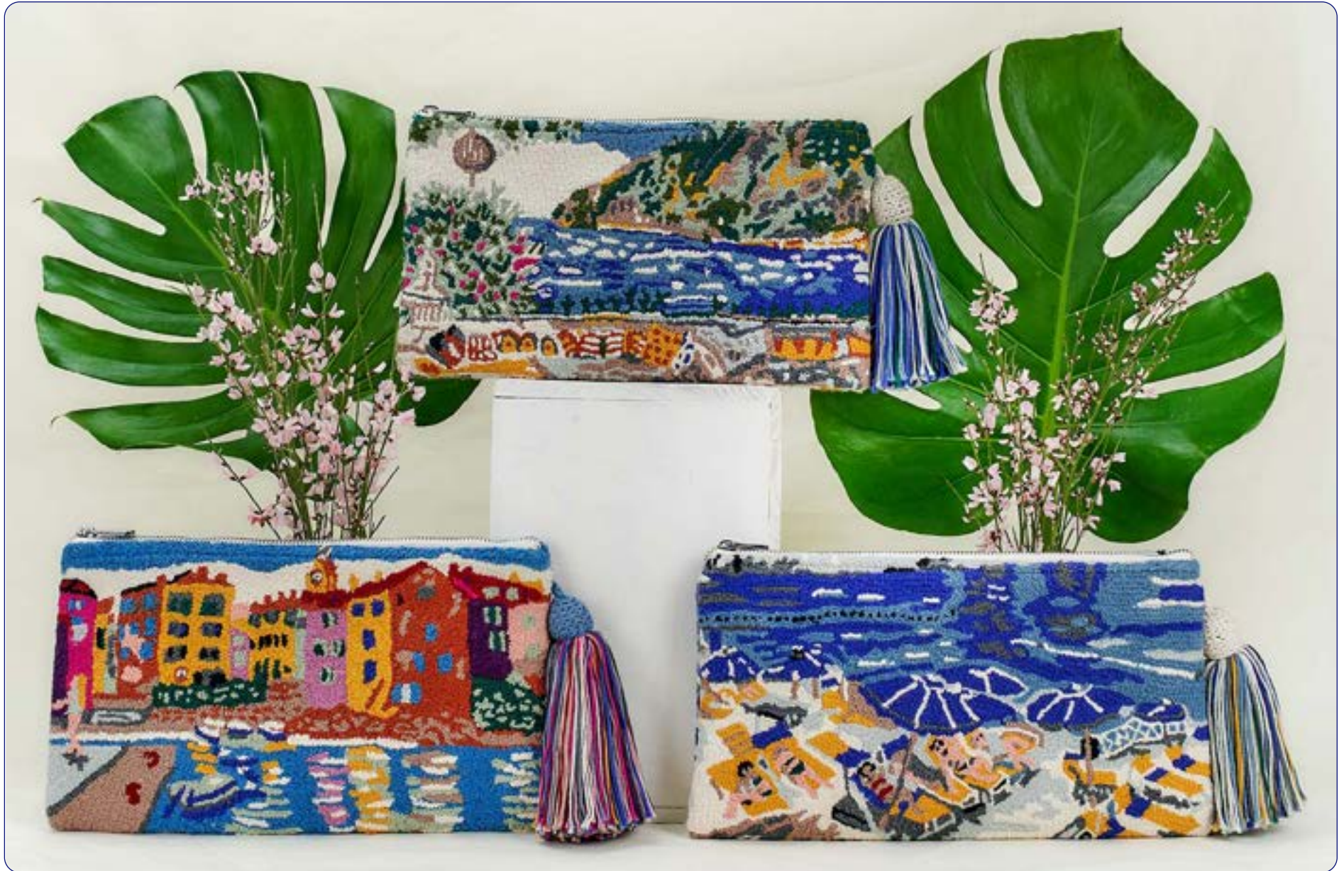
Zeffirelli Clutch M (top), St. Tropez Clutch M (bottom left) and Dolce Vita Clutch M (bottom right).