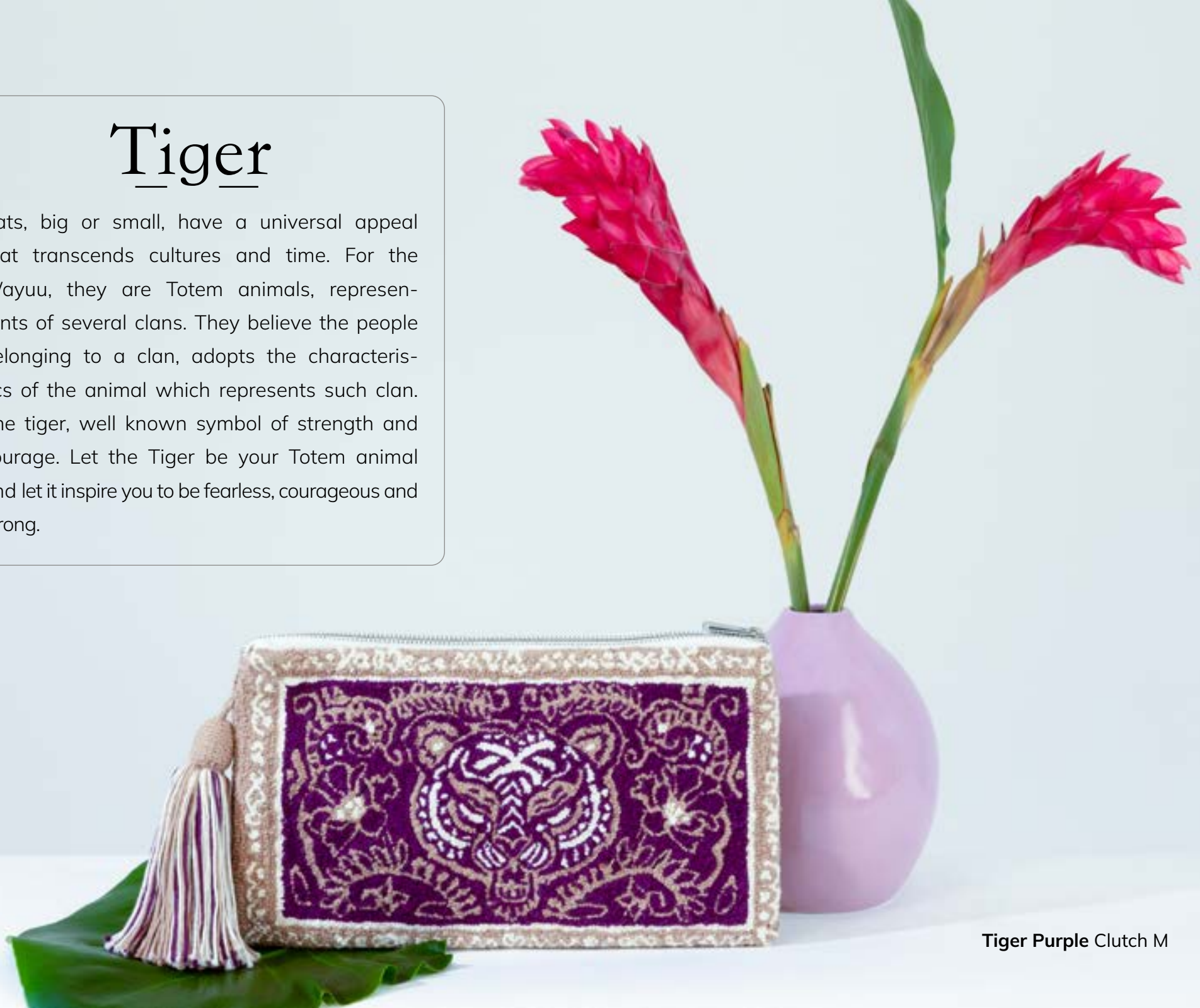
Tiger Purple Clutch M

Cats, big or small, have a universal appeal that transcends cultures and time. For the Wayuu, they are Totem animals, representatives of several clans. They believe the people belonging to a clan, adopts the characteristics of the animal which represents such clan. The tiger, well known symbol of strength and courage. Let the Tiger be your Totem animal and let it inspire you to be fearless, courageous and strong.