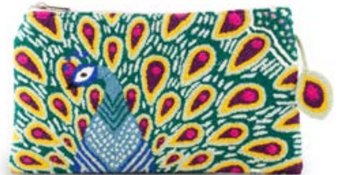
Peacock Green Clutch M