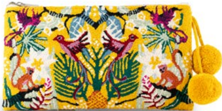
Paradise Yellow Clutch M