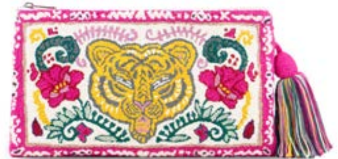
Tiger Wildflower Clutch M