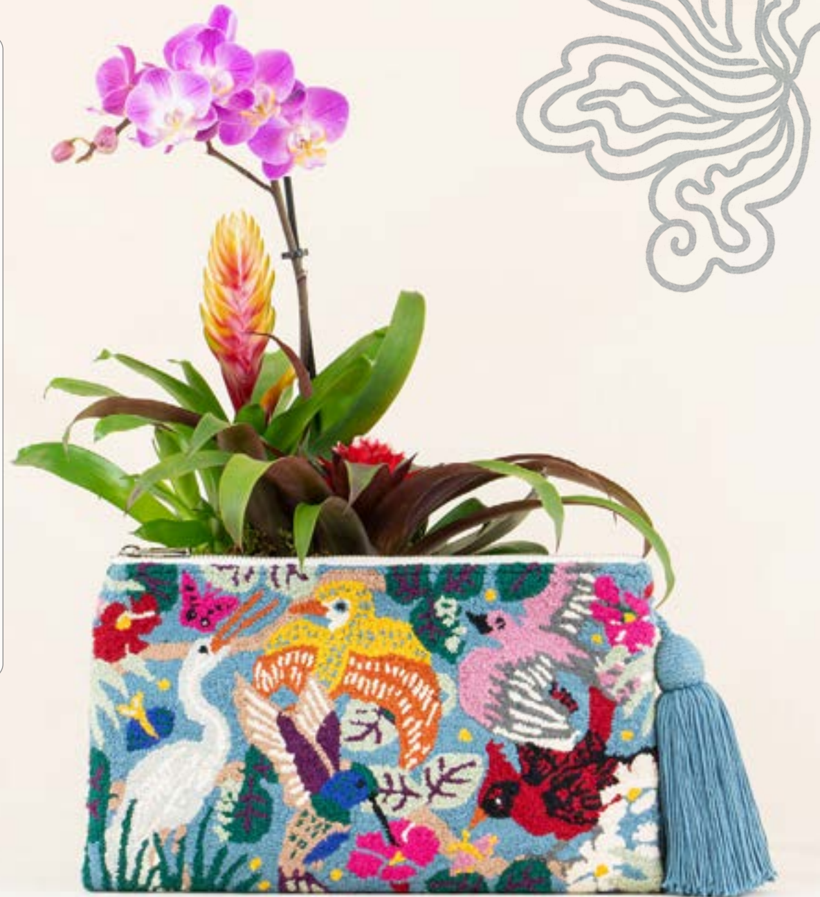
Birds Blue Clutch M

For more information, please visit www.mama-tierra.org/project/flamingo-project