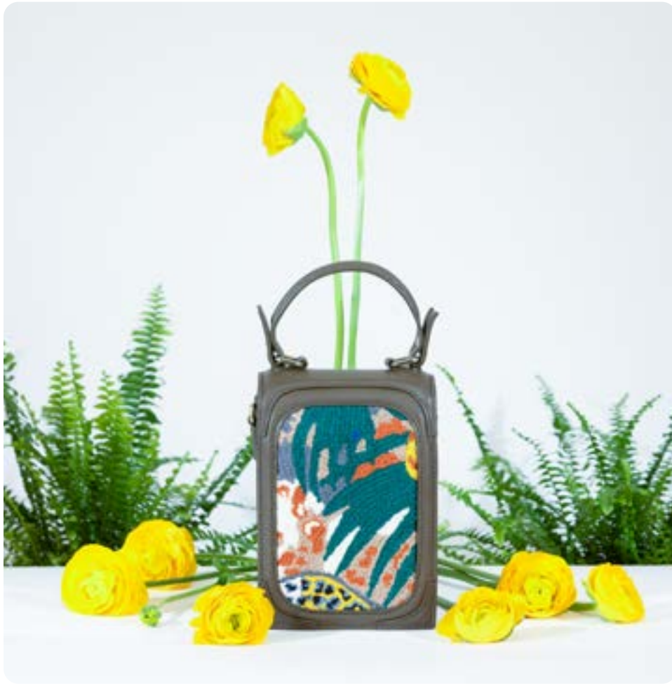
Niño Huellas – Warm Gray