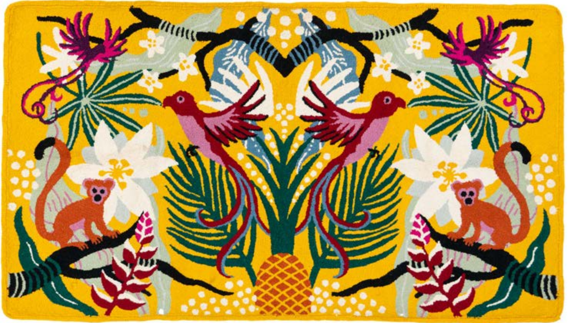
Paradise Yellow Tapestry

All our designs can be transformed into powerful wall tapestries. They come with several woven loops on the back to facilitate hanging it on the wall. For custom sizes and custom designs please contact Lourdes Grollimund at LGROLLIMUND@mama-tierra.org