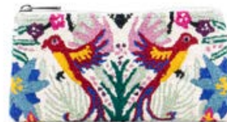
Paradise Wildflower Pouch XS