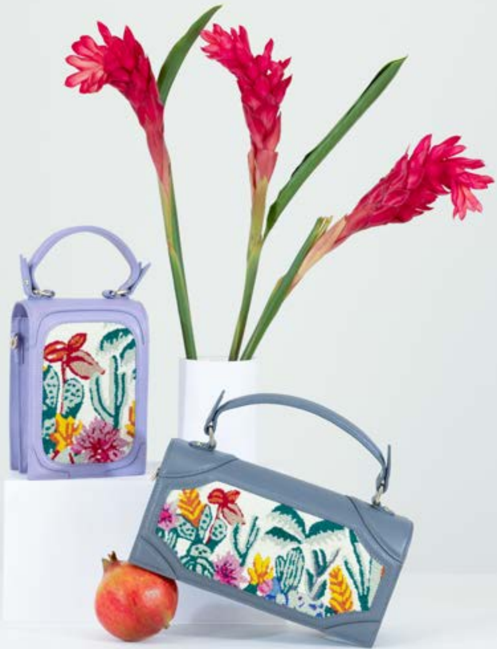
Niño Guajira – Lilac Madre Guajira – Cool Gray