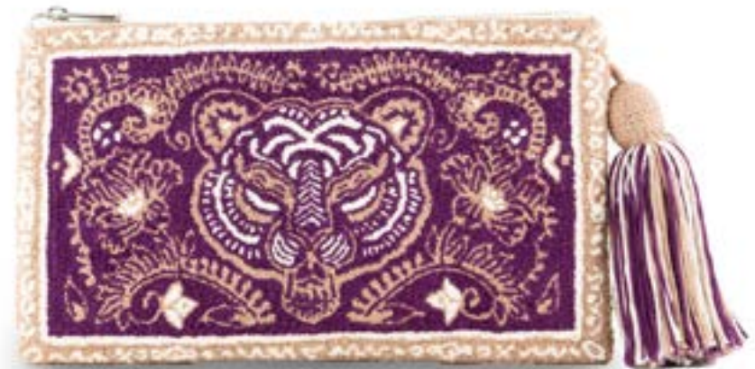
Tiger Purple Clutch M