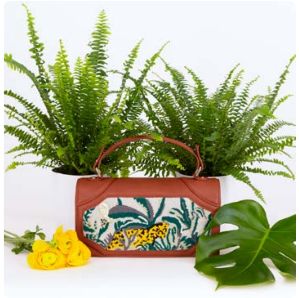
Madre Jungle - Brown