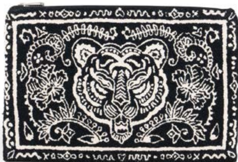
Tiger Black Clutch XL

All color combinations available in sizes XS and bigger, for more information contact us.