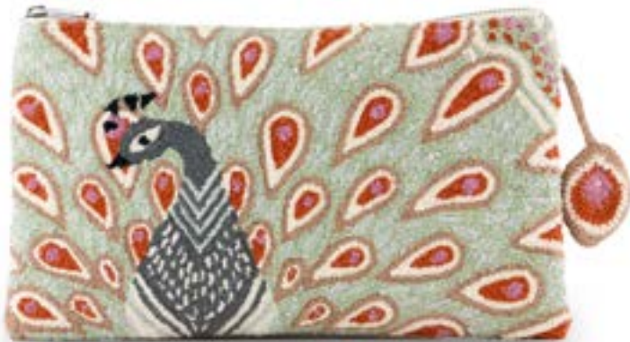
Peacock Natural Clutch M

Available in sizes XS and bigger, for more information contact us.