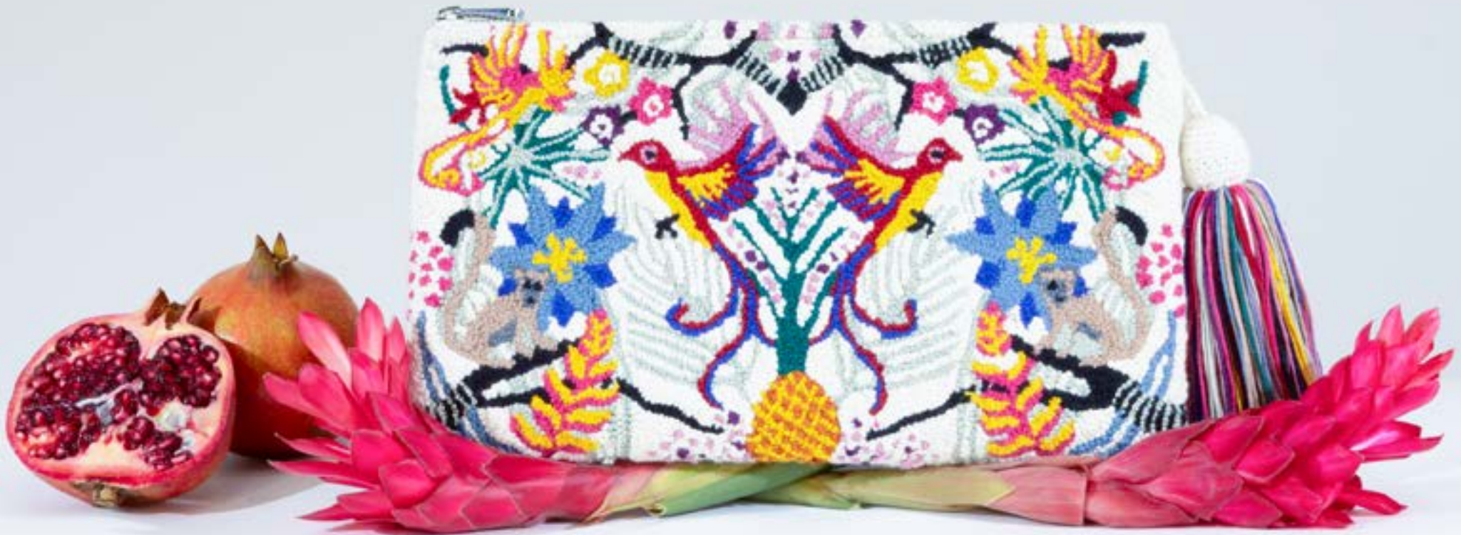
Paradise Wildflower Clutch M

This design is inspired by the wild nature of the Amazon with its bright colors, exotic flora and diverse fauna. The prominent macaws are a symbol of joy of life and optimism. The monkeys represent high energy, good humour, intelligence and fun. Let this design inspire you to live life to the full!