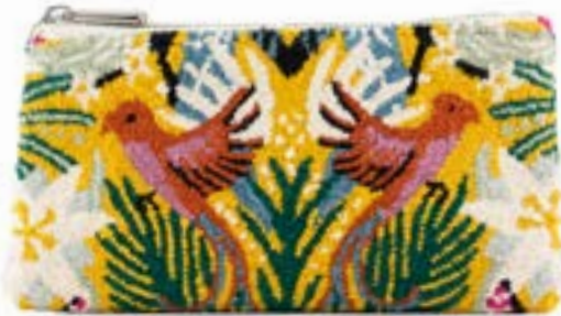
Paradise Yellow Pouch XS