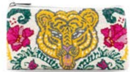
Tiger Wildflower Pouch XS