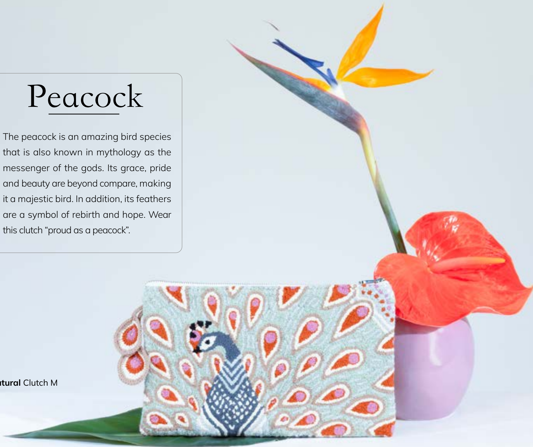
Peacock Natural Clutch M

The peacock is an amazing bird species that is also known in mythology as the messenger of the gods. Its grace, pride and beauty are beyond compare, making it a majestic bird. In addition, its feathers are a symbol of rebirth and hope. Wear this clutch “proud as a peacock”.