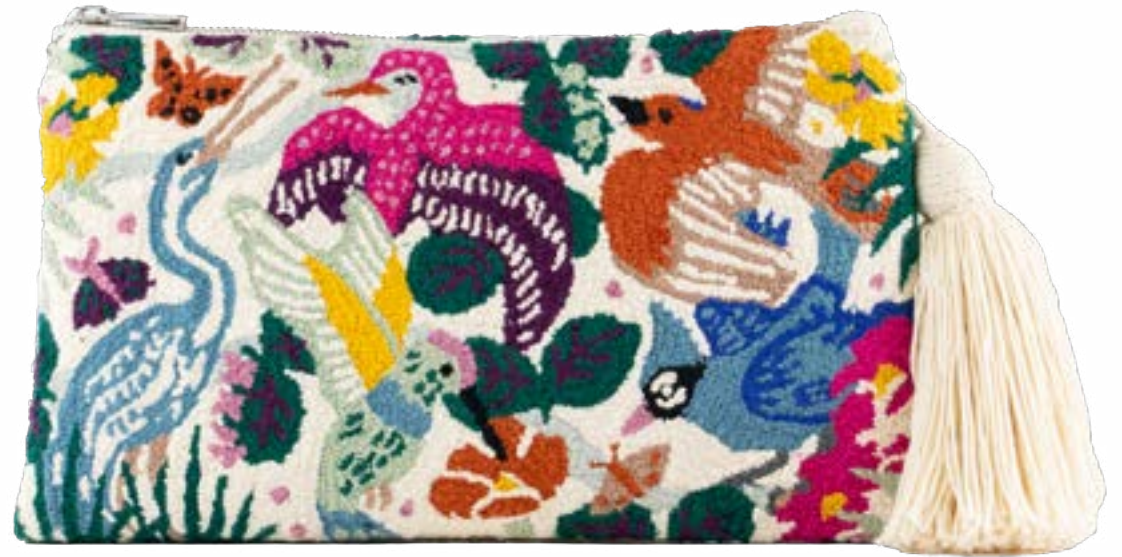
Birds Wildflower Clutch M

Available in sizes M and bigger, contact us for more information.