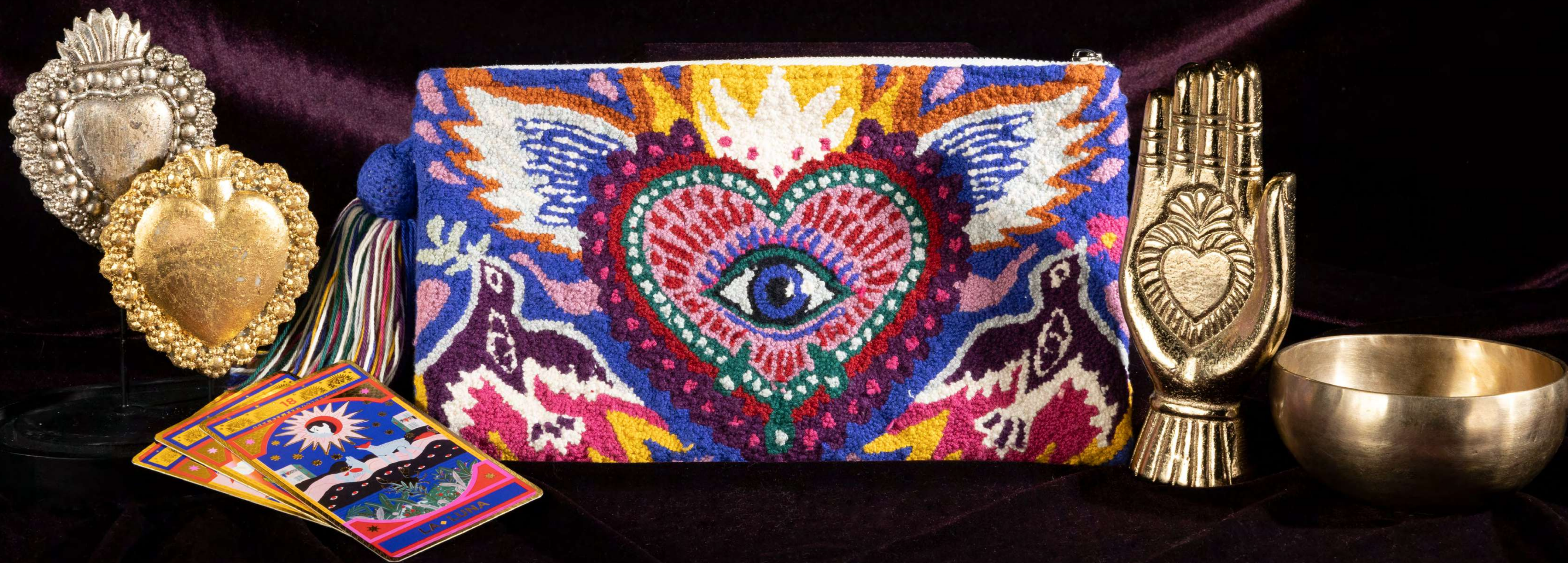
Burning Heart Blue Clutch M