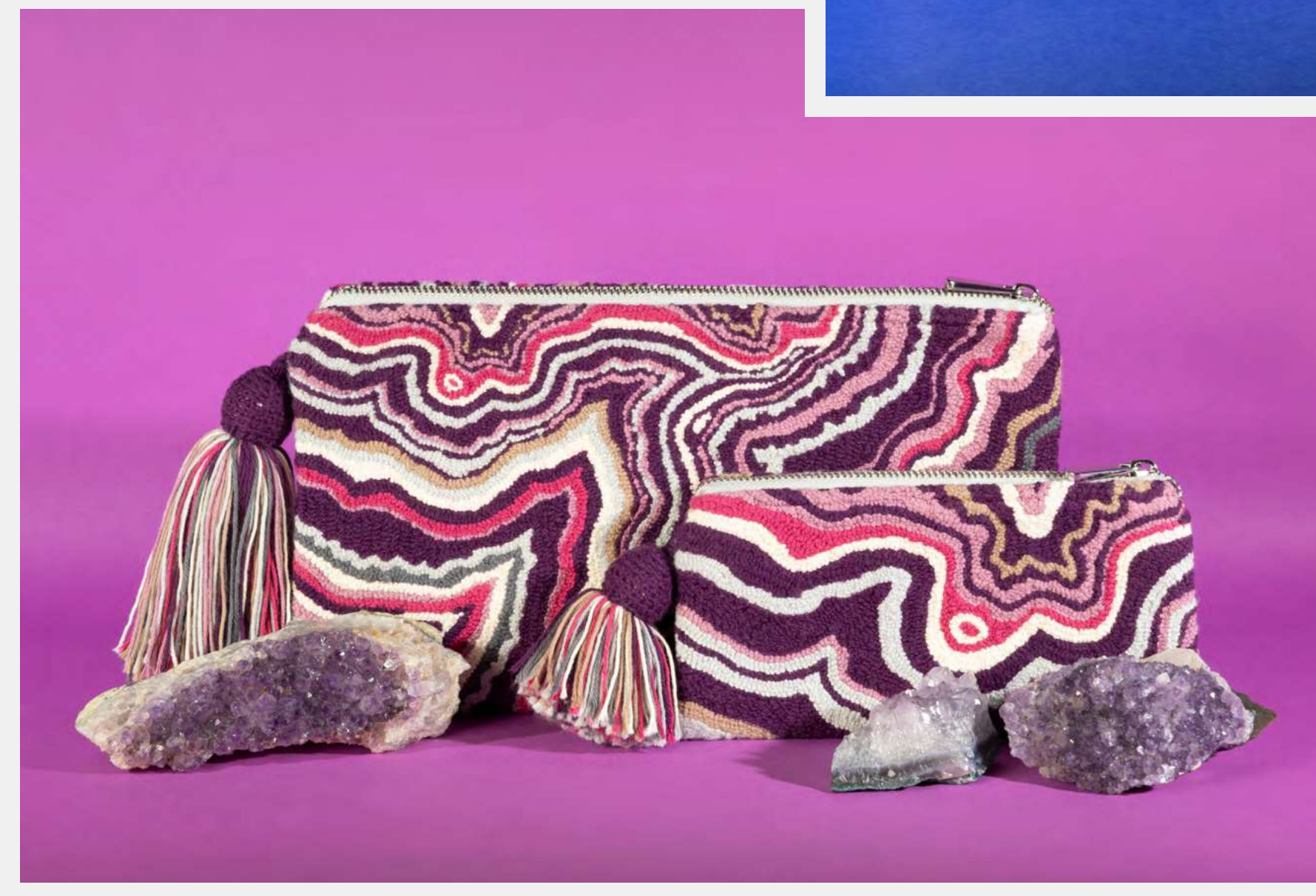
Earth Purple Clutch M and Pouch XS