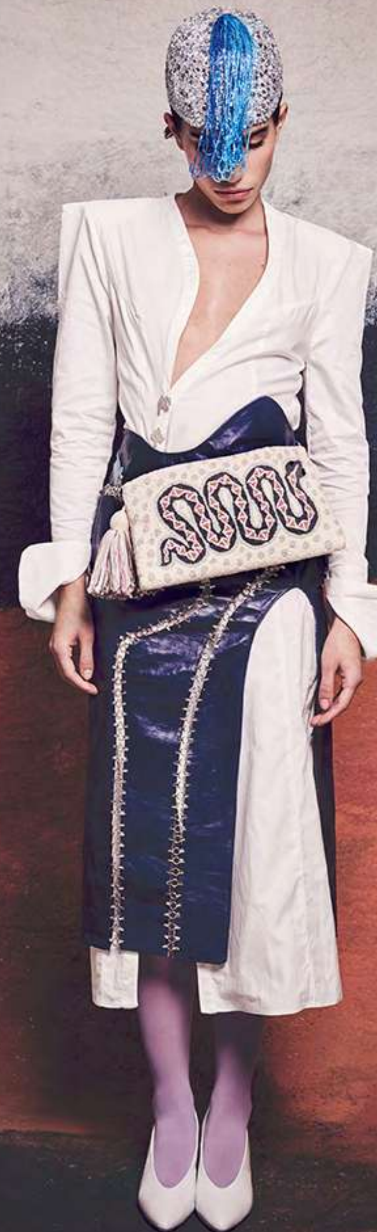
Maa'ala Natural Clutch M