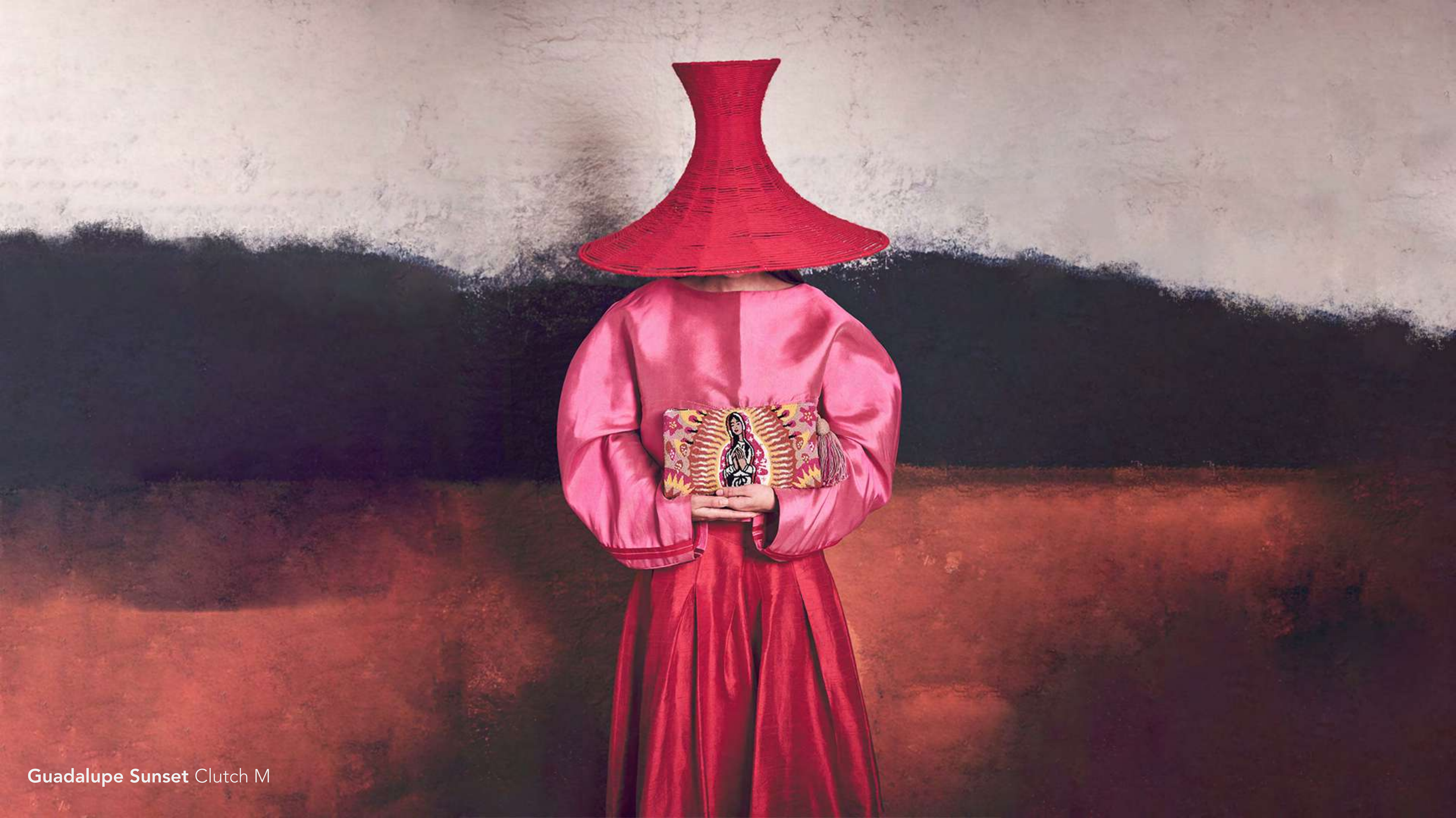
Guadalupe Sunset Clutch M