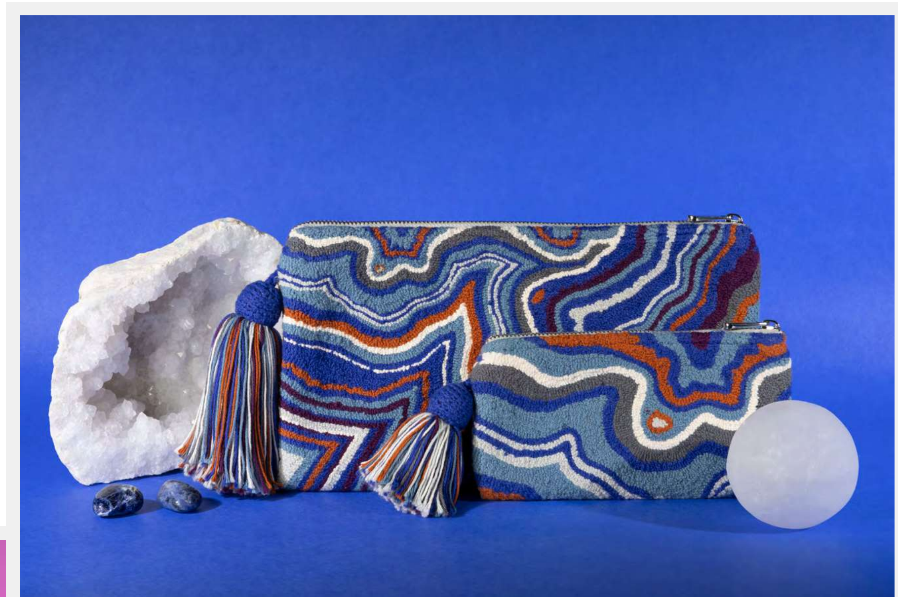
Earth Blue Clutch M and Pouch XS