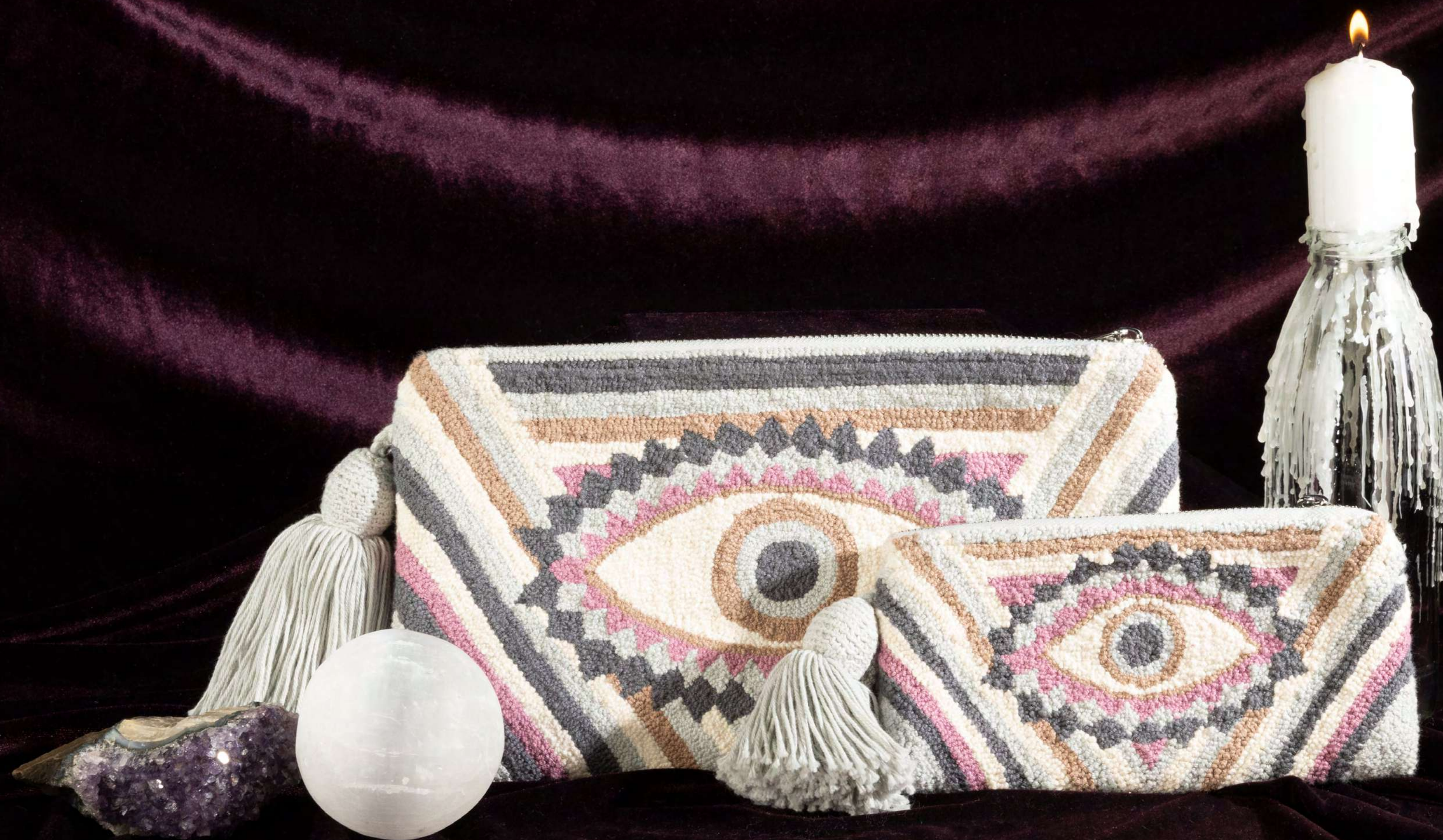
Evil Eye Natural Clutch M and Pouch XS