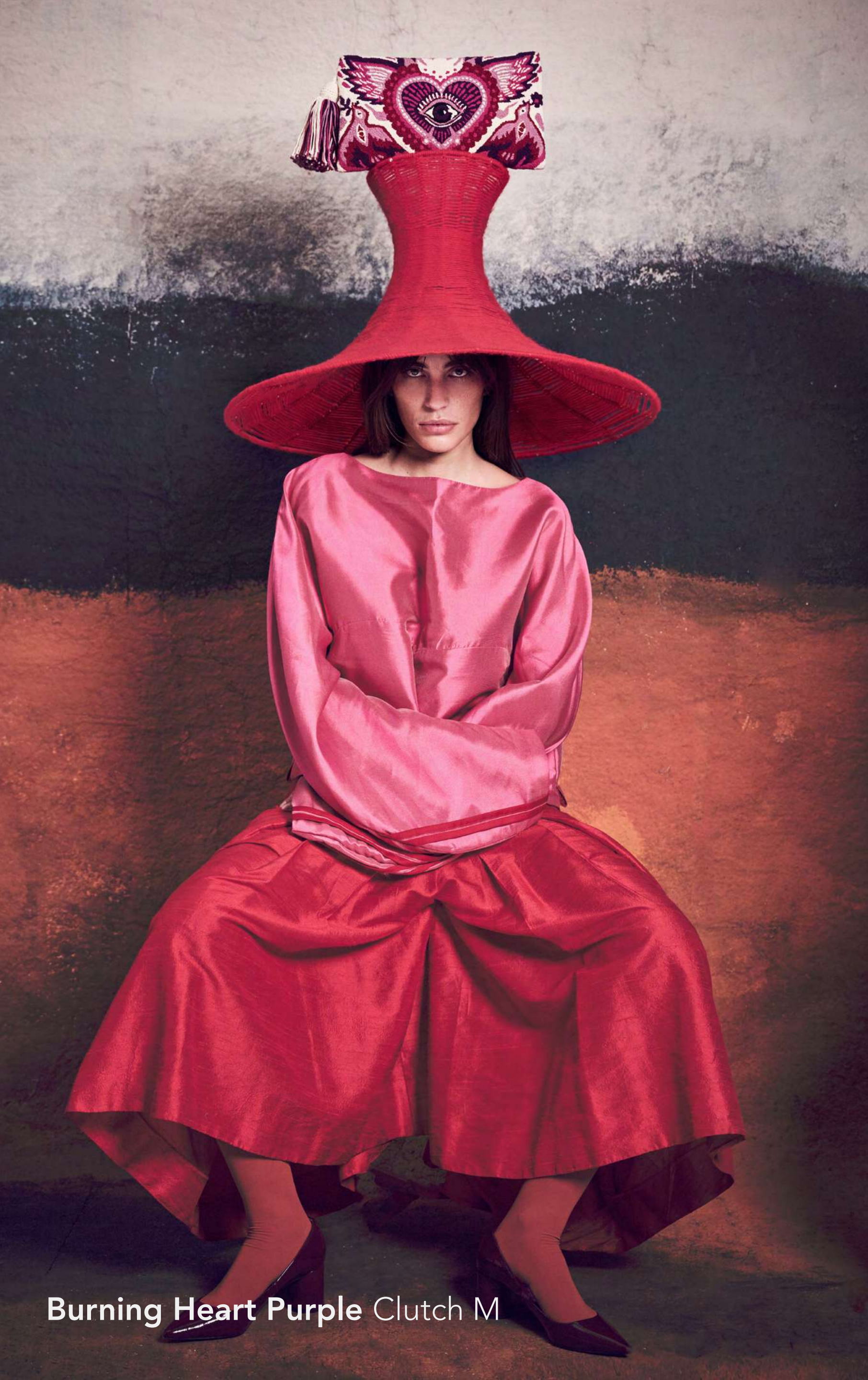
Burning Heart Purple Clutch M