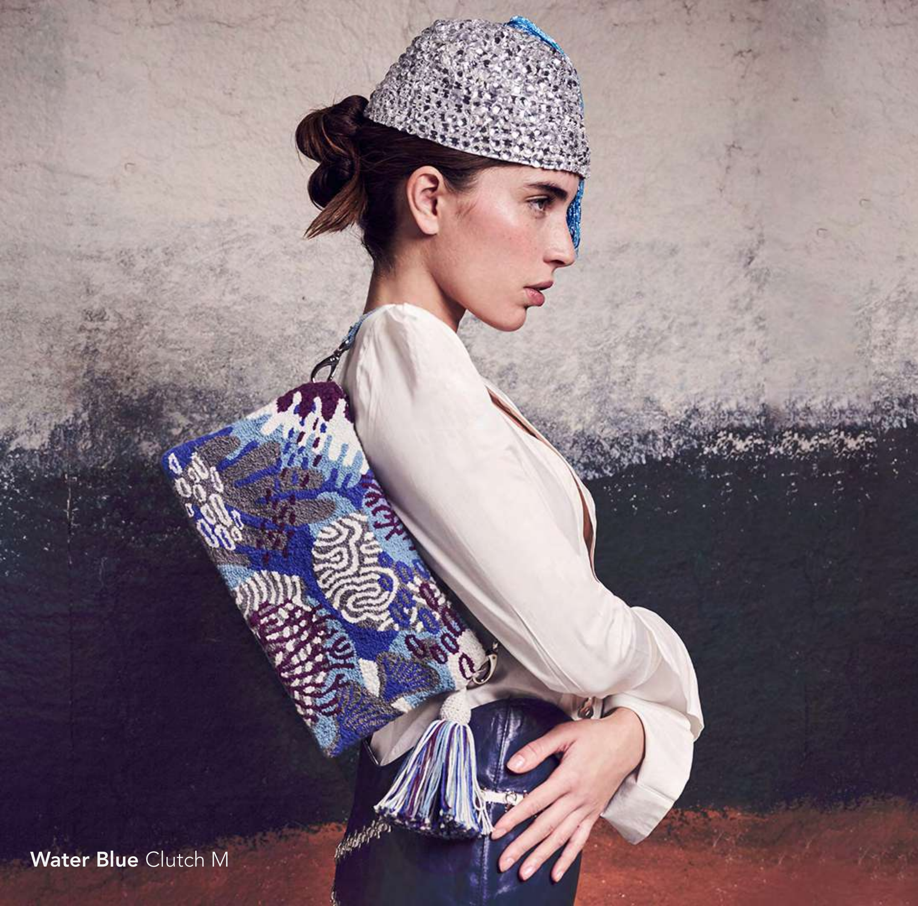
Water Blue Clutch M