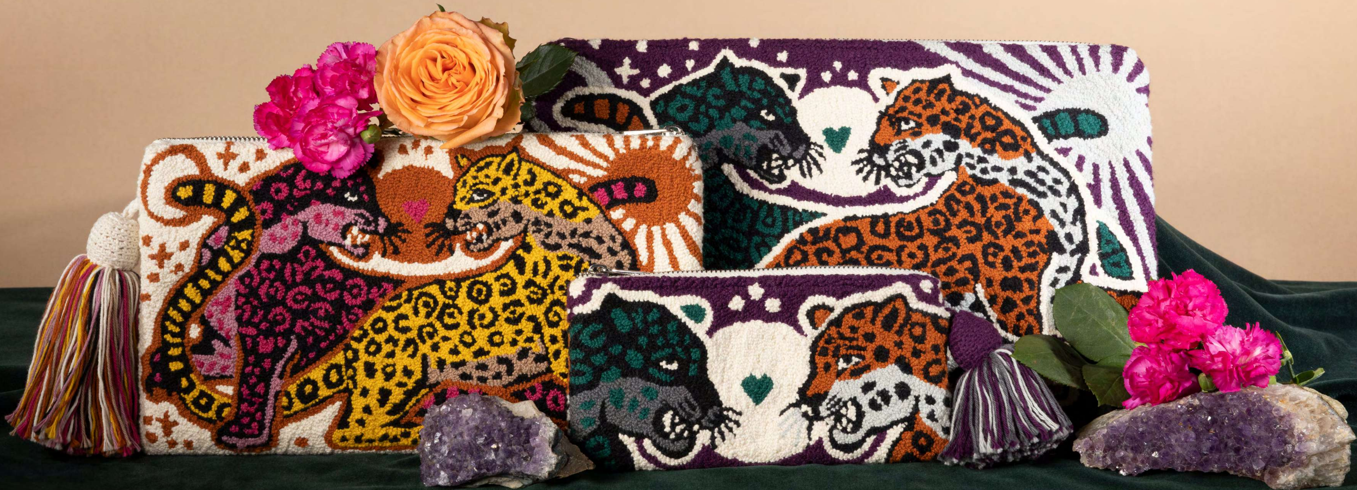
Fierce Strong Clutch XL and Pouch XS