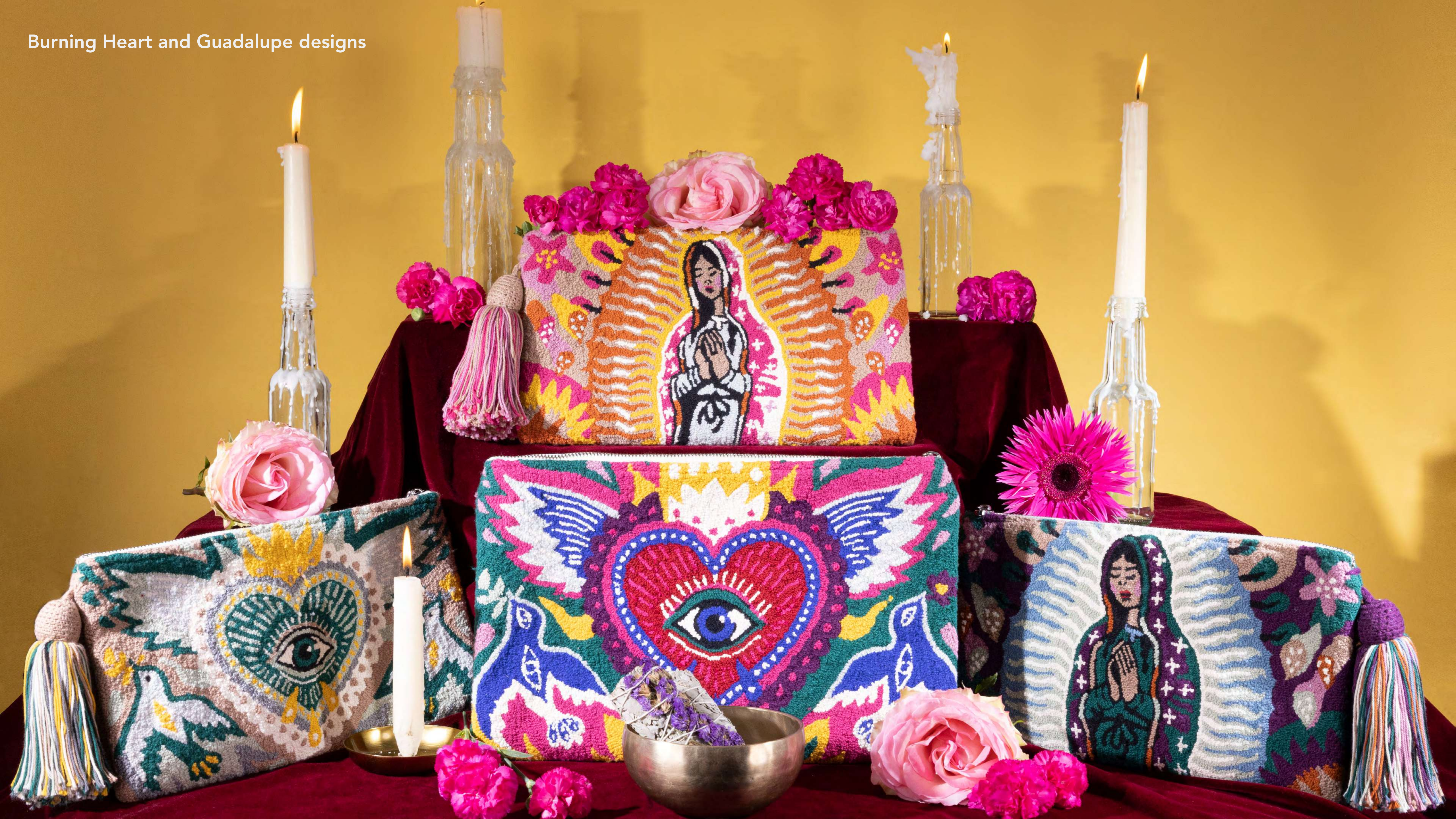
Burning Heart and Guadalupe designs