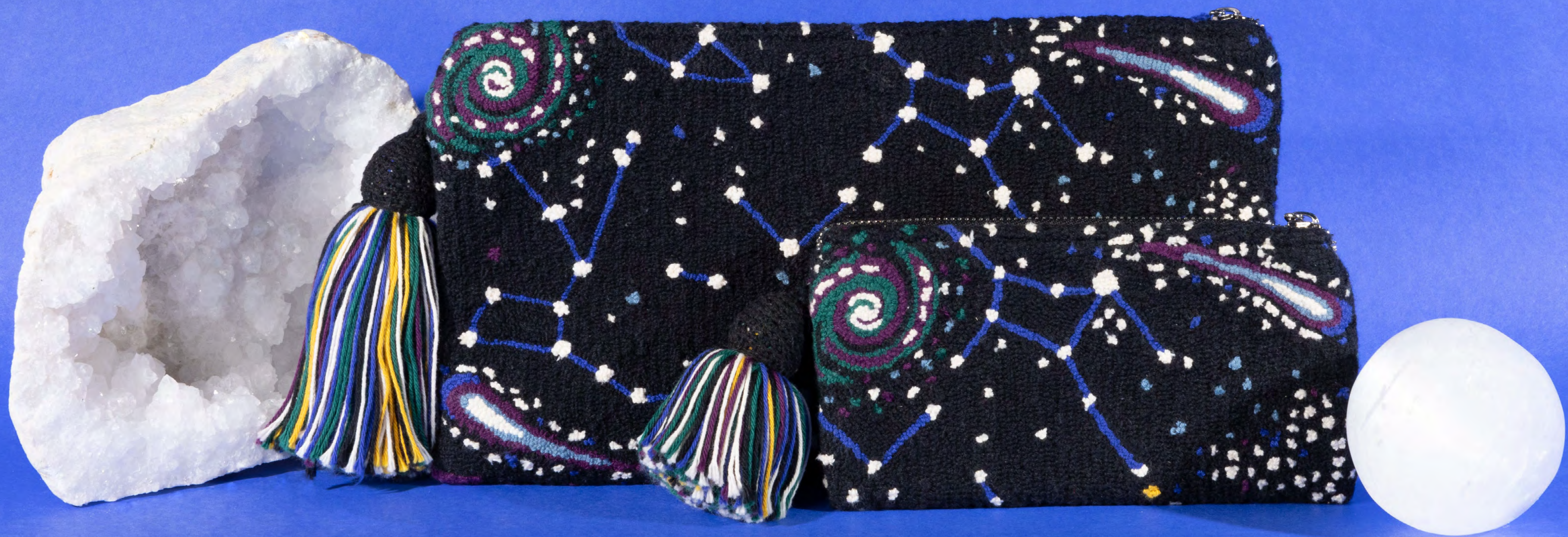
Stars Clutch M and Pouch XS