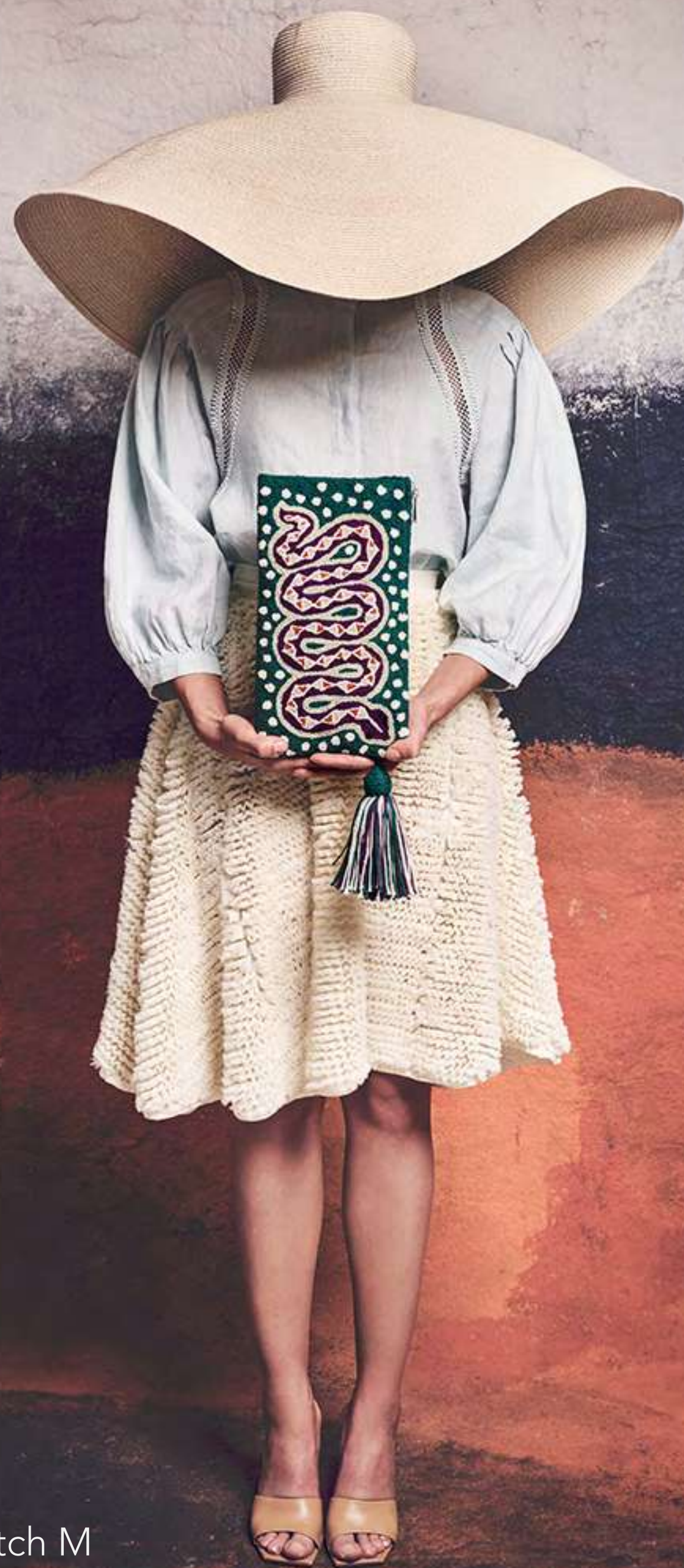
Maa'ala Green Clutch M