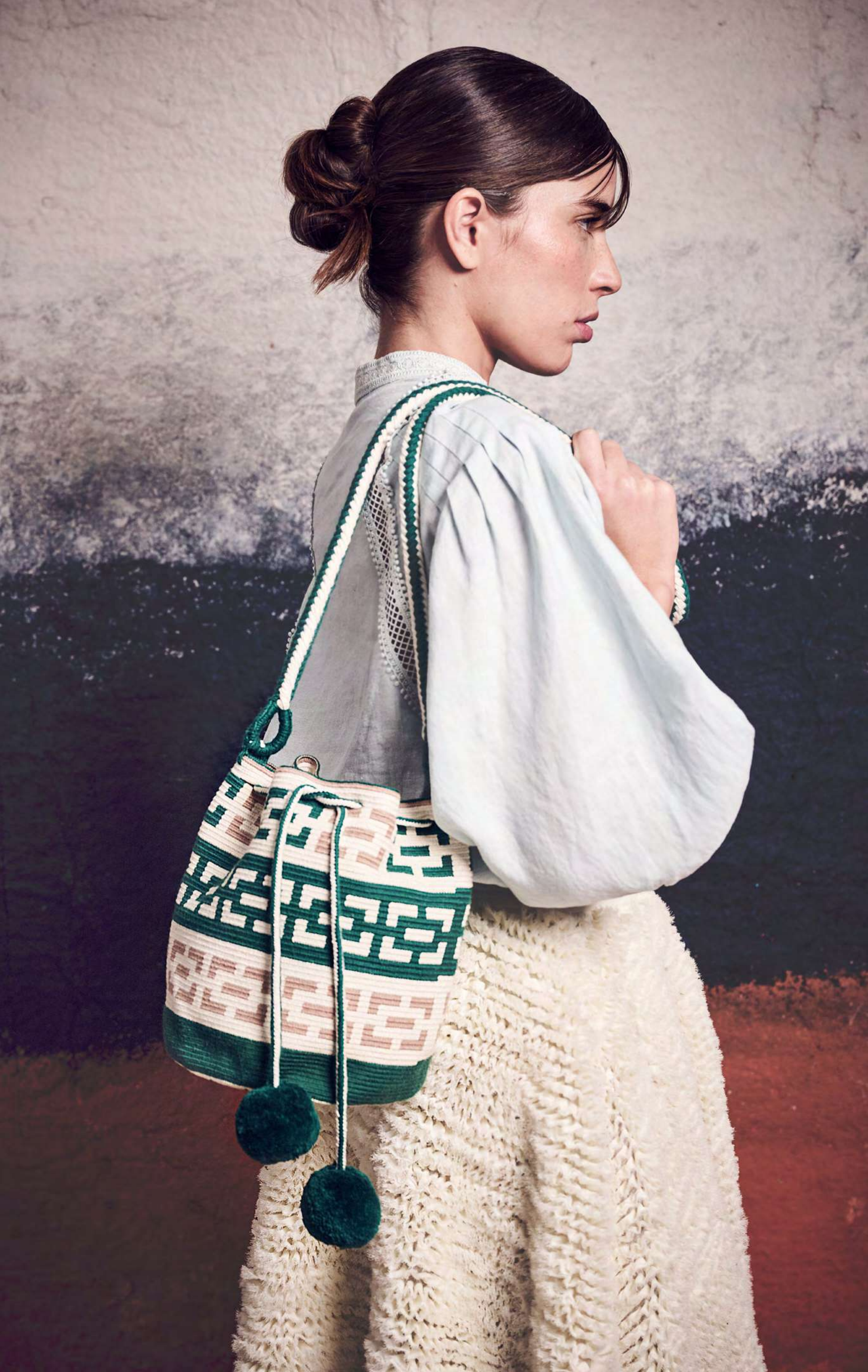
Bella Green Bucket Bag M