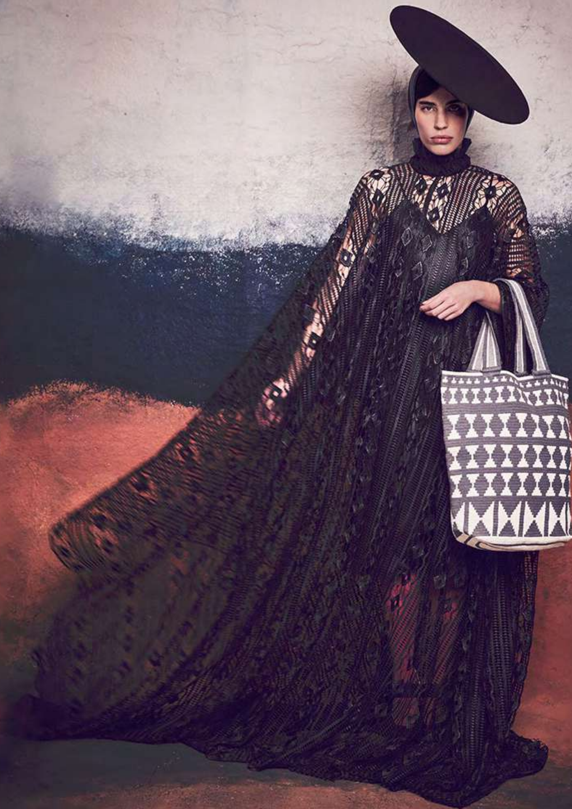
Bowties Gray Tote Light