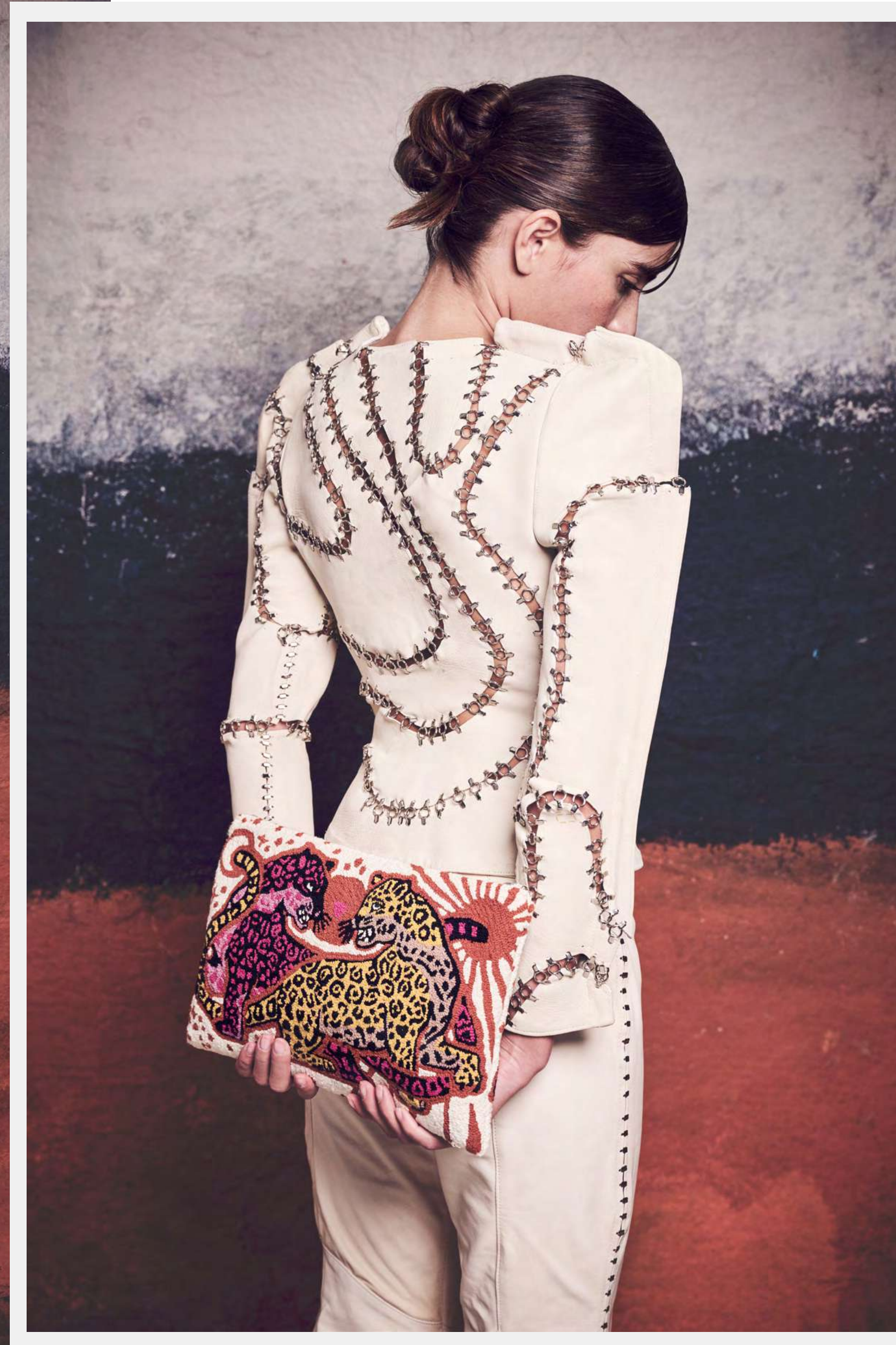
Fierce Sunset Clutch XL