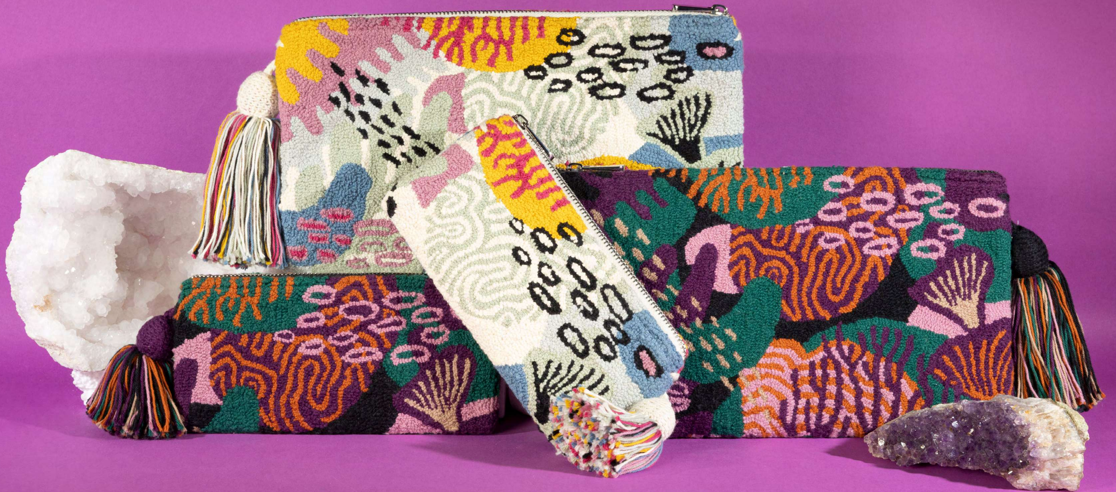
Water Wildflower and Water Strong Clutches M and Pouches XS