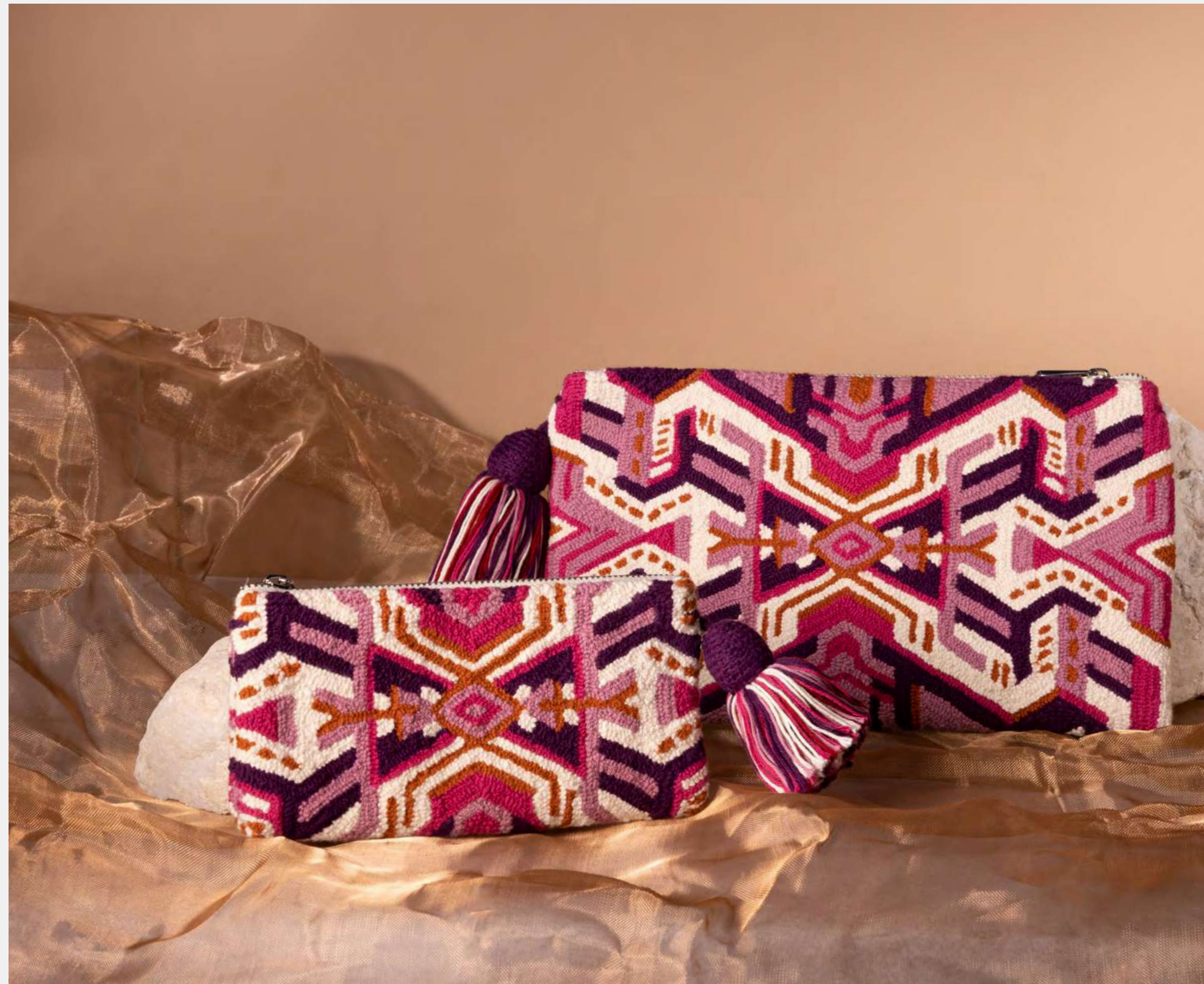
Abstract Purple Clutch M and Pouch XS