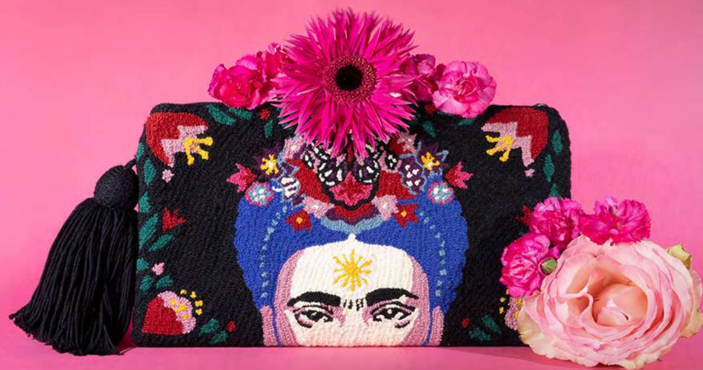
Viva Night Clutch M