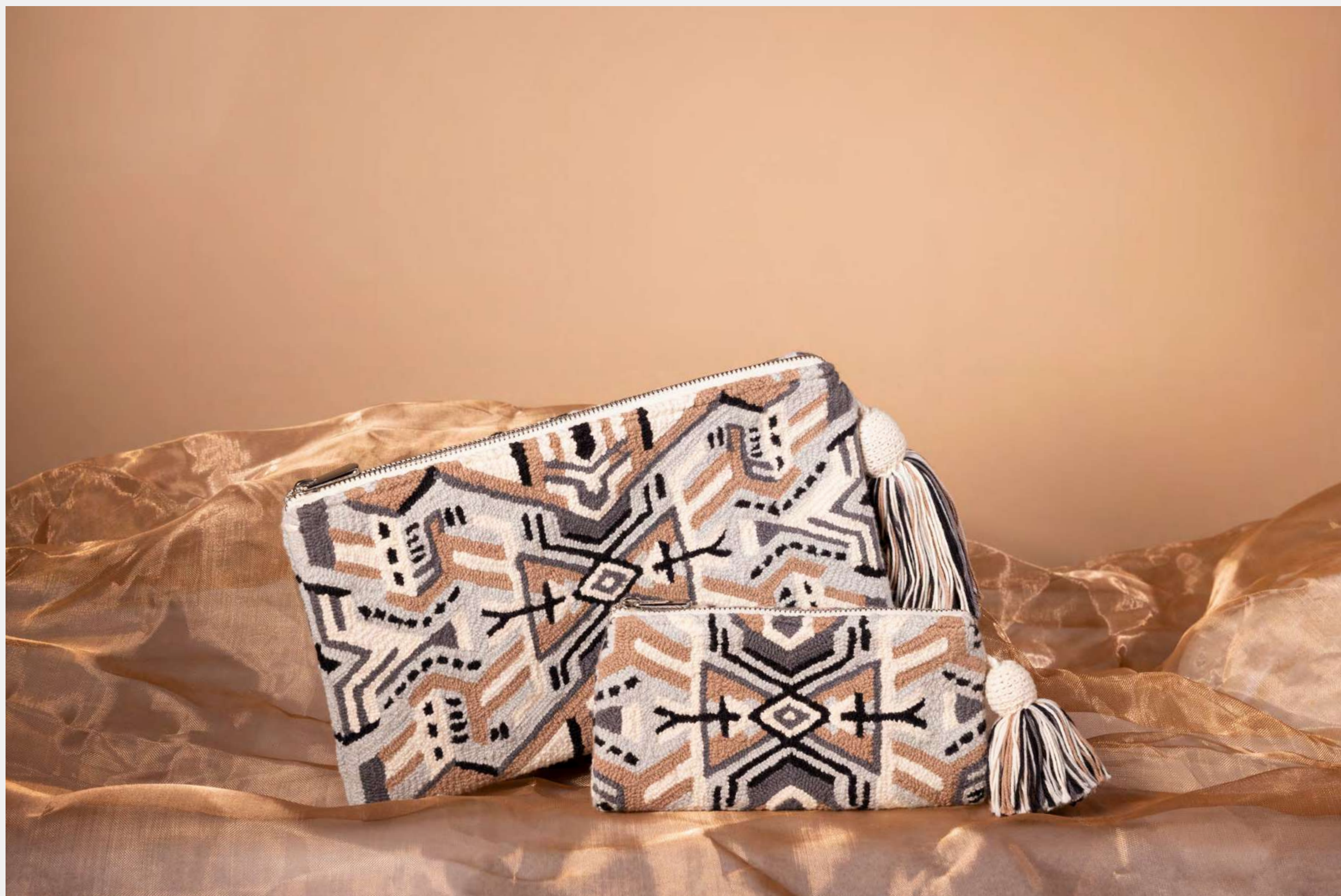
Abstract Natural Clutch M and Pouch XS