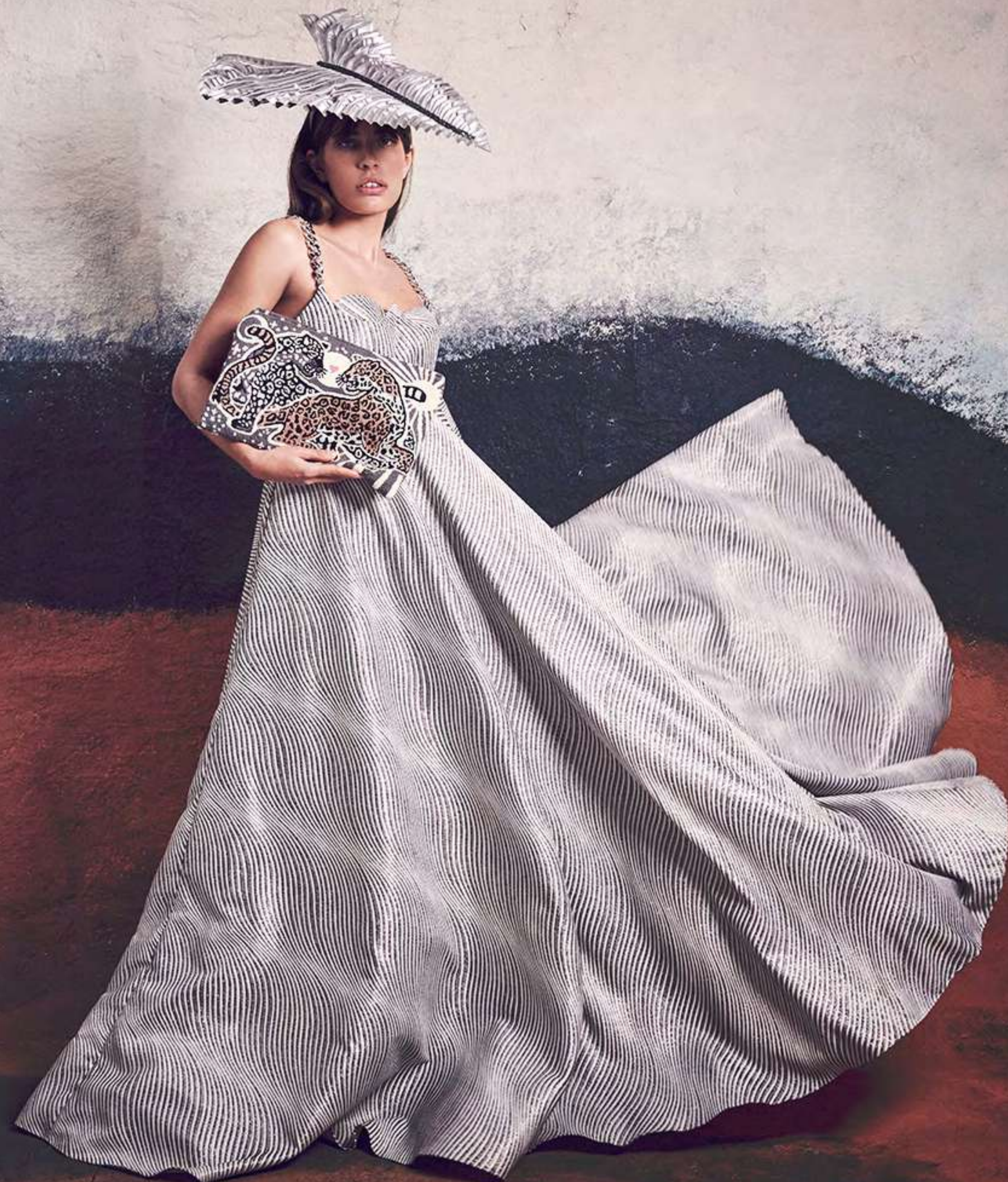
Fierce Natural Clutch XL