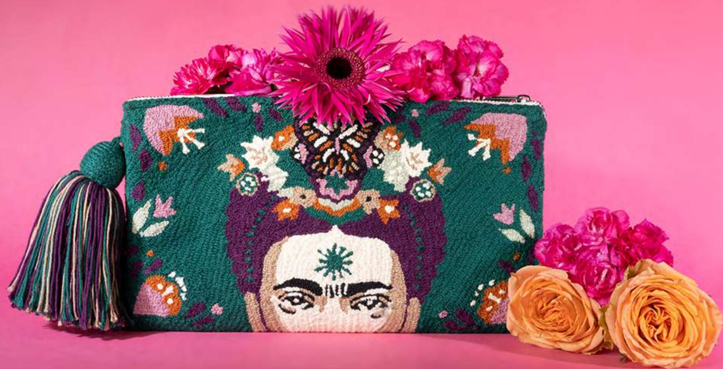
Viva Green Clutch M