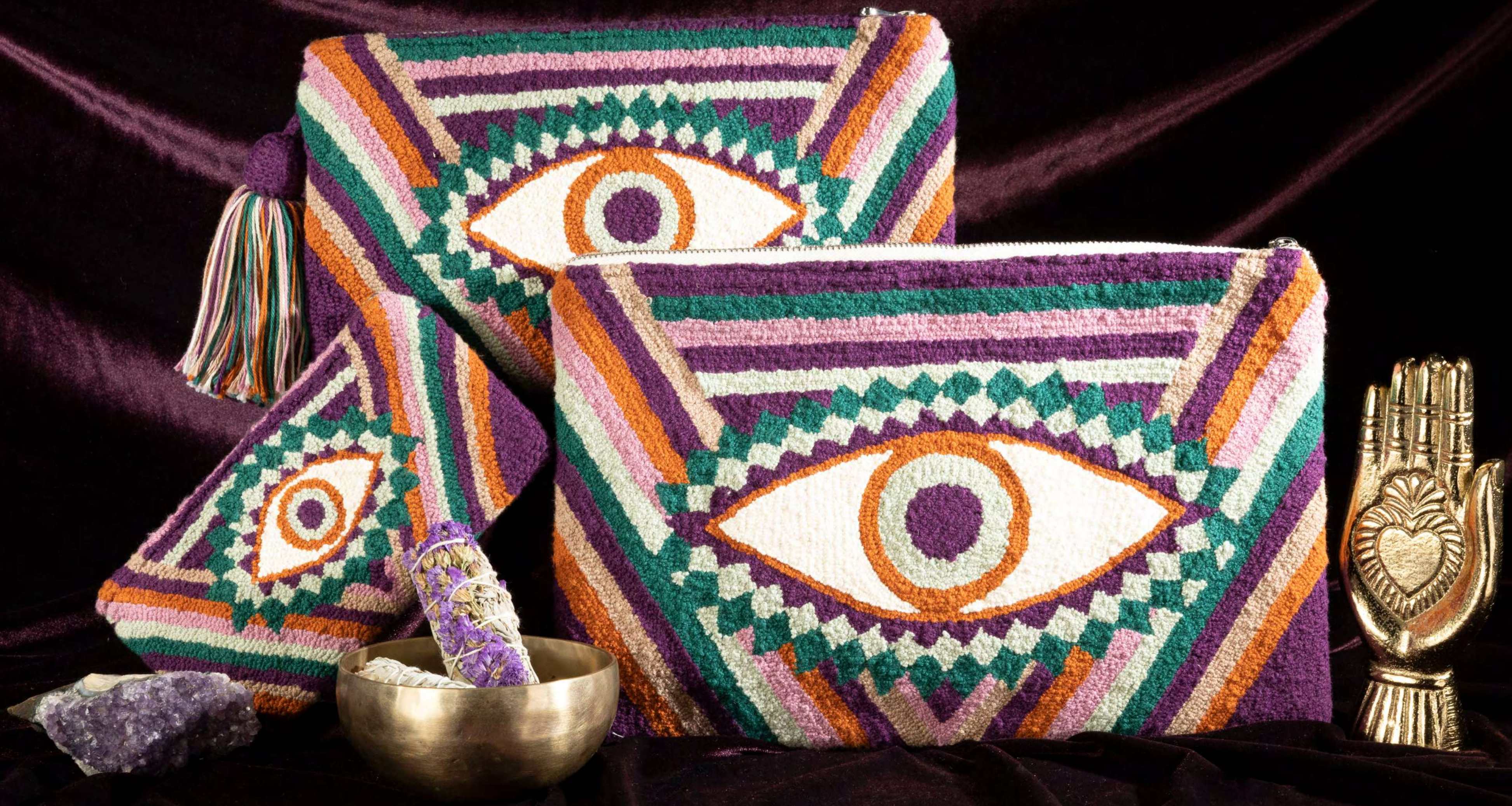
Evil Eye Strong Clutch XL, Clutch M and Pouch XS