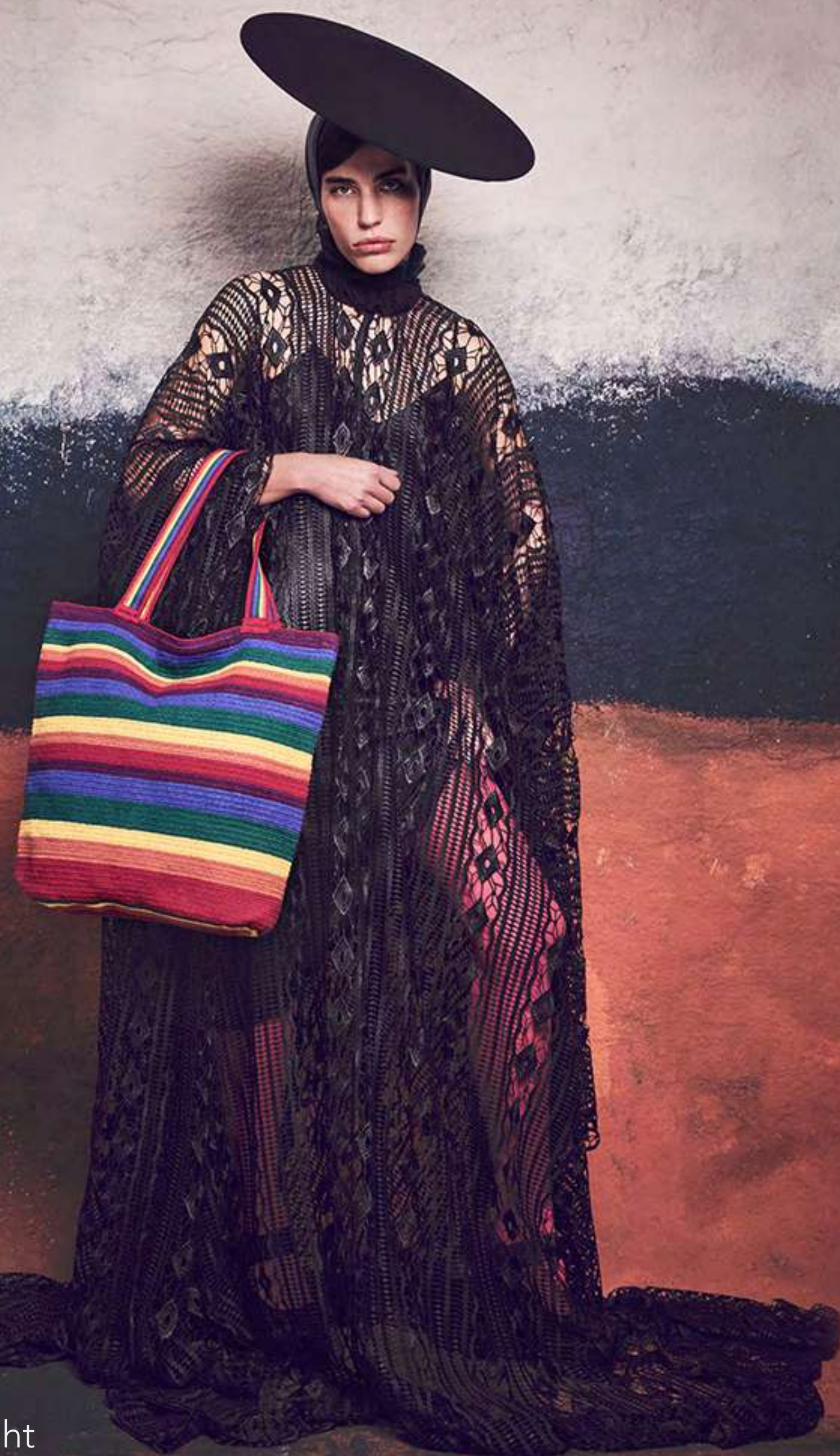
Rainbow Tote Light