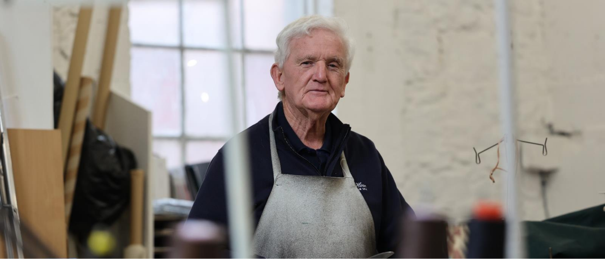
Ireland's Last Glove-Cutter