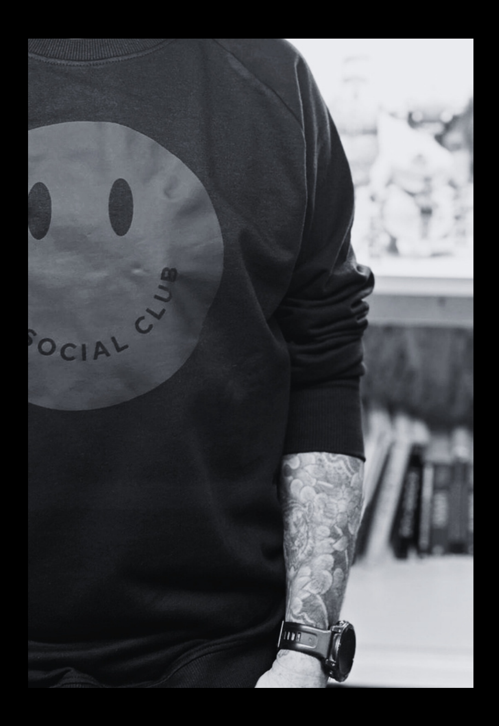
UNISEX BLACK ON BLACK SWEATSHIRT ALSO AVAILABLE IN BLACK & GOLD