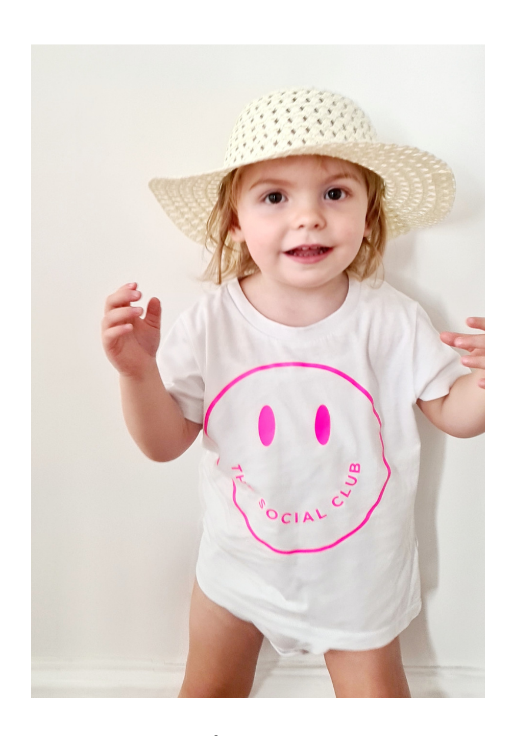
WHITE & NEON PINK T-SHIRT