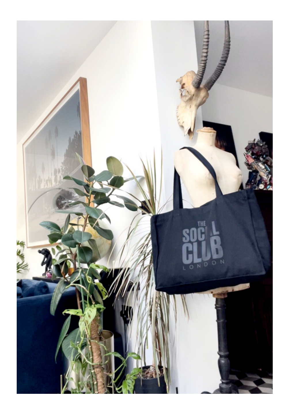
TSC LONDON BLACK SHOPPER ALSO AVAILABLE WITH HAPPY FACE