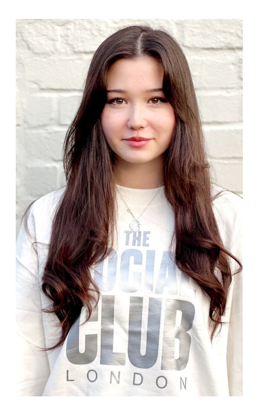
TSC LONDON BOXY SWEATSHIRT ALSO AVAILABLE IN BLACK ON BLACK