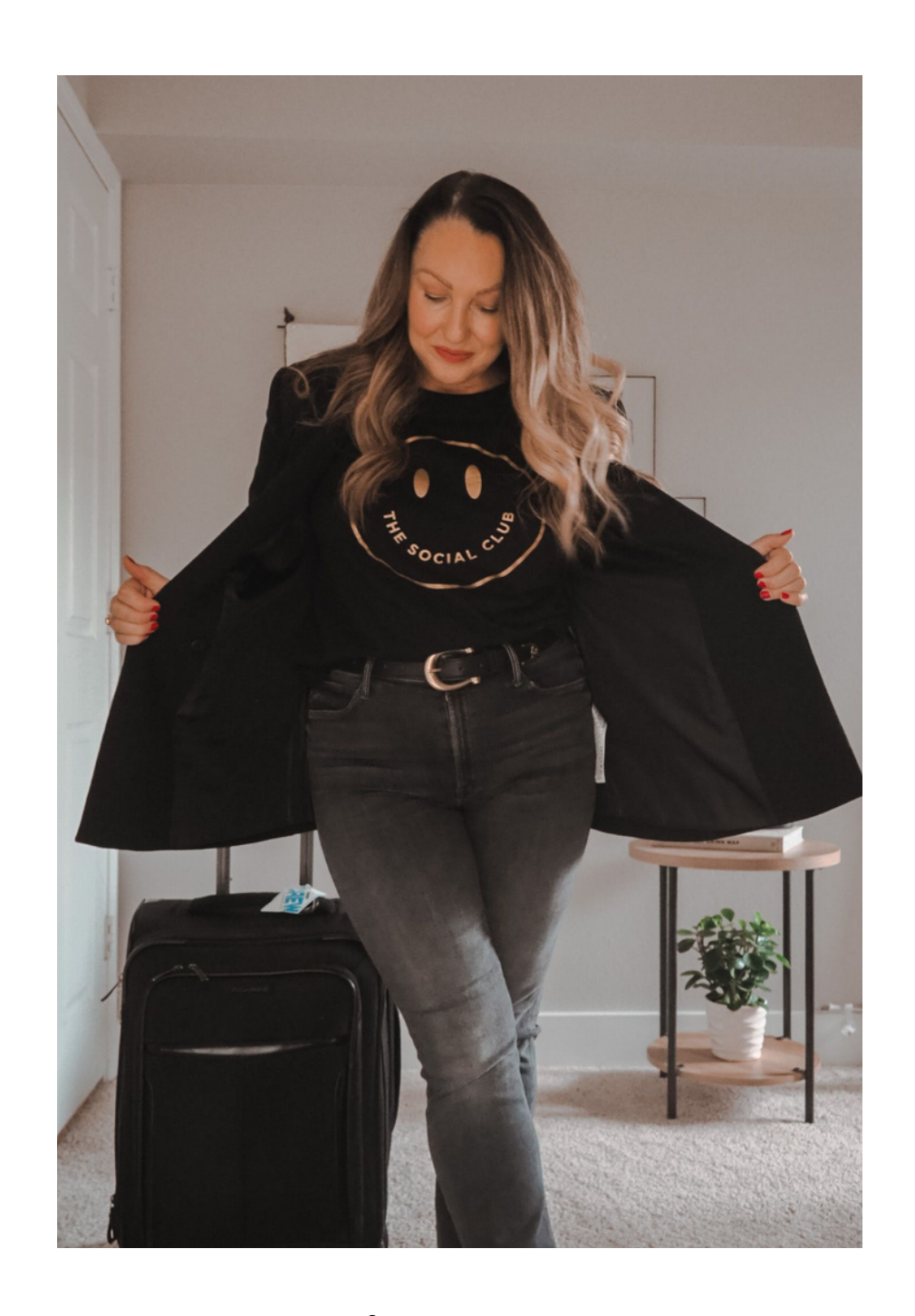
BOXY BLACK & KEYLINE GOLD SWEATSHIRT