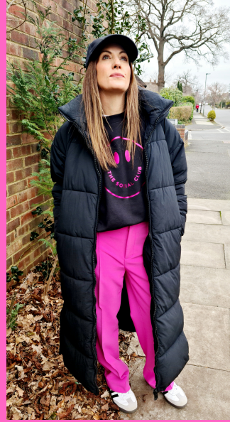
BLACK & PINK