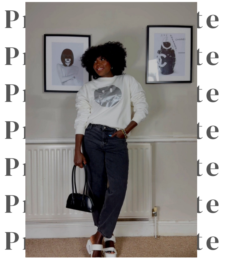
Pretty in white & SILVER