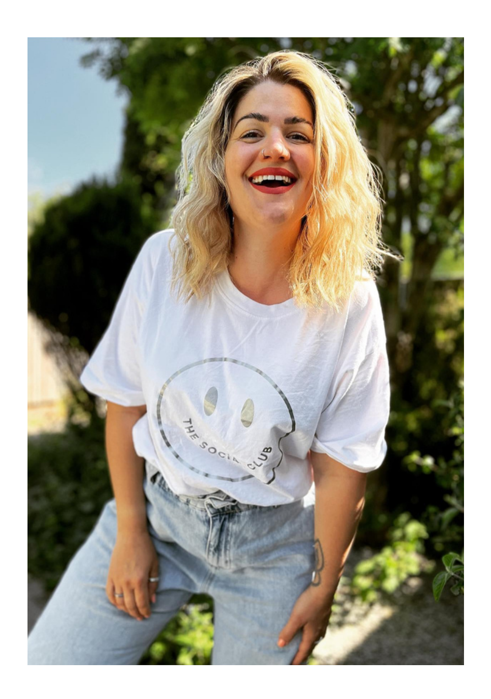
BOXY WHITE & SILVER T-SHIRT ALSO AVAILABLE IN GOLD