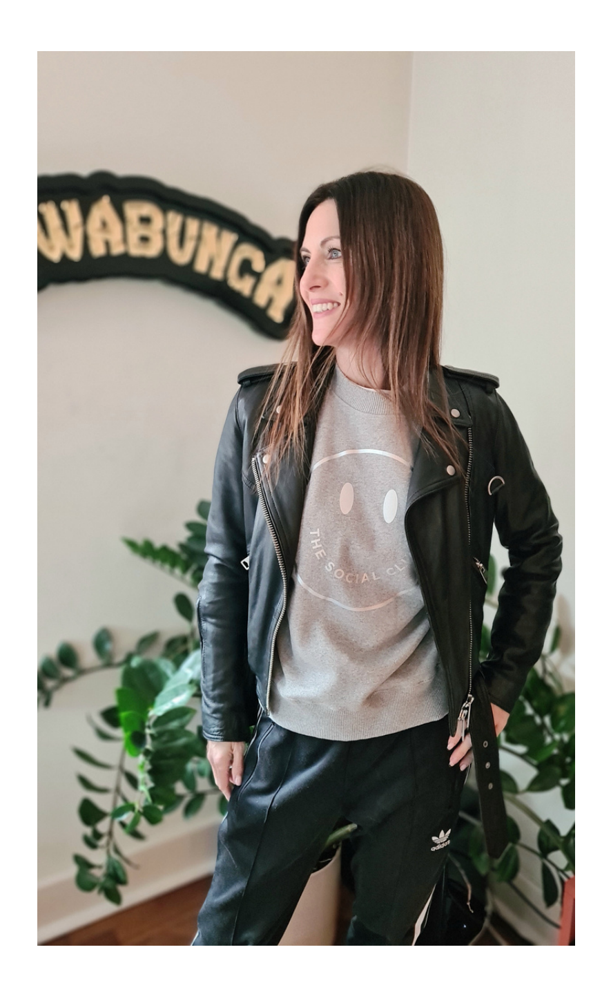
super soft, versatile & 100% organic