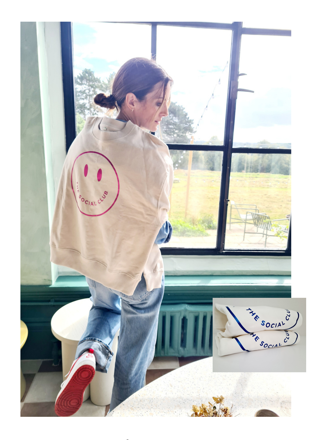
MISTY WHITE & METALLIC PINK SWEATSHIRT ALSO AVAILABLE IN METALLIC BLUE