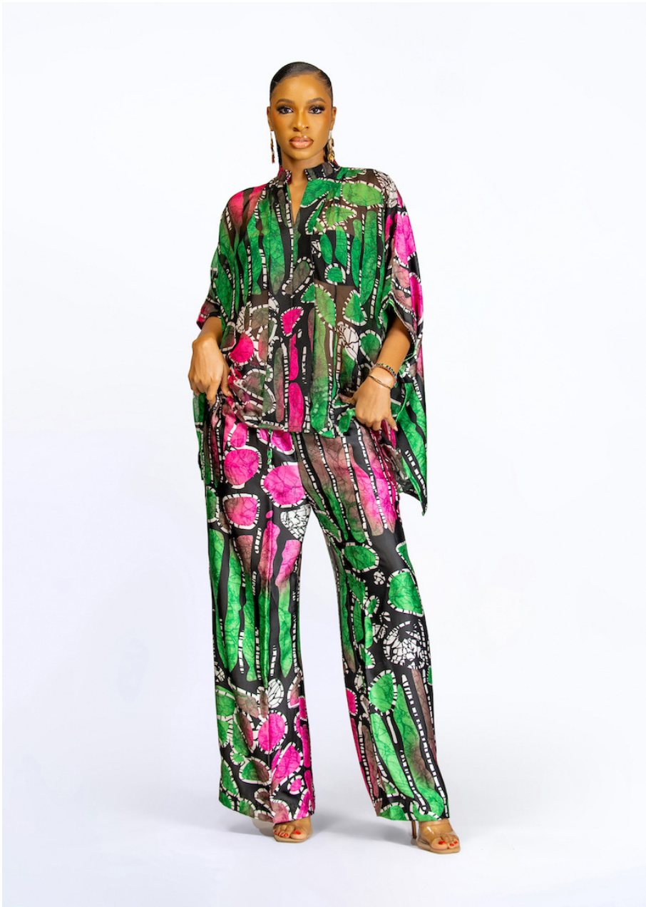
Imani Pant Set