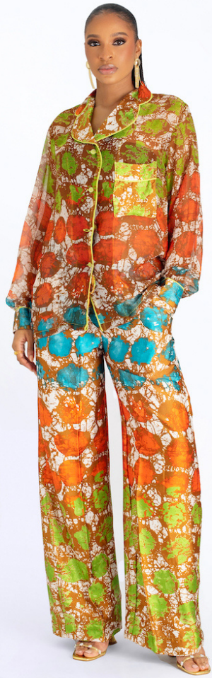
Nkem Pant Set