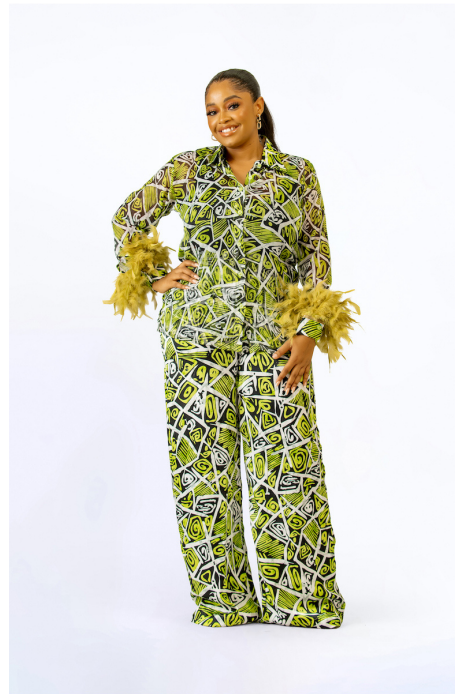
Alba 2.0 Pant Set