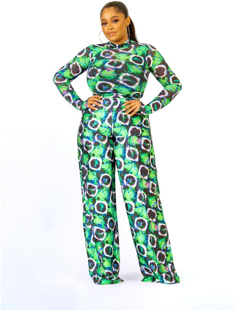
Lima Pant Set