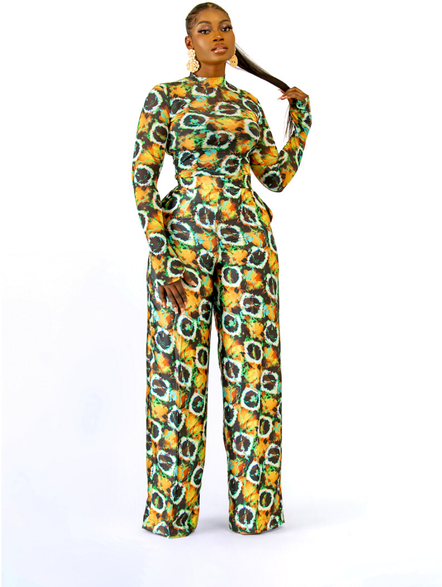
Lima Pant Set